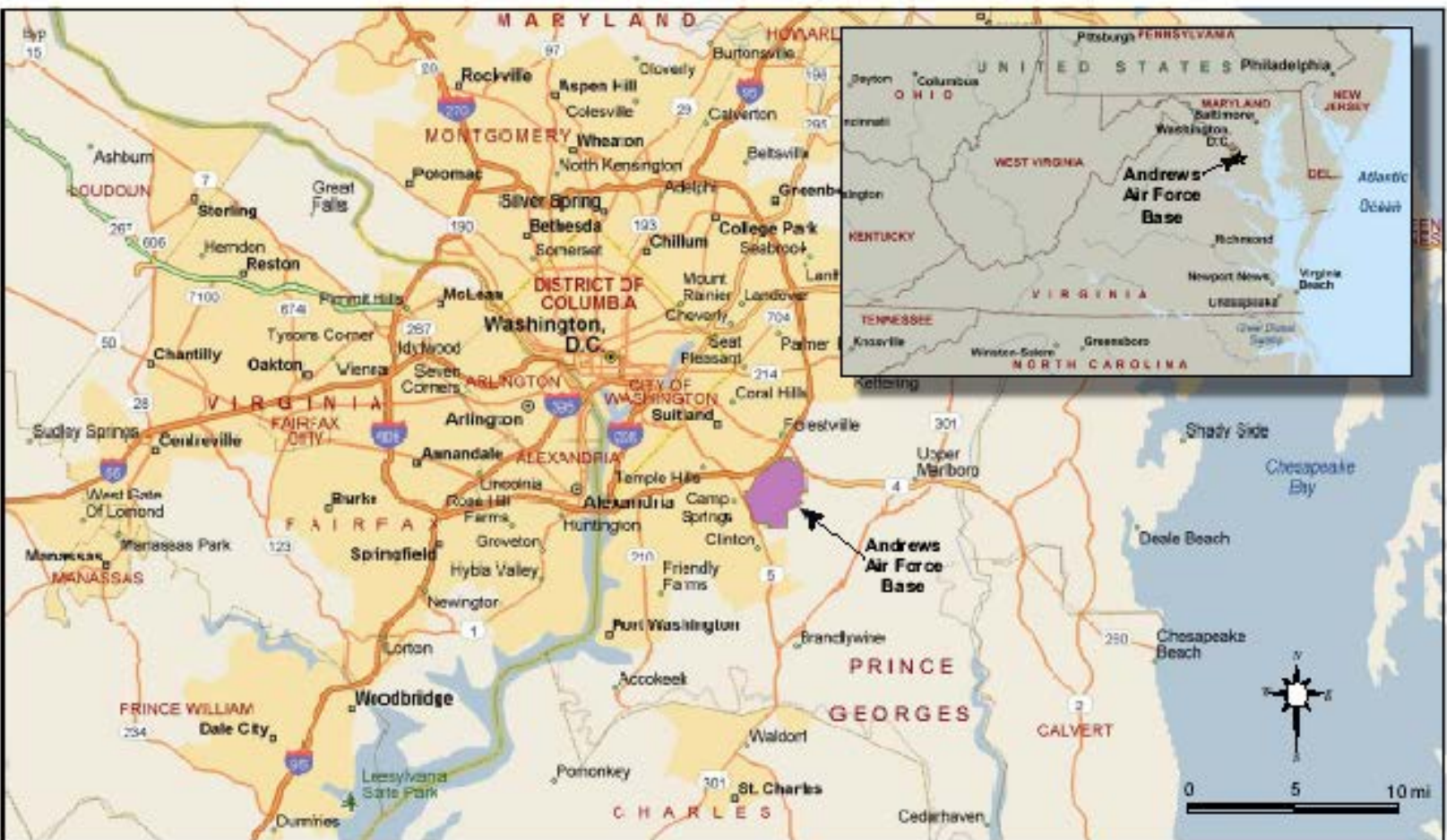
Figure 1-1. Andrews AFB and Surrounding Area