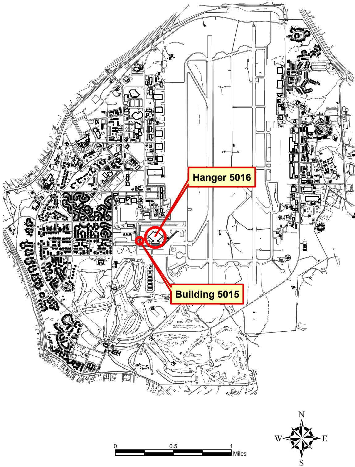
Figure 2-1. Location of Building 5015 and Hanger 5016 at Andrews AFB