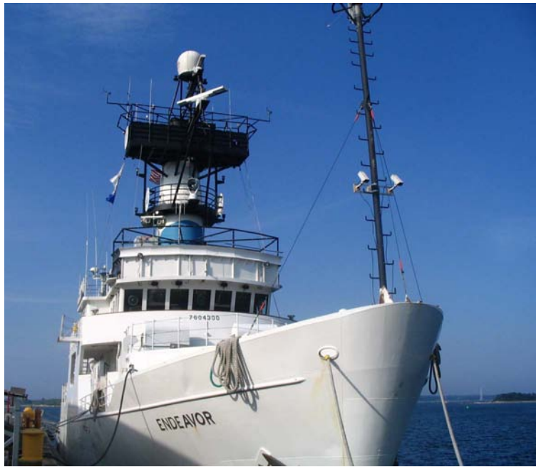
Figure 2. Photograph of video cameras mounted on the bow mast of the R/V Endeavor.