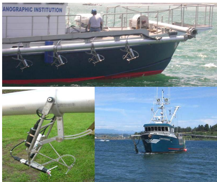
Figure 1. Top panel: photograph of the MAST in its transit (up) position on the WHOI research vessel Tioga during a test deployment near Woods Hole. Bottom left panel: close-up photograph of one of six sets of co-located sensors, including an acoustic Doppler velocimeter (ADV), a conductivity-temperature-depth (CTD) sensor, and a fast-response conductivity sensor. Bottom right panel: photograph of the MAST in its measurement (down) position on the UW research vessel Centennial during the July 2006 COHSTREX program in the Snohomish River estuary.

During July 2006, the MAST was deployed in the Snohomish River estuary in Puget Sound. The MAST measurements were carried out in conjunction with an ONR-funded Multidisciplinary Research Initiative (MURI), entitled Coherent Structures Experiment (COHSTREX), which is being conducted by Andy Jessup, Alex Horner-Devine and Bill Plant, of the University of Washington, together with Steve Monismith, Robert Street and Derek Fong, of Stanford University. The purpose of the MURI is to understand the dynamics of coherent structures which are visible in estuaries in remotely sensed images of the sea surface. The Snohomish estuary is a few meters deep, subject to tidal currents that often exceed 1 m/s, and characterized by stratification that varies from slightly unstable to strongly stable during each tidal cycle. The MAST measurements in the Snohomish estuary were divided approximately equally between two purposes: (1) quantifying stratified boundary layer turbulence under approximately horizontally uniform conditions in a nearly prismatic section of the channel, and (2) determining the subsurface signatures of coherent structures, including convergence fronts and eddies shed by submarine topography, in support of the MURI activities.