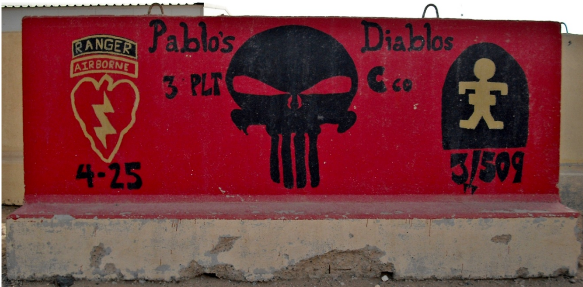
Figure 121. 3rd Platoon, Company C, 3rd Battalion, 509th Infantry Regiment

Northern Star. In the stark and the blistering Middle Eastern desert, the barrier provides fantasy-like contrast. An attention grabbing center image tells something about the arctic inhabitants. The claw shield and bayonet connote a rugged people who thrive in a harsh world. Their clan designation insinuates that they have tested traditions and fight as a unified force. A similar clan-like aspect exists in America military culture whereas, brothers and sisters in arms sacrifice for one another and no one is left behind.