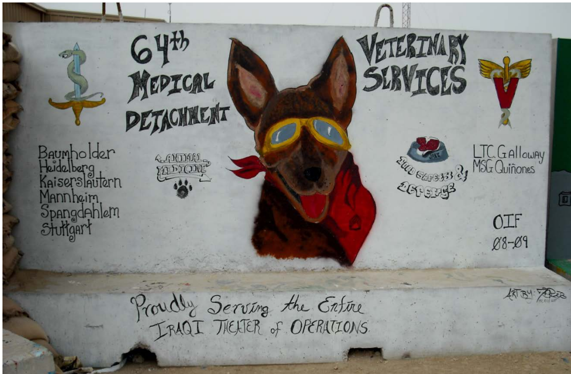
Figure 125. 64th Medical Detachment (Veterinary Services)

darkened sections. Although an airborne qualified identifier is, perhaps, taken for granted in combat focused branches, it is highly valued in those that are not. This unit proudly highlights its special skill set and references its combat history. In sum, the 32nd MMB presents itself as a unit from a combat tradition with combat experienced personnel. These aspects are considered to be bragging rights in the Army.