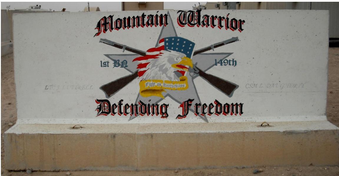
Figure 109. 1st Battalion, 149th Infantry Regiment

The 3rd Battalion, 144th Infantry Regiment paints a barrier highlighting its Task Force mission, shoulder patch, unit shield, and unit organization. The two competing themes of this barrier are the Task Force Panther mission and the Texas Army National Guard. Task Force Mission gets center billing, as revealed by the central image and overall infantry-blue color of the barrier. However, references to “the great state of Texas” are incorporated with the inclusion of the Texas National Guard patch (36th Infantry Division), the Texas flag map, reference to the Fourth Texas Regiment, and the home station of Fort Worth, Texas.