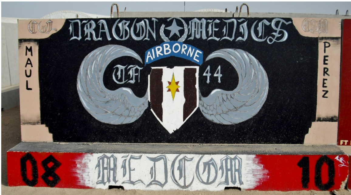
Medical: 44th Medical Brigade