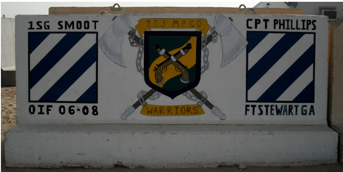
Figure 146. 293rd Military Police Company

The 278th Military Police Company manifests a barrier showcasing its motto and platoon organization. The central silhouetted Soldier is a common form of depicting military personnel. In this case the Soldier's shooting position indicates that he or she has identified a target. The unit motto, "Too Easy," is meant to describe a Soldier's ability to accurately take aim and shoot the target. The image also correlates to the company's mission approach. "Too Easy" implies that no matter how difficult a task, the unit is up to the challenge and approaches it with confidence. In total, the 278th MP Company's barrier declares to all that their mission will be accomplished.