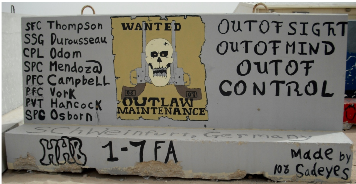
Figure 88. Headquarters, Headquarters Battery, 1st Battalion, 7th Field Artillery Regiment

Alpha Battery from 3rd Battalion, 6th Field Artillery Regiment announces its arrival to Operation Iraqi Freedom with a barrier that gives tribute to its branch and higher organization. The central featured images are the large scale FA crossed cannons and the Marvel Comics' superhero, "The Thing," in Army uniform. The movie Fantastic Four was released during the same period this barrier was created. The movie featured what came to be an immensely popular superhero character, "The Thing," that was quickly incorporated into unit identity. The character's superhuman strength and goodness of heart make him an ideal moniker or mascot for any Army unit. Further, The Thing's smashing and clobbering actions are especially fitting for the Field Artillery branch. In sum, this barrier provides a good example of the way in which popular culture is sometimes assimilated into Army culture.