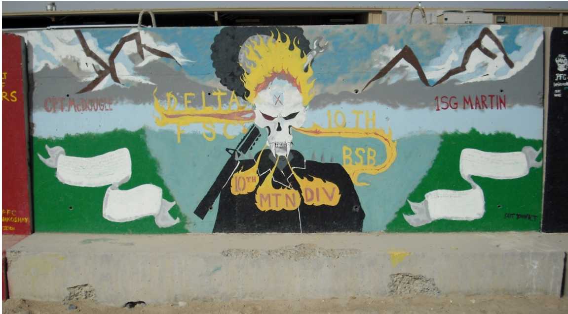
Figure 176. Forward Support Company D, 10th Brigade Support Battalion

Q5. Unit: Forward Support Company D, 10th Brigade Support Battalion. Service: Army Active, Fort Drum, New York. Date of Deployment: 2005-2006.