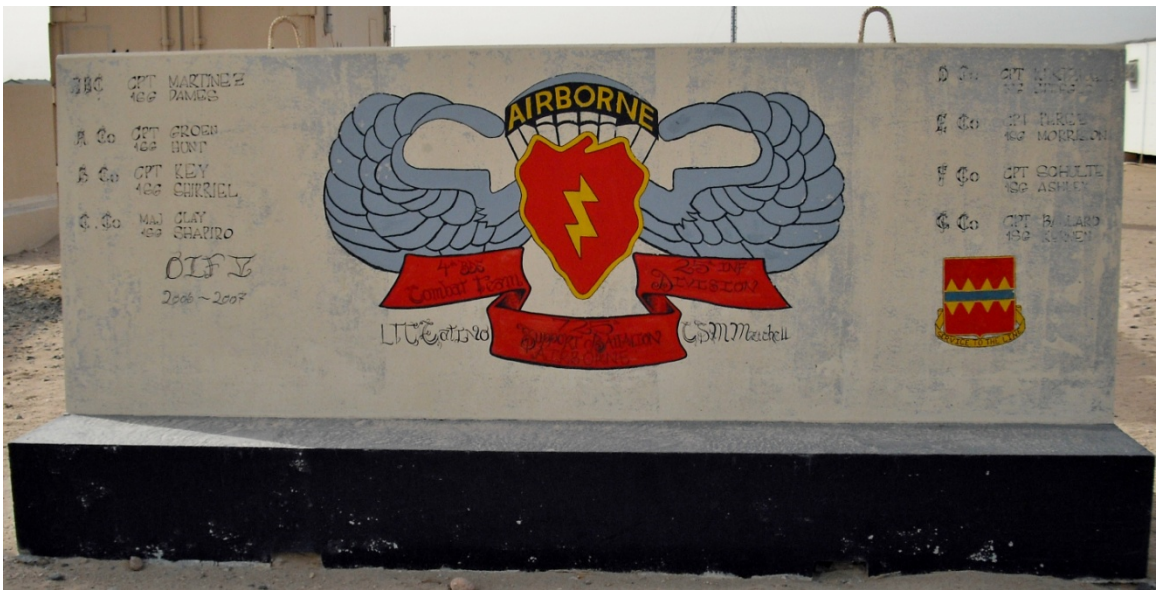
Support / Sustainment: 725th Support Battalion (Airborne)