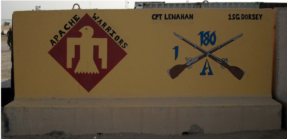
Figure 116. Company A, 1st Battalion, 180th Infantry Regiment

I14. Unit: Company A, 1st Battalion, 180th Infantry Regiment. Service: Oklahoma Army National Guard. Date of Deployment: 2007-2008.