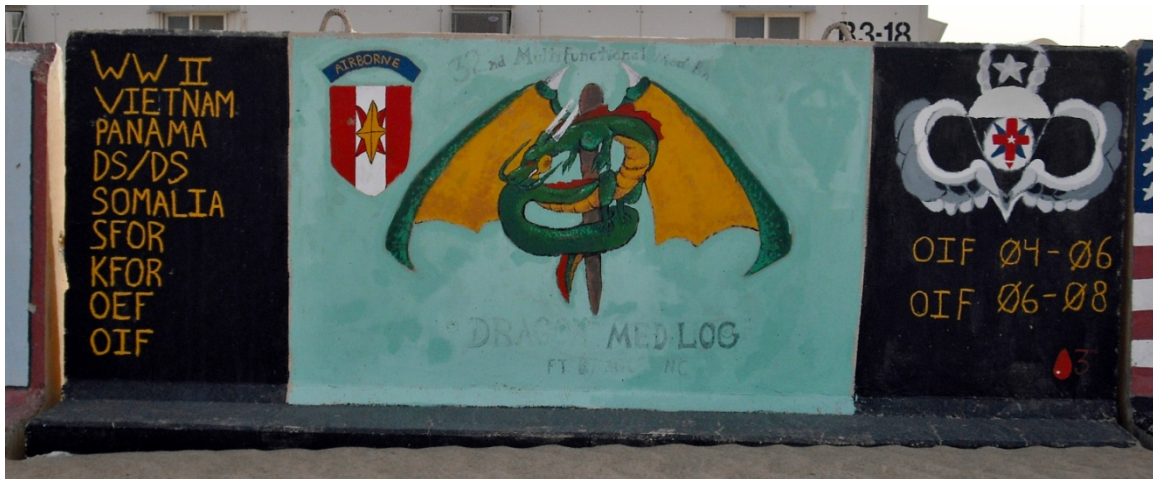
Figure 124. 32nd Multifunctional Medical Battalion (Logistics)

receives central focus as illustrated by a scenario in which a wounded Soldier is receiving aid from a medic. The medic is administering fluids and using an M-16 weapon as a support bracket. Pride in higher organization and airborne capability comprise the final aspects. All images combine to convey that this unit is proficient in both military and medical skills, at the highest level.