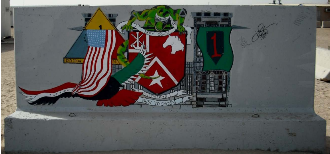
Engineer: 9th Engineer Battalion