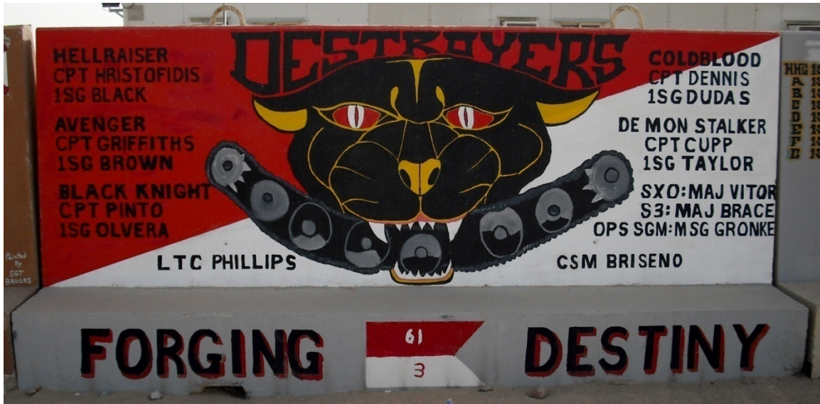
Figure 48. 3rd Squadron, 61st Cavalry Regiment

D21. Unit: 3rd Squadron, 61st Cavalry Regiment. Service: Army Active, Fort Carson, Colorado. Date of Deployment: 2006-2007.