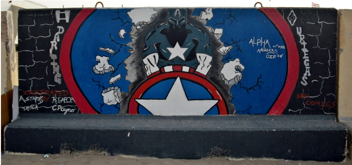
Figure 180. Company A, 47th Forward Support Battalion, 2nd Brigade Combat Team

Q9. Unit: Company A, 47th Forward Support Battalion, 2nd Brigade Combat Team. Service: Army Active, Baumholder, Germany. Date of Deployment: 2008-2009.