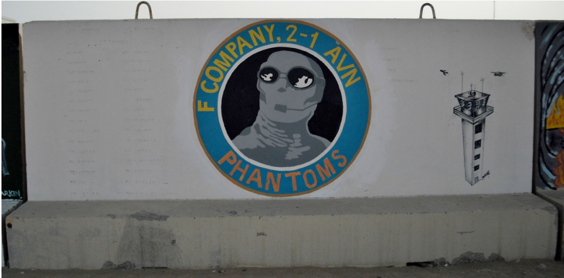
Figure 52. Company F, 2nd Battalion (General Support), 1st Aviation Regiment

E2. Unit: Company F, 2nd Battalion (General Support), 1st Aviation Regiment. Service: Army Active, Fort Riley, Kansas. Date of Deployment: Likely 2007-2008