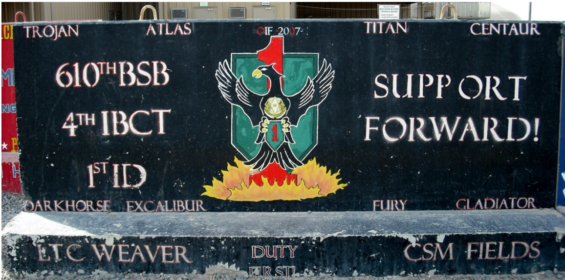
Support / Sustainment: 610th Brigade Support Battalion