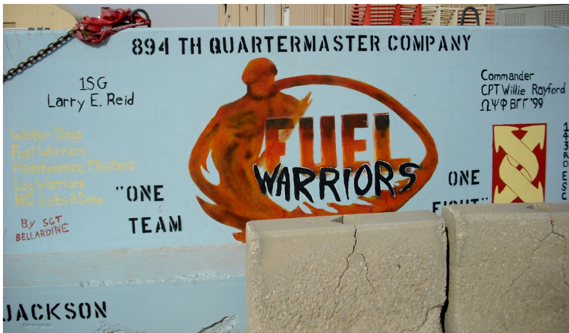
Figure 169. 894th Quartermaster Company

“Livin’ the Dream,” is etched on a flowing banner above. The image appearing across the barrier’s base incorporates chain, lock, and the phrase “Lokd Tite.” The “Lokd Tite” moniker depicts the unit as disciplined, thorough, and organized. Overall, the presentation gives the appearance of a midcentury style license plate. This type of plate is usually seen on classic cars and connotes the free spirited American appreciation of life and the open road. Whether at home or deployed, through ease or struggle, the American spirit soars free and looks for the very best in a situation.