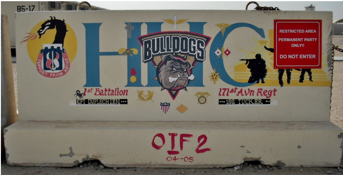
Figure 66. Headquarters, Headquarters Company, 1st Battalion, 171st Aviation Regiment

E16. Unit: Headquarters, Headquarters Company, 1st Battalion, 171st Aviation Regiment. Service: Georgia Army National Guard. Date of Deployment: 2004-2005.