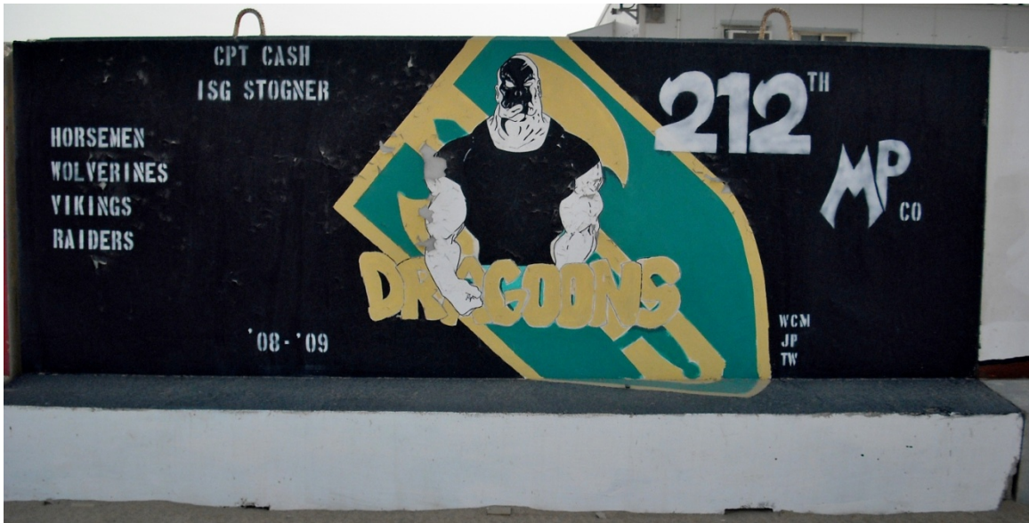
Military Police: 212th Military Police Company