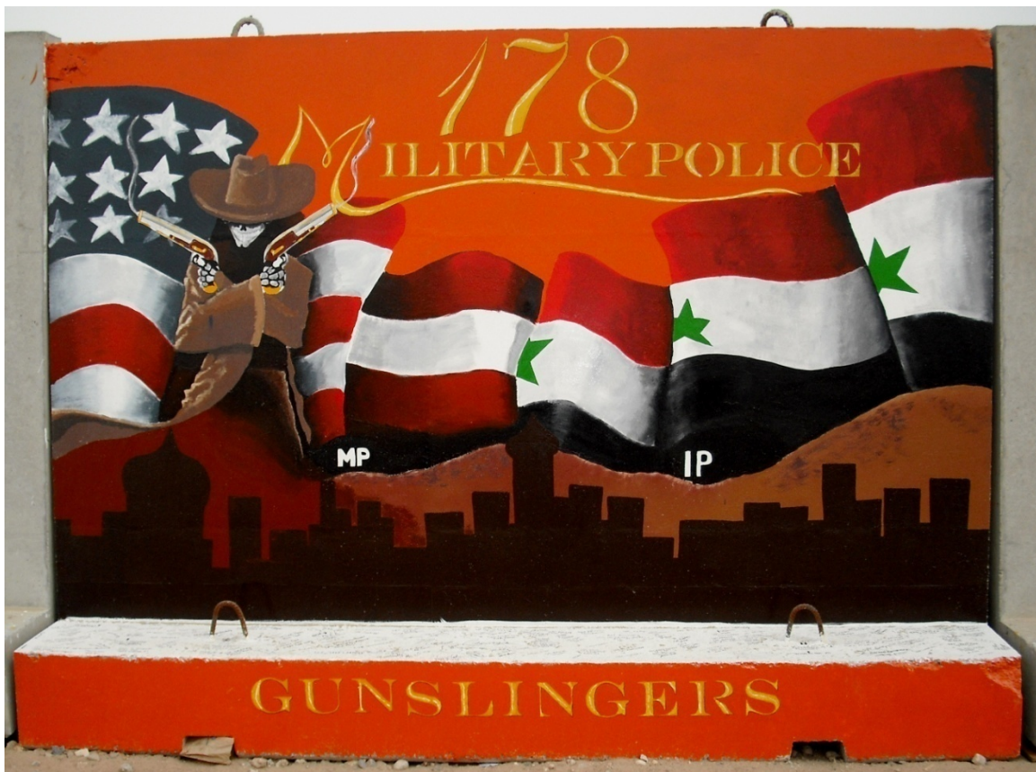
Figure 142. 178th Military Police Company

The 153rd Military Police Company's barrier features three primary themes. Crossed pistols are the first and largest theme. The pistols representing the MP branch are painted in hefty form to illustrate branch pride. The second primary theme on this barrier is the Delaware National Guard insignia. Its size and central placement demonstrate the unit's esteem for their home state. Finally, the third theme featured is the "One Team One Mission" motto, reflecting the company's strength of unity and purpose. Overall, the scale of objects, precision, and vibrant colors draw attention and create a roadside billboard effect.