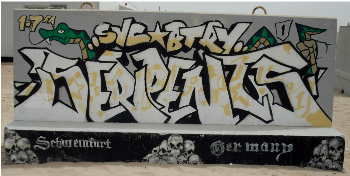
Figure 90. SVC Battery, 1st Battalion, 7th Field Artillery Regiment

An additional design aspect of the barrier was the allocated space for unit members to sign their names. Such allowance portrays a commonality and shared ownership within the group. It also provides an added means for unit personnel to be honored.