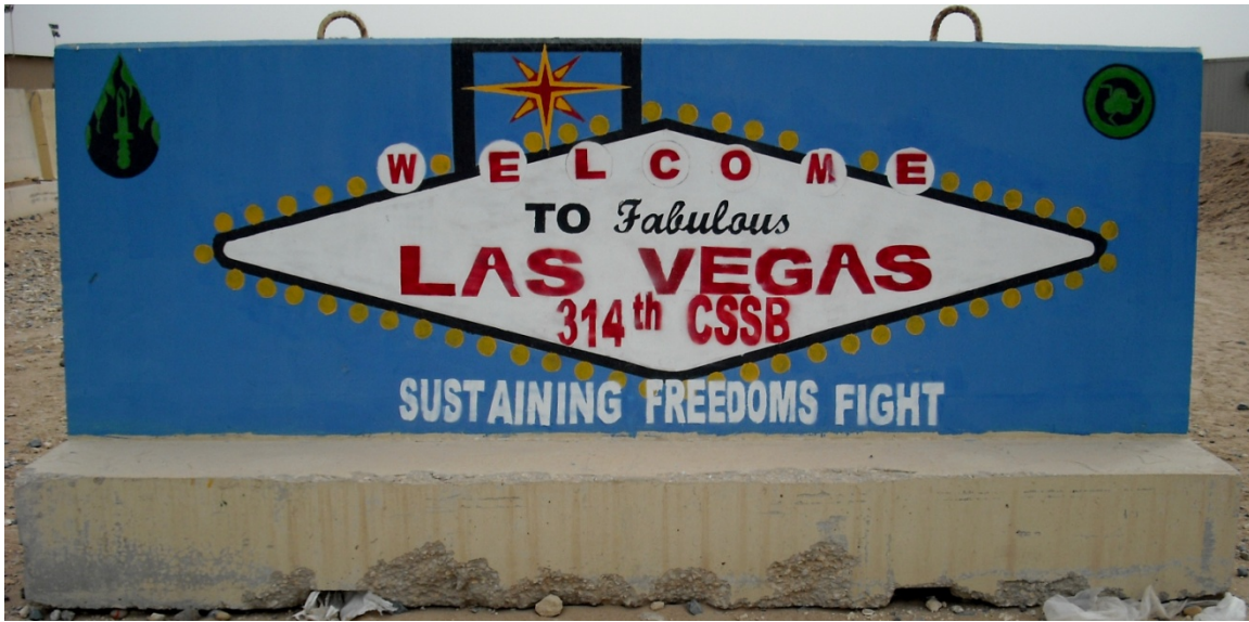
Figure 183. 314th Combat Sustainment Support Battalion

of the barrier is the listing of Soldier names. For as time marches forward and the barrier is recalled, memories endure of a distant war that was fought by a band of brothers and sisters in arms.