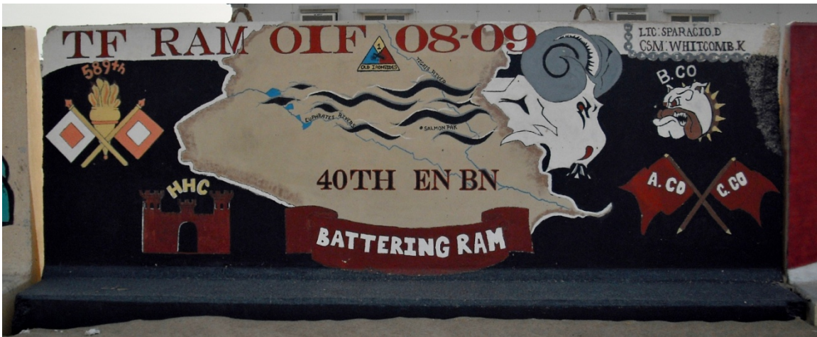
Figure 78. 40th Engineer Battalion, 2nd Brigade, 1st Armored Division

FSC demonstrates how to transform a non-threatening unit moniker into something hostile by embellishing their seahorse with glowing red dragon-like eyes, smoke coming from its nostrils, and Godzilla-like spikes upon its back. This barrier is a particularly good example of how many warfighters identify with, and want to be represented by images of force and aggression when they are entering battle.