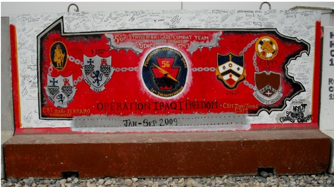
Figure 19. 56th Stryker Brigade Combat Team, 28th Infantry Division

The second message broadcast on the barrier is the motto, “Assume Nothing, Leave no Doubt.” This statement reflects the 56th’s combat approach of being thorough in planning and overwhelming in force. It also demonstrates the American military doctrine of continuously evaluating the environment and enemy actions. Brigade Soldiers proudly display the American and Texas flags as they lead the Nation’s forces on the attack.