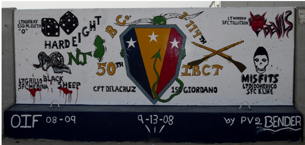
Figure 106. Company B, 1st Battalion, 114th Infantry Regiment

rendering recalls the enduring tenacity and overcoming spirit of the American people. A historically appropriate color palette further contributes to the old-world charm of this gem.