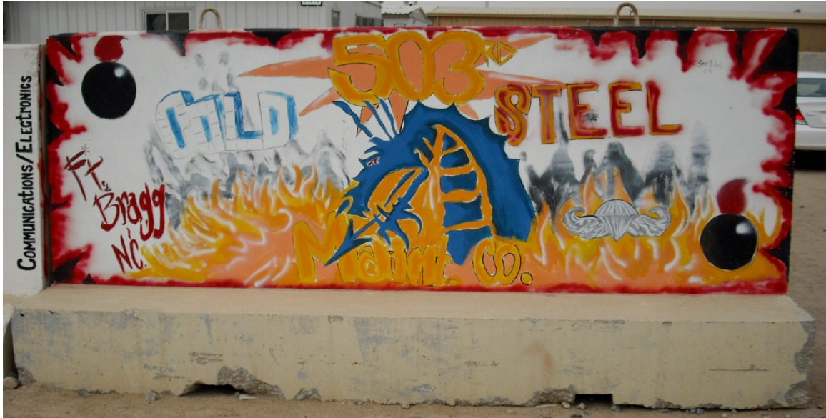
Figure 161. 503rd Maintenance Company

M6. Unit: 503rd Maintenance Company. Service: Army Active, Fort Bragg, North Carolina. Date of Deployment: 2008-2009.