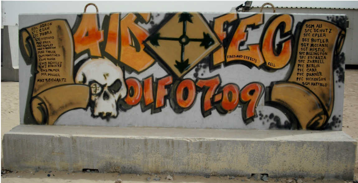
Figure 8. 4th Infantry Division Fires and Effects Cell

A4. Unit: 4th Infantry Division Fires and Effects Cell. Service: Army Active, Fort Hood, Texas. Date of Deployment: 2007-2008.