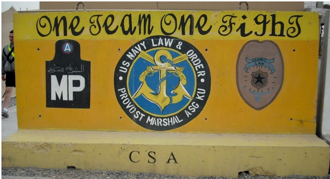
Figure 200. U.S. Navy Law and Order / Provost Marshal, Area Support Group Kuwait, US Army Central Command

T1. Unit: U.S. Navy Law and Order / Provost Marshal, Area Support Group Kuwait, US Army Central Command.