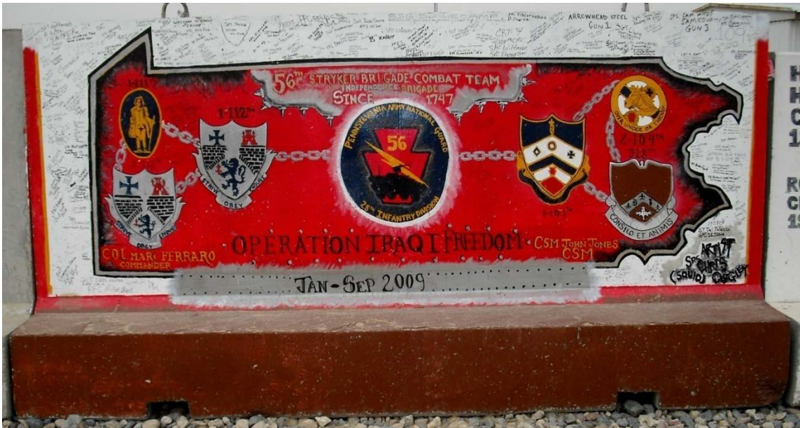
Figure 4. Example of research process developed by the author

Source: Photo by author, Camp Buehring, Kuwait, 16 February 2009.