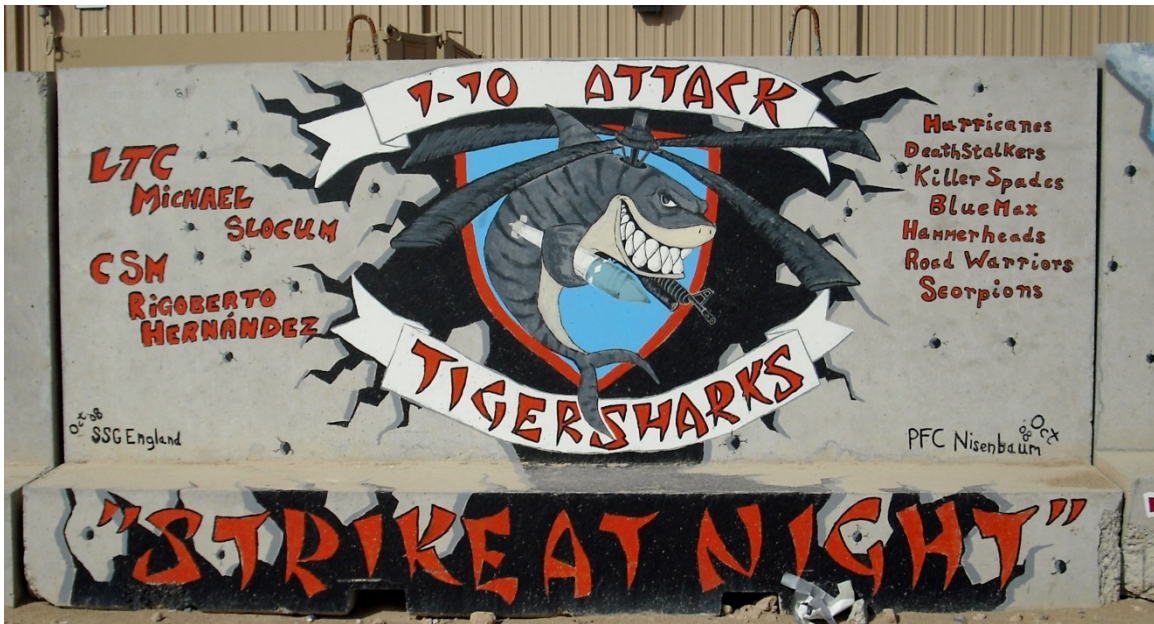
Figure 53. 1st Battalion (Attack), 10th Aviation Regiment

E3. Unit: 1st Battalion (Attack), 10th Aviation Regiment. Service: Army Active, Fort Drum, New York. Date of Deployment: 2008-2009.