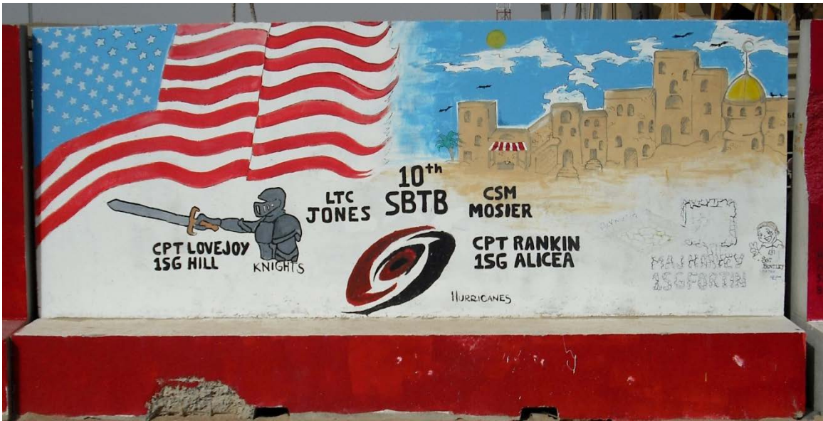
Figure 175. Special Troops Battalion, 10th Sustainment Brigade

Q4. Unit: Special Troops Battalion, 10th Sustainment Brigade. Service: Army Active, Fort Drum, New York. Date of Deployment: 2008-2009.