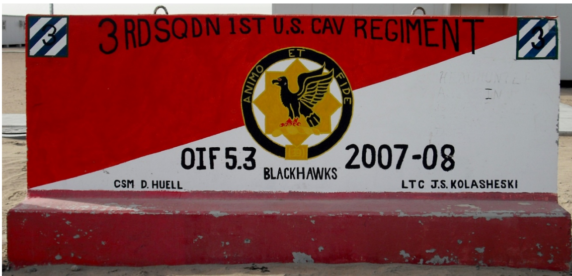
Figure 32. 3rd Squadron, 1st Cavalry Regiment

Vermont National Guard as the backdrop. In the foreground, unit Soldiers are represented by the then popular use of darkened silhouettes. The silhouettes, which obscure rank, gender, age, and race, communicate a unified aspect about the company. In addition, the illustration appears to depict the Soldiers walking forward toward an assigned mission. The result is a simple and bold statement: Vermont is present and its Soldier's are unified and ready to complete the mission.