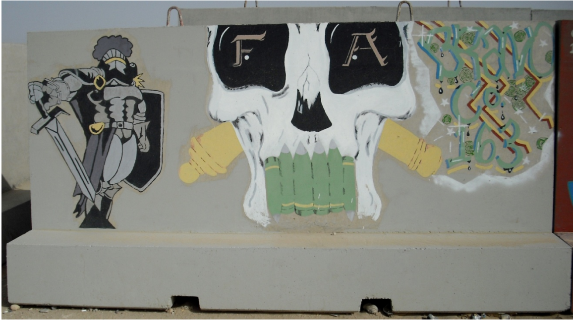
Field Artillery: Battery B, 1st Battalion, 163rd Field Artillery Regiment