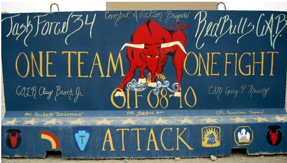
Figure 16. 34th Combat Aviation Brigade

A12. Unit: 34th Combat Aviation Brigade. Service: Minnesota Army National Guard (with 10 states). Date of Deployment: 2008-2009.