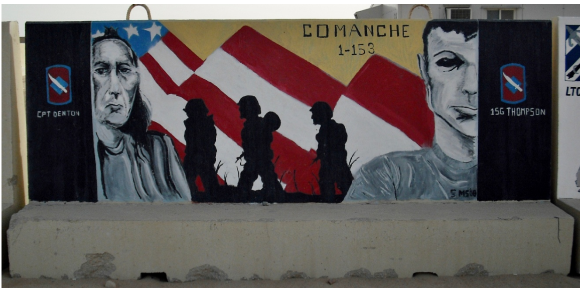
Figure 111. Company C, 1st Battalion, 153rd Infantry Regiment

The 1st Battalion, 153rd Infantry Regiment paints a barrier that publicizes its organization, motto, and leadership. The barrier's design is meant to highlight the battalion's structure, thus reflecting the high value that the Army places upon organization. Images of company guidons and the names of leadership personnel are precisely colored and placed, giving the impression that they are lined up for inspection. In a variation on the standard infantry crossed rifles, the unit presents a large hunting knife and war hatchet symbol. This adaptation calls attention to the Warrior moniker which the battalion has chosen for combat inspiration.