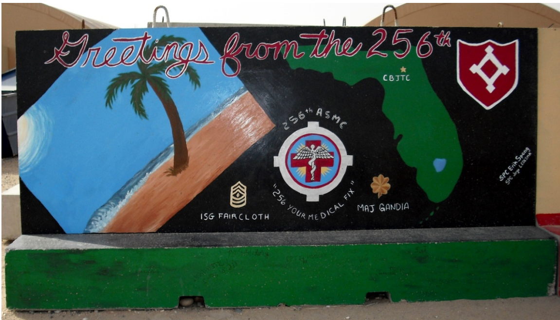
Figure 128. 256th Area Support Medical Company

The 128th Medical Company arrives at Camp Buehring and makes known its home station, branch affiliation, leadership, and unit identification. The company smartly incorporates its medical branch and ground ambulance mission in its barrier. The white paint used as the base color is suggestive of an aseptic medical operation environment. However, the central image in combination with the barrier's font style has a hot rod automotive appeal. The medical symbol is adapted as a dagger and is made threatening by adding a Soldier skull with beret and tattoos. The central image ultimately "shifts" this barrier from medical to warrior emphasis.