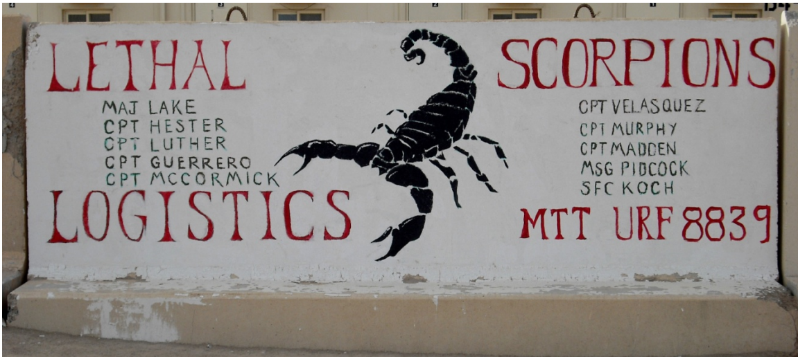
Figure 199. URF 8839, Military Transition Team

S2. Unit: URF 8839, Military Transition Team.