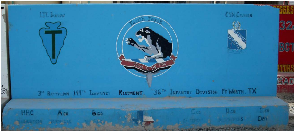
Figure 108. 3rd Battalion, 144th Infantry Regiment

The purpose of raising the alarm is not to bring self-attention. The unit shares its identity with all men and women serving, and names of unit personnel are noticeably absent. The altruistic purpose of the alarm is revealed in the unit's inspiring message: "This is when perfection becomes standard. Right here, right now. This is dedicated to all the men and women serving in the Armed Forces. Give 'Em Hell!! HOOAH." The warfighting motivation of the NJ National Guard is clearly found in their understanding that this war and their mission are real. With the standards of perfection, they will consistently give their best to support their brothers and sisters in arms. It is a reminder that all troops are in the war together and are mutually dependent for success. In addition it is an outstanding example of esprit de corps amongst America's fighting forces.