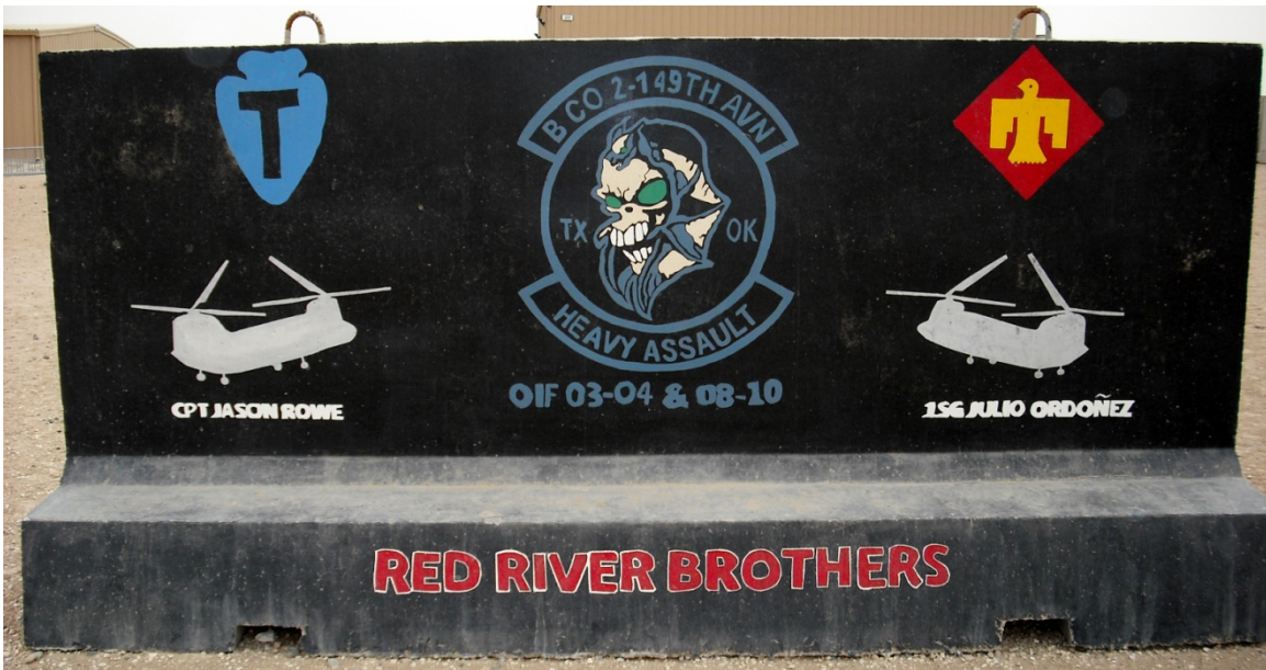
Figure 60. Company B, 2nd Battalion, 149th Aviation Regiment

E10. Unit: Company B, 2nd Battalion, 149th Aviation Regiment. Service: Texas and Oklahoma Army National Guard. Date of Deployment: 2008-2009.