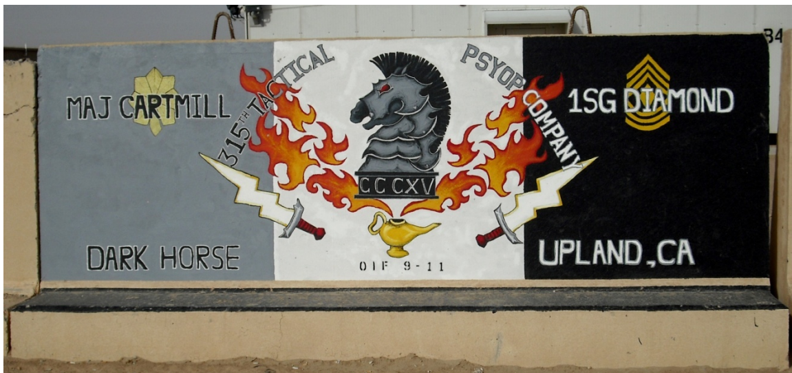
Figure 165. 315th Tactical Psychological Operations Company

N1. Unit: 315th Tactical Psychological Operations Company.