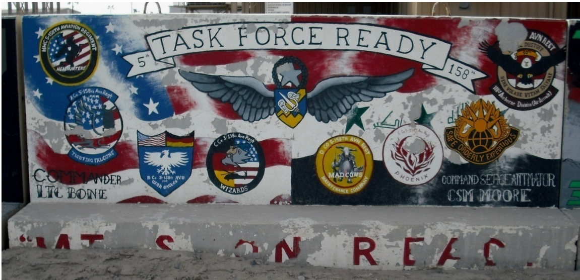
Figure 64. 5th Battalion, 158th Aviation Regiment

E14. Unit: 5th Battalion, 158th Aviation Regiment. Service: Army Active, Ansbach, Germany. Date of Deployment: 2007-2008.