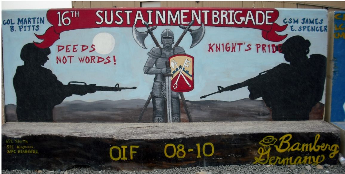
Figure 15. 16th Sustainment Brigade

A11. Unit: 16th Sustainment Brigade. Service: Army Active, Warner Barracks, Bamberg, Germany. Date of Deployment: 2008-2009.