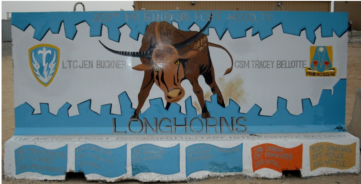
Figure 138. 303rd Military Intelligence Battalion

of structure, organization, discipline and mission focus, the 163rd MI BN substantiates its motto, “Always Ready.”