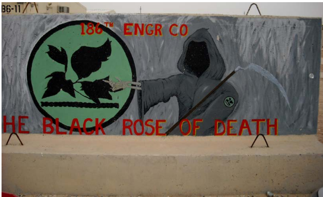
Figure 82. 186th Engineer Company

The company's moniker is the "Ravens," and the intended meaning of the chained raven is unclear. In Celtic tradition, ravens are associated with warfare and perceived as harbingers of doom. 79 Consequently, the chained raven may suggest the company has doom at their disposal to unleash. The illustration can also imply that the 182nd Engineer Company has subjugated the raven and no doom in war can befall them.