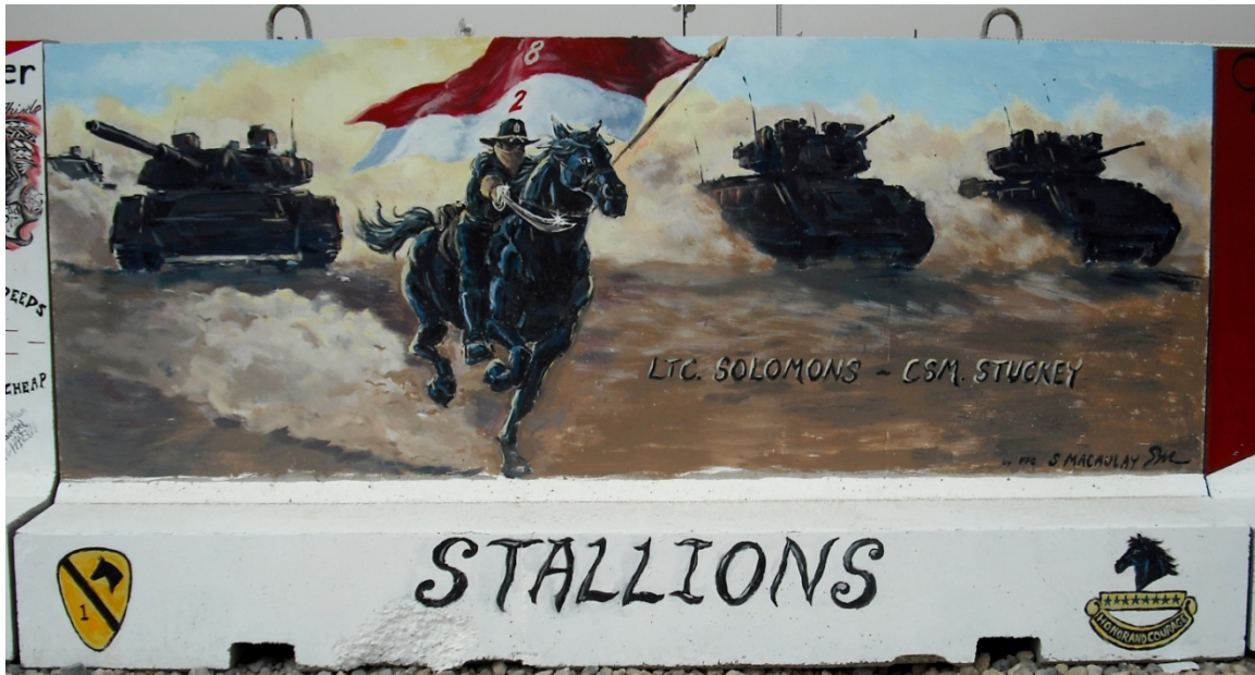
Figure 1. 2nd Battalion, 8th Cavalry Regiment Concrete Barrier War Paint

The nation which forgets its defenders will be itself forgotten. 1 — President Calvin Coolidge