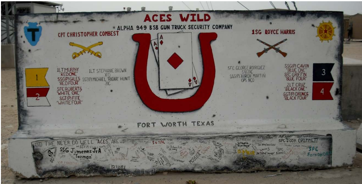
Figure 188. Company A, 949th Brigade Support Battalion

Q17. Unit: Company A, 949th Brigade Support Battalion. Service: Texas Army National Guard, Fort Worth, Texas. Date of Deployment: 2008-2009.