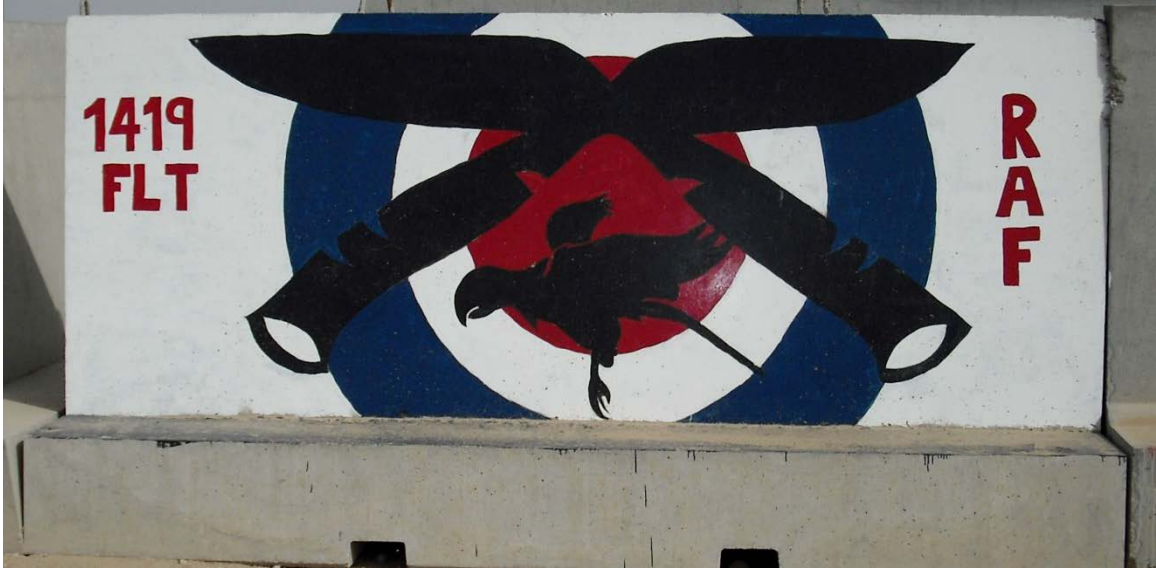
England: Royal Air Force