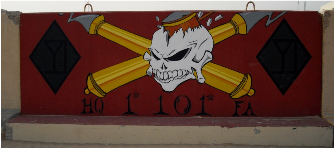
Figure 97. Headquarters Battery, 1st Battalion, 101st Field Artillery Regiment

H11. Unit: Headquarters Battery, 1st Battalion, 101st Field Artillery Regiment. Service: Massachusetts Army National Guard. Date of Deployment: 2006-2007.