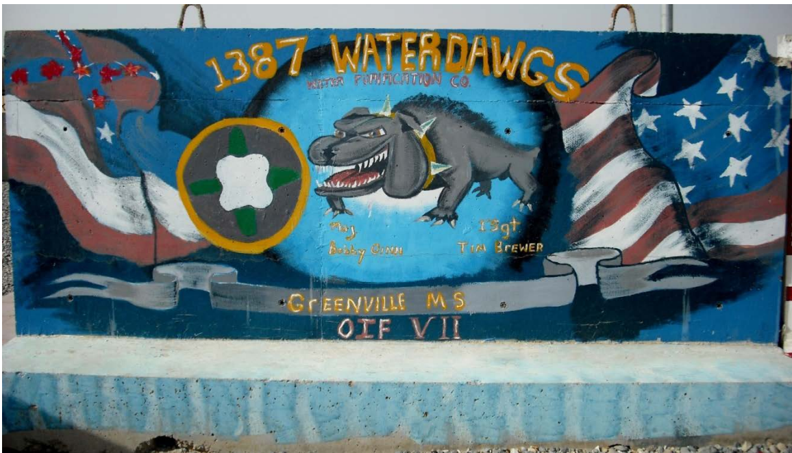
Figure 170. 1387th Quartermaster Water Supply Company

Soldiers from the 894th Quartermaster Company arrive at Camp Buehring and present a barrier that communicates their home station, branch affiliation, and motto. Their company moniker, “Fuel Warriors,” creatively combines fire, a Soldier, and a fuel tank. The illustration stands out against a Quartermaster blue background. With the unit’s continuous logistics and maintenance responsibilities, the motto, “One Team One Fight,” is undoubtedly more than a quote. It is a way of life.