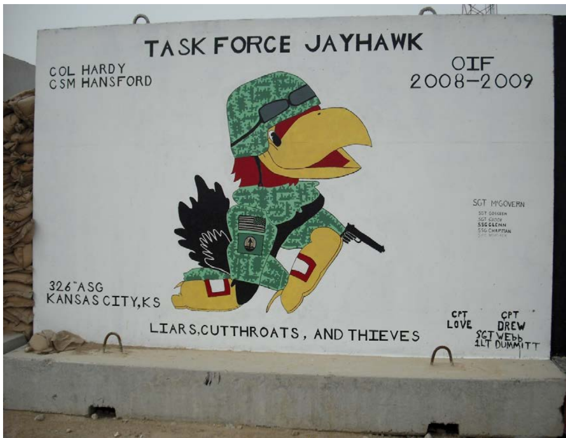
Figure 23. 326th Area Support Group

The 304th Sustainment Brigade presents a barrier that is evocative of the legends of old. The central portion has the appearance of a tapestry, depicting a dragon that bears the unit insignia. Calligraphy style writing provides identifying details. In addition, the dragon is bracketed by two stained glass-like windows, one showing home station and the other Iraq. In total, the barrier scene reminds the viewer of their sacred obligation to country, duty, and mission. Sustaining American forces on the foreign battlefield is the brigade's priority.