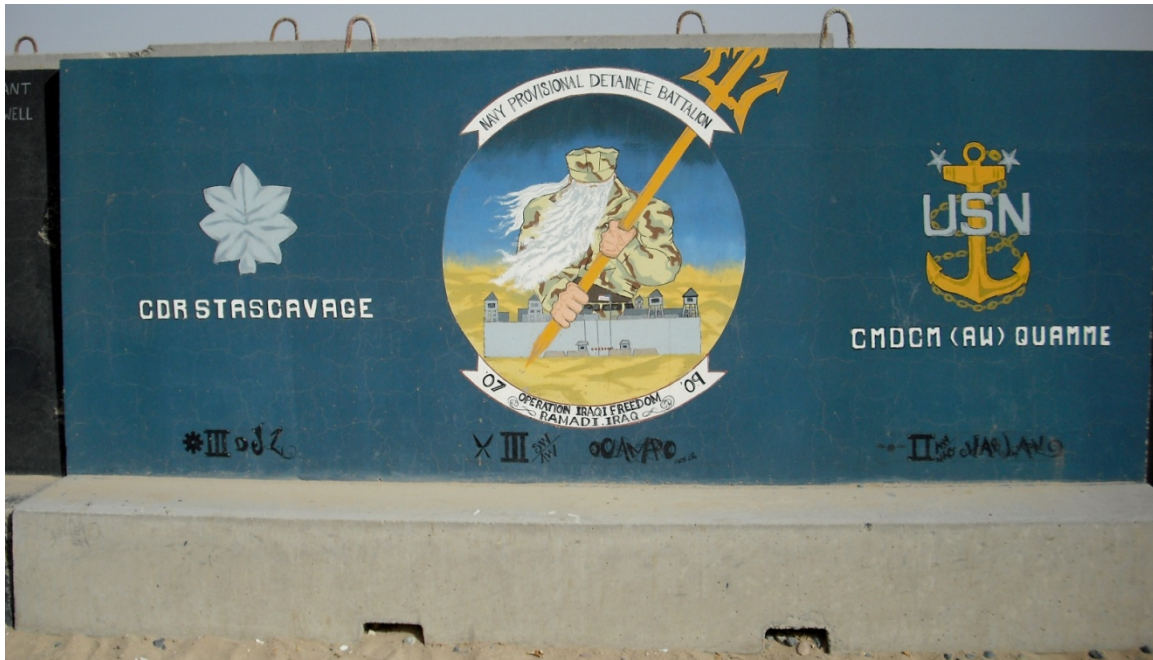
Figure 201. Navy Provisional Detainee Battalion III

T2. Unit: Navy Provisional Detainee Battalion III.