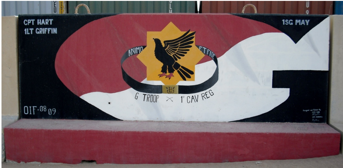
Figure 33. Troop G, 1st Cavalry Regiment

Faithful.” 76 In total, this barrier is a good example of Soldier pride in their regiment and branch.