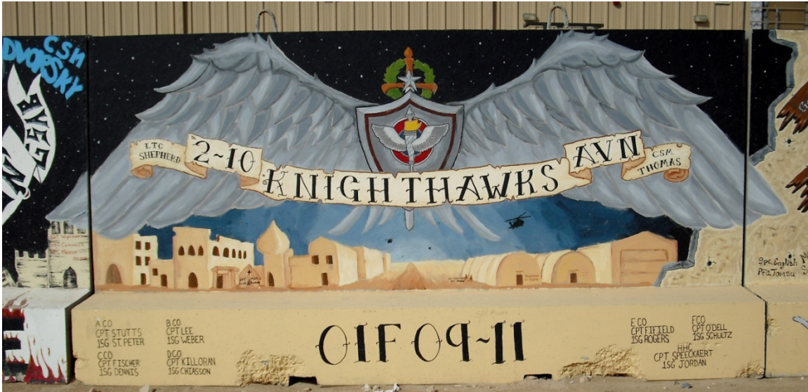
Figure 54. 2nd Battalion, 10th Aviation Regiment

E4. Unit: 2nd Battalion, 10th Aviation Regiment. Service: Army Active, Fort Drum, New York. Date of Deployment: 2008-2009.