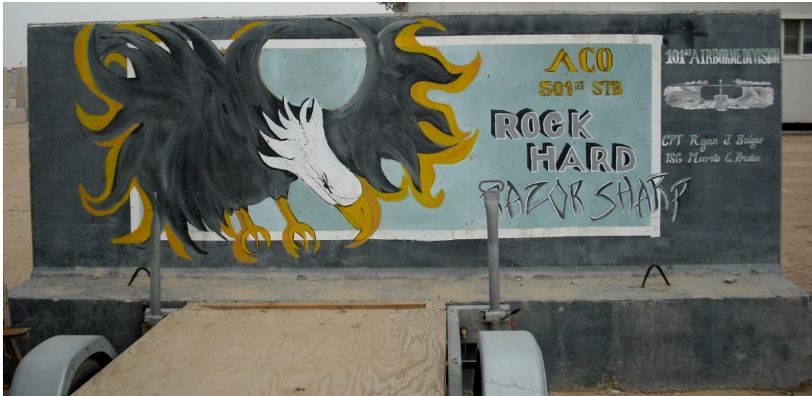
Figure 186. Company A, 501st Special Troops Battalion, 101st Airborne Division

calls attention to the human aspect. In sum, the 419th CSSB is most inspired by unity of effort and selfless service, and it brings these traits to the fight.