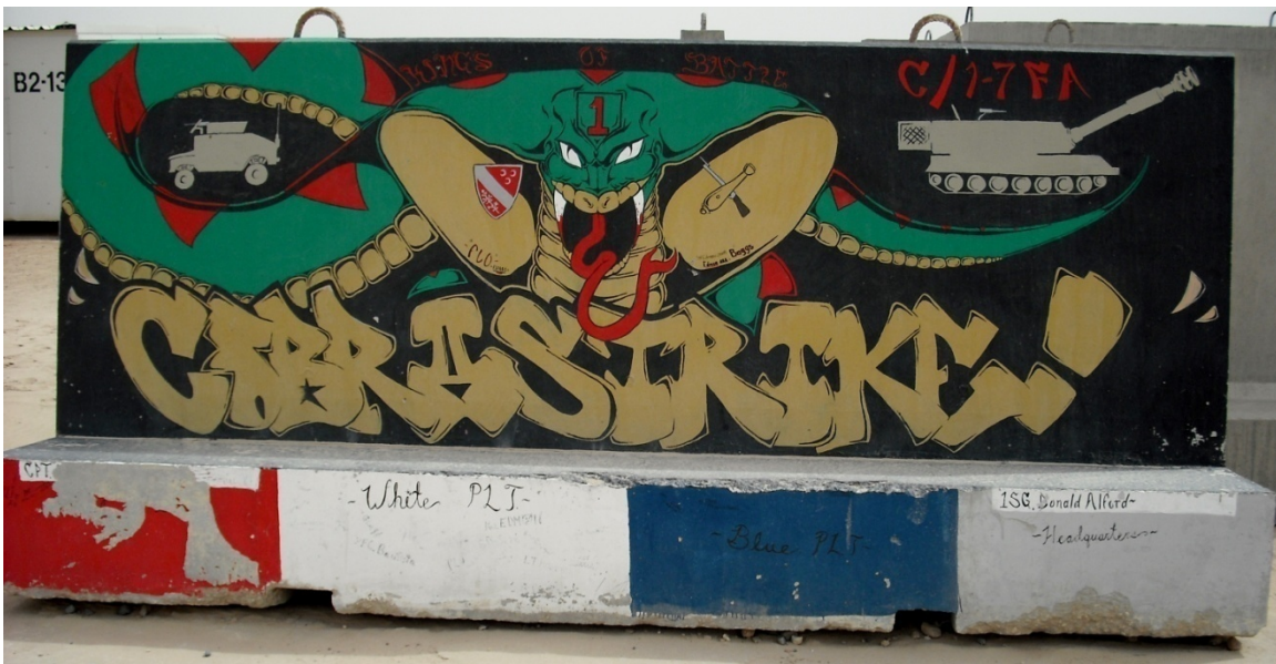
Figure 89. Battery C, 1st Battalion, 7th Field Artillery Regiment

The Headquarters, Headquarters Battery from 1st Battalion, 7th Field Artillery Regiment announces its arrival from Germany with a barrier that provides unit identification and pokes fun at unit personnel. The Outlaws are entertained with a light humored camaraderie that lists Soldier names next to a “wanted” poster. In jest, they are wanted for being especially “out of control.” Whether by intention or not, this barrier has the unique appearance of an old western wall with a wanted poster and random graffiti. Further, the unit moderately adapts FA branch symbolism to fit within the wanted poster design by substituting two six shooters in place of crossed cannons.