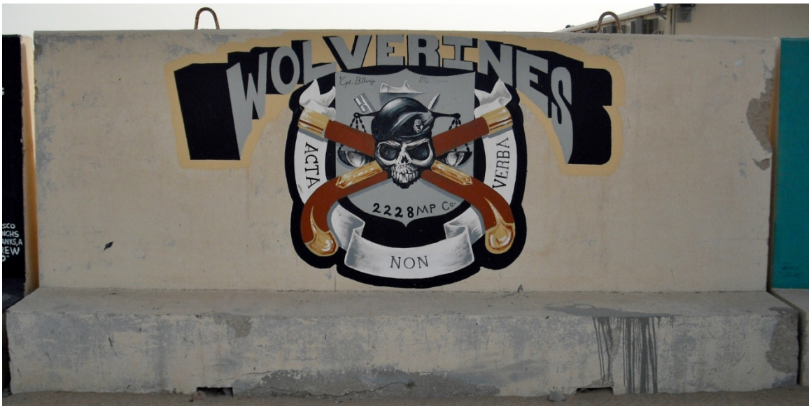
Military Police: 2228th Military Police Company