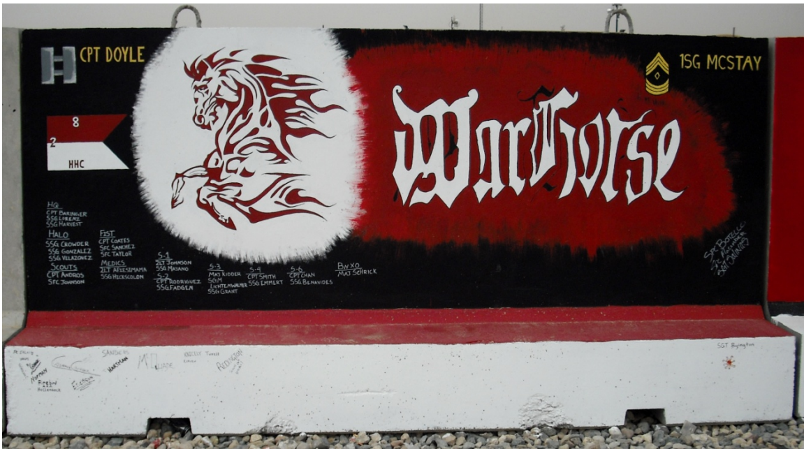
Figure 41. Headquarters, Headquarters Company, 2nd Battalion, 8th Cavalry Regiment

D14. Unit: Headquarters, Headquarters Company, 2nd Battalion, 8th Cavalry Regiment. Service: Army Active, Fort Hood, Texas. Date of Deployment: 2009-2010.