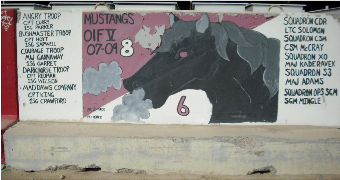
Figure 45. 6th Squadron, 8th Cavalry Regiment

D18. Unit: 6th Squadron, 8th Cavalry Regiment. Service: Army Active, Fort Stewart, Georgia. Date of Deployment: 2007-2008.