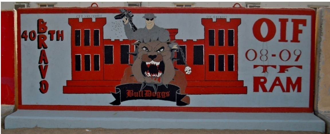
Figure 79. Company B, 40th Engineer Battalion

Perhaps the most striking and uncommon aspect of this barrier is its central image. A map highlighting Task Force Ram's Area of Operations (central Iraq) is placed on the back of battering-ram mascot. The map's horizontal black groove markings seemingly represent contours of the rams back. Hence, the image conveys that the central area of Iraq is supported by Task Force Ram. Depicted as aggressive and determined in focus, the ram indicates that the 40th Engineer Battalion will be unrelenting in securing its mission and providing support to the nation of Iraq.