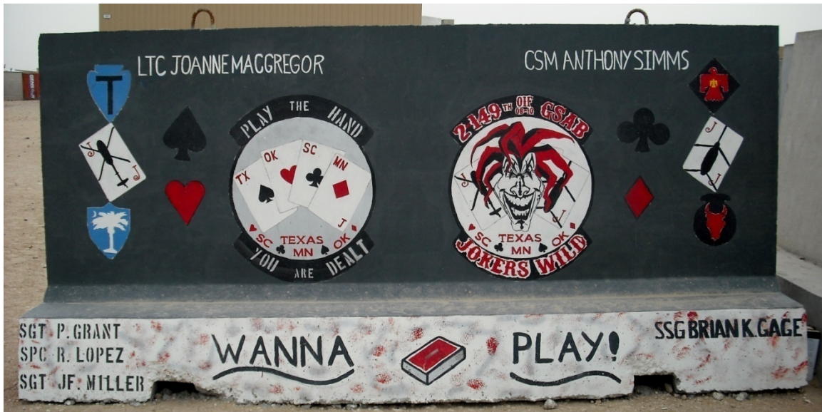
Figure 59. 2nd Battalion (General Support), 149th Aviation Regiment

E9. Unit: 2nd Battalion (General Support), 149th Aviation Regiment. Service: Texas Army National Guard (with Minnesota, South Carolina, and Oklahoma). Date of Deployment: 2008-2009.