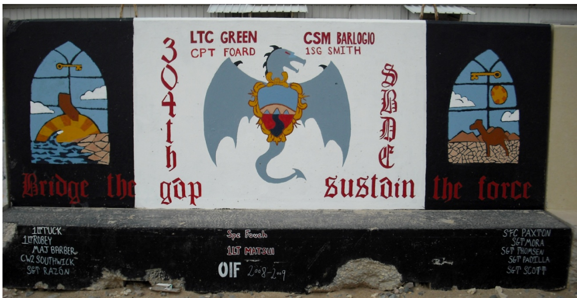
Figure 22. 304th Sustainment Brigade

Patriotism is perhaps the most prominent theme. The American flag encompasses the entire barrier, dwarfing the Soldier in comparison. The barrier's object of honor is not the Soldier, but the flag and nation it represents. Love for homeland and its defense are clearly communicated and set a patriotic standard.