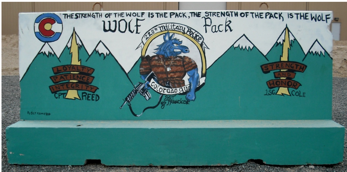
Figure 143. 220th Military Police Company

The 178th Military Police Company stylishly announces its unit identification, branch, and mission on an imposing ten foot barrier. The lower portion portrays the mission setting of an Iraqi city, complete with minarets and approaching dust storm. The horizontal center portion of the barrier honors the cooperation between Iraqi and American police forces with an illustration of the respective national flags flowing into one another. Finally, the representative gunslinger is an ambidextrous, death dealing street fighter in the tradition of the old West. Such an archetype is highly revered in American culture.