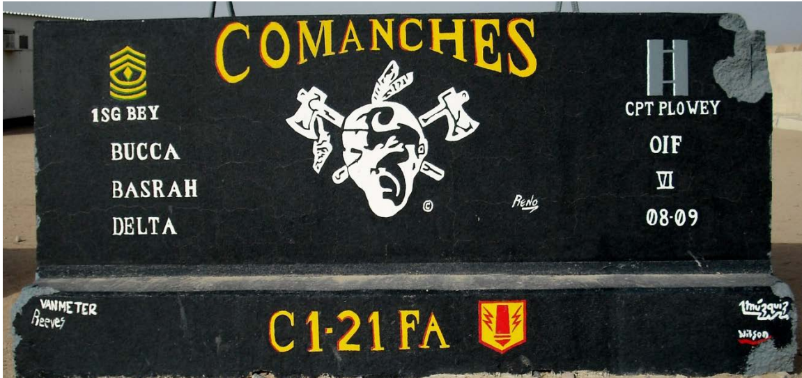
Figure 92. Battery C, 1st Battalion, 21st Field Artillery Regiment

H6. Unit: Battery C, 1st Battalion, 21st Field Artillery Regiment. Service: Army Active, Fort Hood, Texas. Date of Deployment: 2008-2009.