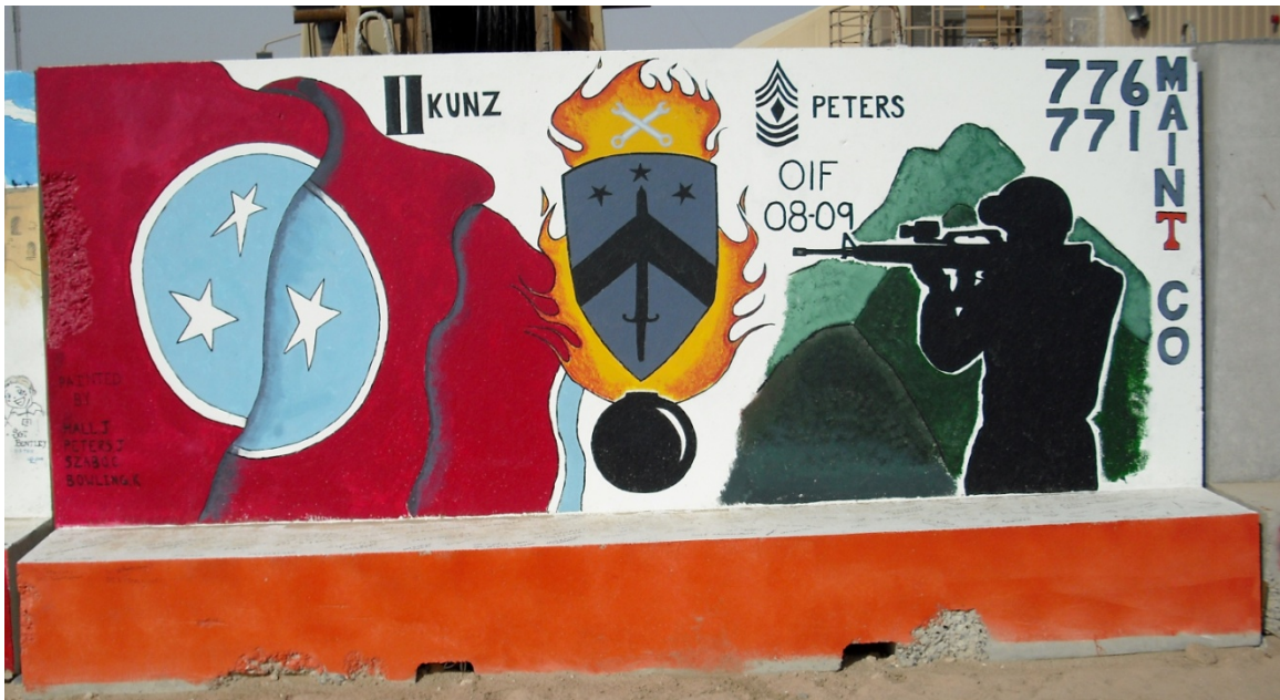
Figure 163. 771st and 776th Maintenance Companies

M8. Unit: 771st and 776th Maintenance Companies. Service: Tennessee Army National Guard. Date of Deployment: 2008-2009.