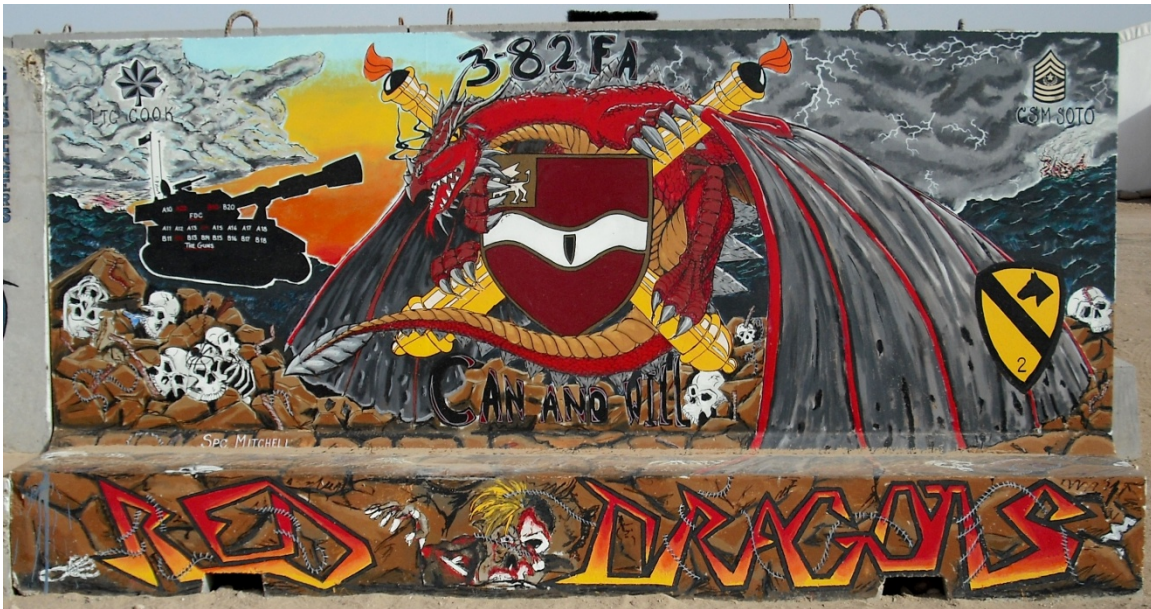
Figure 96. 3rd Battalion, 82nd Field Artillery Regiment

H10. Unit: 3rd Battalion, 82nd Field Artillery Regiment. Service: Army Active, Fort Hood, Texas. Date of Deployment: 2009-2010.