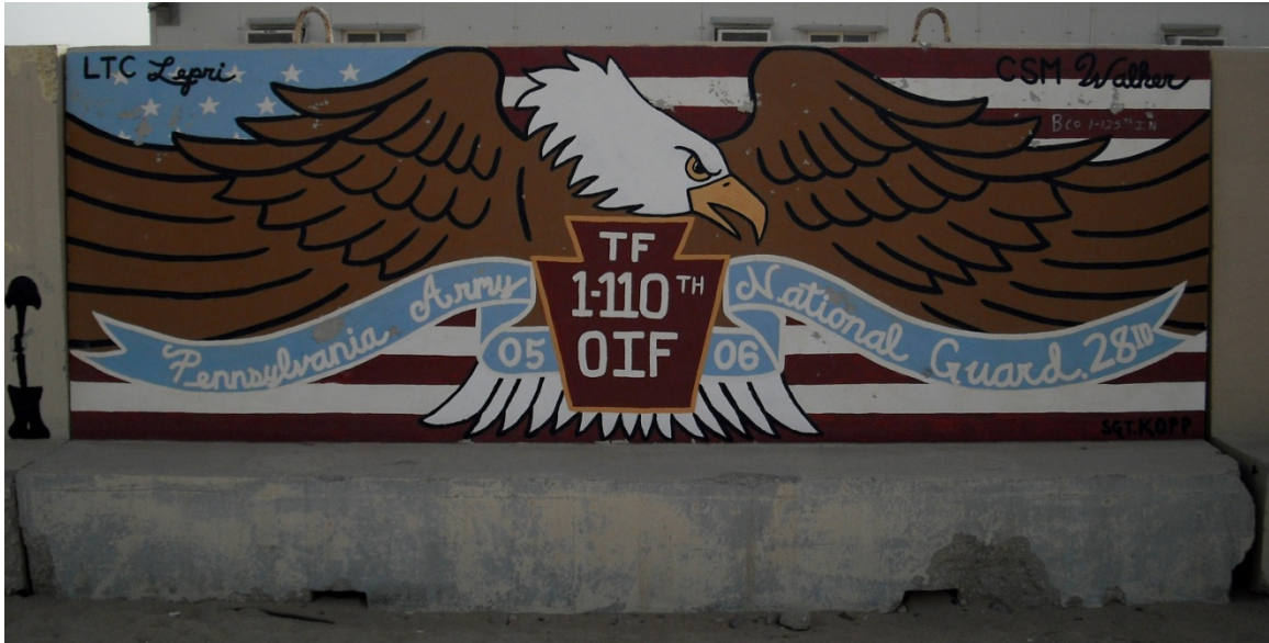
Figure 105. 1st Battalion, 110th Infantry Regiment

combination with those of the companies, illustrates the depth of organization required to accomplish the mission. Especially notable about this barrier is the careful design of images and the meticulous artistic presentation. Combined, they promote the perception that the represented battalion is polished, organized and disciplined.