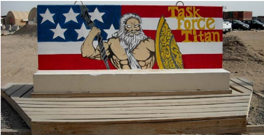
Figure 24. Unit Unknown, Task Force Titan

The 326th Area Support Group produces a barrier promoting its Task Force mission, home station, and deployment period. However, its mascot, the Jayhawk, is the central feature and garners all the attention. The University of Kansas symbol is wittily adapted with Army combat uniform, Army combat helmet, 9 mm weapon, and combat boots. The associated moniker, “Liars, Cutthroats, and Thieves,” refers to pre-Civil War guerrilla fighters known as “Jayhawkers.” In general, they were perceived as outlaws with predatory habits of the hawk, and mischievous nature of the jay bird. 75 The resulting image is a bird that might not look threatening, but will send you to meet your maker when you least expect it.