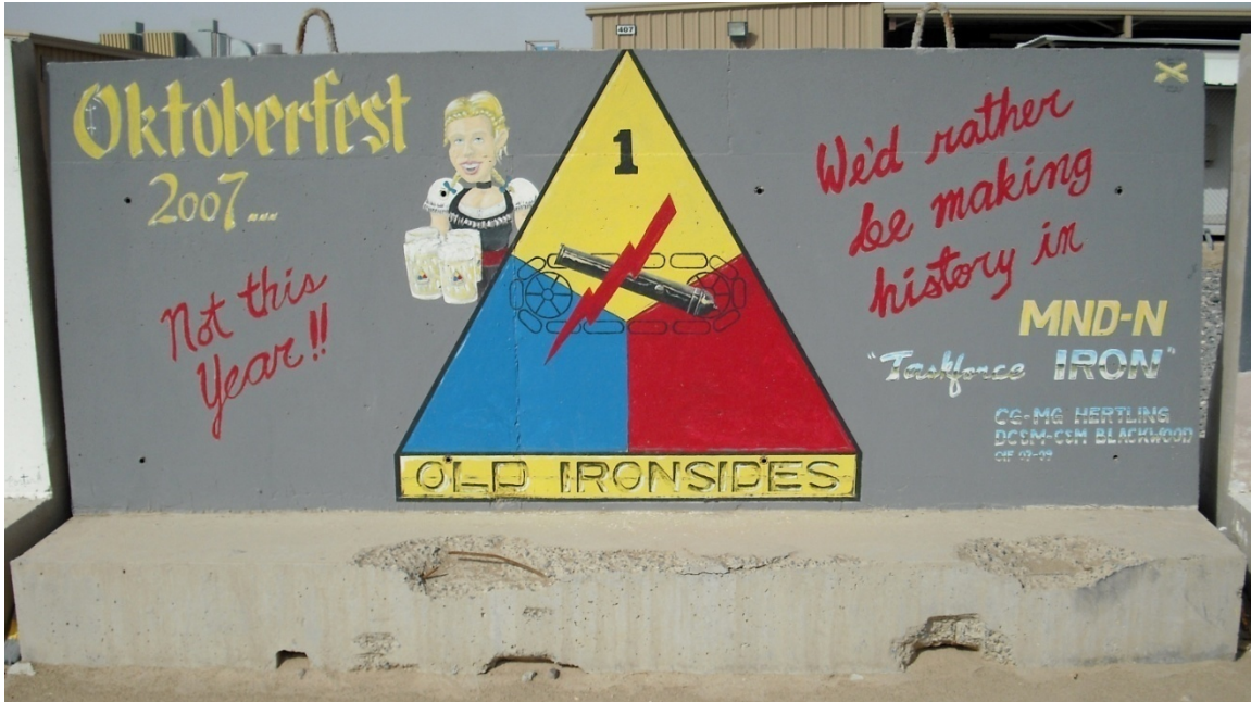
Figure 7. 1st Armored Division

A3. Unit: 1st Armored Division. Service: Army Active, Wiesbaden, Germany. Date of Deployment: 2007-2008.