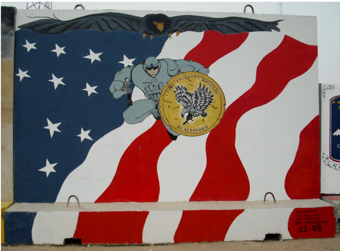
Figure 21. 172nd Infantry Brigade, V Corp United States Army Europe

The 101st Aviation Brigade arrives to theater and creates a barrier pronouncing their strength, armament, and readiness for battle. The core element of this weathered barrier is an attacking dragon, which is exactly what one would expect from a Screaming Eagles brigade. The dragon is guided by a futuristic eagle-headed warrior with missile capability in hand. Pairing the two images implies legendary military might armed with the latest in military weaponry. In sum, the barrier oozes military tradition, aggression, and attacking prowess.