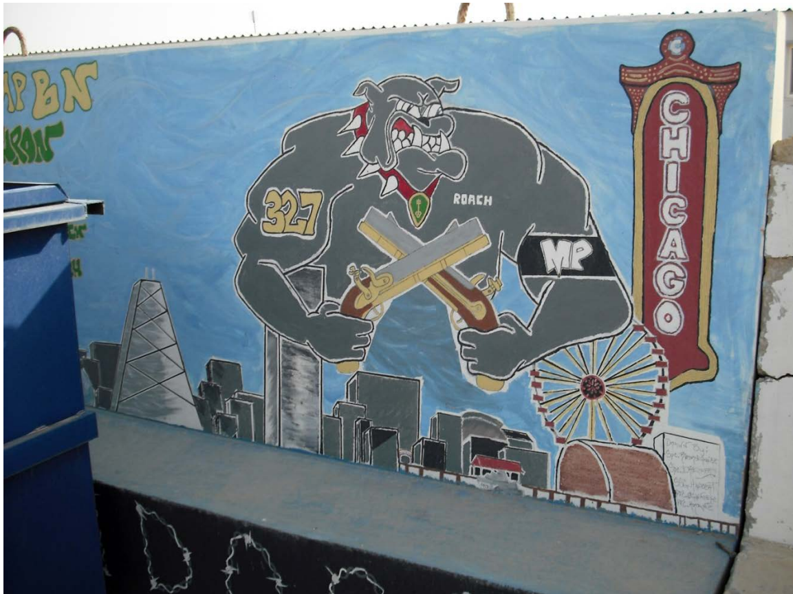
Figure 148. 327th Military Police Battalion

dark feel. In the midst of the gloom and doom an unexpected motto is written, “Be Just and Fear Not.” These ideals of courage and fairness will not be compromised by the 320th MP Company, even in the darkest of circumstances.