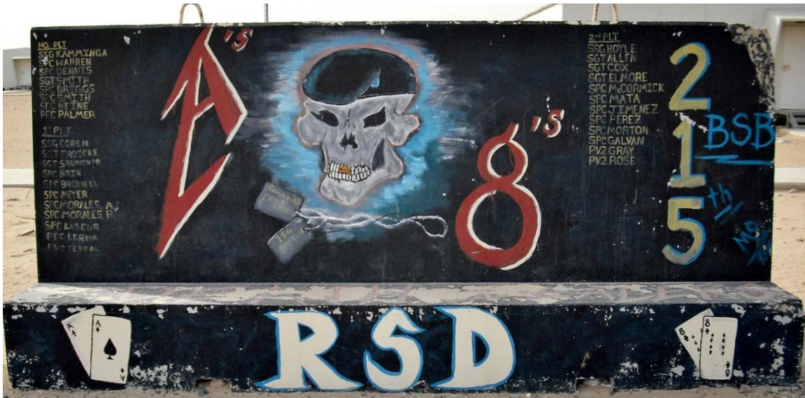
Figure 182. Reconnaissance Security Detachment, 215th Brigade Support Battalion

Q11. Unit: Reconnaissance Security Detachment, 215th Brigade Support Battalion. Service: Army Active, Fort Hood, Texas. Date of Deployment: 2006-2007.