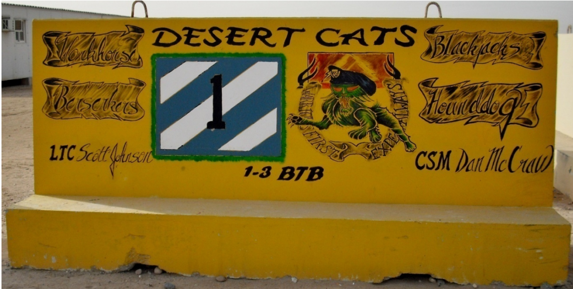
Figure 173. Special Troops Battalion, 1st Brigade Combat Team, 3rd Infantry Division

Q2. Unit: Special Troops Battalion, 1st Brigade Combat Team, 3rd Infantry Division.