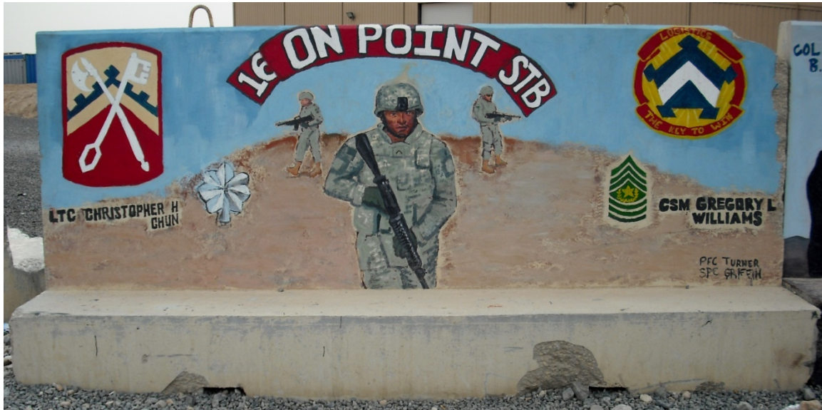
Figure 178. 16th Special Troop Battalion, 16th Sustainment Brigade

barrier a battle formation effect. As in a centuries old warfare formation, forces are positioned and ready for frontal movement against the enemy.