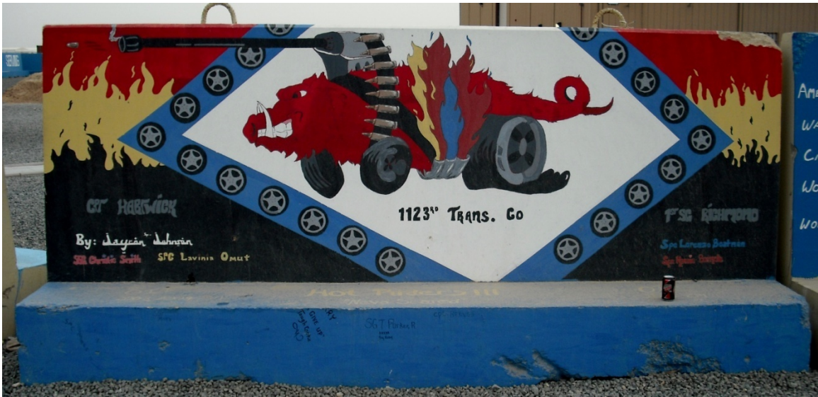
Figure 195. 1123rd Transportation Company

R7. Unit: 1123rd Transportation Company. Service: Arkansas Army National Guard. Date of Deployment: 2008-2009.