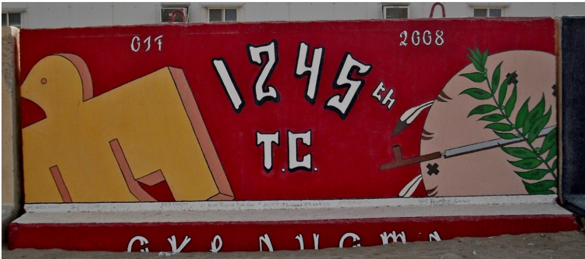
Figure 196. 1245th Transportation Company, 345th Combat Sustainment Support Battalion

R8. Unit: 1245th Transportation Company, 345th Combat Sustainment Support Battalion. Service: Oklahoma Army National Guard, Ardmore, OK. Date of Deployment: 2008.