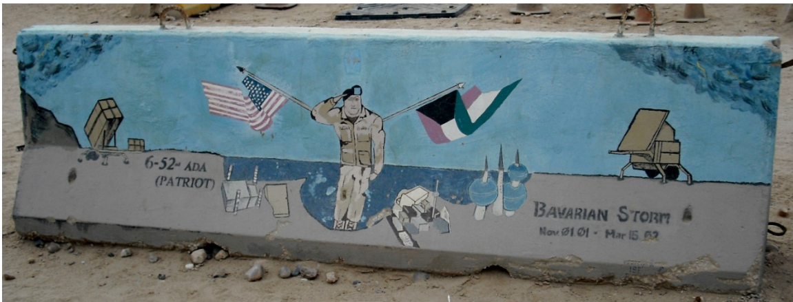
Figure 27. 6th Battalion, 52nd Air Defense Artillery Regiment (Patriot)

instead of axe. This death dealer does not guard northern forests but the Middle Eastern desert, as does the 1-1st ADA. In addition to the warrior theme, the barrier makes note of the cooperation between the United States and Kuwait. Flags of both nations are given prominence on the barrier. For any Kuwaiti who sees the barrier, it is a confirmation of American military forces as an ally and friend.