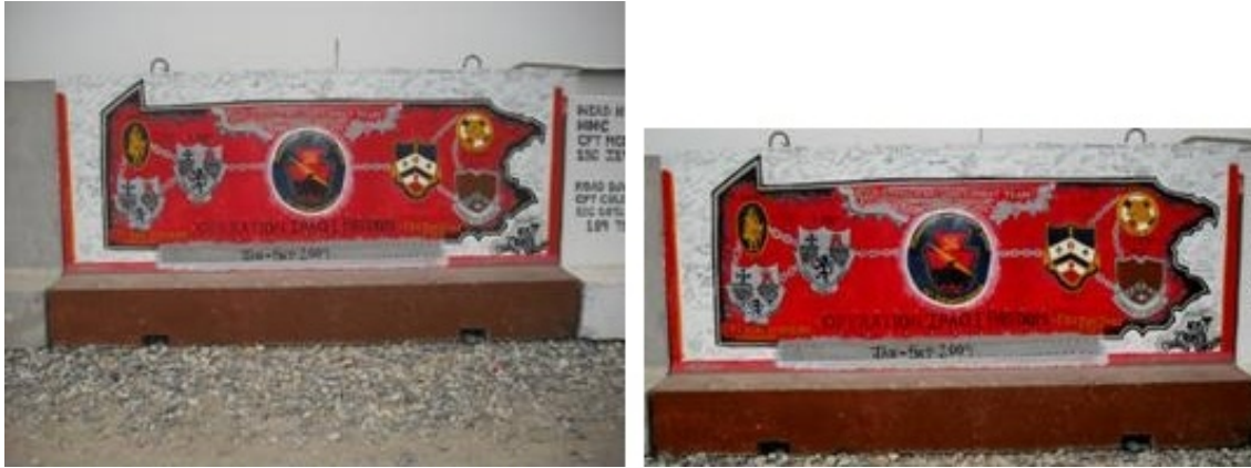
Figure 3. Photograph preparation showing before and after Step 1 completion