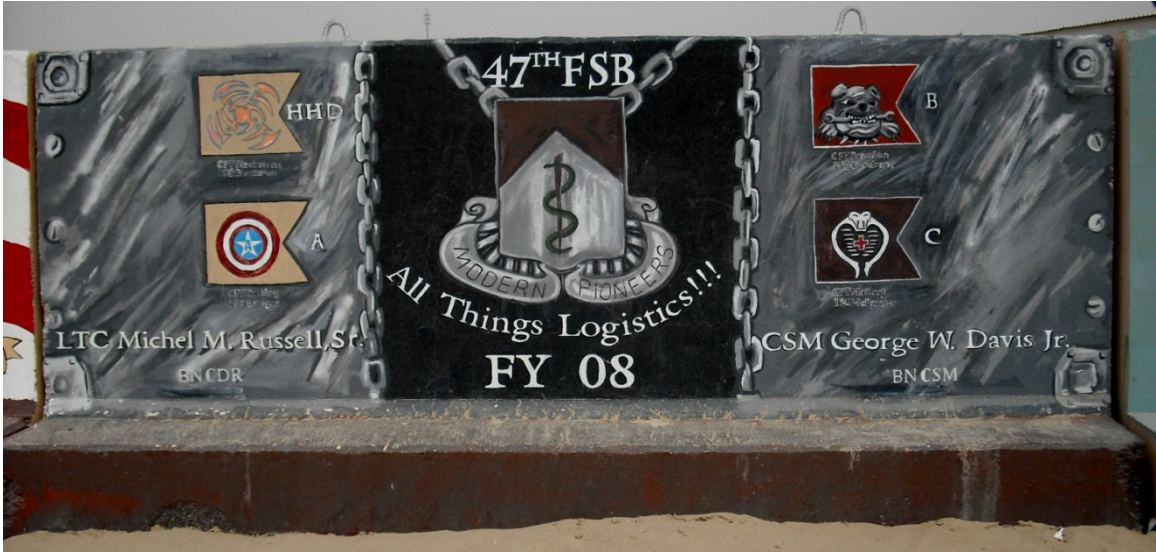
Support / Sustainment: 47th Forward Support Battalion