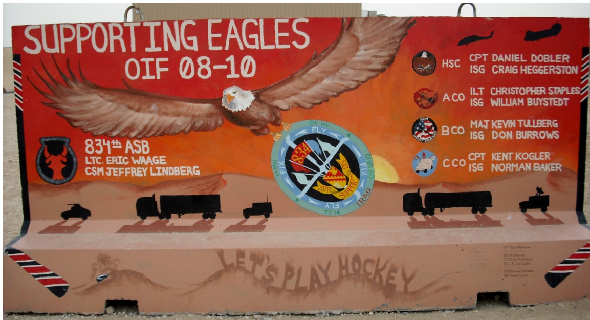
Figure 72. 834th Aviation Support Battalion, 34th Aviation Brigade

winged aircraft. In addition, the unit personalizes its Tasmanian devil with an Air Assault shoulder tattoo, demonstrating its pride in association with the 101st Airborne Division.