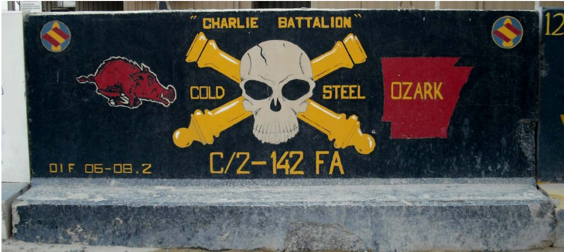
Figure 100. Battery C, 2nd Battalion, 142nd Field Artillery Regiment

killed by lightning. 81 While the image of hand with lightning bolt could merely represent artillery (lightning) as the King of Battle, it could also be employed to indicate Charlie Battery has divine favor and authority. That Charlie battery might be divinely used to unleash judgment lightning (artillery) against enemies is a third interpretation.