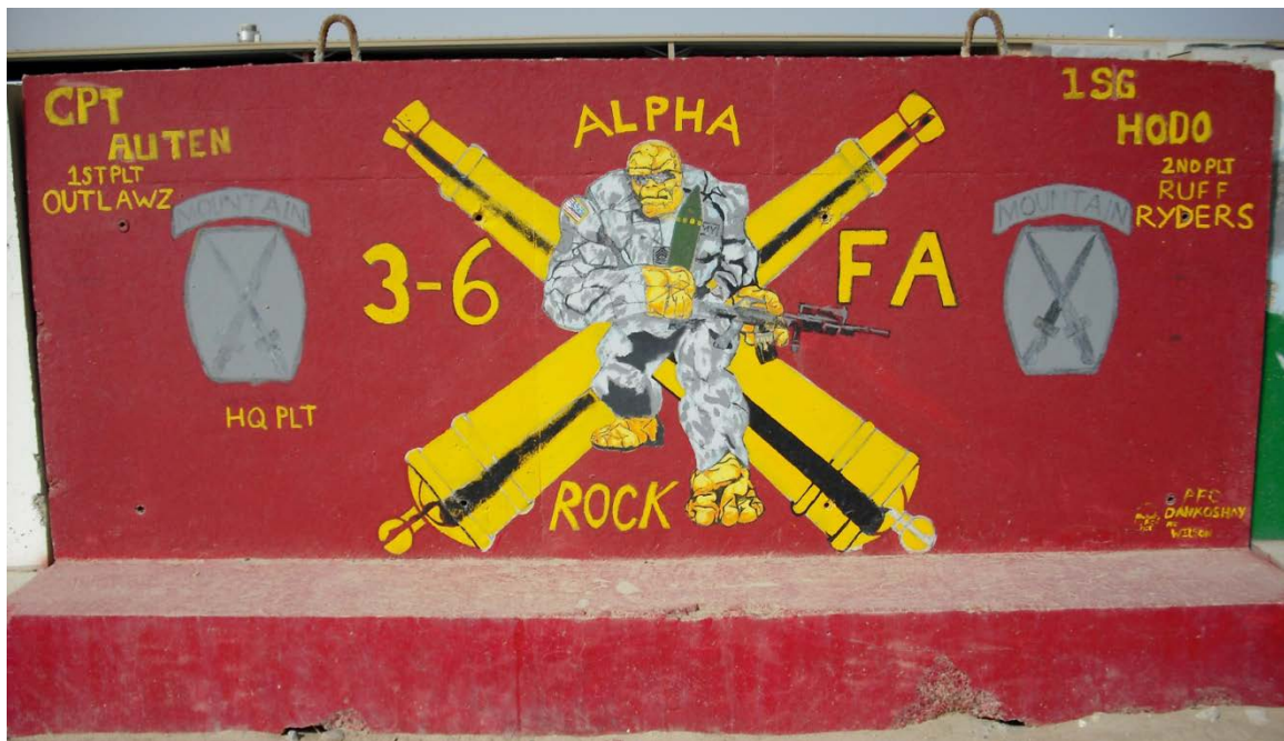
Figure 87. Battery A, 3rd Battalion, 6th Field Artillery Regiment

H1. Unit: Battery A, 3rd Battalion, 6th Field Artillery Regiment. Service: Army Active, Fort Drum, New York. Date of Deployment: 2005-2006.