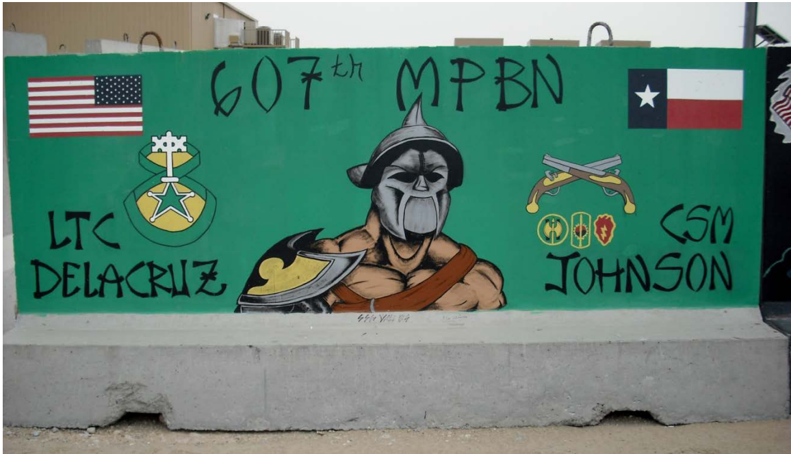
Figure 150. 607th Military Police Battalion

their enemies. These elements combined; function as a harbinger of doom for those that would oppose them.