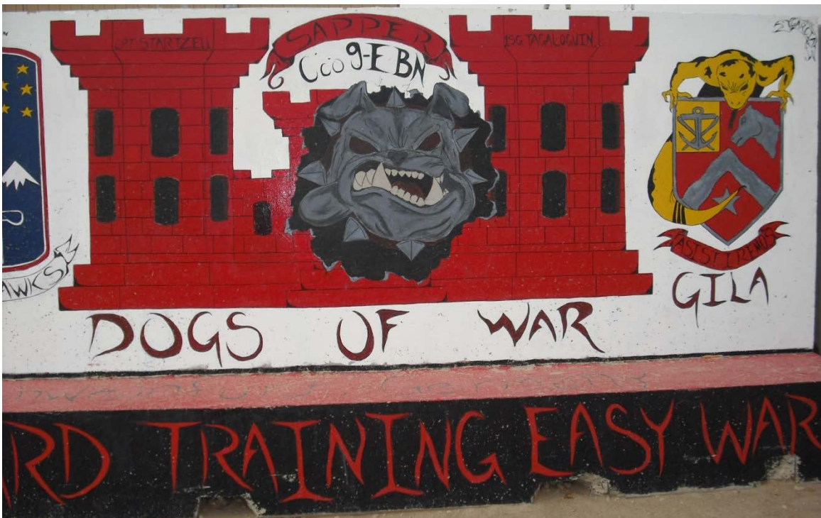
Engineer: Company C, 9th Engineer Battalion