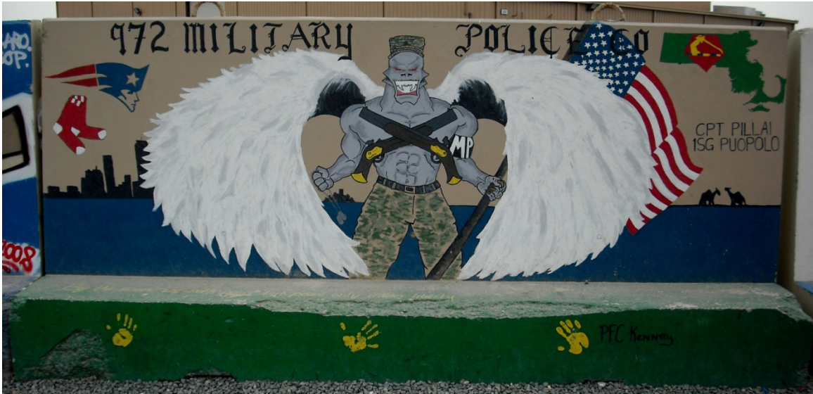
Figure 153. 972nd Military Police Company

L15. Unit: 972nd Military Police Company. Service: Massachusetts Army National Guard, Reading, MA. Date of Deployment: 2007-2008.