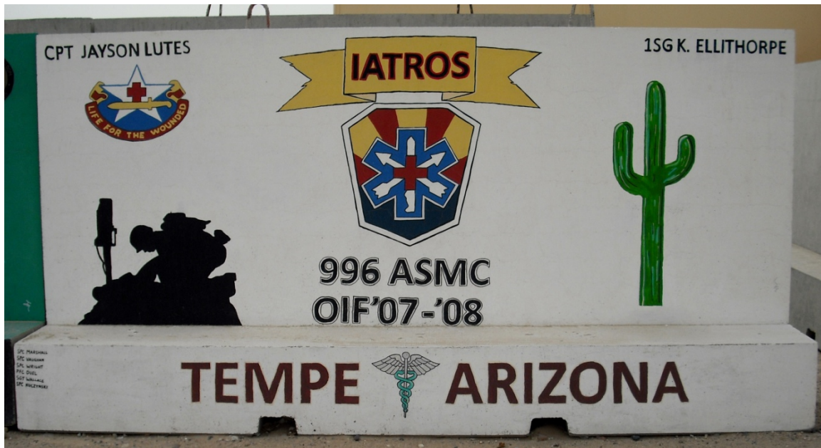
Figure 136. 996th Area Support Medical Company

is slang for the king of the pack, and is meant to indicate that the unit is at the top of its profession. In sum, this barrier captures the humor and wit that are an important part of a Soldier's resilience.