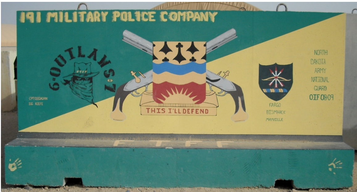
Military Police: 191st Military Police Company