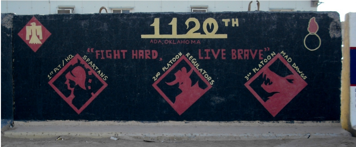
Figure 164. 1120th Maintenance Support Company, 90th Troop Command

M9. Unit: 1120th Maintenance Support Company, 90th Troop Command. Service: Oklahoma Army National Guard, Ada, OK. Date of Deployment: 2007-2008.