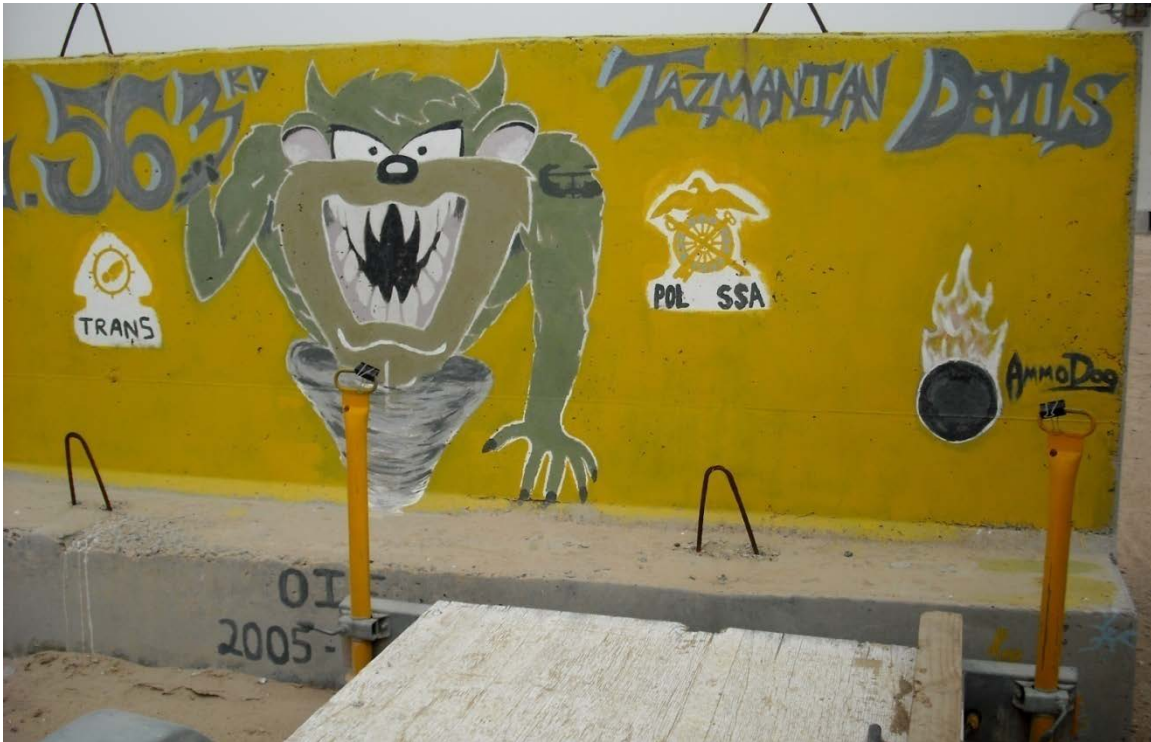
Figure 71. 563rd Aviation Support Battalion, 159th Combat Aviation Brigade

raisins in the cereal box, the 277th ASB completes the mission with an extra measure of motivation.