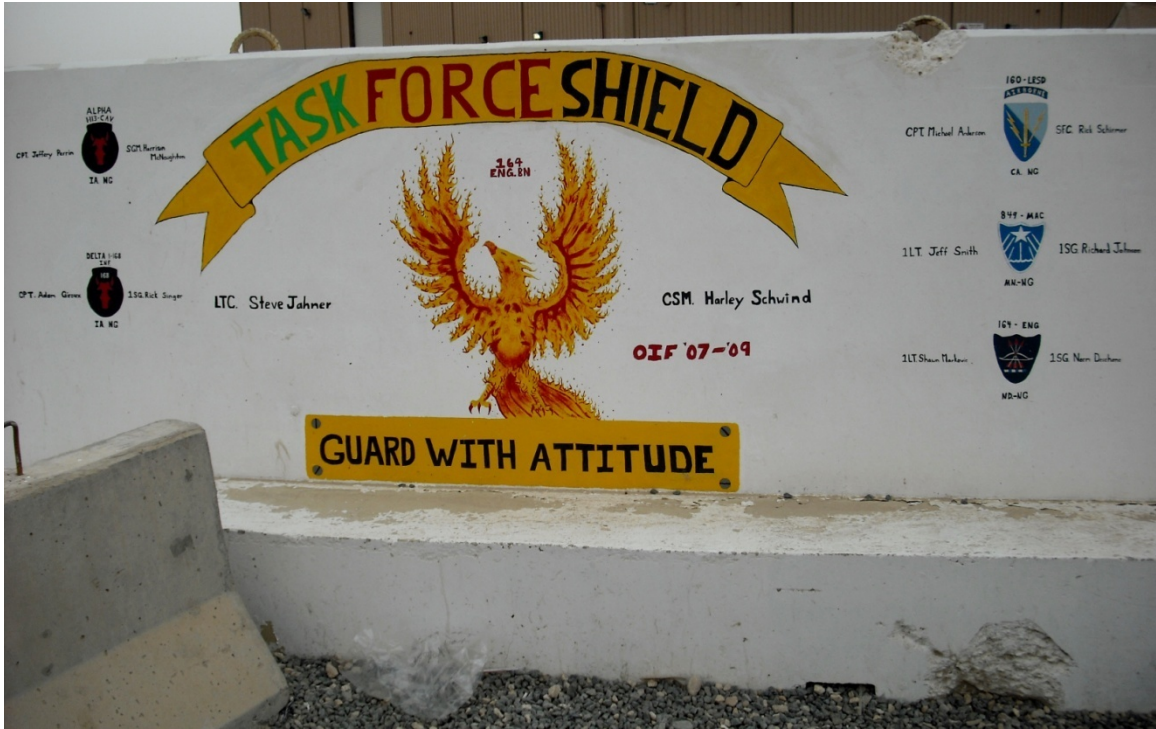
Engineer: 164th Engineer Battalion