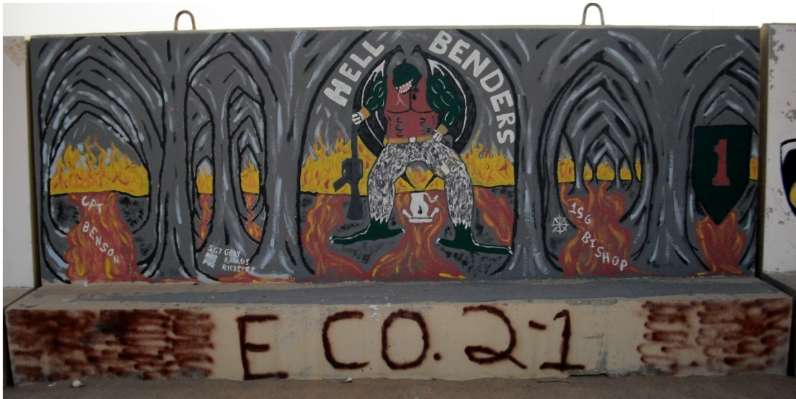
Insufficient data, unit unknown