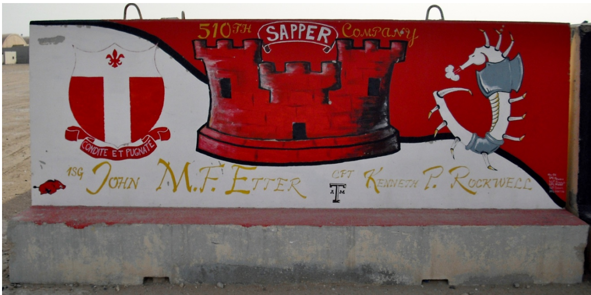
Figure 85. 510th Engineer Company, 20th Engineer Battalion

Charlie Company Soldiers from 448 th Engineer Battalion design a barrier which depicts pride in their Engineering branch and homeland of Puerto Rico. The Soldiers utilize symbols to communicate their message. With a central illustration designed to represent their home station, both lion and brick structure are images one would encounter in Ponce, Puerto Rico. The dome covered sentry box, known as a “garita,” is the unit’s insignia and represents Fort San Felipe del Morro. In addition, admiration for branch and unit is illustrated with the engineering symbol and unit crest. The unusual dark pink color was likely used due to the unavailability of red paint.