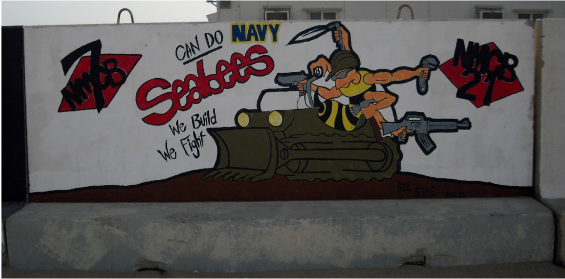
Figure 203. Navy Mobile Construction Battalions 7 and 2

strengthens the knowledge that barriers painted at Camp Buehring were true representations of America troops.