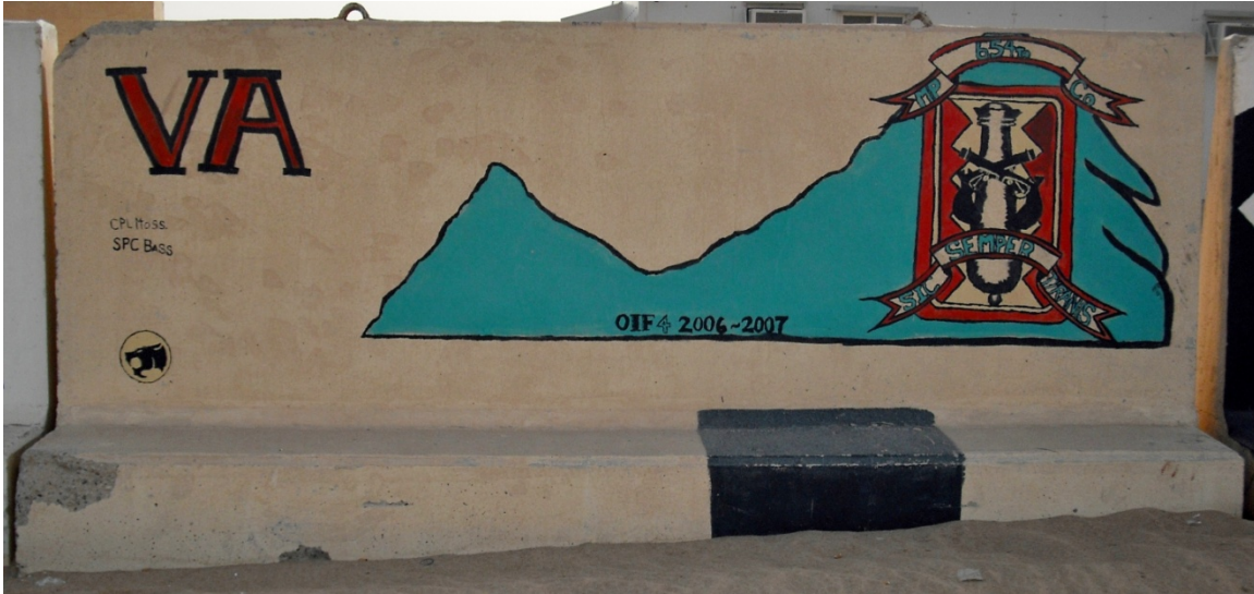
Figure 151. 654th Military Police Company

L13. Unit: 654th Military Police Company. Service: Virginia Army National Guard, Richmond, VA. Date of Deployment: 2006-2007.