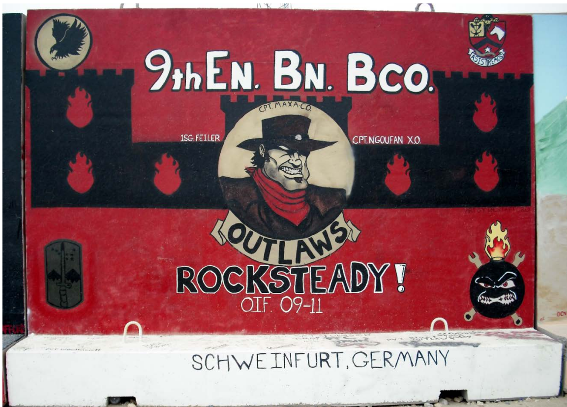
Figure 76. Company B, 9th Engineer Battalion

and Cavalry pride is especially evident with each branch receiving three symbols on the concrete canvas. The motto, “Clear the Way Essayons,” communicates the unit’s front line mission. In addition, the listing of personnel names gives honor to all unit members and demonstrates an “all for one” attitude. Further, the listing of names stresses the human element of deployment: real people are entering a battle zone and are in harm’s way.