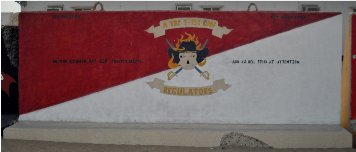
Figure 49. Troop A, 1st Squadron, 151st Cavalry Regiment

D22. Unit: Troop A, 1st Squadron, 151st Cavalry Regiment. Service: Arkansas Army National Guard, Warren, AR. Date of Deployment: 2007-2008.