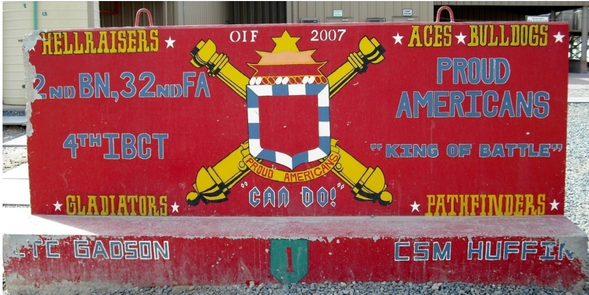
Figure 94. 2nd Battalion, 32nd Field Artillery Regiment

H8. Unit: 2nd Battalion, 32nd Field Artillery Regiment. Service: Army Active, Fort Riley, Kansas. Date of Deployment: 2007-2008.