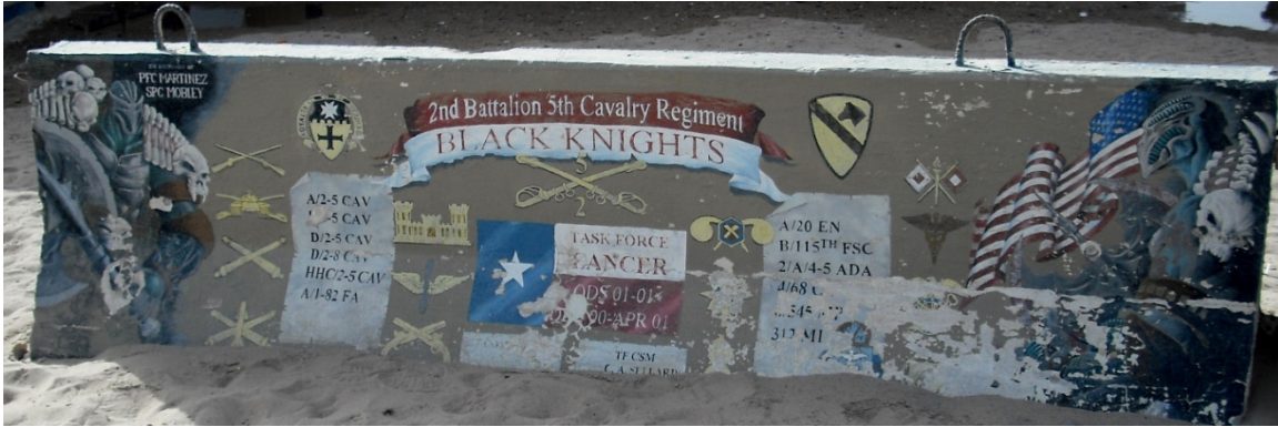
Figure 36. 2nd Battalion, 5th Cavalry Regiment

D9. Unit: 2nd Battalion, 5th Cavalry Regiment. Service: Army Active, Fort Hood, Texas. Date of Deployment: 2000-2001.