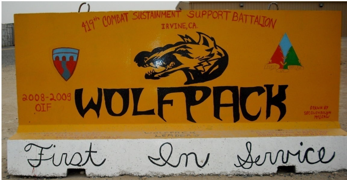
Figure 185. 419th Combat Sustainment Support Battalion, 304th Sustainment Brigade

supported with the expertly blended images of an American flag and antique typewriter keys. The illustration expresses that the glory and honor of America is directly correlated to truthful reporting. The names of the unit personnel are presented across the barrier's base and function as a sort of sworn witness, upholding the values stated above.