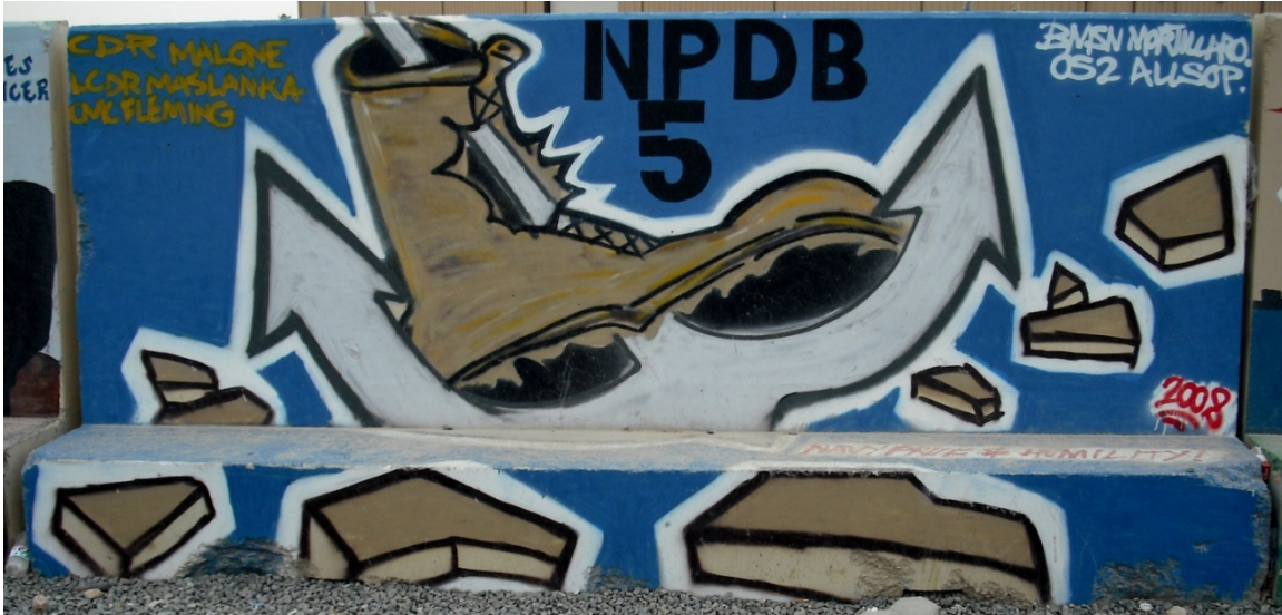
Figure 202. Navy Provisional Detainee Battalion V

T3. Unit: Navy Provisional Detainee Battalion V. Service: U.S. Navy. Date of Deployment: 2008-2009.