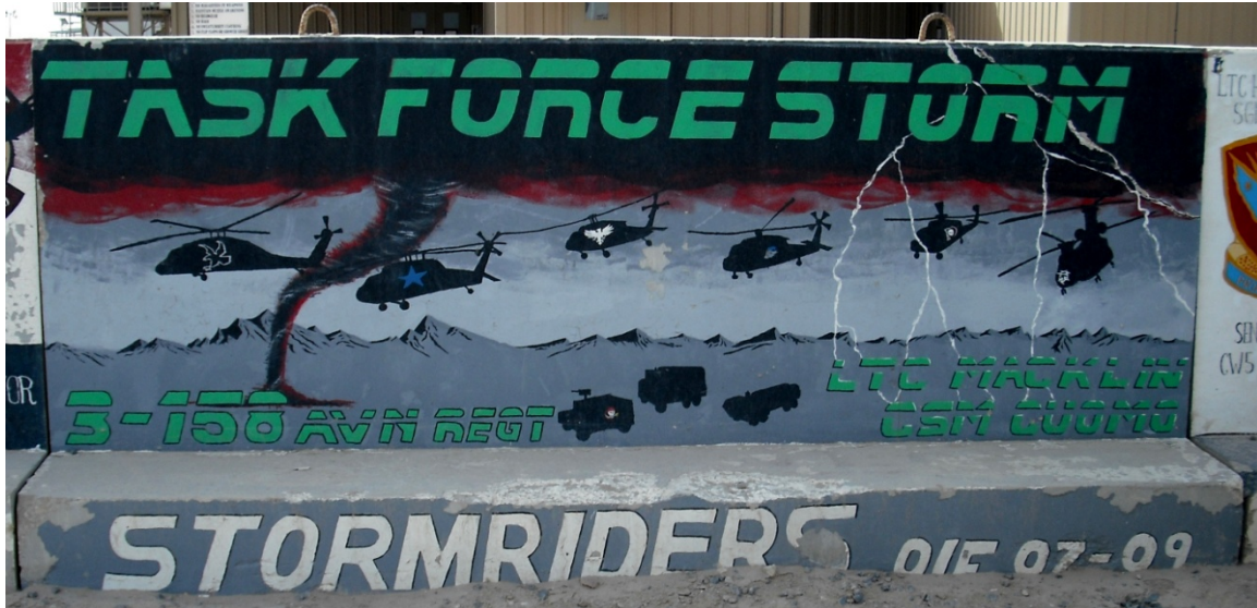
Figure 63. 3rd Battalion, 158th Aviation Regiment

E13. Unit: 3rd Battalion, 158th Aviation Regiment. Service: Army Active, Ansbach, Germany. Date of Deployment: 2007-2008.