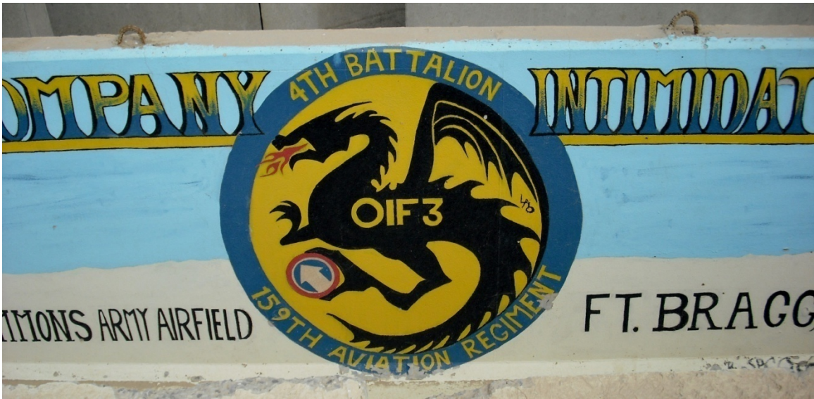
Figure 65. 4th Battalion, 159th Aviation Regiment

E15. Unit: 4th Battalion, 159th Aviation Regiment. *Incomplete photo Service: Army Active Fort Bragg, North Carolina. Date of Deployment: 2005.