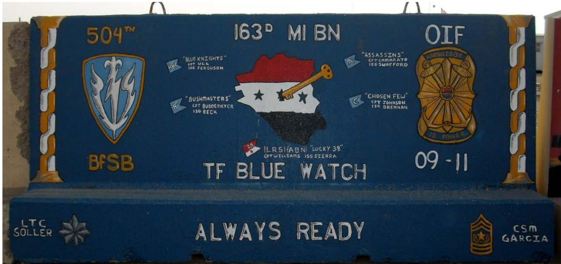
Figure 137. 163rd Military Intelligence Battalion

K1. Unit: 163rd Military Intelligence Battalion. Service: Army Active, Fort Hood, Texas. Date of Deployment: 2009-2010.