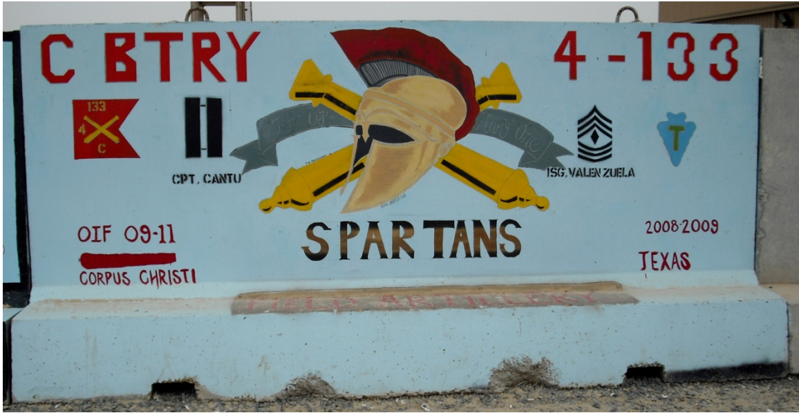
Field Artillery: Battery C, 4th Battalion, 133rd Field Artillery Regiment