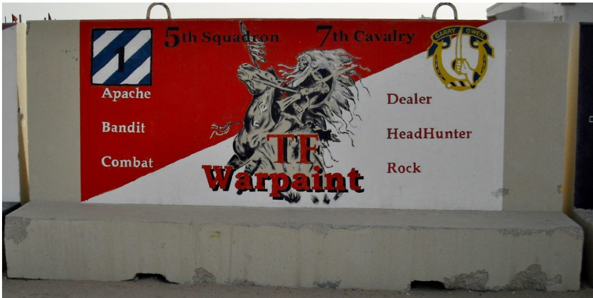
Figure 38. 5th Squadron, 7th Cavalry Regiment

11. Unit: 5th Squadron, 7th Cavalry Regiment. Service: Army Active, Fort Stewart, Georgia. Date of Deployment: 2008-2009.