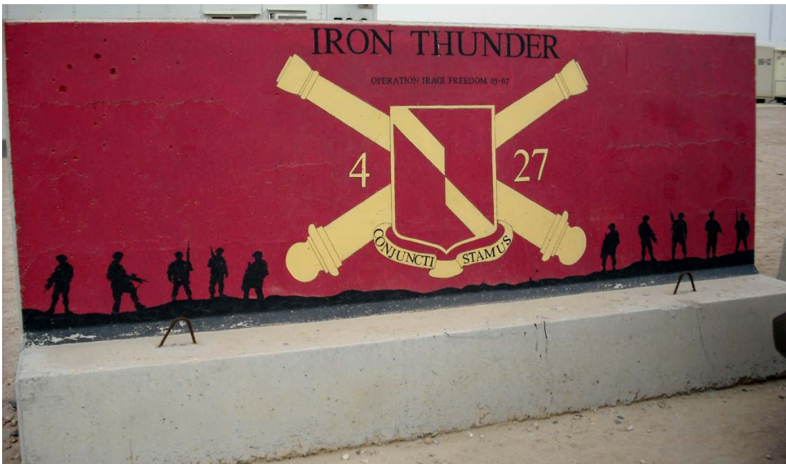
Field Artillery: 4th Battalion, 27th Field Artillery Regiment