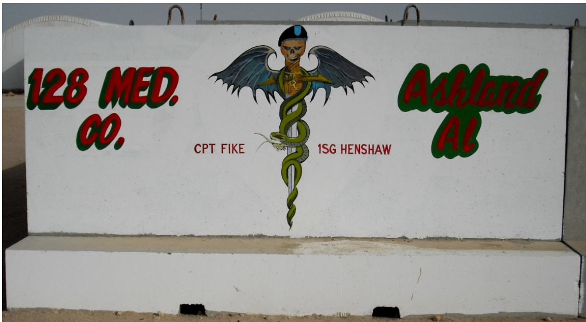
Figure 127. 128th Medical Company (Ground Ambulance)

The 86th Combat Support Hospital from Kentucky announces its mission, Area of Operations, branch, unit patch and deployment period. This barrier has three central images which vie for attention. On the left, a map of Iraq illustrates the 86th CSH's dual areas of responsibility. On the right, the 44th Medical Brigade patch shows higher headquarters. The center area is dedicated to the 86th CSH's medical mission with a medical image that includes both the Red Cross and Red Crescent. The inclusion of both symbols portrays the ethical norms of American warfare. Medical care is provided to those in need regardless of political or religious affiliation and the 86th CSH proclaims this as one of their central values.