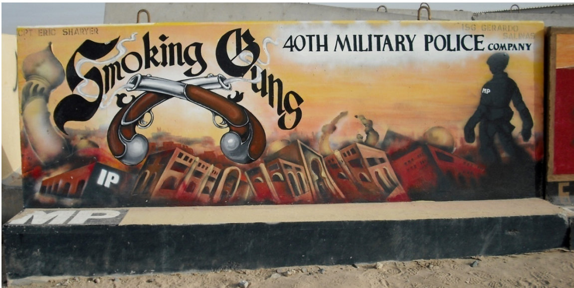
Figure 139. 40th Military Police Company

L1. Unit: 40th Military Police Company. Service: California Army National Guard. Date of Deployment: 2008-2009.