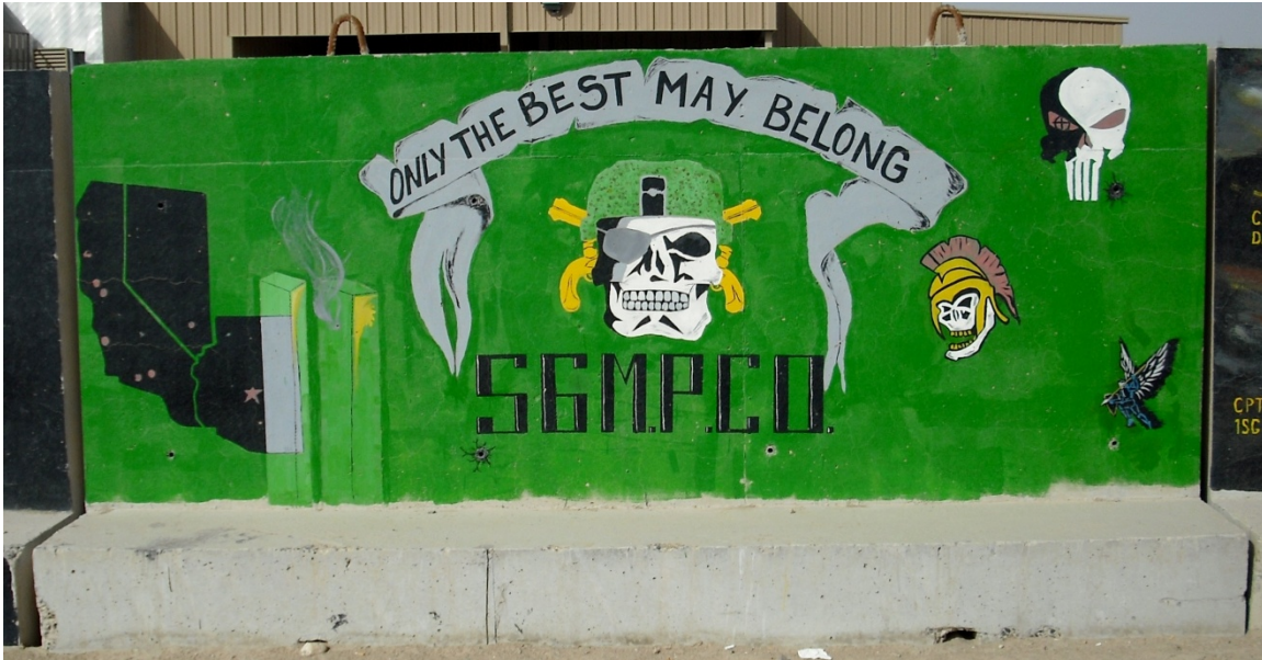
Figure 140. 56th Military Police Company

crossed pistols indicate the MP Soldier is an experienced gunslinger and prepared to face the challenges ahead. Use of the Iraqi Police “IP” symbol likely indicates the 40th MP unit will be partnering with and training the Iraqi force. In sum, the barrier is the 40th MP Company’s declaration that they are confident and prepared for their mission.