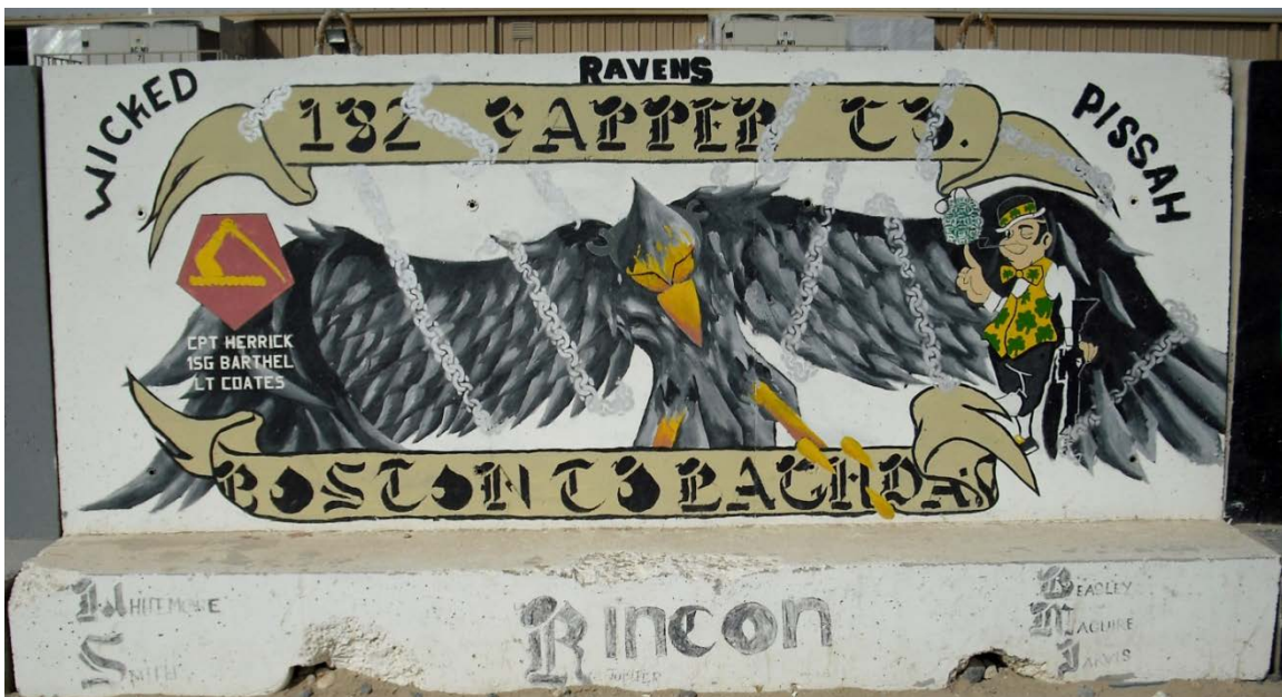
Figure 81. 182nd Engineer Company, 101st Engineer Battalion

The centrally placed unit mascot is the “gallito de pelea,” or fighting rooster, illustrated in the posture of attack. Like the fighting rooster, this unit is prepared to fearlessly face the enemy mano-a-mano. Of final note, this barrier has a remarkable folk art appeal, due to its homeland cultural themes and freehand lettering style.