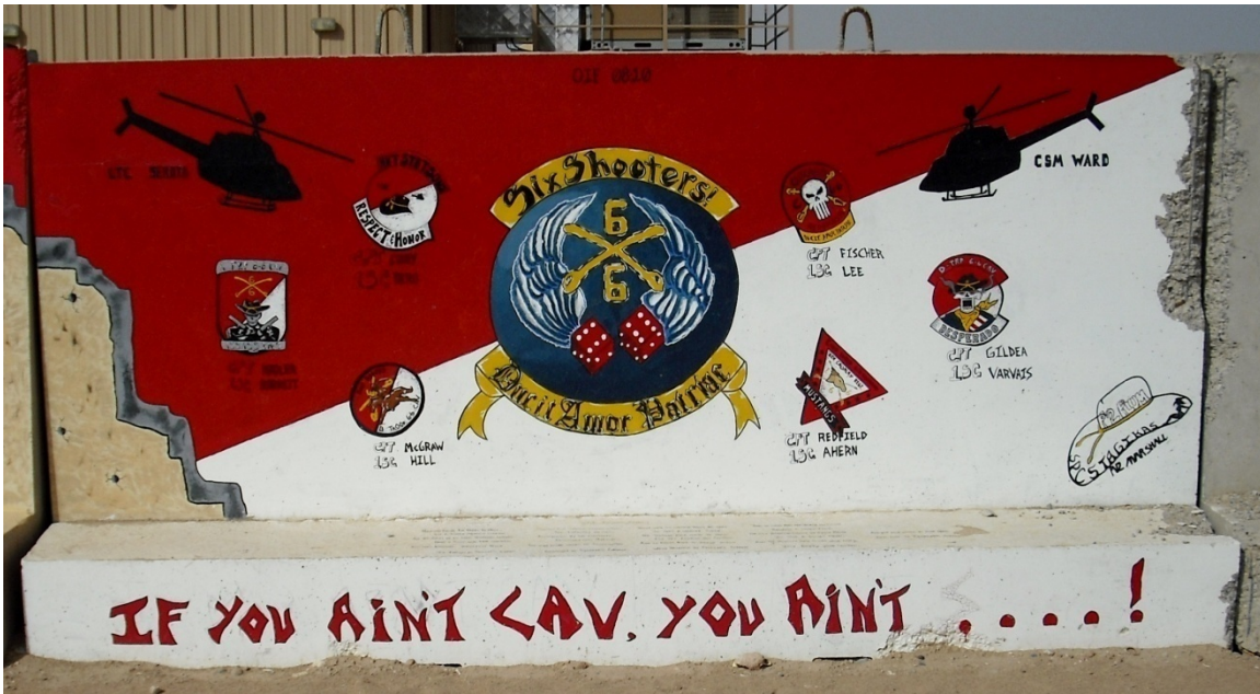
Figure 37. 6th Squadron, 6th Cavalry Regiment

D10. Unit: 6th Squadron, 6th Cavalry Regiment. Service: Army Active, Fort Drum, New York. Date of Deployment: 2008-2009.