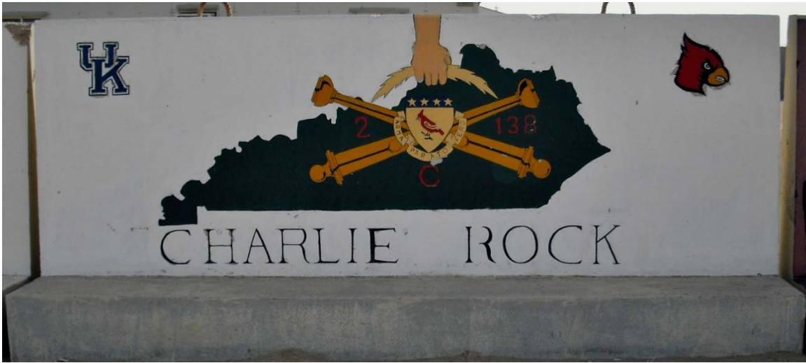
Figure 99. Battery C, 2nd Battalion, 138th Field Artillery Regiment

H13. Unit: Battery C, 2nd Battalion, 138th Field Artillery Regiment. Service: Kentucky Army National Guard. Date of Deployment: 2007-2008.