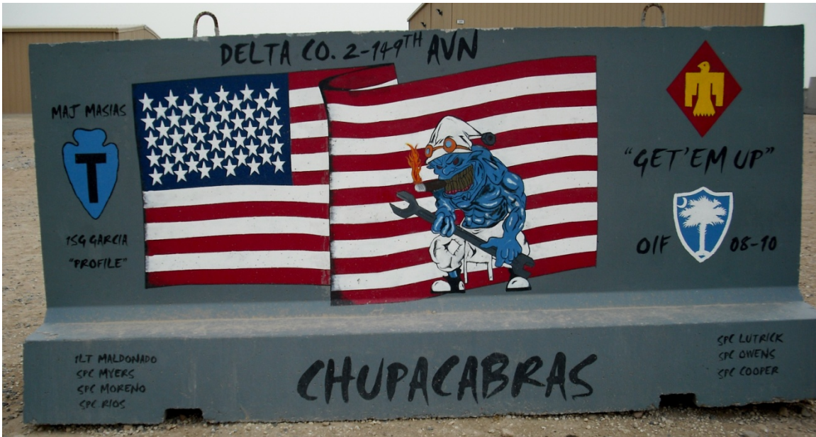
Figure 62. Company D, 2nd Battalion, 149th Aviation Regiment

E12. Unit: Company D, 2nd Battalion, 149th Aviation Regiment. Service: Texas Army National Guard (with Oklahoma and South Carolina). Date of Deployment: 2008-2009.