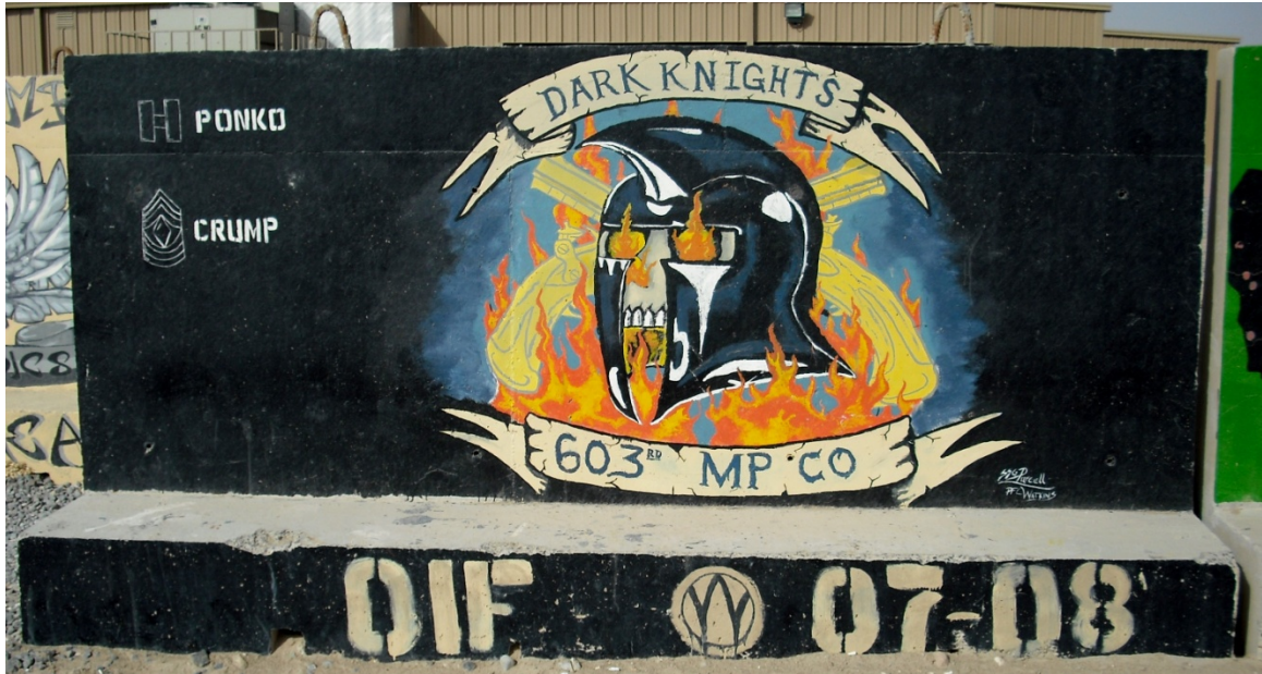
Figure 149. 603rd Military Police Company

Chicago. The image sends two messages to the viewer. First, the Illinois unit has risen from the rough, mean streets of the Windy City and has earned a reputation of experience and capability. Second, the representation of a heavily muscled bulldog implies the unit is strong, skilled, and ready to take a bite out of crime.