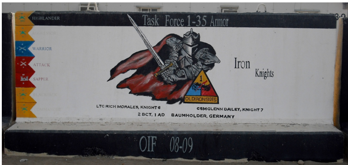
Figure 28. 1st Battalion, 35th Armored Regiment

D1. Unit: 1st Battalion, 35th Armored Regiment. Service: Army Active, Baumholder, Germany. Date of Deployment: 2008-2009.