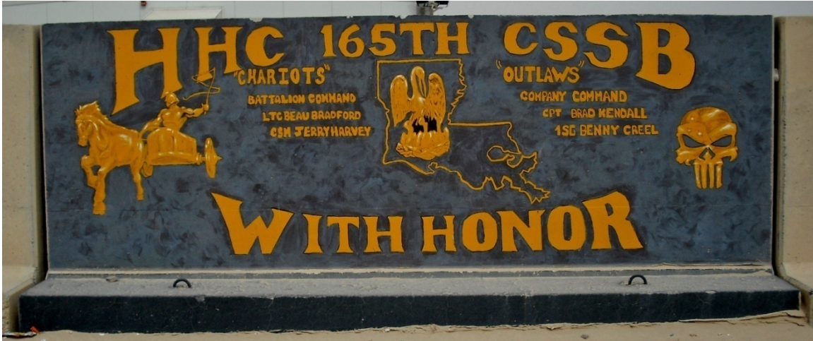
Figure 181. Headquarters, Headquarters Company, 165th Combat Support Sustainment Battalion

Q10. Unit: Headquarters, Headquarters Company, 165th Combat Support Sustainment Battalion.