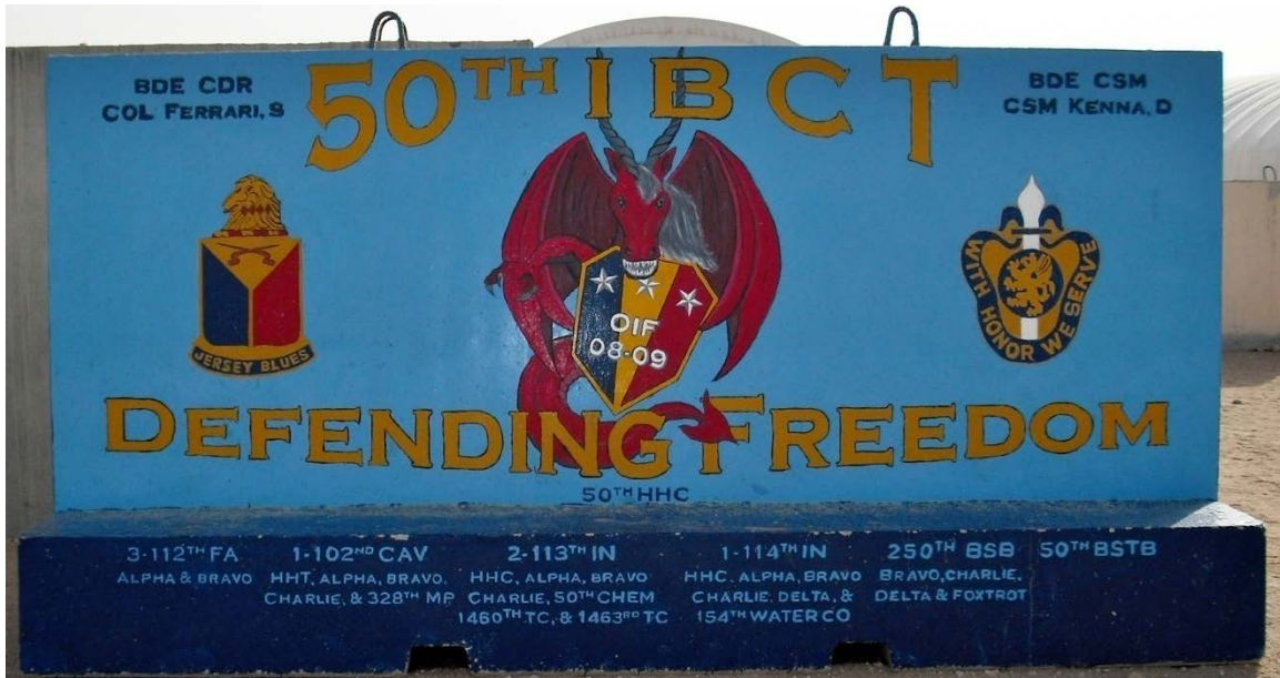
Figure 17. Headquarters, Headquarters Company, 50th Infantry Brigade Combat Team

A13. Unit: Headquarters, Headquarters Company, 50th Infantry Brigade Combat Team. Service: New Jersey Army National Guard, Lawrenceville, NJ. Date of Deployment: 2008-2009.