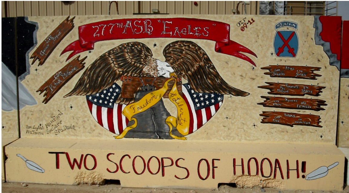
Figure 70. 277th Aviation Support Battalion, 10th Aviation Brigade

either side of the desert vista. It is likely that they once displayed names of unit personnel that have now faded in the desert sun.