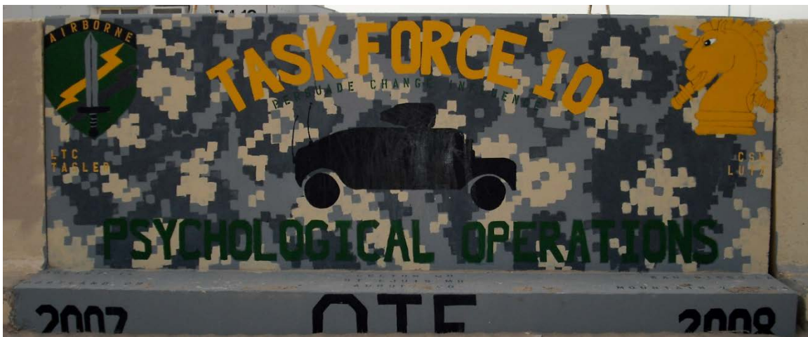
Figure 167. 10th Psychological Operations Battalion

larger scale giving it a hovering, three dimensional appearance. The combination of images is suggestive of a boots on the ground type of unit that conducts dangerous work in adept manner. The unit motto on the barrier's base is a psychological reference in Latin which reads, "Mu Undus Vult Decipi," meaning "the world wants to be deceived." 85 The quote helps to illustrate the unit's difficult and tenuous task of operating upon the battlefield of the mind.