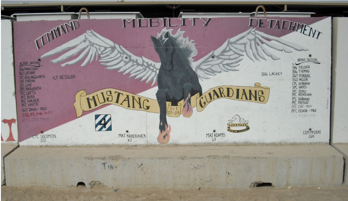
Figure 46. Command Mobility Detachment, 6th Squadron, 8th Cavalry Regiment

D19. Unit: Command Mobility Detachment, 6th Squadron, 8th Cavalry Regiment. Service: Army Active. Fort Stewart, Georgia. Date of Deployment: 2007-2008.