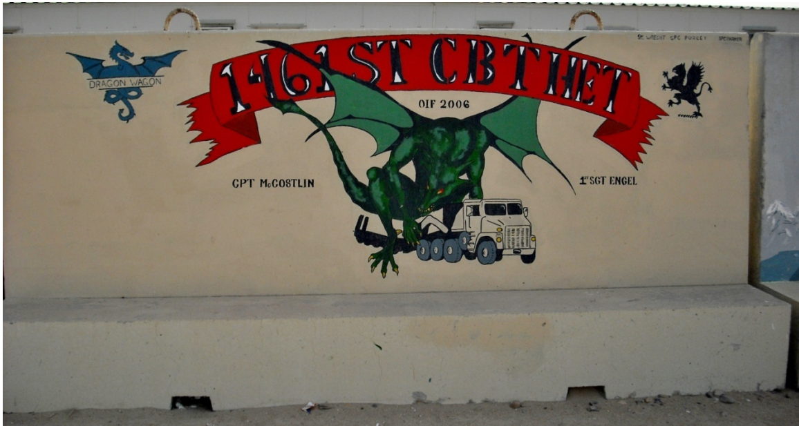
Figure 197. 1461st Combat Heavy Equipment Transport, 246th Transportation Battalion

on the barrier's face, the inclusion of all personnel autographs on the lower base speak of commonality and unity in Company and mission.