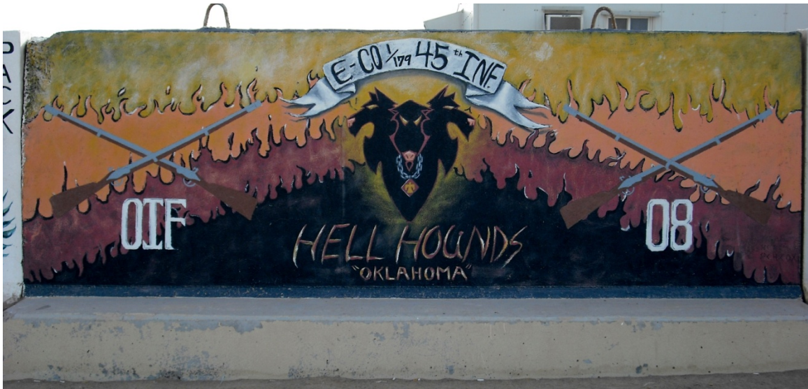
Figure 115. Company E, 1st Battalion, 179th Infantry Regiment

I13. Unit: Company E, 1st Battalion, 179th Infantry Regiment. Service: Oklahoma Army National Guard, Stillwater, OK. Date of Deployment: 2007-2008.