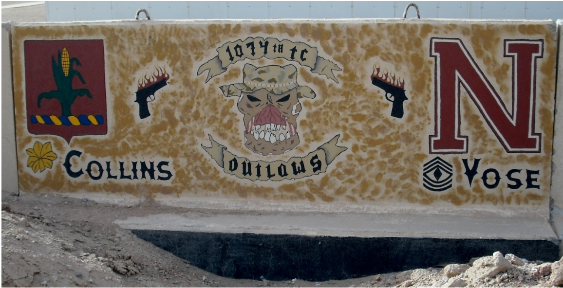
Figure 194. 1074th Transportation Company

R6. Unit: 1074th Transportation Company. Service: Nebraska Army National Guard. Date of Deployment: 2006-2007.