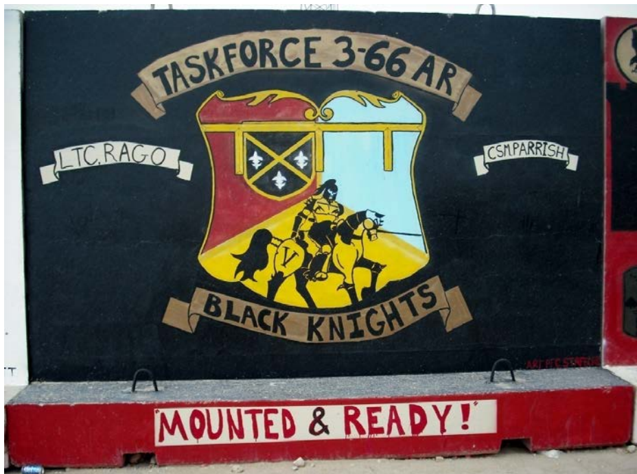
Figure 29. 3rd Battalion, 66th Armored Regiment

centrally placed knight against a white background giving the viewer the impression that an honorable and capable defender is running into battle. In addition, this knight brings a legacy of experience with him into battle. He fights under the banner of Old Ironsides, the historic 1st Armored Division. Further, the knight has strength and endurance as indicated by the manner in which “Iron Knights” is given prominence and the word “Iron” appears in a larger font above the word “Knights.” Overall, the knight theme indicates the unit’s warrior spirit. The companies are listed as well and demonstrate the size of the fighting force.