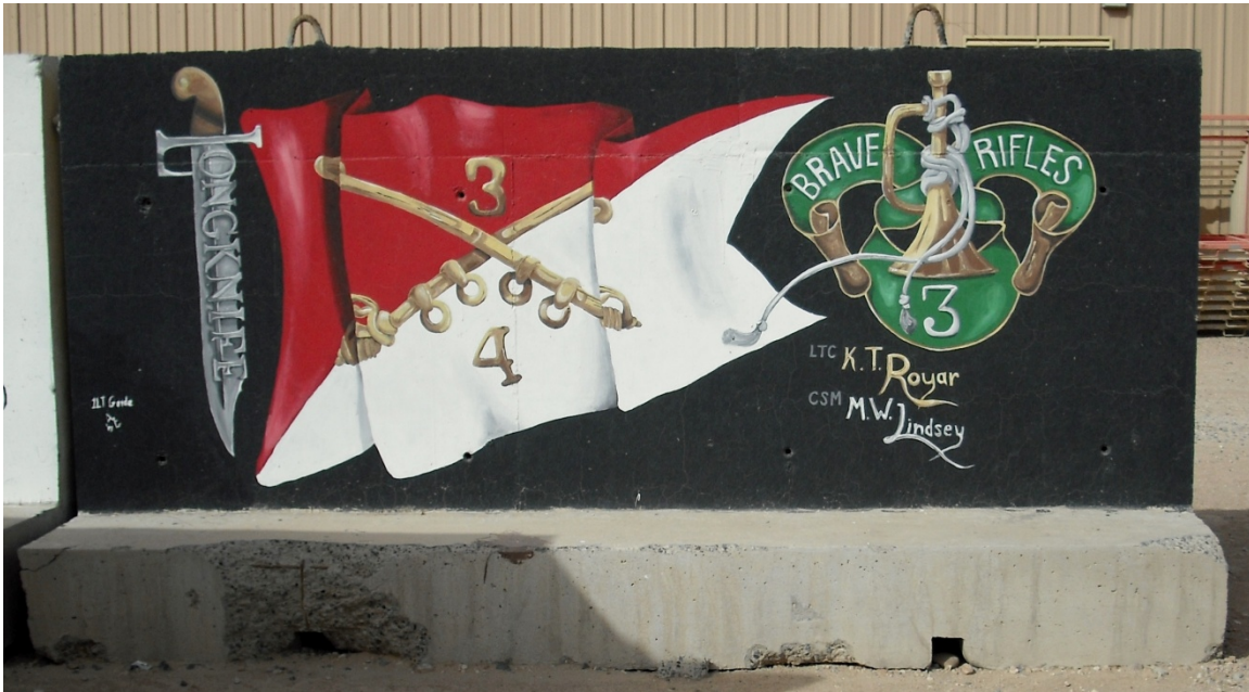
Figure 35. 4th Squadron, 3rd Cavalry Regiment

authority are acquired: “Brave Rifles! Veterans! You have been baptized by fire and blood and have come out steel.”