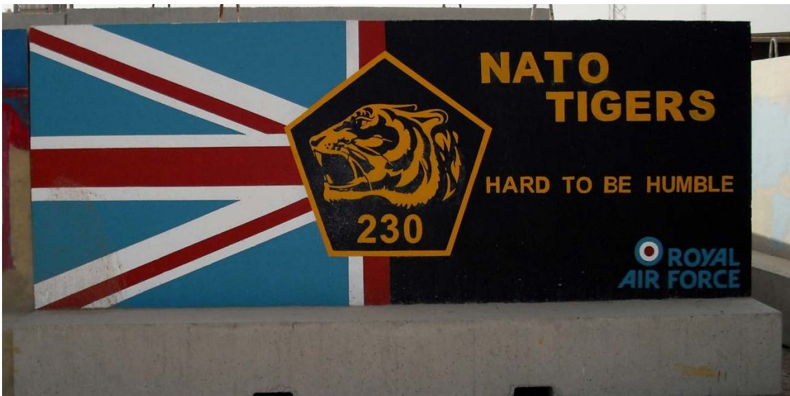
England (NATO): Royal Air Force