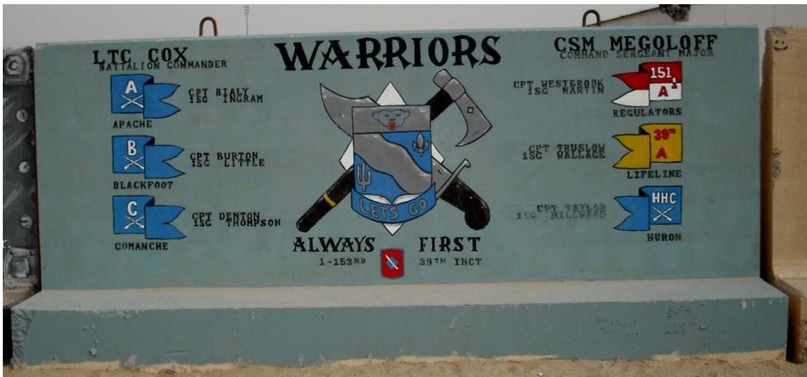
Figure 110. 1st Battalion, 153rd Infantry Regiment

The 1st Battalion, 149th Infantry Regiment’s barrier packs a strong patriotic and military punch with a design that features the unit’s motto, moniker, infantry branch, and command team. All of the images are centrally placed and cleverly layered one upon another. Starting from the back and moving forward one finds a star, crossed rifles, American flag, unit identification, eagle, unit moniker “Mountain Warrior,” and unit motto “Defending Freedom,” upon a stark white background. Such layering provides the message that the 1-149th positions itself as fighter and defender of our Nation. Portraying itself as the eagle that carries the American flag in time of battle, this unit declares a patriotic spirit that runs deep.