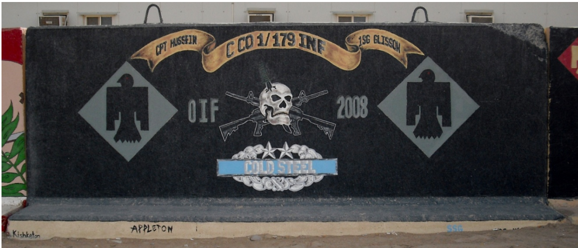
Figure 113. Company C, 1st Battalion, 179th Infantry Regiment

I11. Unit: Company C, 1st Battalion, 179th Infantry Regiment. Service: Oklahoma Army National Guard, Edmond, OK. Date of Deployment: 2007-2008.