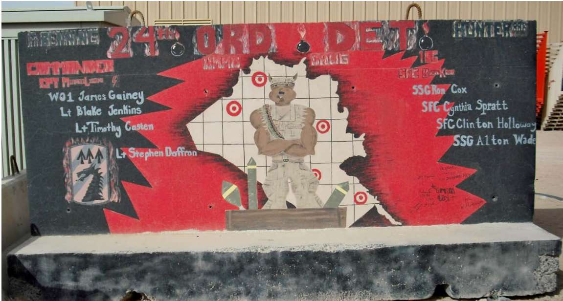
Figure 156. 24th Ordnance Company (Detachment)

M1. Unit: 24th Ordnance Company (Detachment). Service: Army Active, Fort Stewart, Georgia. (Fort Benning, Hunter Airfield) Dates of Deployment: 2007-2009.