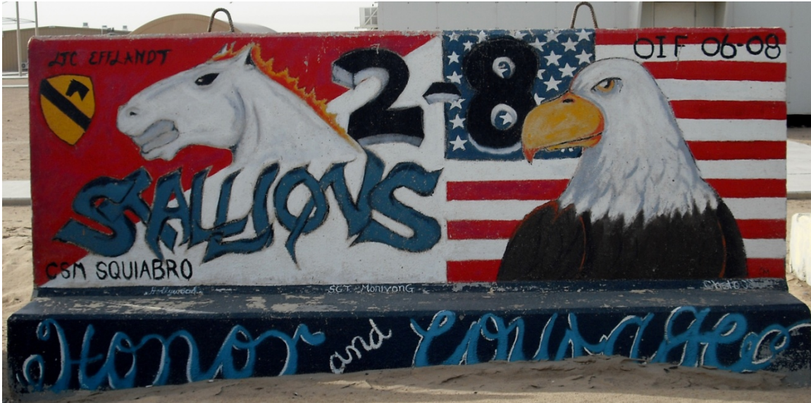
Figure 39. 2nd Battalion, 8th Cavalry Regiment

D12. Unit: 2nd Battalion, 8th Cavalry Regiment. Service: Army Active, Fort Hood, Texas. Date of Deployment: 2006-2008.