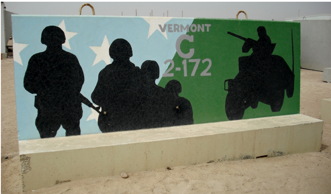
Figure 31. Company C, 2nd Battalion, 172nd Armor Regiment

Frank Frazetta’s iconic “Death Dealer.” The unit puts forth the imposing image of horse and rider to illustrate their battle readiness. The large axe, shield, Arabic writing, and the harsh desert panorama communicate that this death dealer is not to be trifled with. The motto “Treat ‘Em Rough” affirms the warrior’s dominant posture over the enemy. Further, words are translated to Arabic so that nothing will be lost in translation for non-English readers.