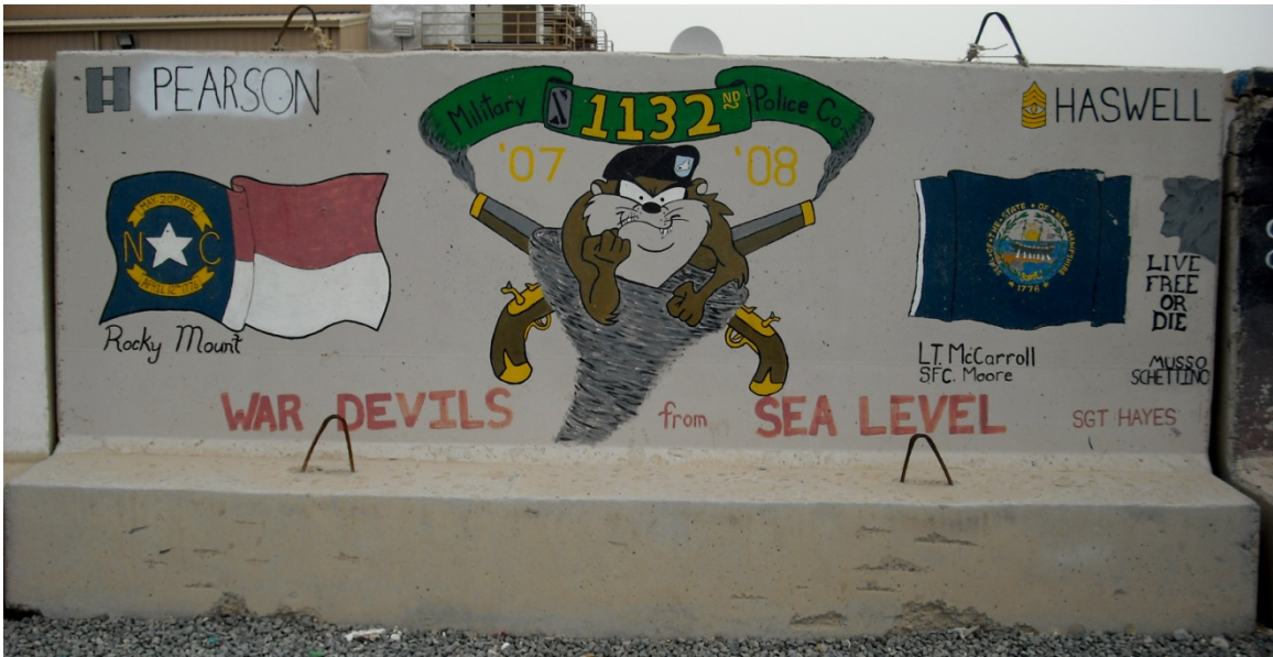
Figure 155. 1132nd Military Police Company

L17. Unit: 1132nd Military Police Company. Service: North Carolina Army National Guard (with New Hampshire). Date of Deployment: 2007-2008.