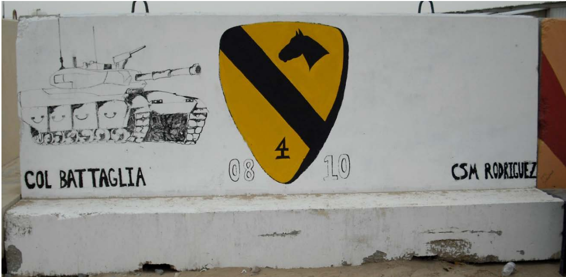
Figure 11. 4th Brigade Combat Team

A7. Unit: 4th Brigade Combat Team. Service: Army Active, Fort Hood, Texas. Date of Deployment: 2008-2009.