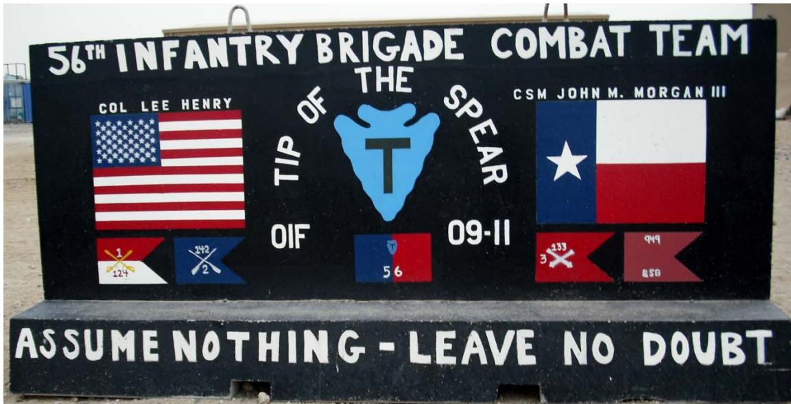
Figure 18. 56th Infantry Brigade Combat Team, 36th Infantry Division

fighters of freedom. The blue color emphasis identifies the Combat Team with its home station and nickname, Jersey Blues. 74