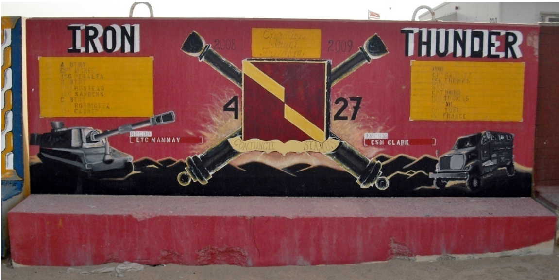
Figure 93. 4th Battalion, 27th Field Artillery Regiment

H7. Unit: 4th Battalion, 27th Field Artillery Regiment. Service: Army Active, Baumholder, Germany. Date of Deployment: 2008-2009.