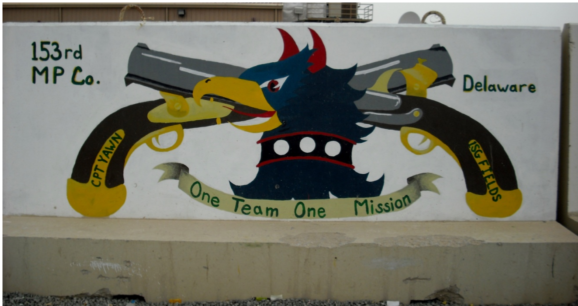
Figure 141. 153rd Military Police Company

Looking to the future, the 56th shows its battle readiness. The unit moniker is a skull with eye patch. Behind the skull are crossed pistols. The imagery conveys a battle tested pirate with its crew of three skull and death bearing platoons. These platoons are represented by monikers of a Punisher skull, Spartan skull, and skull-headed angel. In sum, this barrier reminds the viewer that as Soldiers entered Operation Iraqi Freedom, the events of September 11, 2001 were not forgotten. Soldiers were prepared to respond in defense of America.