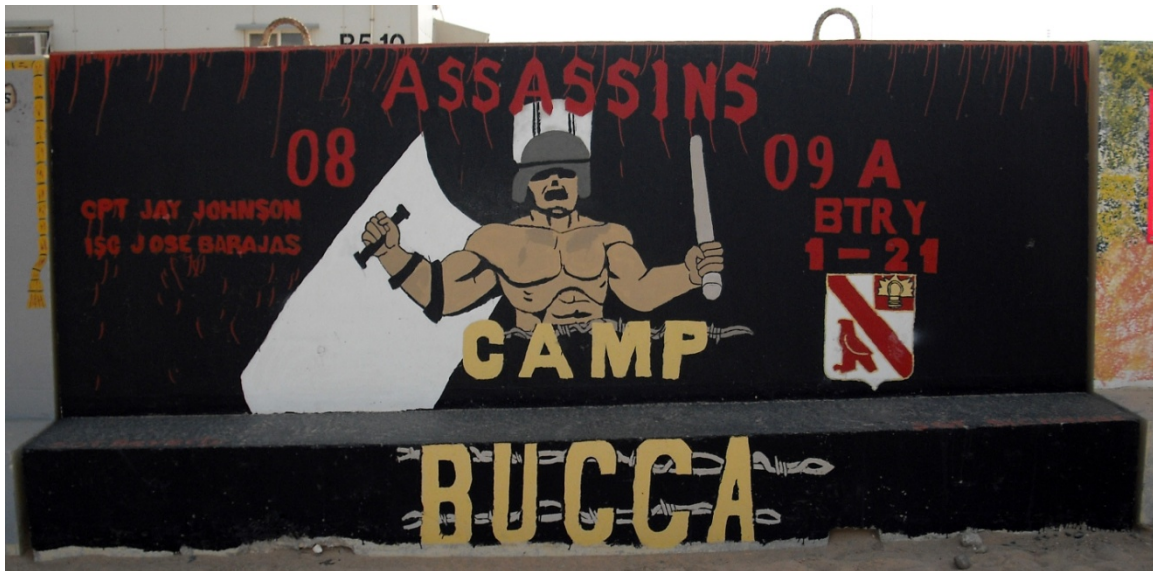
Figure 91. Battery A, 1st Battalion, 21st Field Artillery Regiment

The Service Battery from 1st Battalion, 7th Field Artillery Regiment presents a graffiti style barrier to publicize its unit identification, moniker, higher organization, and home station. The skull piles depicted at the base of the barrier combine with the large form of a snake, creating something loosely reminiscent of the 1982 movie, Conan the Barbarian. In that movie, an enormous snake slithered upon a pile of bones of the people it had eaten. Similarly, this barrier indicates a snake that eats people. However, the SVC BTRY has incorporated the additional element of a hand that holds the snake by the tail. This implication is a battery that has skill in handling serpents, as well as, the ability to unleash them upon the enemy. This barrier theme stands in contrast to that of 1-7 FA's Charlie Battery, which intimates the battery "is" the serpent (cobra).