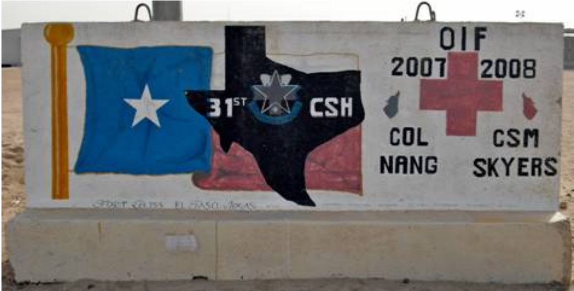
Medical: 31st Combat Support Hospital