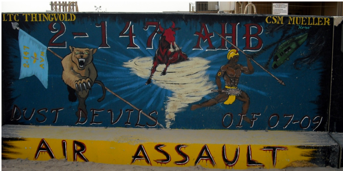
Figure 58. 2nd Battalion, 147th Assault Helicopter Battalion

E8. Unit: 2nd Battalion, 147th Assault Helicopter Battalion. Service: Minnesota Army National Guard. Date of Deployment: 2007-2008.