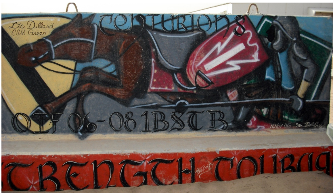
Figure 172. Special Troops Battalion, 1st Brigade Combat Team, 1st Cavalry Division

Q1. Unit: Special Troops Battalion, 1st Brigade Combat Team, 1st Cavalry Division. Service: Army Active, Fort Hood, Texas. Date of Deployment: 2006-2008.