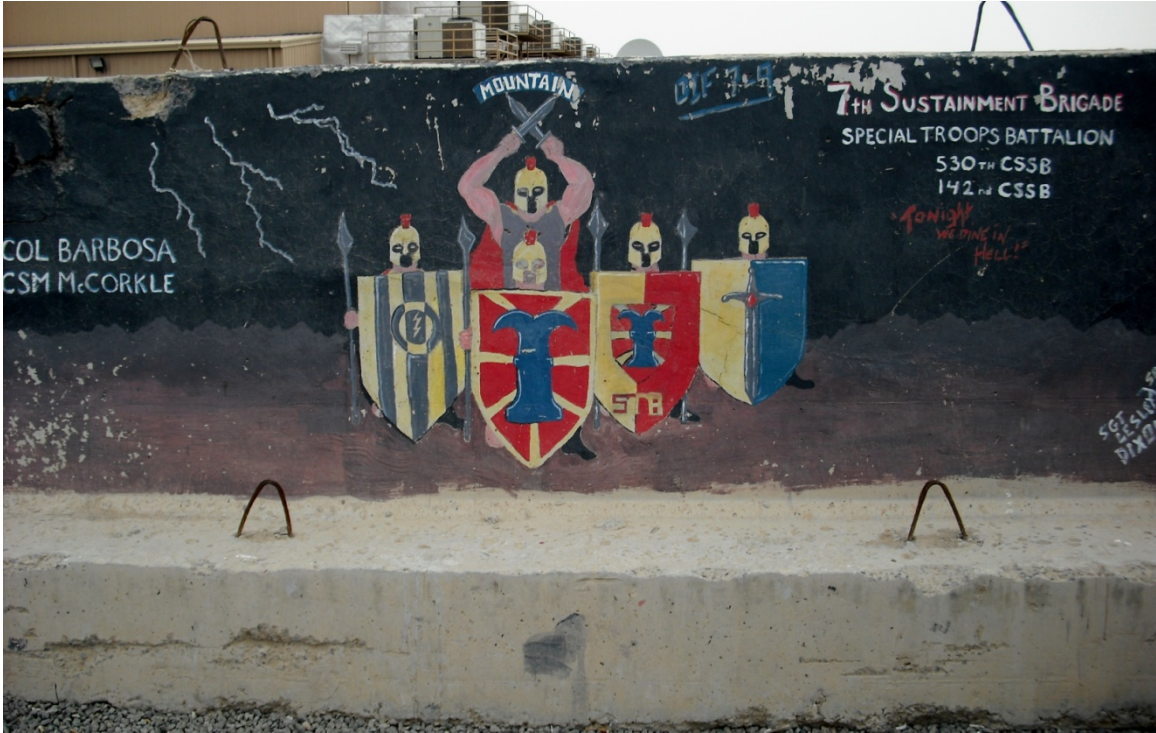
Figure 12. 7th Sustainment Brigade

A8. Unit: 7th Sustainment Brigade. Service: Army Active, Fort Eustis, Virginia. Date of Deployment: 2007-2008.