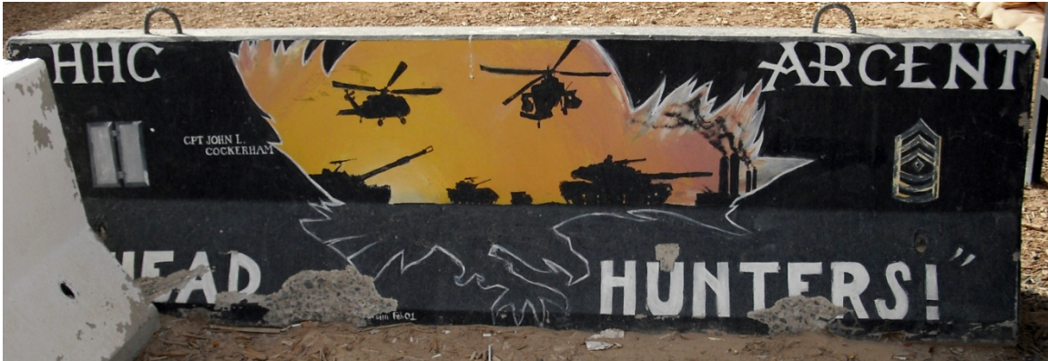
Figure 5. Headquarters, Headquarters Company, ARCENT, Third Army

A1. Unit: Headquarters, Headquarters Company, Army Central Command, Third Army. Service: Army Active, Sumter, South Carolina. Date of Deployment: February 2001.