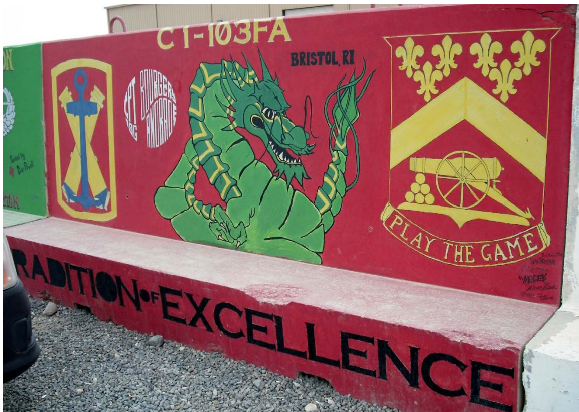
Figure 98. Battery C, 1st Battalion, 103rd Field Artillery Regiment

H12. Unit: Battery C, 1st Battalion, 103rd Field Artillery Regiment. Service: Rhode Island Army National Guard. Date of Deployment: 2007-2008.