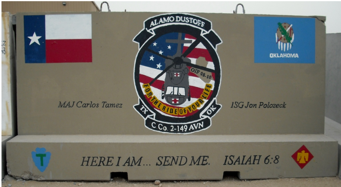
Figure 61. Company C, 2nd Battalion, 149th Aviation Regiment

E11. Unit: Company C, 2nd Battalion, 149th Aviation Regiment. Service: Texas and Oklahoma Army National Guard. Date of Deployment: 2008-2009.