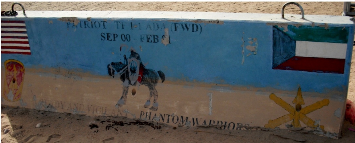
Figure 26. 1st Battalion, 1st Air Defense Artillery Regiment

C1. Unit: 1st Battalion, 1st Air Defense Artillery Regiment. Service: Army Active, Fort Bliss, Texas. Date of Deployment: 2000-2001.