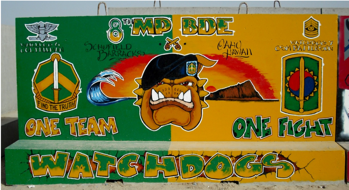
Figure 13. 8th Military Police Brigade

A9. Unit: 8th Military Police Brigade. Service: Army Active, Schofield Barracks, Hawaii. Date of Deployment: 2008-2009.