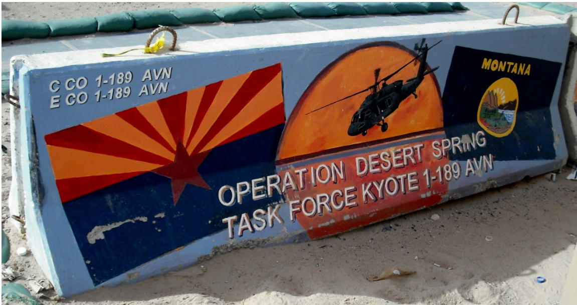
Figure 67. Companies C & E, 1st Battalion, 189th Aviation Regiment

E17. Unit: Companies C & E, 1st Battalion, 189th Aviation Regiment. Service: Montana Army National Guard (with Arizona). Date of Deployment: 2002.