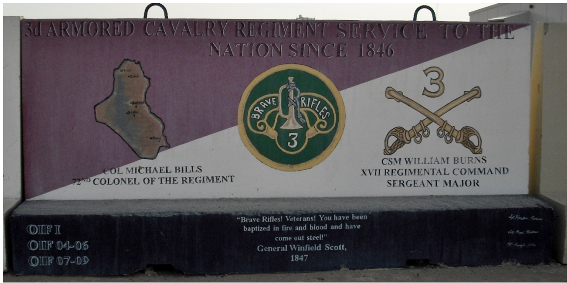
Figure 34. 3rd Armored Cavalry Regiment

non-inclusion of higher headquarters identification. Perhaps this is a reflection of different priorities for company and field grade leadership. Over-all, this barrier provides a concise, no frills unit signature of its Iraq deployment.