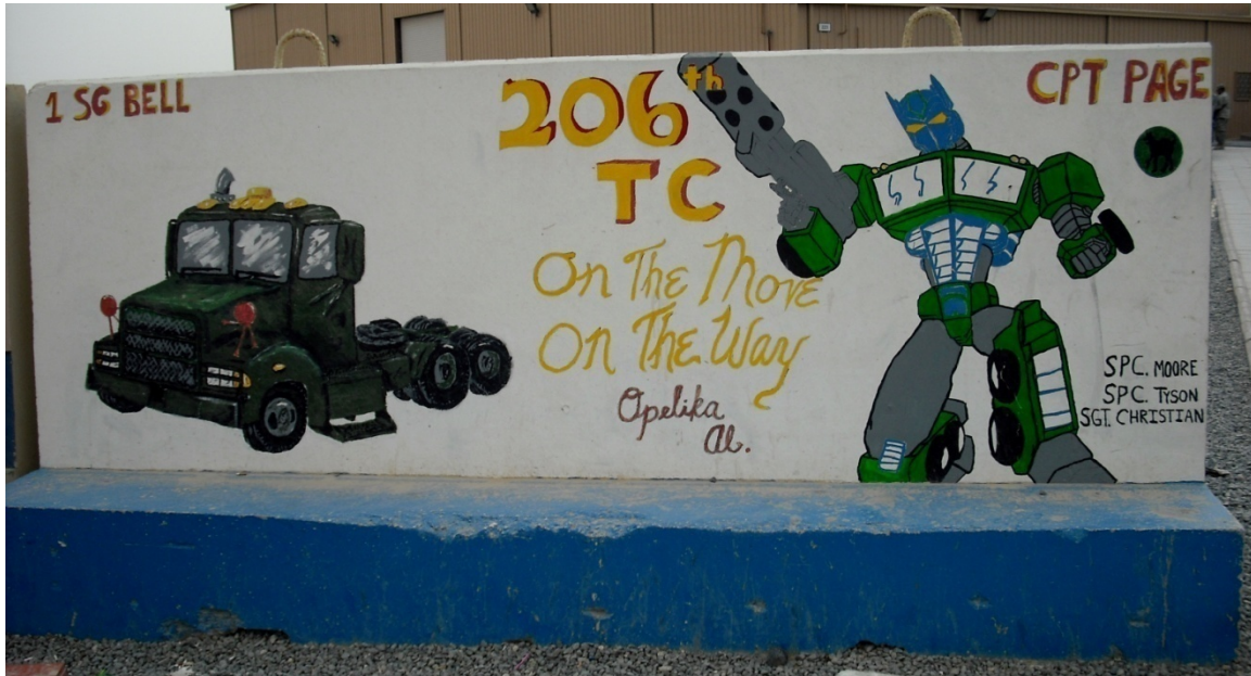
Figure 190. 206th Transportation Company

general, work is accomplished quickly and with exceedingly high standards. In the same manner, the 62nd TC will accomplish their mission with efficiency and excellence.