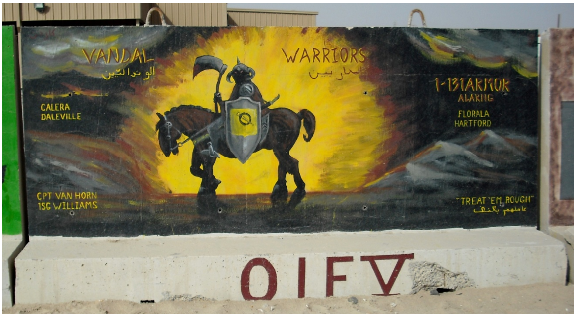
Figure 30. 1st Battalion, 131st Armor Regiment

The 3rd Battalion, 66th Armored Regiment arrives to the Area of Operations and gives notice that it is ready for battle and the Task Force mission. The barrier of choice is the larger ten foot variety, and the illustration is an adaptation of the unit's regimental insignia. The standard insignia is changed by incorporating the moniker within the design. The illustration depicts an armored knight with lance in a forward, attacking position, underscoring the unit's battle readiness. The strong and specific use of black and red base colors enhances the barrier's aggressive stance.