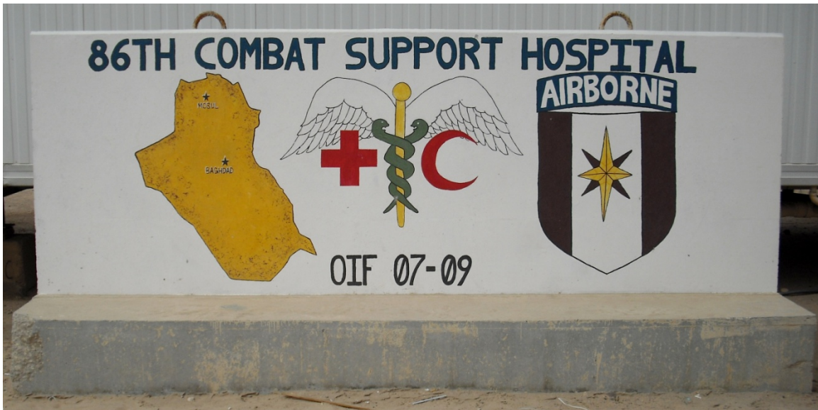
Figure 126. 86th Combat Support Hospital

America is a pet loving nation, and that truth continues downrange. In this barrier, the dog looks ready to hang out the car window on a highway cruise, instilling an emotion of lightheartedness and liberty for the onlooker. The white background adds to the effect. An additional aspect of this barrier is the message, "proudly serving the entire theater of operations." This reflects a burden many units undertook to cover large areas of Iraq with limited personnel.