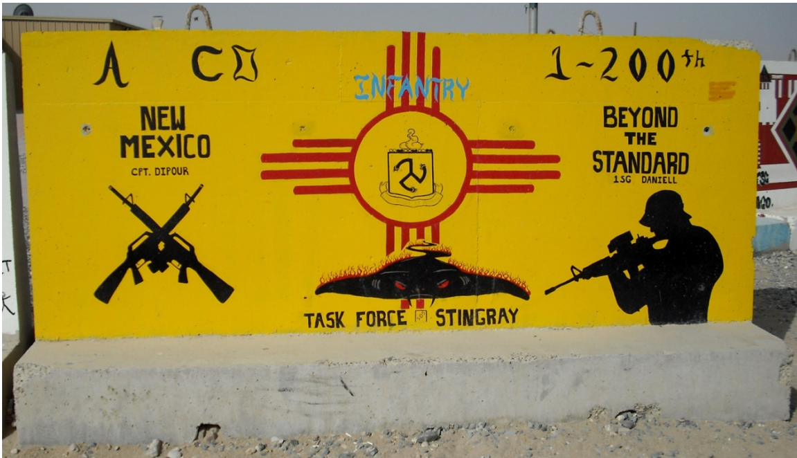
Figure 118. Company A, 1st Battalion, 200th Infantry Regiment

I16. Unit: Company A, 1st Battalion, 200th Infantry Regiment. Service: New Mexico Army National Guard. Date of Deployment: 2007-2008.