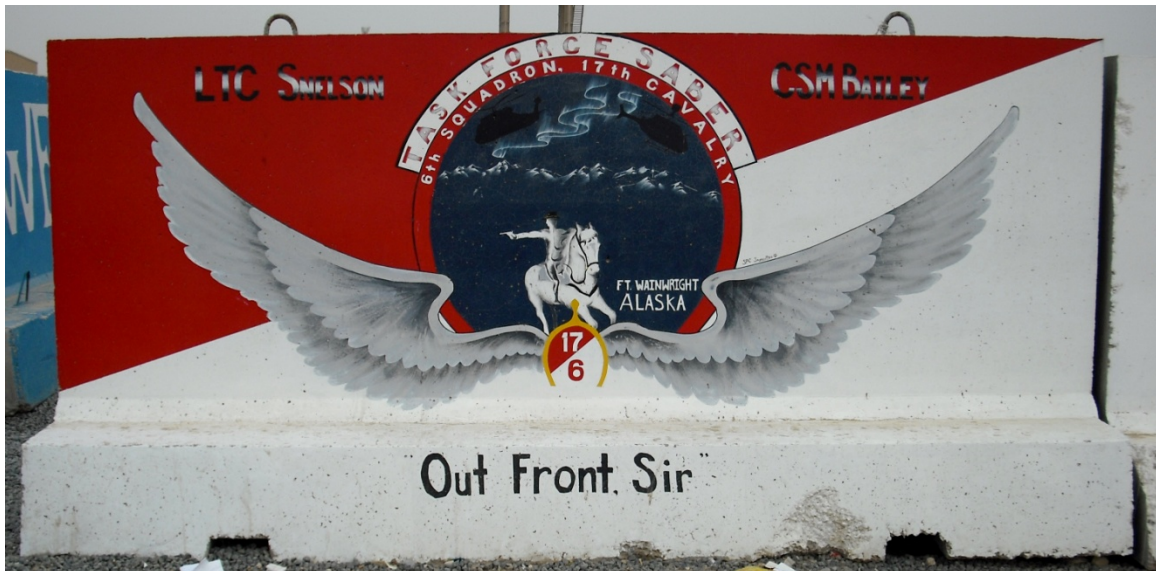
Figure 47. 6th Squadron, 17th Cavalry Regiment

D20. Unit: 6th Squadron, 17th Cavalry Regiment. Service: Army Active, Fort Wainwright, Alaska. Date of Deployment: 2008-2009.