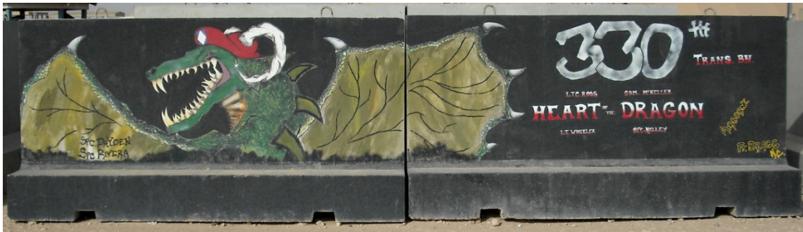
Figure 191. 330th Transportation Battalion

was 27, and the average age of National Guard members was 33. 88 The 206th TC's barrier reflects the young adult age of deployed personnel and their sources of inspiration. Humans, as well as robots and comic book heroes, are valued as fighting heroes.