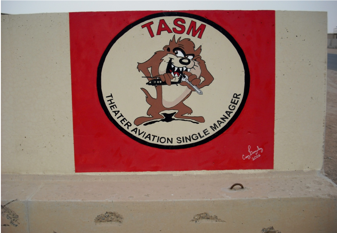
Figure 73. Theater Aviation Single Manager

artwork and lettering show careful craftsmanship that speaks of the unit's pride in presentation.