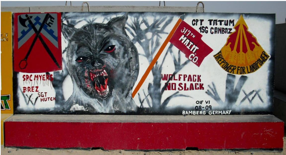
Figure 160. 317th Maintenance Company

M5. Unit: 317th Maintenance Company. Service: Army Active, Bamberg, Germany. Date of Deployment: 2008-2009.