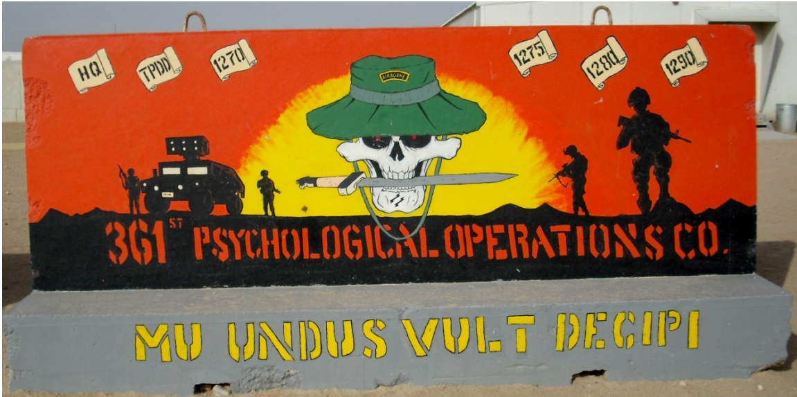
Figure 166. 361st Psychological Operations Company

and untruth. 84 The white paint representing truth provides the base color upon which unit insignia is applied. Double edged knives resembling lightning bolts point outward from the insignia toward the gray and black areas. This is, perhaps, symbolic of the unit's mission of exposing and counteracting the enemy's lies.