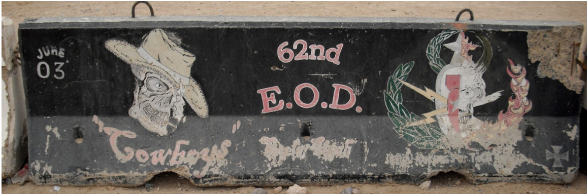
Figure 157. 62nd Explosive Ordinance Disposal

locations was not uncommon in OIF. Many Soldiers were undertaking responsibilities commensurate with higher levels of experience and rank. In addition, the company personnel were not likely to be reunited until redeployment. Thus, the barrier also serves as a departure nod to one another before moving to their respective mission bases.