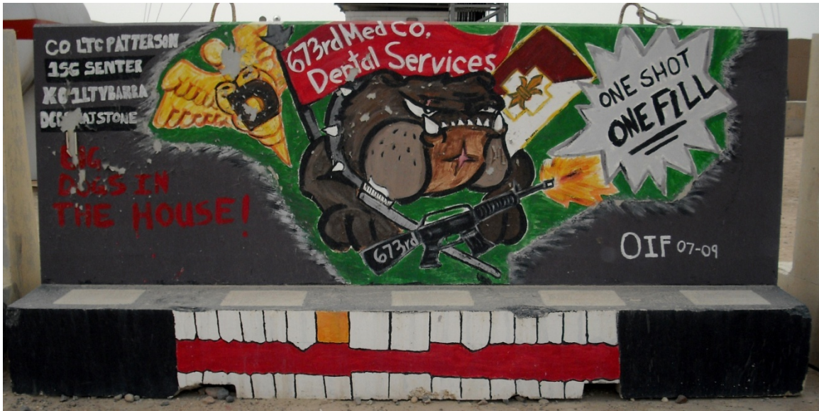
Figure 135. 673rd Medical Company (Dental Services)

double entendre joining the dog moniker and the urban expression for something that positively exceeds the norm. All told, the barrier describes the 591st's approach to deployment, which is a beyond the normal standard, as something really special.