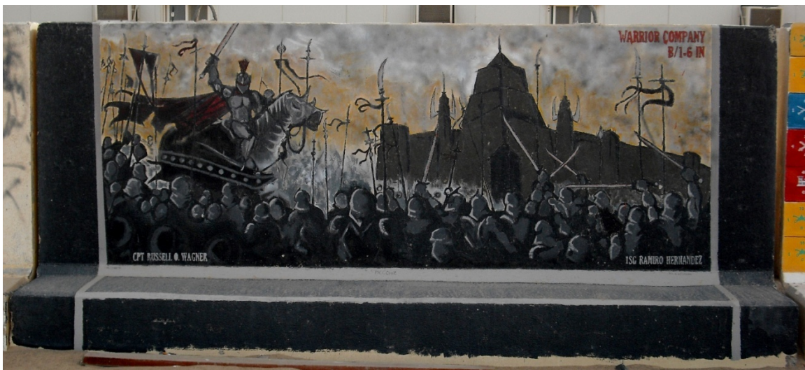
Figure 103. Company B, 1st Battalion, 6th Infantry Regiment

II. Unit: Company B, 1st Battalion, 6th Infantry Regiment. Service: Army Active, Vilseck, Germany. Date of Deployment: 2008-2009.