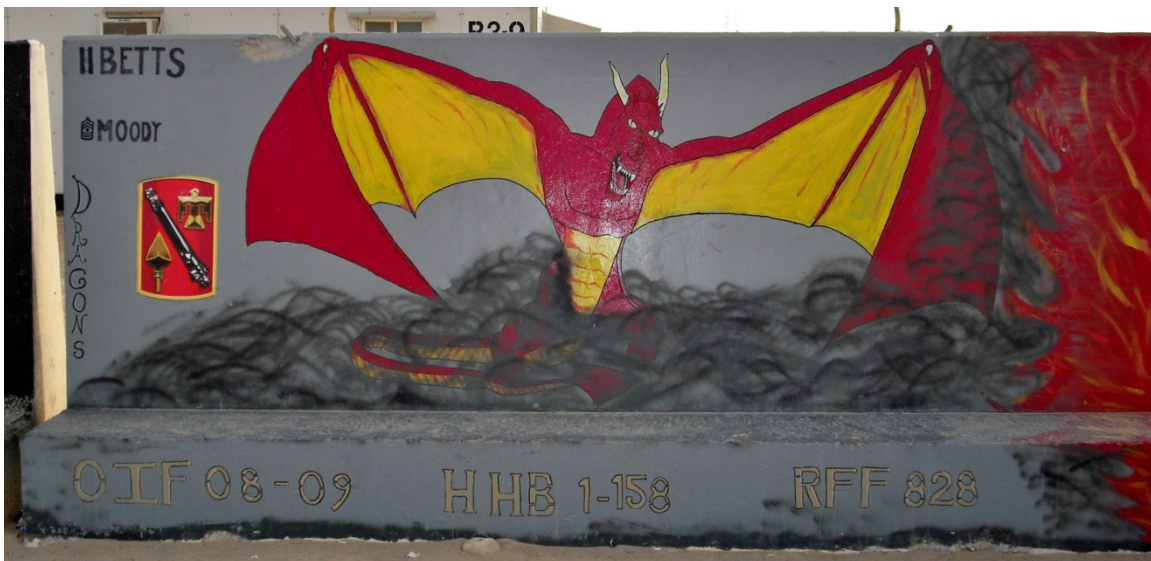
Figure 101. Headquarters, Headquarters Battery, 1st Battalion, 158th Field Artillery Regiment

cannon bones. The close approximation of razorback and state images on either side, allow each theme to receive optimum attention. In addition, the deployment period is noted in a font reminiscent of computer data script typically seen in the opening of a vintage science fiction movie. This lettering style gives the observer an impression they are watching the start of movie where an exciting story will be revealed. Further, it also suggests that what is done in the deployment will be remembered in the future.