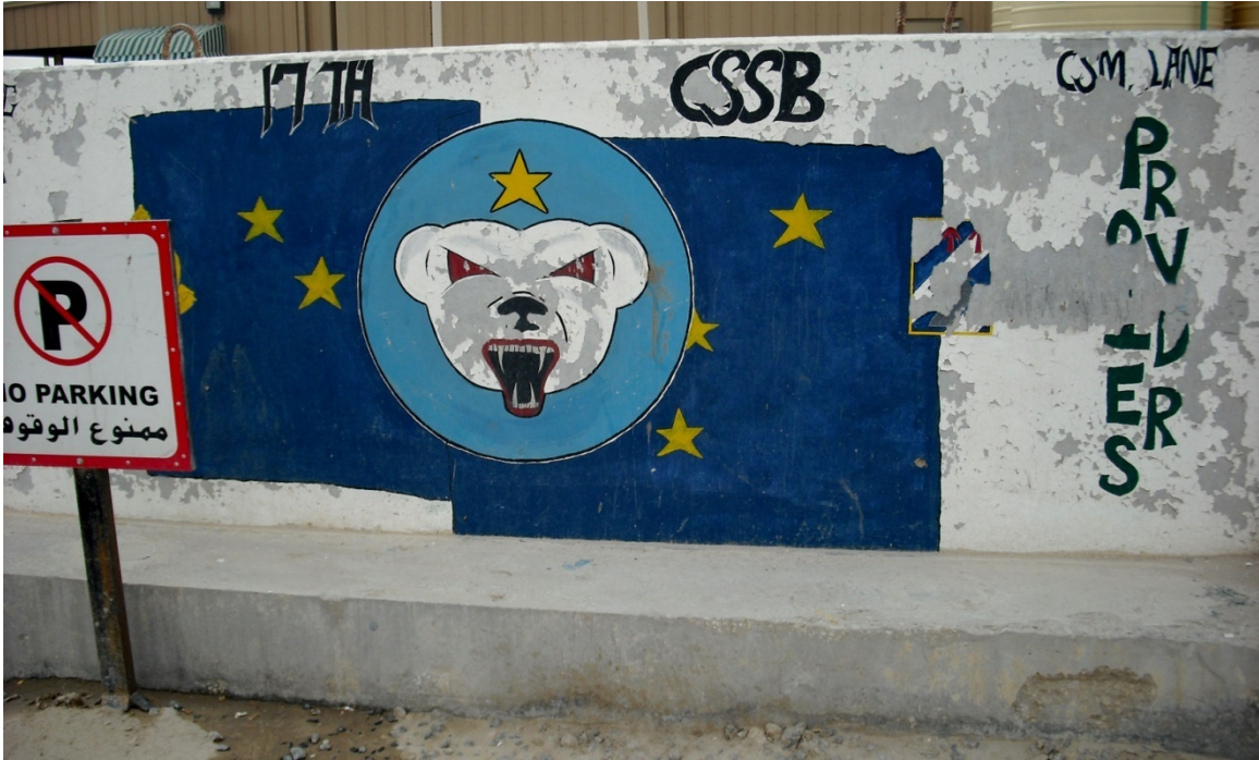
Support / Sustainment: 17th Combat Sustainment Support Battalion