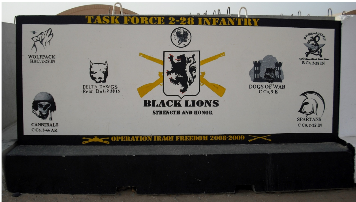
Figure 104. 2nd Battalion, 28th Infantry Regiment

Motivation to fight is key for victory in combat, and Bravo Company shows its battle readiness in this painting of noble knights rallying for war. The mounted knight leads the gathered mass of combatants in an enthusiastic battle roar. This painted scene reflects everything an army leader would desire from their Soldiers entering war. It expresses a well equipped, unified force, committed to the mission in the shadow of their impending battle. In artistic terms, this barrier's craftsmanship, storyline, and theme are exceptionally rendered.