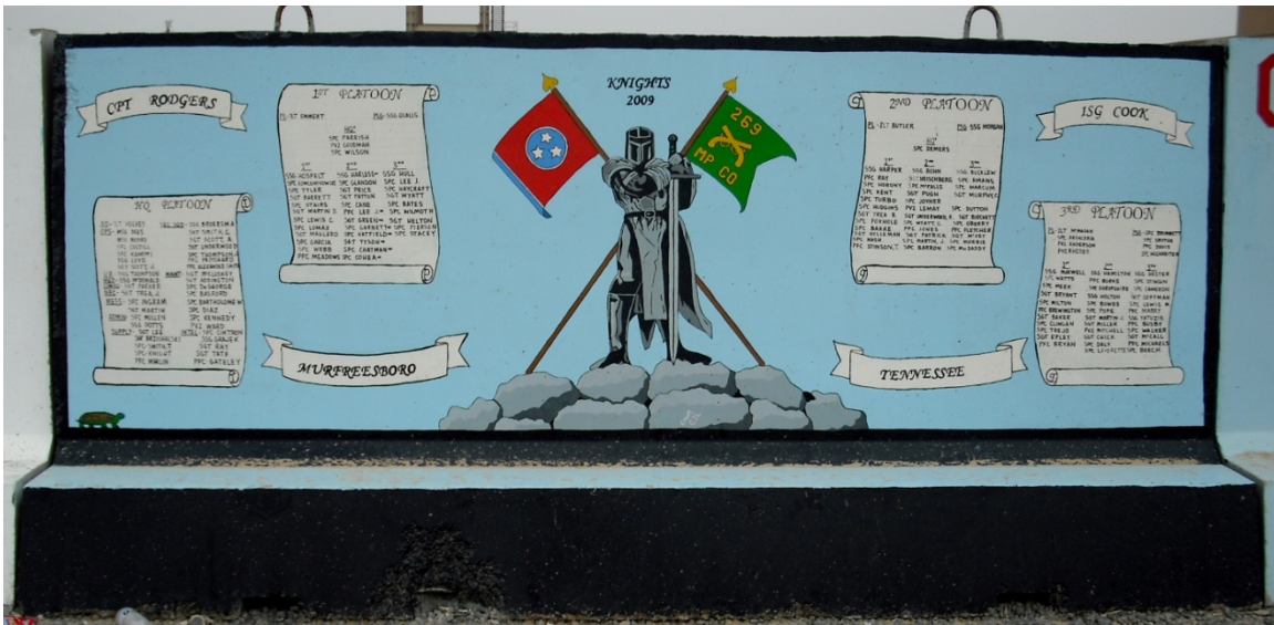
Figure 144. 269th Military Police Company

succinctly proclaims a foundational truth of America’s military might, “The Strength of the Wolf is the Pack, the Strength of the Pack is the Wolf.” This motto speaks of the mutual responsibility that an individual and an organization have to one another. The barrier further defines this reciprocal responsibility in terms of unit values listed as; loyalty, patience, integrity, strength and honor. With the integration of these values, organization and individual become akin to a wolf pack that hunts and fights with intelligence, cunning, and force not easily broken. The 220th MP Company Soldiers identify themselves as a “Wolf Pack,” where each member can be counted upon to fulfill their responsibilities for the good of all.