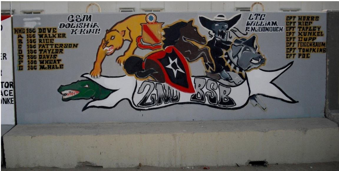
Figure 174. Brigade Support Battalion, 2nd Stryker Brigade Combat Team, 2nd Infantry Division

Q3. Unit: Brigade Support Battalion, 2nd Stryker Brigade Combat Team, 2nd Infantry Division.