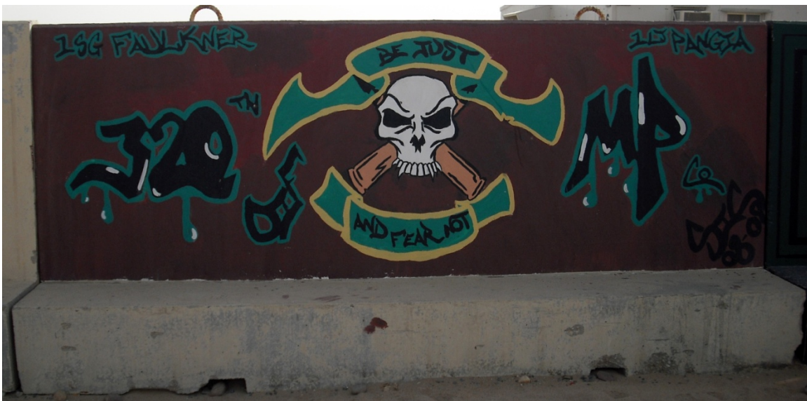
Figure 147. 320th Military Police Company

embodiment of military might. The central image specifically represents the 293rd MP Company and resembles a medieval coat of arms. The emblem features crossed pistols, crossed axes, and a shield. The image appearing on both sides of this emblem is the 3rd Infantry Division's insignia. It represents Army military power and heritage. Collectively, the images convey the message that the 293rd Military Police Company is elite, powerful, and ready for any mission.