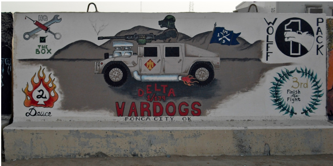
Figure 114. Company D, 1st Battalion, 179th Infantry Regiment

I12. Unit: Company D, 1st Battalion, 179th Infantry Regiment. Service: Oklahoma Army National Guard, Ponca City, OK. Date of Deployment: 2007-2008.