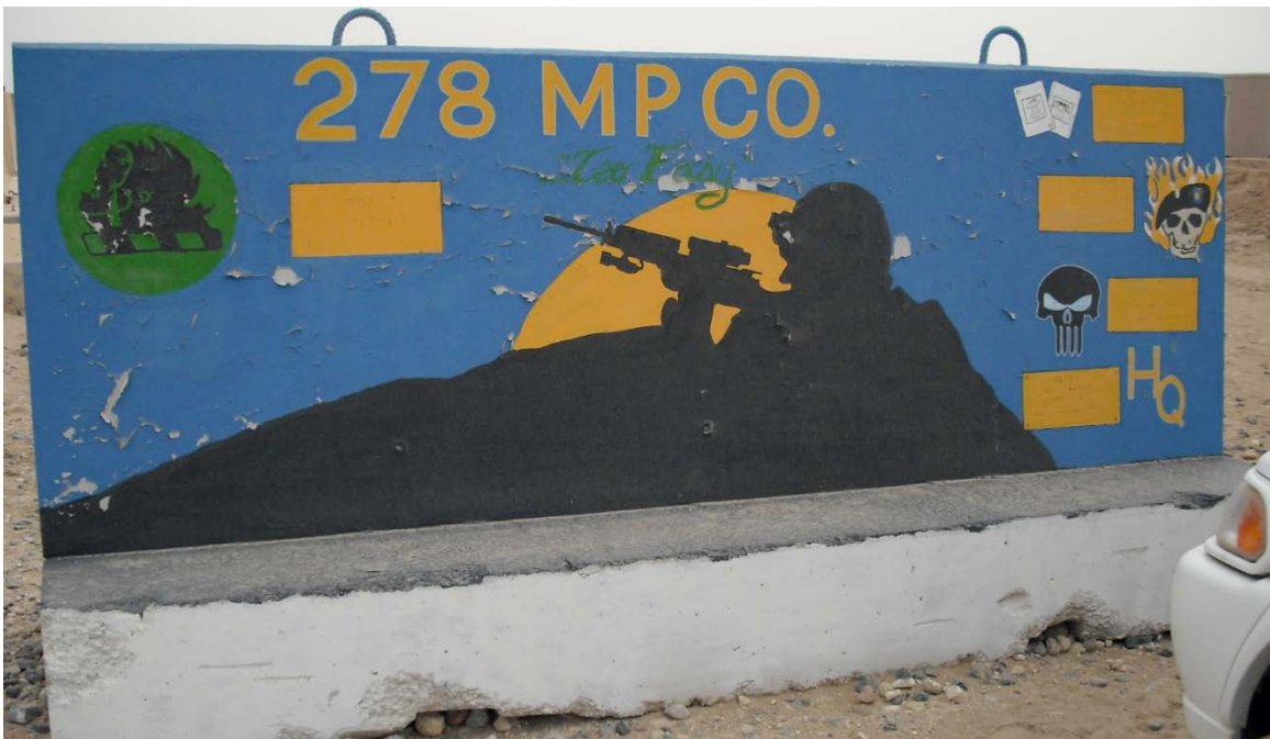
Figure 145. 278th Military Police Company

The 269th Military Police Company presents a barrier that highlights its knight moniker and unit personnel. With a medieval theme, this barrier is replete with knight, banners, scrolls, and several muster lists designating the names of the valiant assembled for war. The barrier is remarkable in its listing all 269th MP Company Soldiers. In bringing honor to its individual members united in effort, the unit recognizes that each person's responsibility is critical to attaining victory. Additionally, the unit's knight symbol represents Soldiers who are valiant, noble, and honorable for heeding America's call to arms.