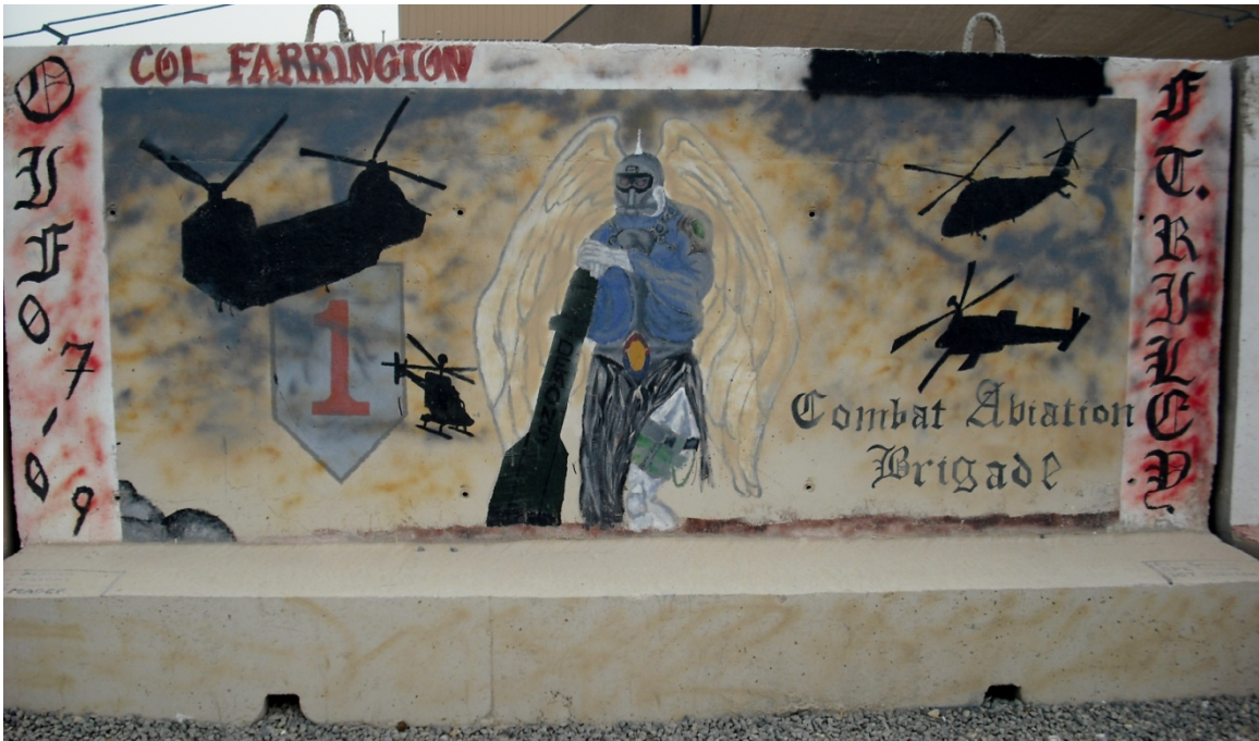
Figure 9. 1st Combat Aviation Brigade

A5. Unit: 1st Combat Aviation Brigade. Service: Army Active, Fort Riley, Kansas. Date of Deployment: 2007-2009.