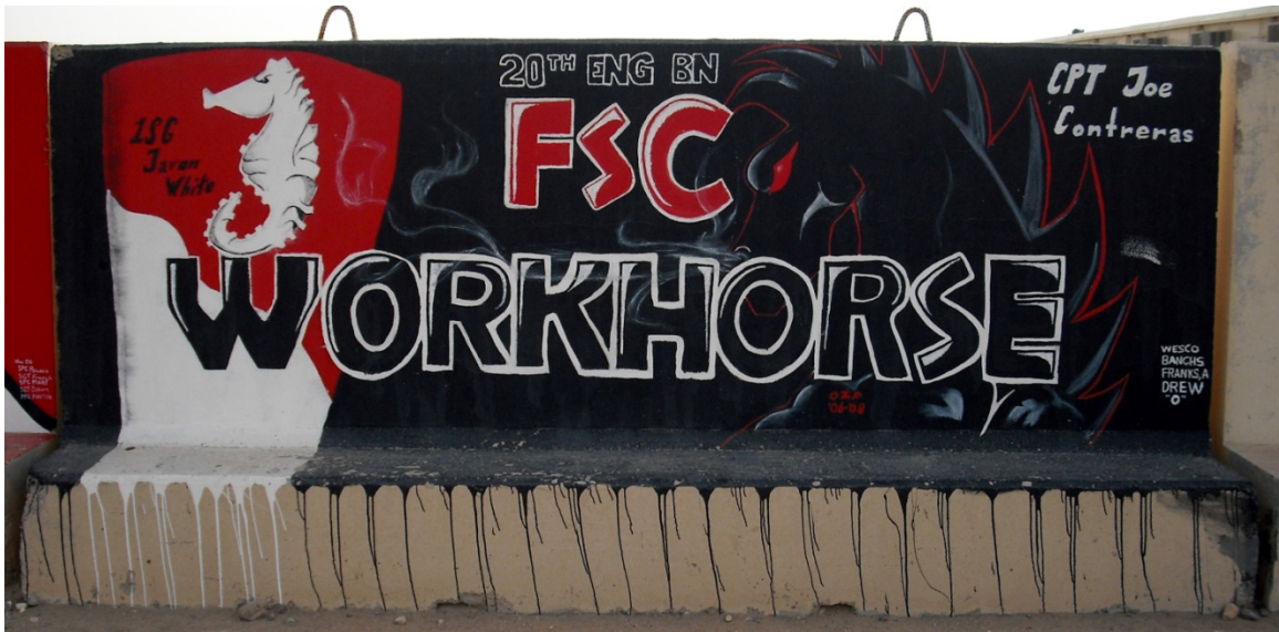
Figure 77. Forward Support Company, 20th Engineer Battalion

Bravo Company from the 9th Engineer Battalion announces its arrival to Operation Iraqi Freedom with the larger sized ten foot barrier. Sapper pride is readily apparent with the display of a gigantic centrally positioned castle with bomb cutouts for windows. Further, the masked, square jawed outlaw moniker looks like he could sling some dynamite. Humorously, the company also places the commander's name above the outlaw moniker, ascribing him its characteristics. Additional elements include the unit's "Rock Steady" motto indicating its modus operandi for the deployment, and the signatures of unit personnel on the barrier's foundation.