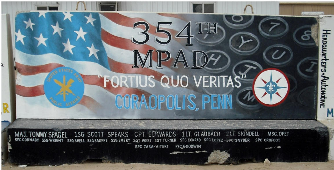
Figure 184. 345th Mobile Public Affairs Detachment

A second reaction this barrier might evoke is amusement with a tongue-in-cheek greeting for those just arriving to Operation Iraqi Freedom. Although they are worlds apart, the city of Las Vegas and deployment share much in common. Both provide a transient desert experience where missions operate around the clock, and one's senses are heightened from unexpected and often surreal situations and experiences.