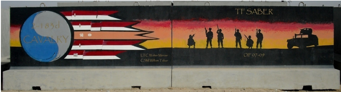
Figure 50. 2nd Squadron, 183rd Cavalry Regiment

D23. Unit: 2nd Squadron, 183rd Cavalry Regiment. Service: Virginia Army National Guard. Date of Deployment: 2007-2008.