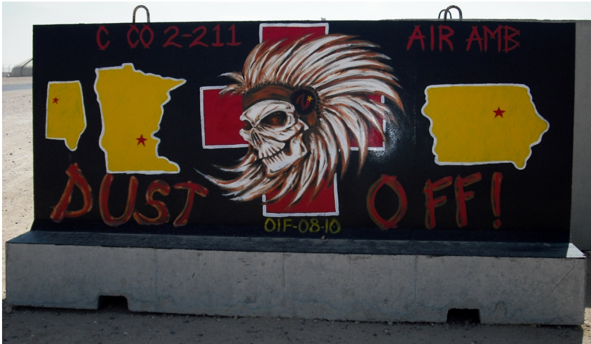
Figure 68. Company C, 2nd Battalion, 211th Aviation Regiment

timeline of Operation Desert Spring was December 31, 1998, through March 18, 2003, whereas OIF began March 19, 2003.