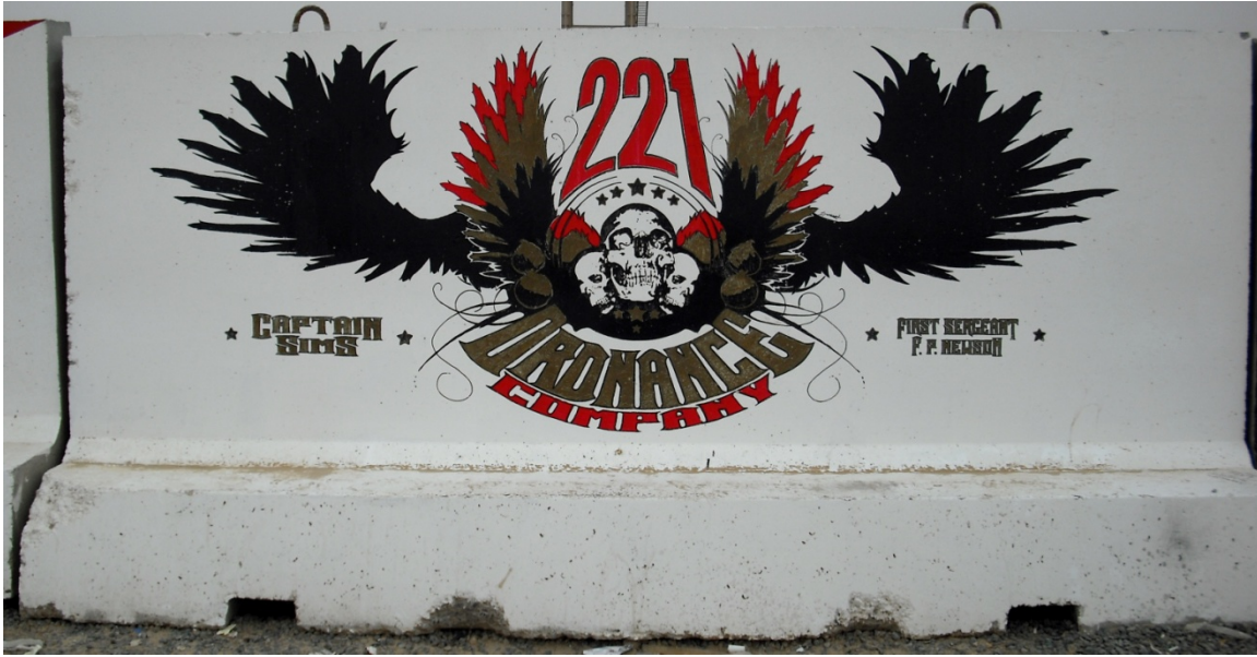
Figure 159. 221st Ordnance Company

M4. Unit: 221st Ordnance Company. Service: Army Reserve, Fort Wayne, IN. Date of Deployment: 2008-2009.