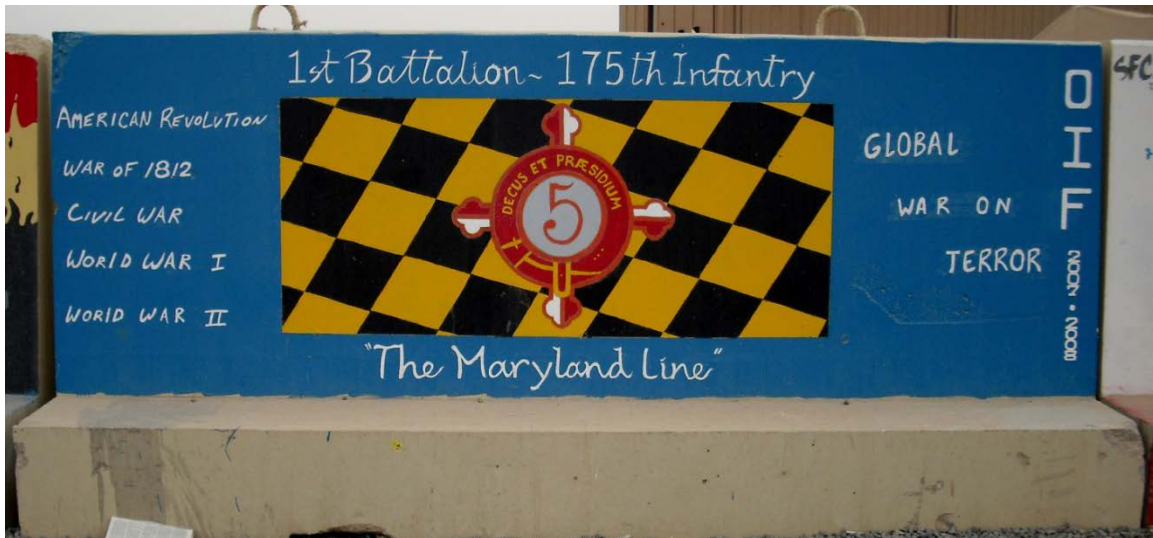
Figure 112. 1st Battalion, 175th Infantry Regiment

I10. Unit: 1st Battalion, 175th Infantry Regiment. Service: Maryland Army National Guard. Date of Deployment: 2007-2008.