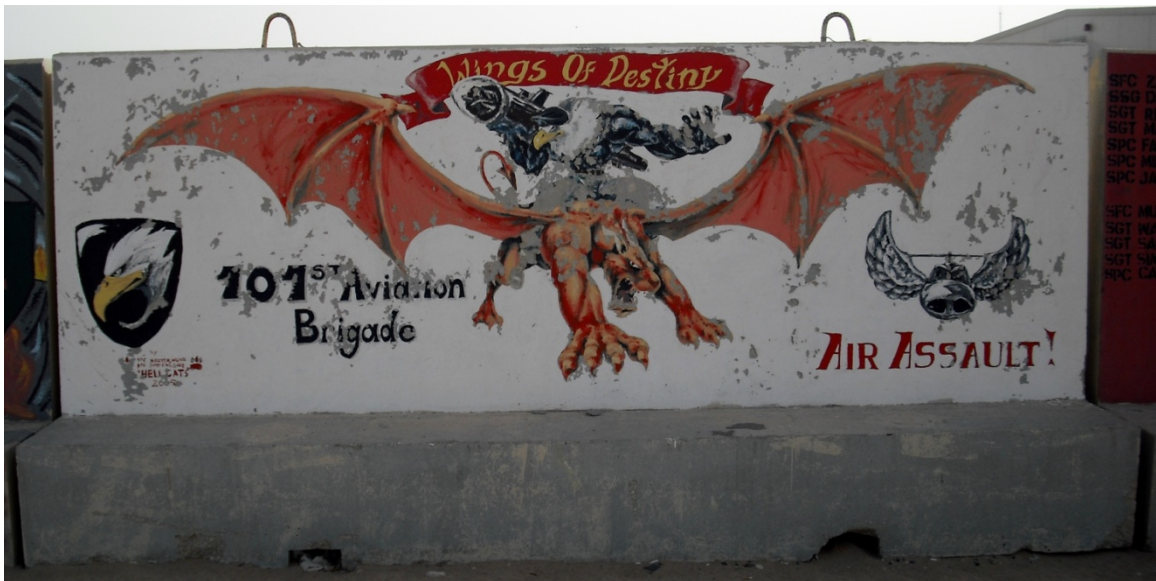
Figure 20. 101st Aviation Brigade, 101st Airborne Division

The 56th Stryker Brigade Combat Team exhibits a barrier with three hallmarks. The first feature is the State of Pennsylvania incorporated into the design to reflect the brigade's home state pride. The second feature regards the strength of unity, illustrated with a heavy linked chain interconnecting unit insignias with the central 56th SBCT insignia. In combination with a backdrop of red-orange color, jagged lines, and forged armor, the unified insignias have the appearance of a fearsome, medieval-like weapon. The final feature is the signatures of brigade personnel around the barrier's exterior. The multitude of autographs adds to the barrier's forceful presence and implies unity of effort at the troop level.