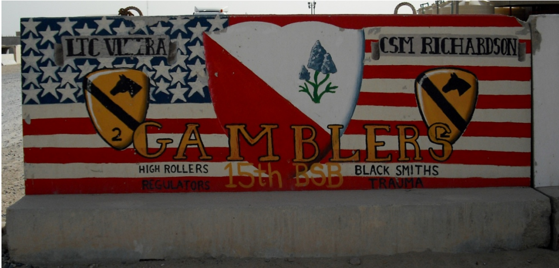
Figure 177. 15th Brigade Support Battalion, 2nd Brigade Combat Team

Q6. Unit: 15th Brigade Support Battalion, 2nd Brigade Combat Team. Service: Army Active, Fort Hood, Texas. Date of Deployment: 2007-2008.