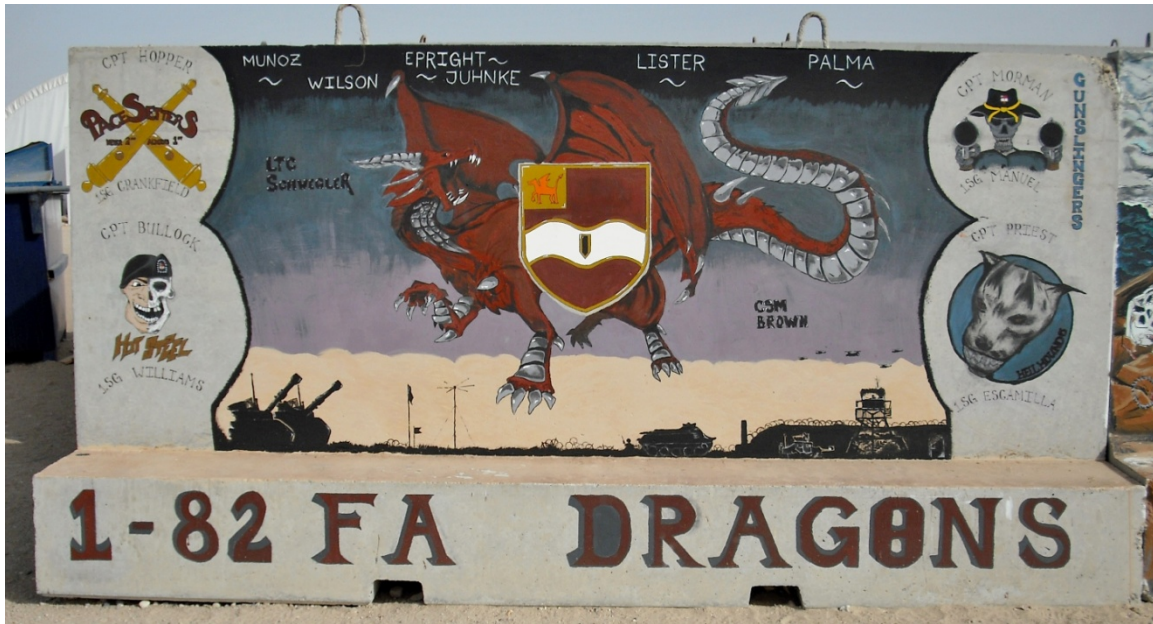
Figure 95. 1st Battalion, 82nd Field Artillery Regiment

H9. Unit: 1st Battalion, 82nd Field Artillery Regiment. Service: Army Active, Fort Hood, Texas. Date of Deployment: 2009 – 2010.