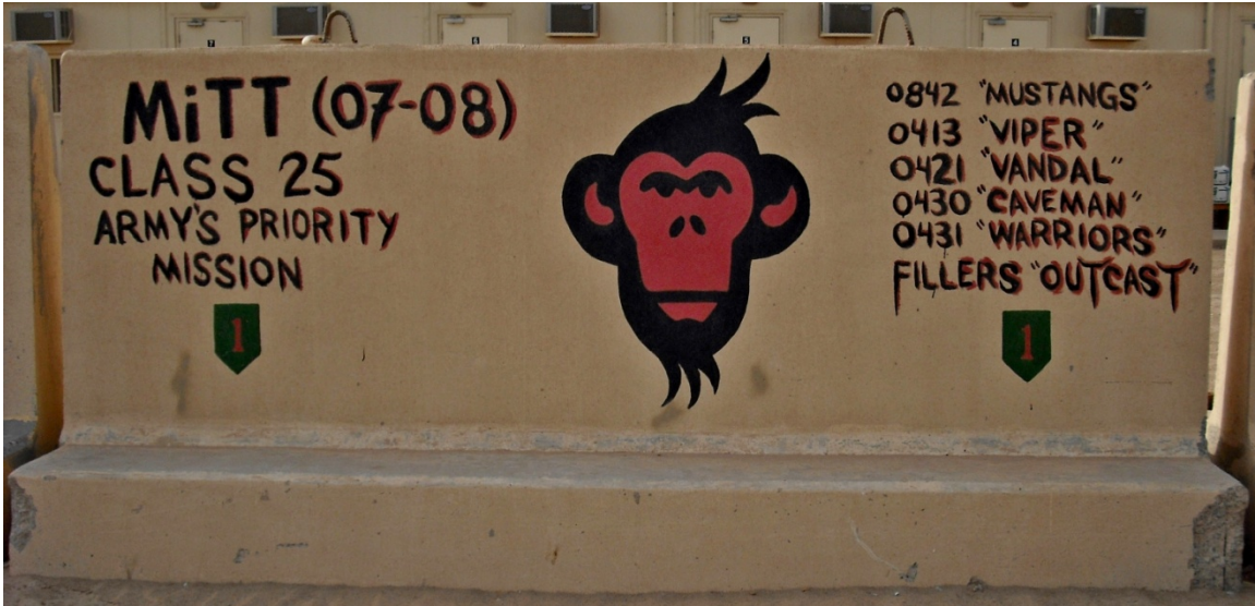
Figure 198. Class 25, Military Transition Teams, 1st Infantry Division

S1. Unit: Class 25, Military Transition Teams, 1st Infantry Division. Service: Army Active, Fort Riley, Kansas. Date of Deployment: 2007-2008.