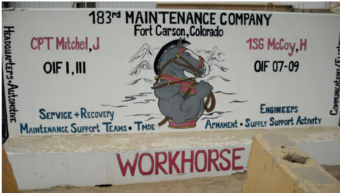
Figure 158. 183rd Maintenance Company

insignia that is half flaming skull with crossed lightning bolts protruding. The use of aggressive and death-incorporating themes was predictive of those to come.