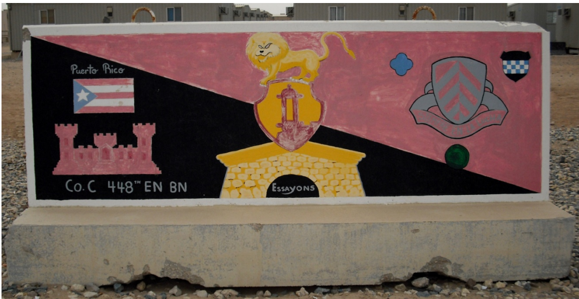
Figure 84. Company C, 448th Engineer Battalion

amusement, the ubiquitous traveling gnome. The central image of the mako shark draws immediate attention. Known for its agility and fighting spirit, the mako lunges out of the water to devour its prey. Though the mako is a tropical shark, it is here shown bursting through a cement barrier to illustrate that it can attack in any environment. The tiny gnome is a humorous reference to the popular travel service advertising campaign which features the gnome traveling in every corner of the world. The combined elements of aggression and humor illustrate the dichotomy of emotions and the combination of intensity and humor that Soldiers experience in warfare.