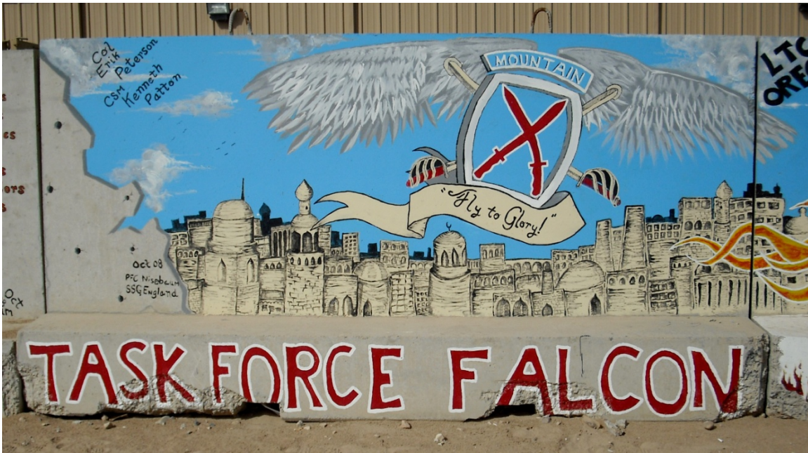
Figure 14. 10th Combat Aviation Brigade

A10. Unit: 10th Combat Aviation Brigade. Service: Army Active, Fort Drum, New York. Date of Deployment: 2008-2009.