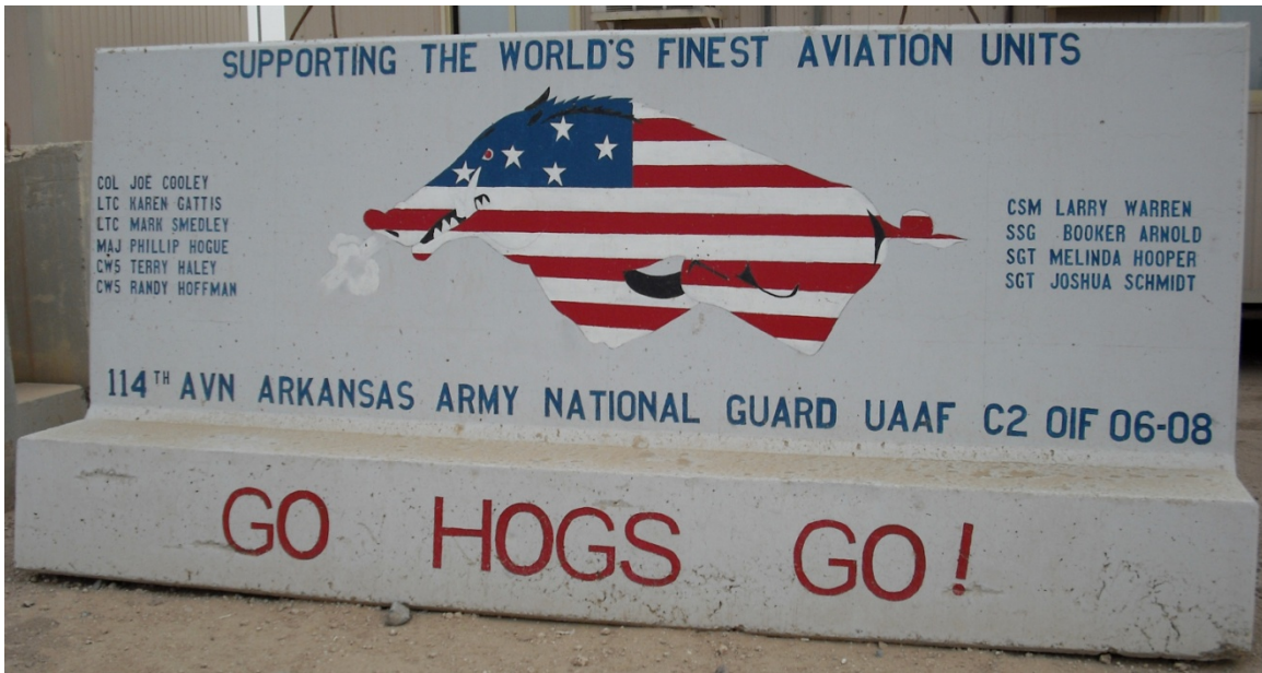
Figure 57. 1st Battalion, 114th Aviation Regiment

E7. Unit: 1st Battalion, 114th Aviation Regiment. Service: Arkansas Army National Guard, North Little Rock, AR. Date of Deployment: 2006-2007.