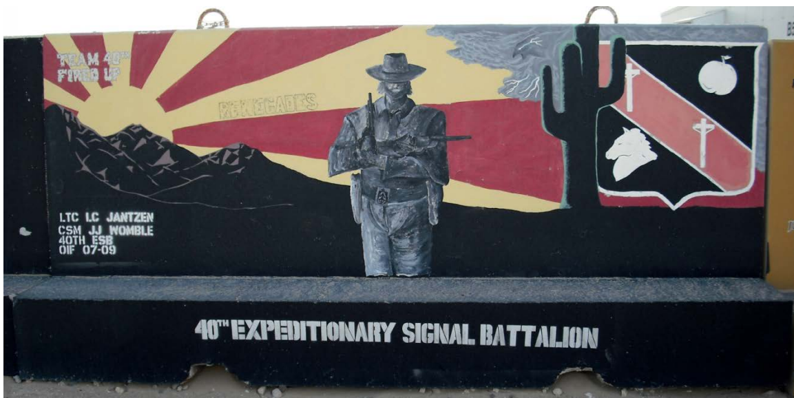
Figure 171. 40th Expeditionary Signal Battalion

P1. Unit: 40th Expeditionary Signal Battalion. Service: Army Active, Fort Huachuca, Arizona. Date of Deployment: 2007-2009.