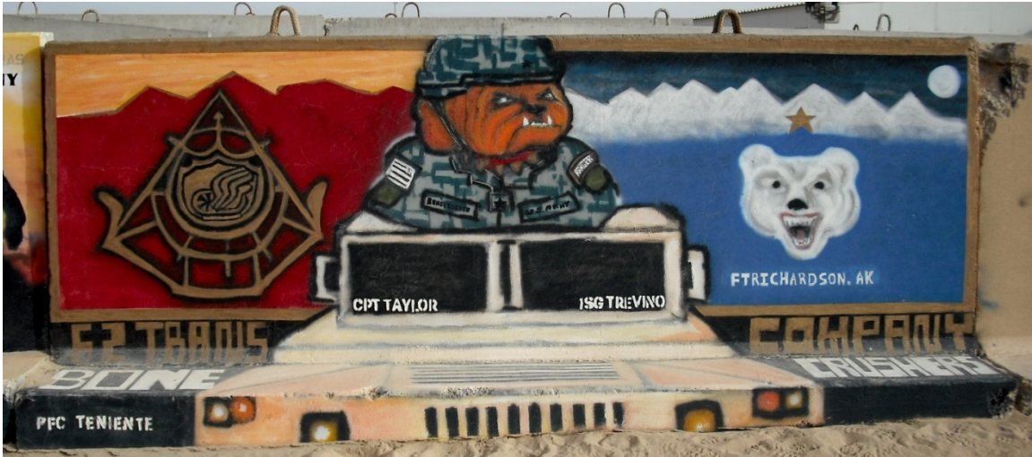
Figure 189. 62nd Transportation Company, 751st Combat Sustainment Support Battalion

R1. Unit: 62nd Transportation Company, 751st Combat Sustainment Support Battalion. Service: Army Active, Fort Richardson, Alaska. Date of Deployment: 2008-2009.