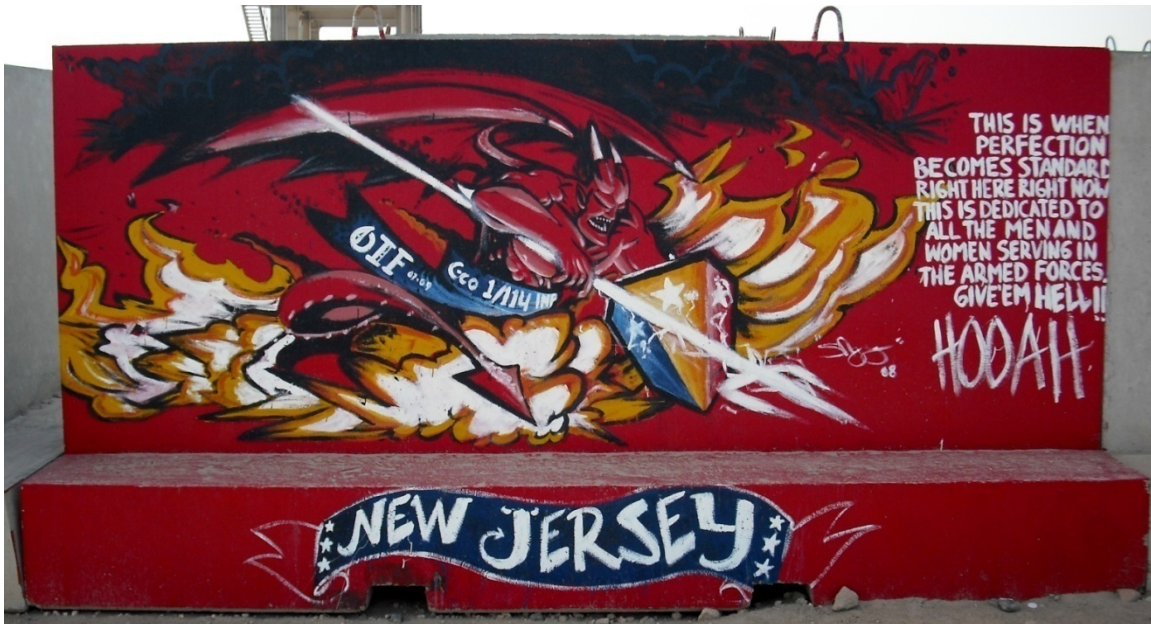
Figure 107. Company C, 1st Battalion, 114th Infantry Regiment

detention drawings. The combination is very effective. In sum, this painted barrier is a reflection of most army units: they know how to work hard and how to relax when appropriate.