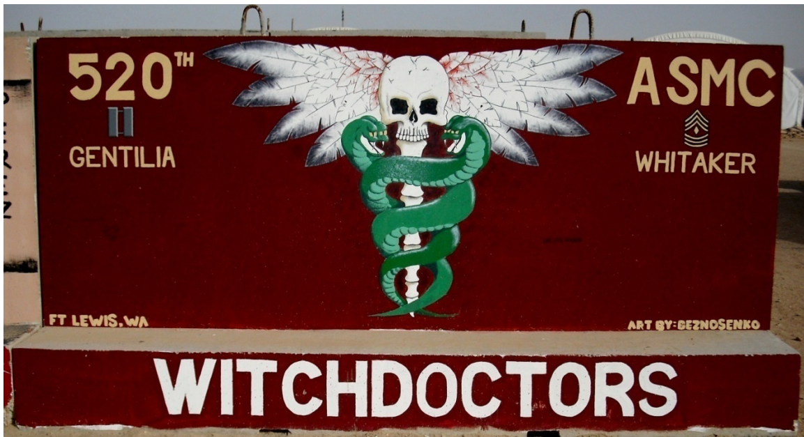
Figure 133. 520th Area Support Medical Company

honor the service and sacrifices of current and prior unit members. Summarily, the unit's lineage of participation in conflict provides motivation. As one generation passes the baton to the next, a legacy of service is established for future members to emulate.