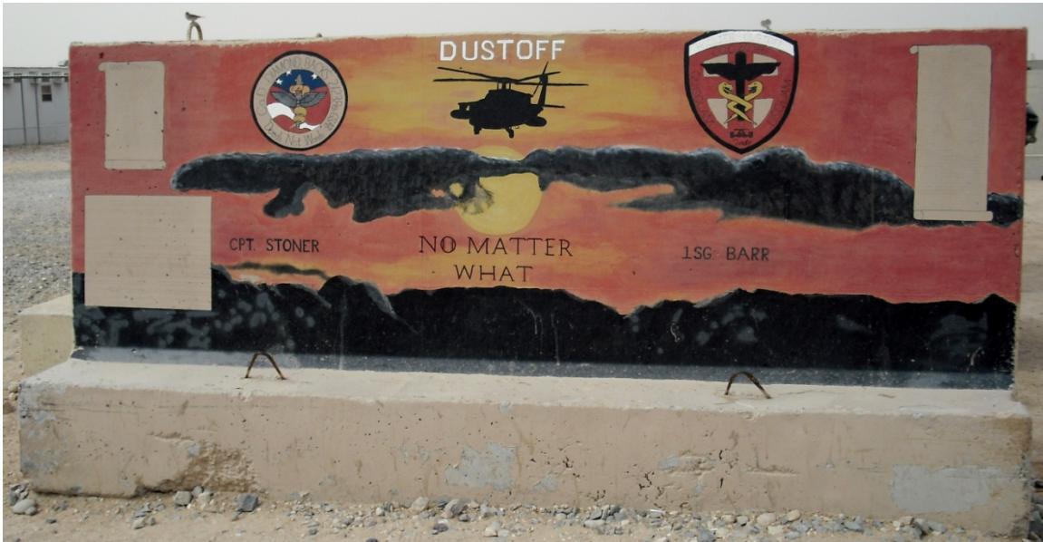
Figure 69. Company C & D, 2nd Battalion (General Support), 238th Aviation Regiment

of unit personnel. Artistically, images are outlined in white causing them to further stand out against the intensity of a black background.