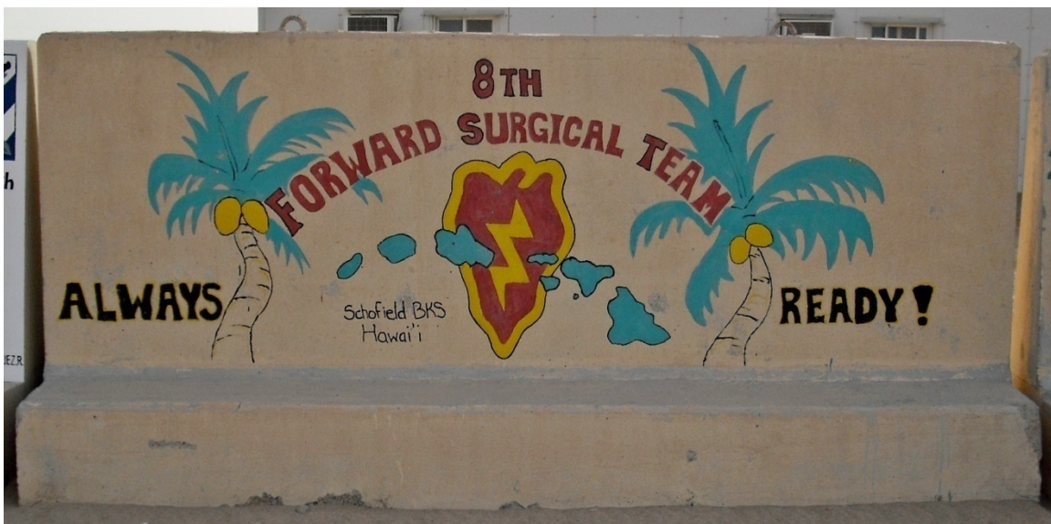
Figure 122. 8th Forward Surgical Team

J1. Unit: 8th Forward Surgical Team. Service: Army Active Schofield Barracks, Hawaii. Date of Deployment: Likely 2006-2007.