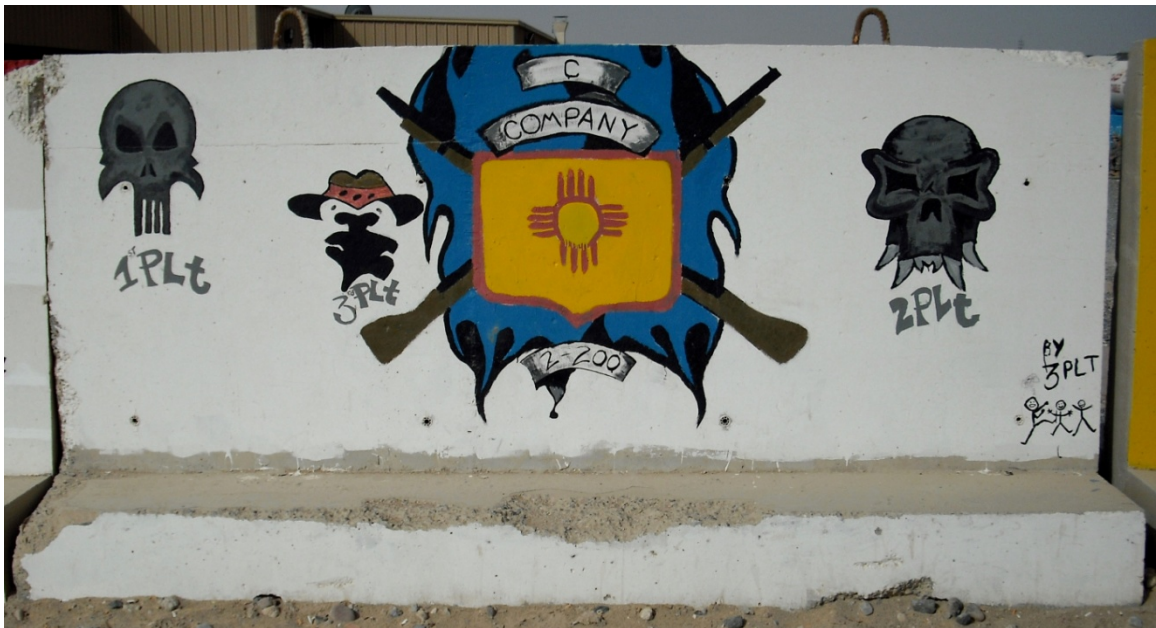
Infantry: Company C, 2nd Battalion, 200th Infantry Regiment