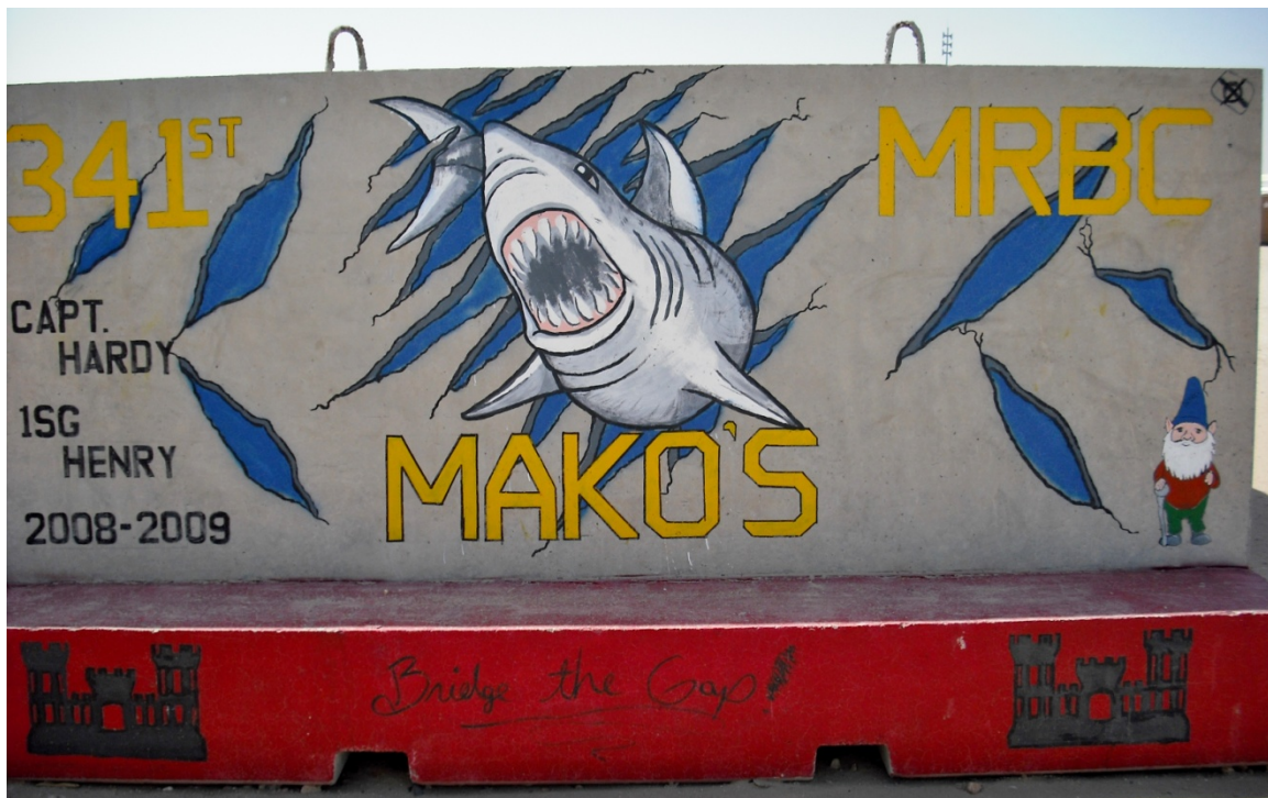
Figure 83. 341st Multi Role Bridge Company

The 186th Engineer Company's barrier warns of its ability to bring death to the enemy. The grim reaper and the black rose are two death themes that dominate. In this instance, they are combined to heighten the impact of each. The grim reaper with a black rose shoulder patch is meant to be perceived as a Soldier. The implication of the grim reaper pointing to the black rose is a clear warning to the enemy of their impending doom.