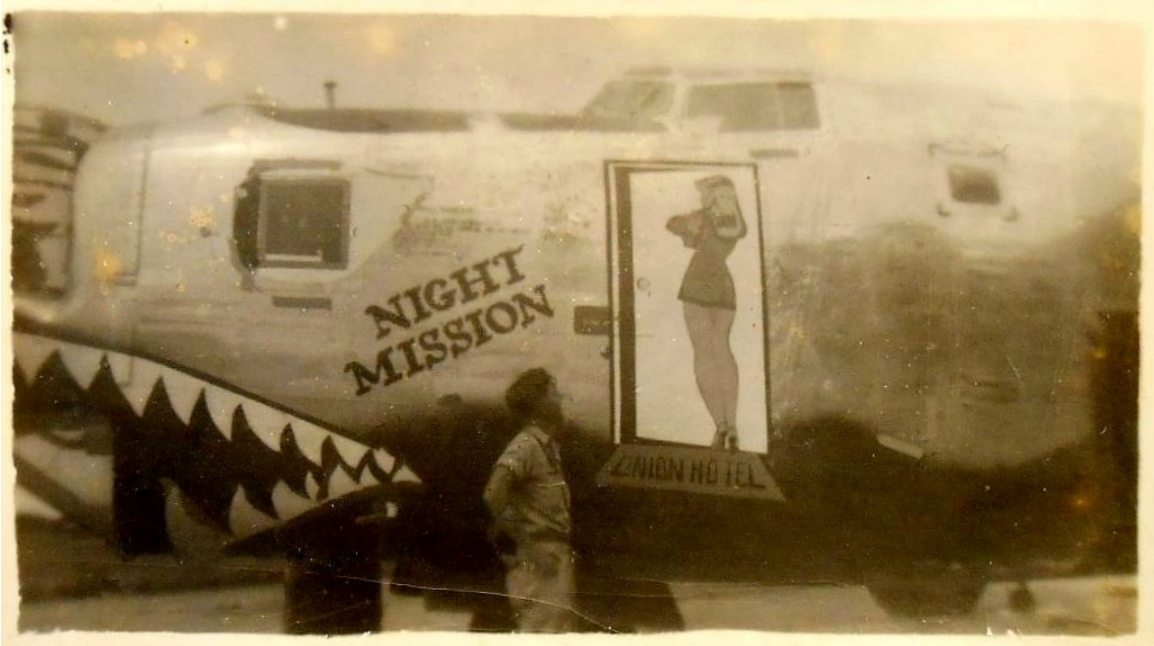
Figure 2. Original World War II photograph of B-24 Liberator nose art