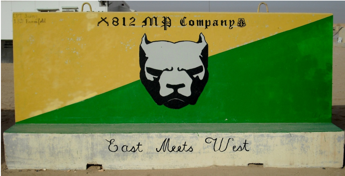
Figure 152. 812th Military Police Company

L14. Unit: 812th Military Police Company. Service: Army Reserve, Orangeburg, New York. Date of Deployment: 2008-2009.