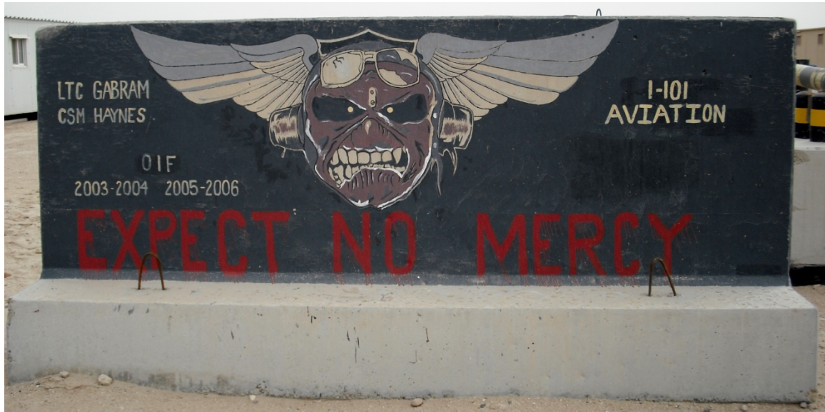
Figure 56. 1st Battalion, 101st Aviation Regiment

security in order that the destroyed Iraqi villages may be reborn and prosper. This symbolism is strengthened through the contrast of the night, and a new day dawning.