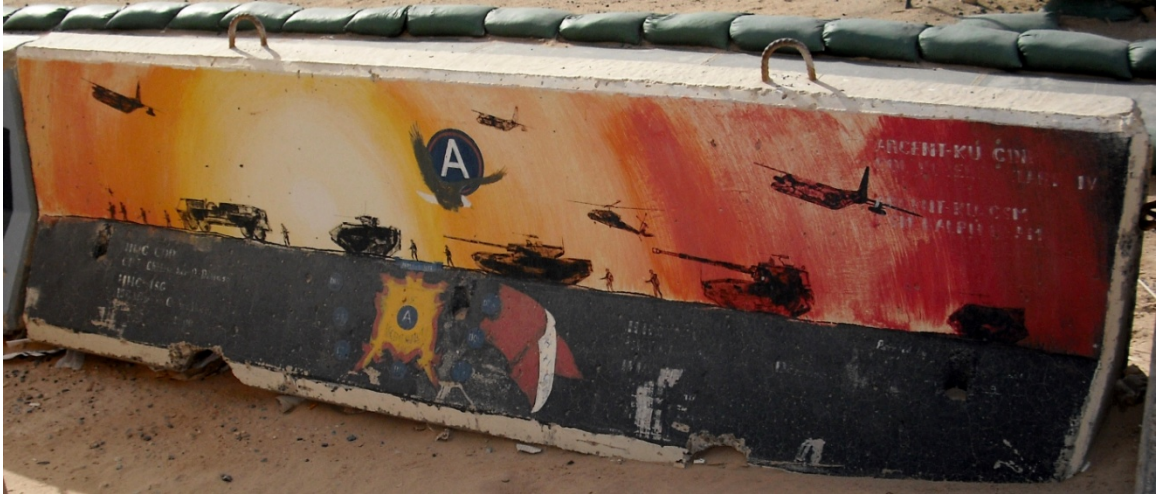
Figure 6. Headquarters, Headquarters Company, ARCENT, Third Army

A2. Unit: Headquarters, Headquarters Company, Army Central Command, Third Army. Service: Army Active, Sumter, South Carolina. Date of Deployment: 2000 or 2002.