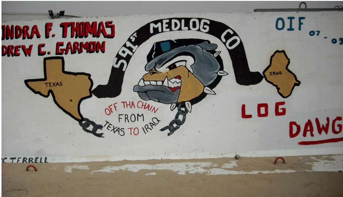
Figure 134. 591st Medical Logistics Company

portrays an aggressive posture toward the deployment, which would more commonly be seen in combat units.