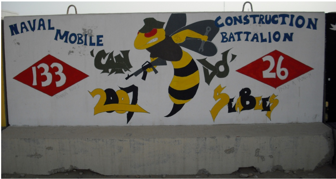
Figure 204. Navy Mobile Construction Battalions 26 and 133

T5. Unit: Navy Mobile Construction Battalions 26 and 133.