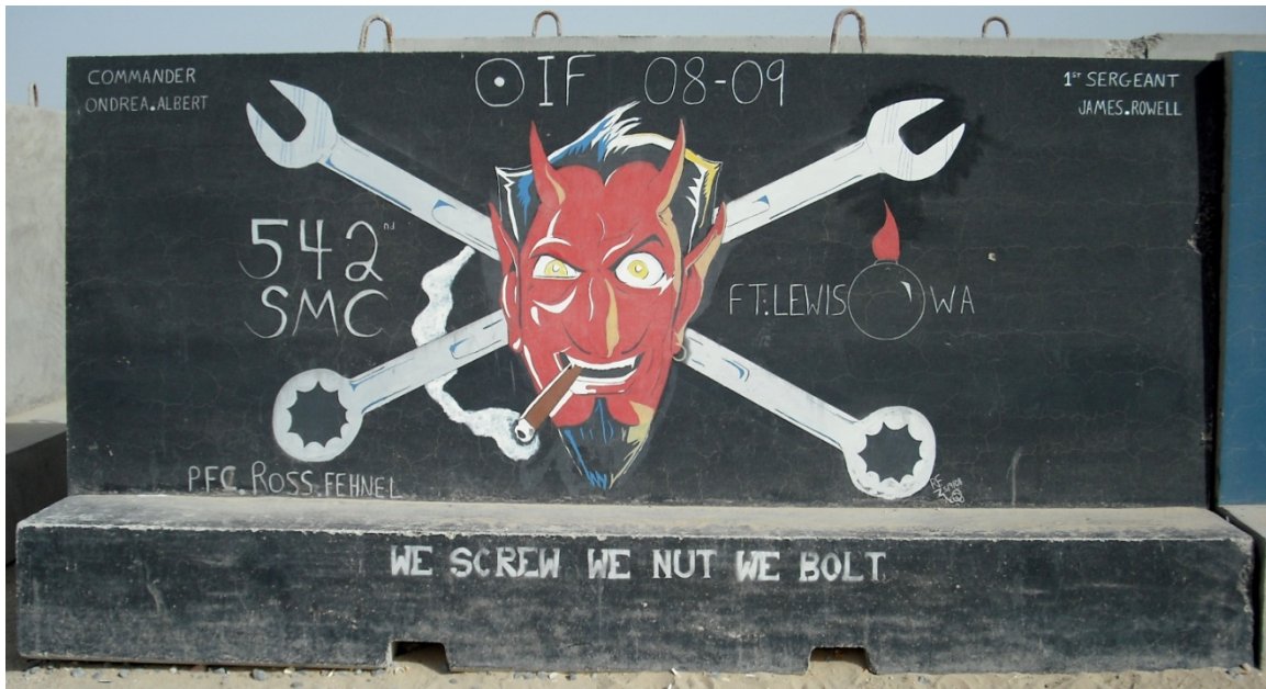
Figure 162. 542nd Support Maintenance Company

M7. Unit: 542nd Support Maintenance Company. Service: Army Active, Fort Lewis, Washington. Date of Deployment: 2008-2009.