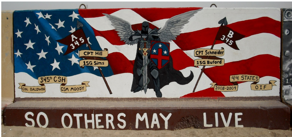
Figure 131. 345th Combat Support Hospital

drawing the viewer’s attention is a large sign advertising the company’s motto, “Scaling Above the Rest.” This motto is a double entendre referring to teeth cleaning as well as the unit’s standard setting service. To illustrate this, a superhero insect-like creature is depicted as climbing or “scaling” a dirty wall. As he does so, the areas he touches are cleansed by his elongated tongue and razor sharp teeth. In sum, the superhero embodies the unit’s professional standards and excellence. Anyone who needs their service can be certain of receiving dental care of the highest quality.