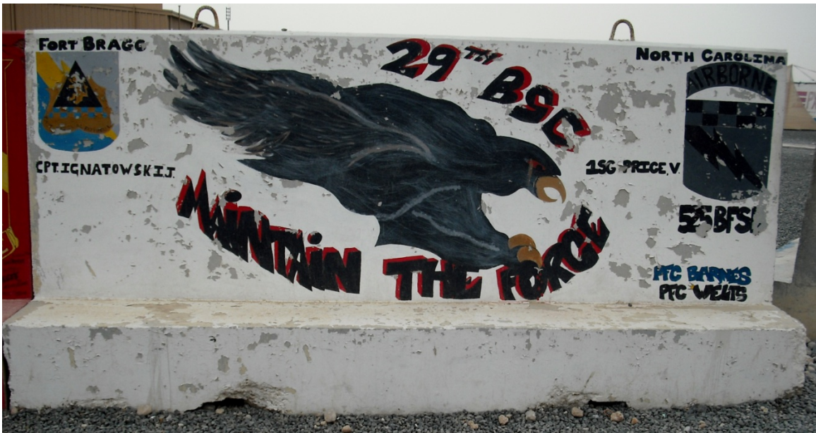
Support / Sustainment: 29th Brigade Support Company