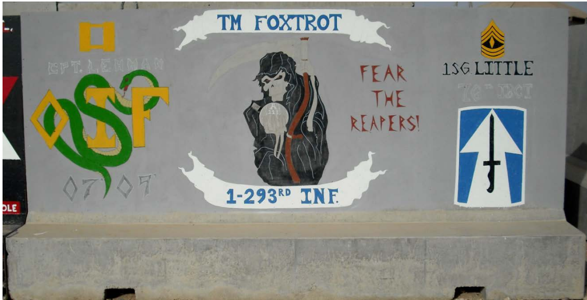
Figure 119. Team Foxtrot, 1st Battalion, 293rd Infantry Regiment

the barrier's message. Always seeking to improve, always seeking to be better is the drive of America's warfighters.