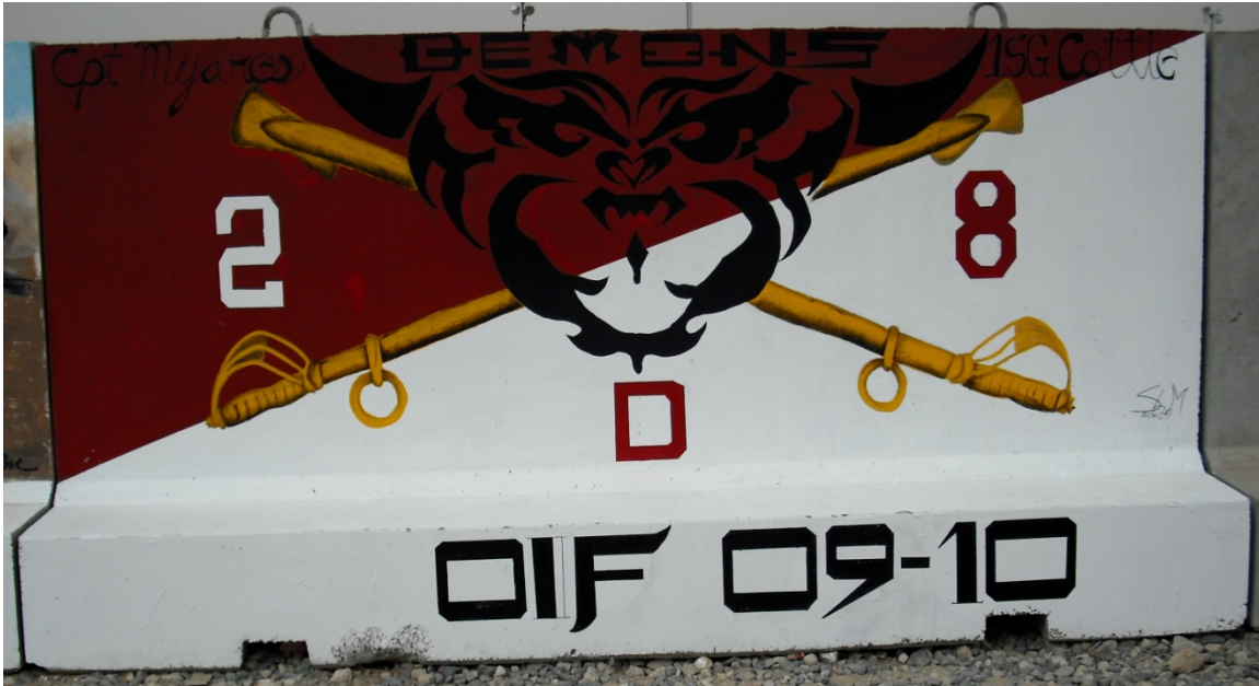
Figure 43. Company D, 2nd Battalion, 8th Cavalry Regiment

D16. Unit: Company D, 2nd Battalion, 8th Cavalry Regiment. Service: Army Active, Fort Hood, Texas. Date of Deployment: 2009-2010.