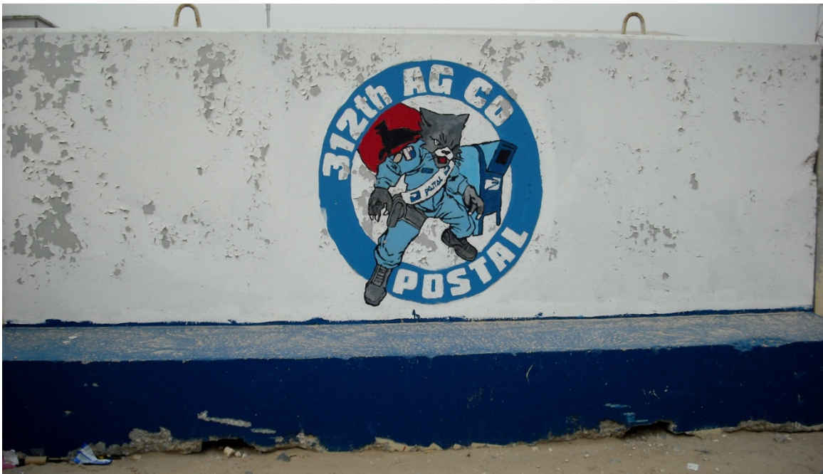
Figure 25. 312th Adjutant General Postal Company

B1. Unit: 312th Adjutant General Postal Company. Service: Army Reserve, Charlotte, North Carolina. Date of Deployment: 2006-2007.