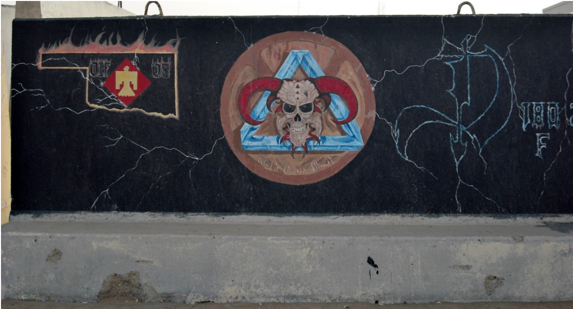
Figure 117. Company D, 1st Battalion, 180th Infantry Regiment

I15. Unit: Company D, 1st Battalion, 180th Infantry Regiment.*Incomplete photo Service: Oklahoma Army National Guard. Date of Deployment: 2007-2008.