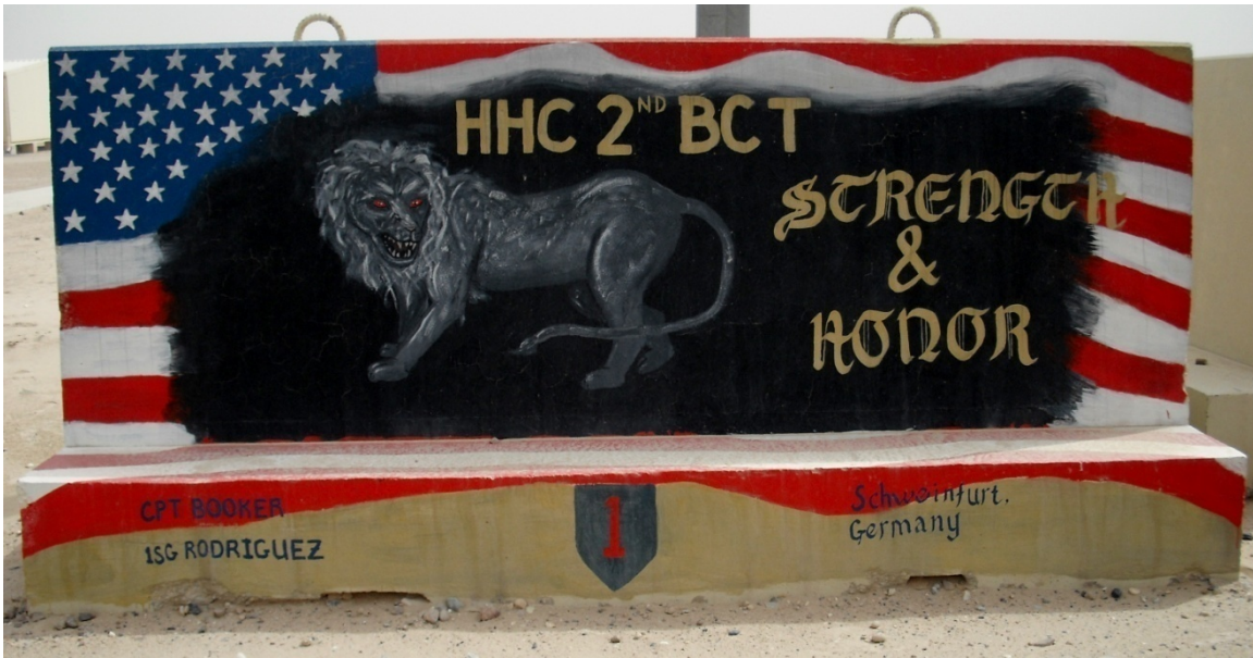
Figure 10. Headquarters, Headquarters Company, 2nd Brigade Combat Team

A6. Unit: Headquarters, Headquarters Company, 2nd Brigade Combat Team. Service: Army Active, Schweinfurt, Germany. Date of Deployment: 2006-2007.