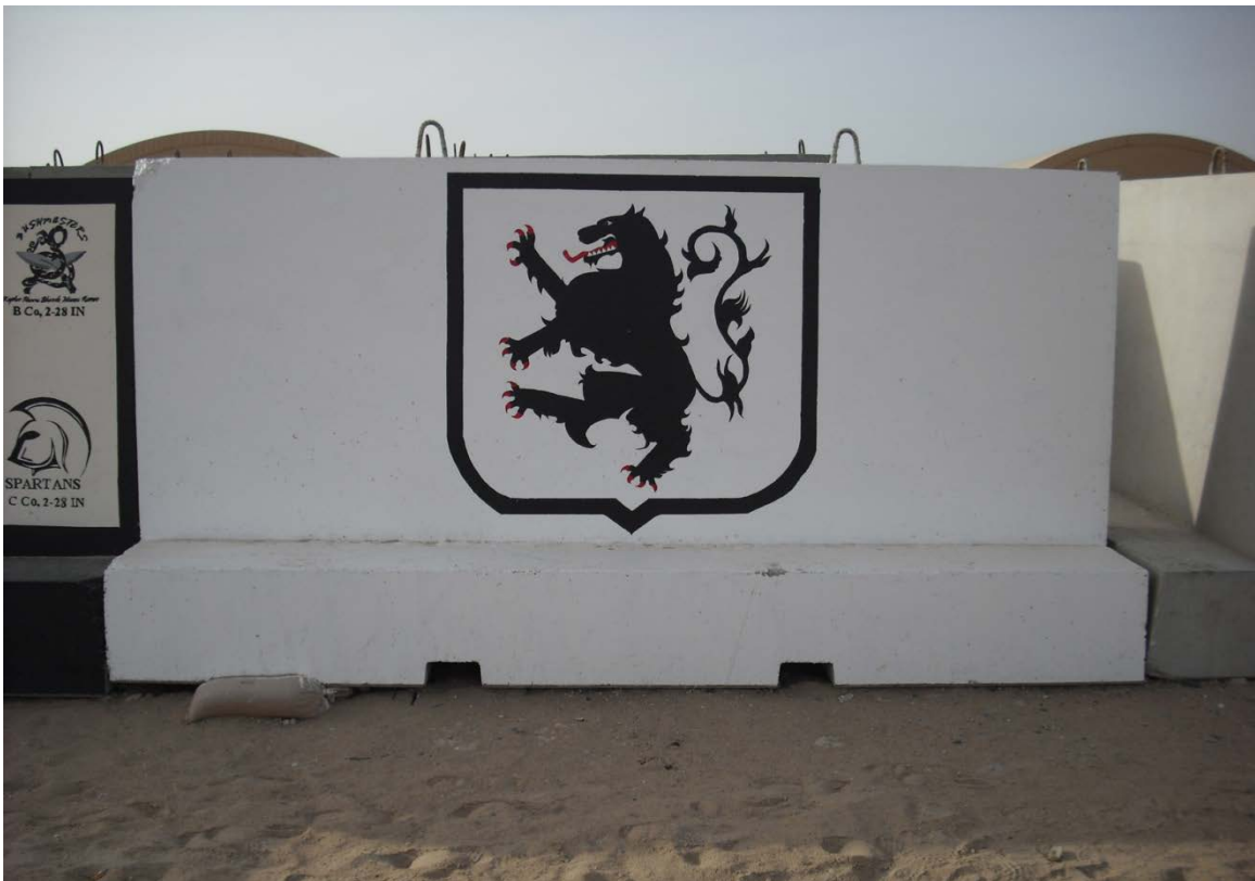
Insufficient data, unit unknown