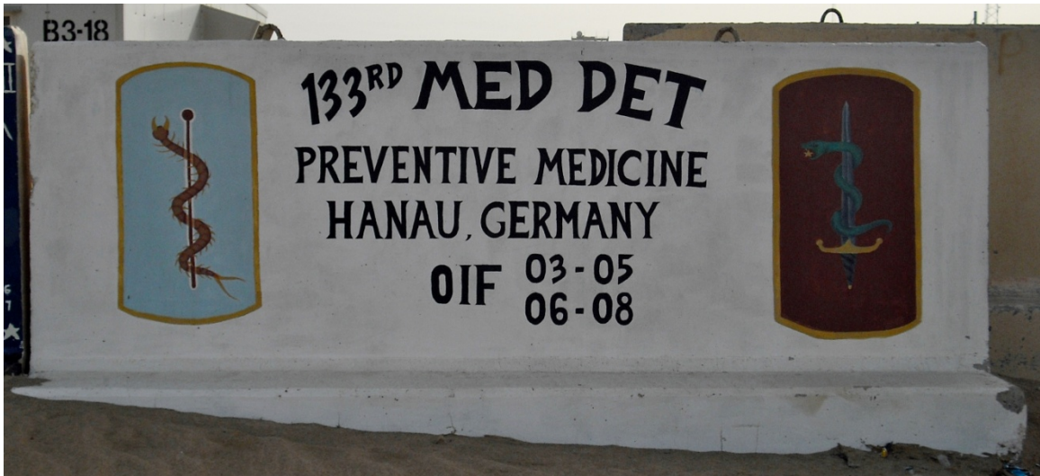
Medical: 133rd Medical Detachment (Preventative Medicine)