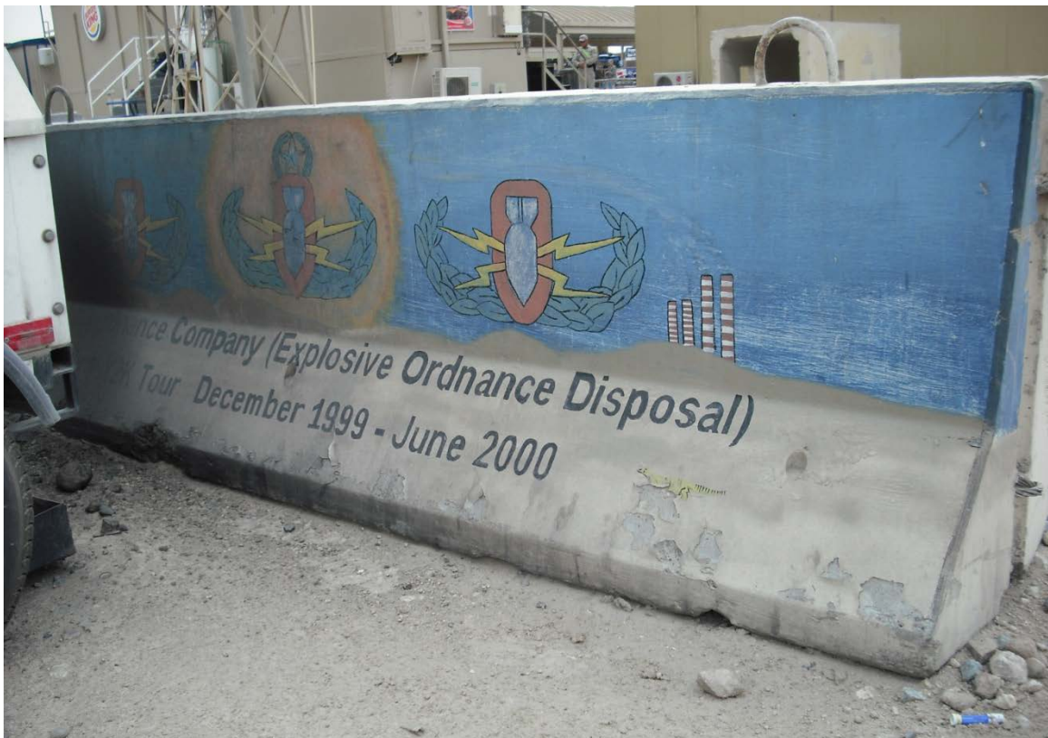
Insufficient data, unit unknown