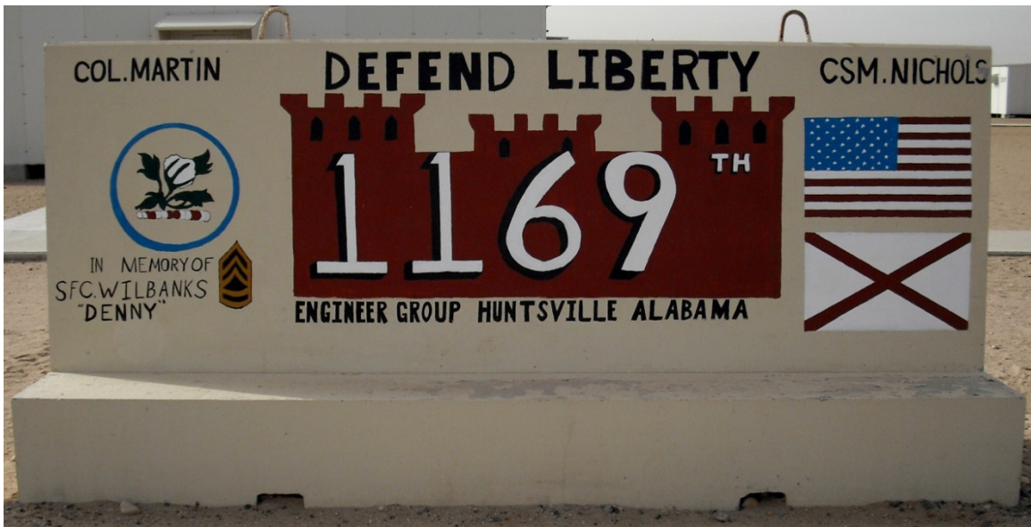
Figure 86. 1169th Engineer Group

The company's seahorse moniker has been adapted for the desert by incorporating centipede-like appendages and a scorpion stinger. In an Area of Operation known for scorpions and camel spiders, biting or stinging insects were high on the list of concerns. By incorporating the insect elements into the moniker, the company conveys that it will excel in the desert environment.