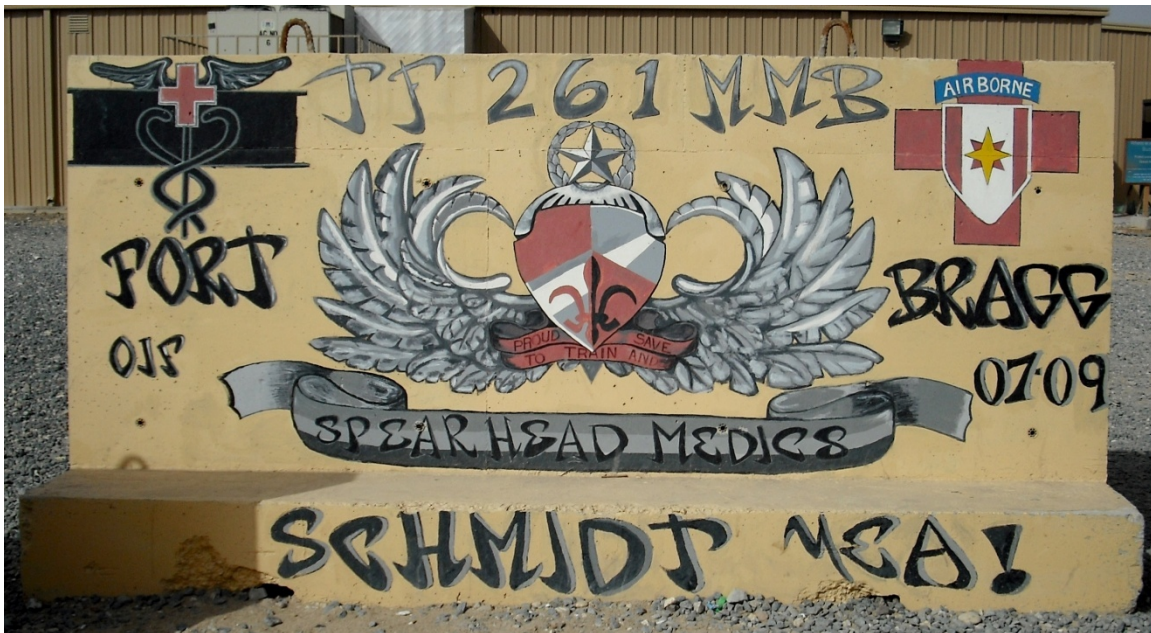
Figure 129. 261st Multifunctional Medical Battalion

The 256th Area Support Medical Company paints a colorful barrier that resembles a vacation postcard and delivers a salutation to other deploying troops. The state of Florida and its sunny beaches are a focal point with the unit's home base specifically annotated. Vibrant colors are employed to reflect the message of home state pride and appreciation. Additional elements include standard barrier fare such as; unit insignia, higher headquarter patch (50th Area Support Group), and unit leadership.