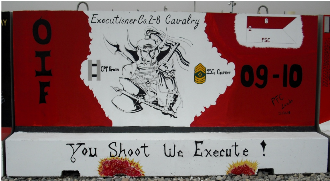
Figure 44. : Forward Support Company E, 2nd Battalion, 8th Cavalry Regiment

D17. Unit: Forward Support Company E, 2nd Battalion, 8th Cavalry Regiment. Service: Army Active, Fort Hood, Texas. Date of Deployment: 2009-2010.