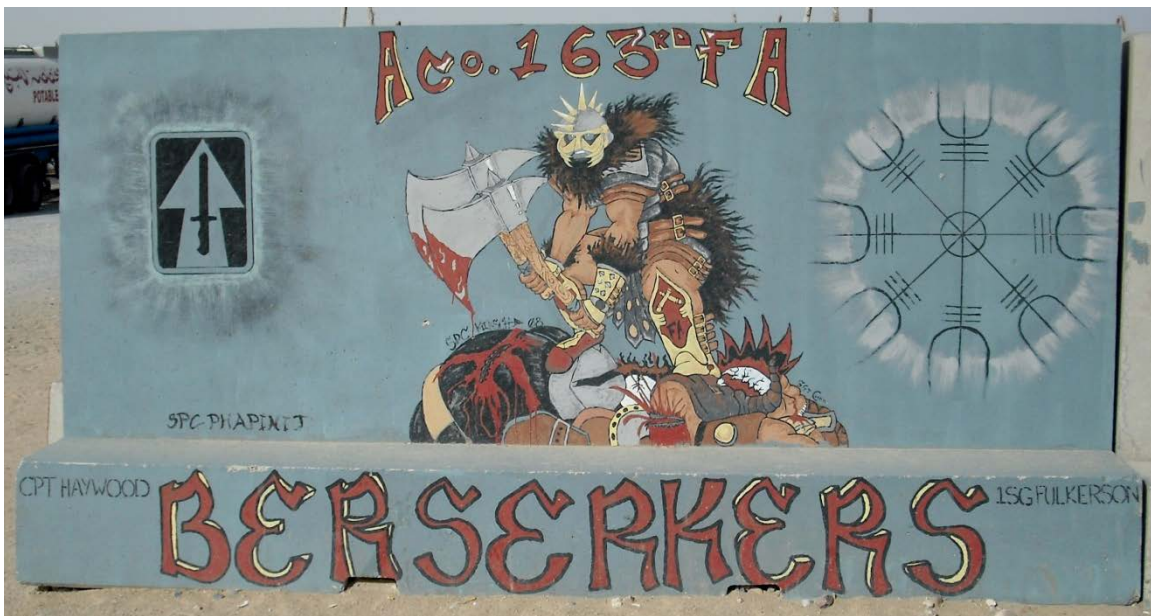
Figure 102. Battery A, 1st Battalion, 163rd Field Artillery Regiment

appears to be half dragon, half fang-bearing devil, and threatens certain destruction. Its circularly cloaking wings are raised as if to warn the onlooker that they will be enveloped. Smoke and fire are added as standard dragon fare. In sum, this Field Artillery unit presents itself as a dragon that has been provoked and is poised to unleash hell with destructive “fires” upon the enemy.