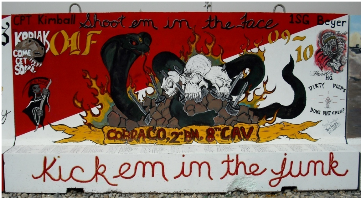
Figure 42. Company C, 2nd Battalion, 8th Cavalry Regiment

D15. Unit: Company C, 2nd Battalion, 8th Cavalry Regiment. Service: Army Active, Fort Hood, Texas. Date of Deployment: 2009-2010.