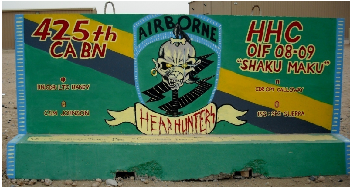
Figure 74. Headquarters, Headquarters Company, 425th Civil Affairs Battalion

F1. Unit: Headquarters, Headquarters Company, 425th Civil Affairs Battalion. Service: Army Reserve, California. Date of Deployment: 2008-2009.