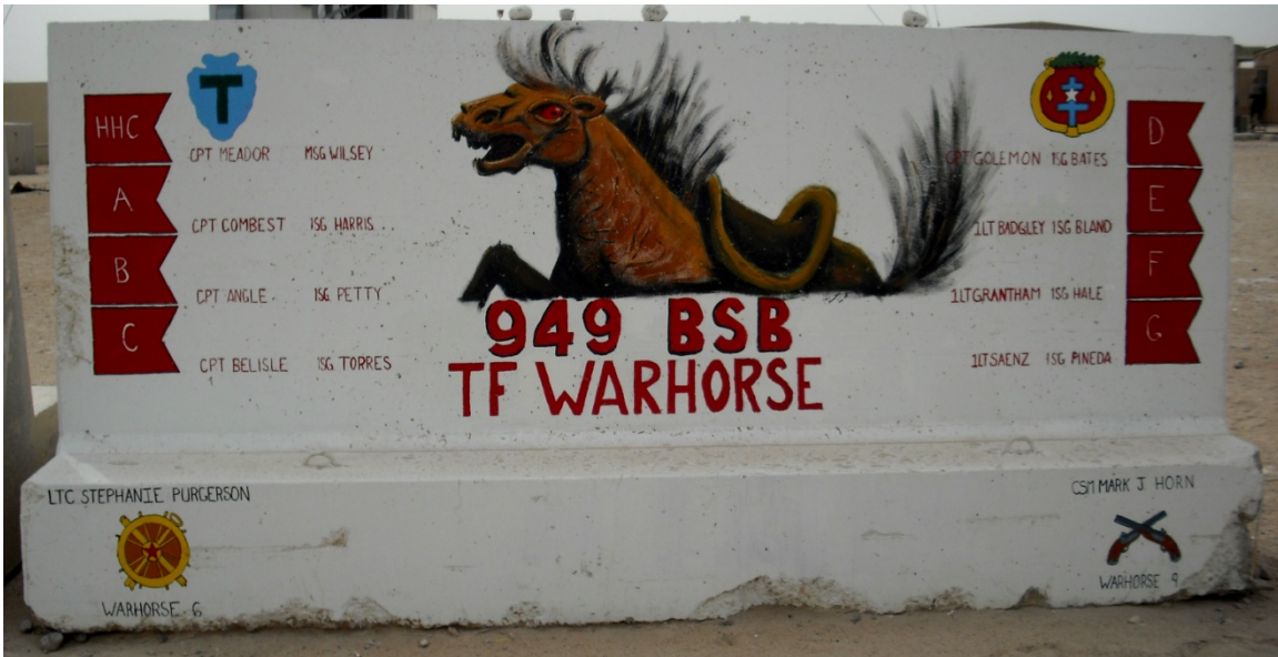
Figure 187. 949th Brigade Support Battalion

Q16. Unit: 949th Brigade Support Battalion. Service: Texas Army National Guard, Fort Worth, Texas. Date of Deployment: 2008-2009.