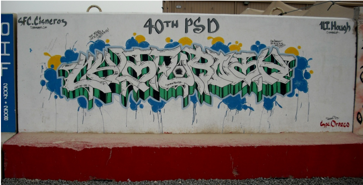
Figure 179. 40th Personnel Services Detachment

Q8. Unit: 40th Personnel Services Detachment. Service: California Army National Guard, Sacramento, California. Date of Deployment: 2006-2007.