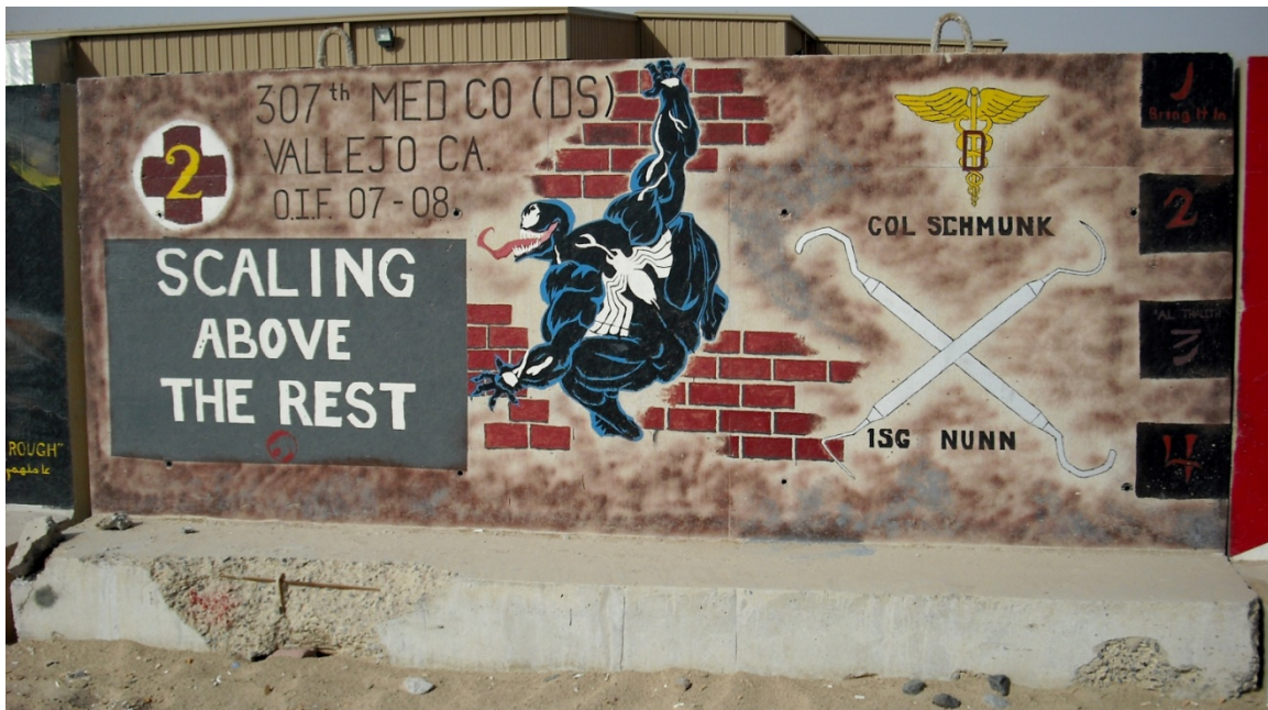
Figure 130. 307th Medical Company (Dental Services)

The barrier's central theme is positioned horizontally across the center. "Point of the spear" is the term used to indicate units that are at the very front combating enemy forces. Thus, "Spearhead Medics," is indicative of highly trained Soldiers prepared for enemy engagement at the front lines. Airborne wings and mention of the Fort Bragg home station demonstrate the unit's pride in its identity.