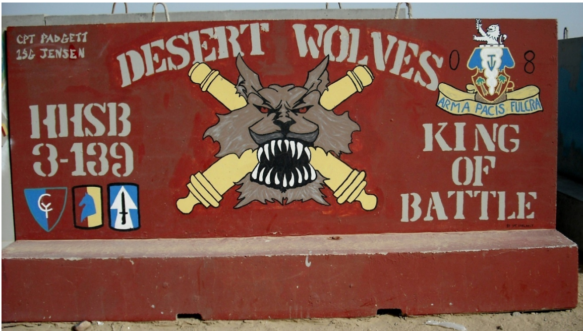
Field Artillery: HHSB, 3rd Battalion, 139th Field Artillery Regiment