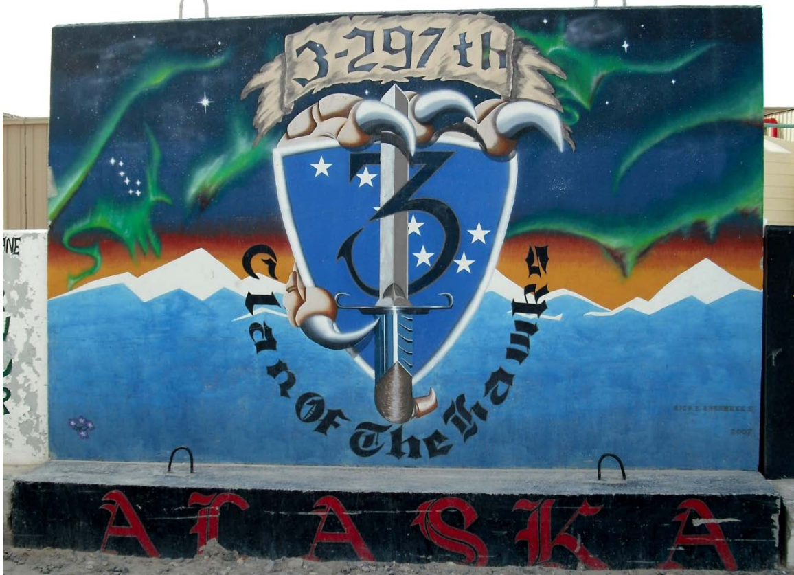
Figure 120. 3rd Battalion, 297th Infantry Regiment

Indiana Regiment mustered during the Civil War. Hence, the motto, “Fear the Reapers” is a warning that Team Foxtrot Soldiers fight in the tradition of heralded Indiana Regiments and are not to be trifled with. Clearly, Team Foxtrot draws inspiration from those who have gone before them.