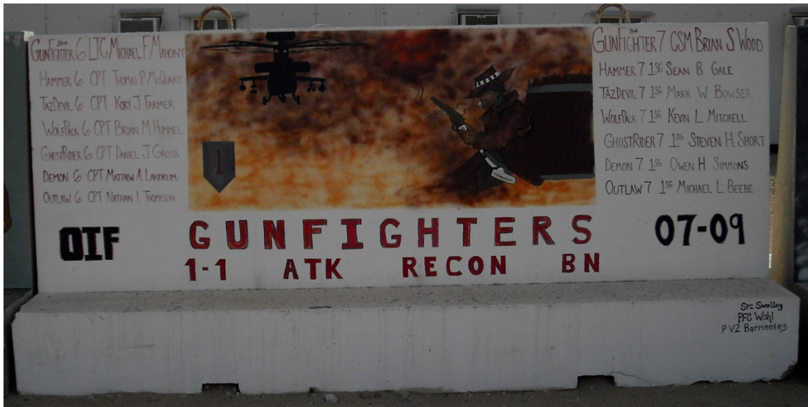
Figure 51. 1st Attack Reconnaissance Battalion, 1st Aviation Regiment

E1. Unit: 1st Attack Reconnaissance Battalion, 1st Aviation Regiment. Service: Army Active, Fort Riley, Kansas. Date of Deployment: 2007-2009.