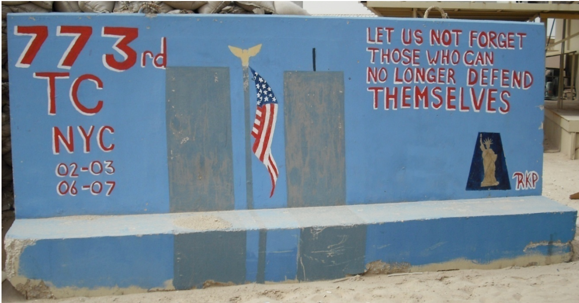
Figure 193. 773rd Transportation Company, 77th Sustainment Brigade

R5. Unit: 773rd Transportation Company, 77th Sustainment Brigade. Service: Army Reserve, Fort Totten, New York. Date of Deployment: 2006-2007.