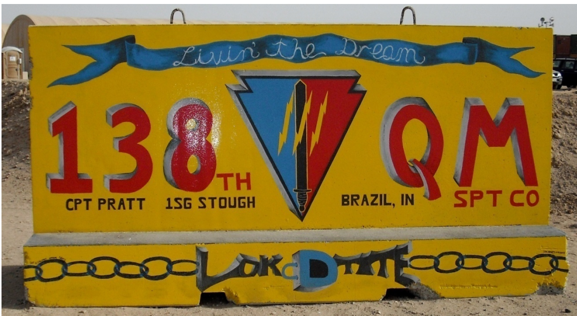
Figure 168. 138th Quartermaster Support Company

O1. Unit: 138th Quartermaster Support Company. Service: Indiana Army National Guard, Brazil, IN. Date of Deployment: 2008-2009.