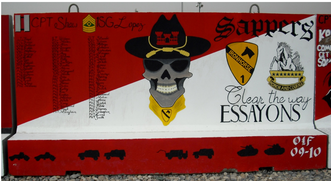
Figure 75. Special Troops Battalion (Engineers), 1st Brigade Combat Team

G1. Unit: Special Troops Battalion (Engineers), 1st Brigade Combat Team. Service: Army Active, Fort Worth, Texas. Date of Deployment: 2009-2010.