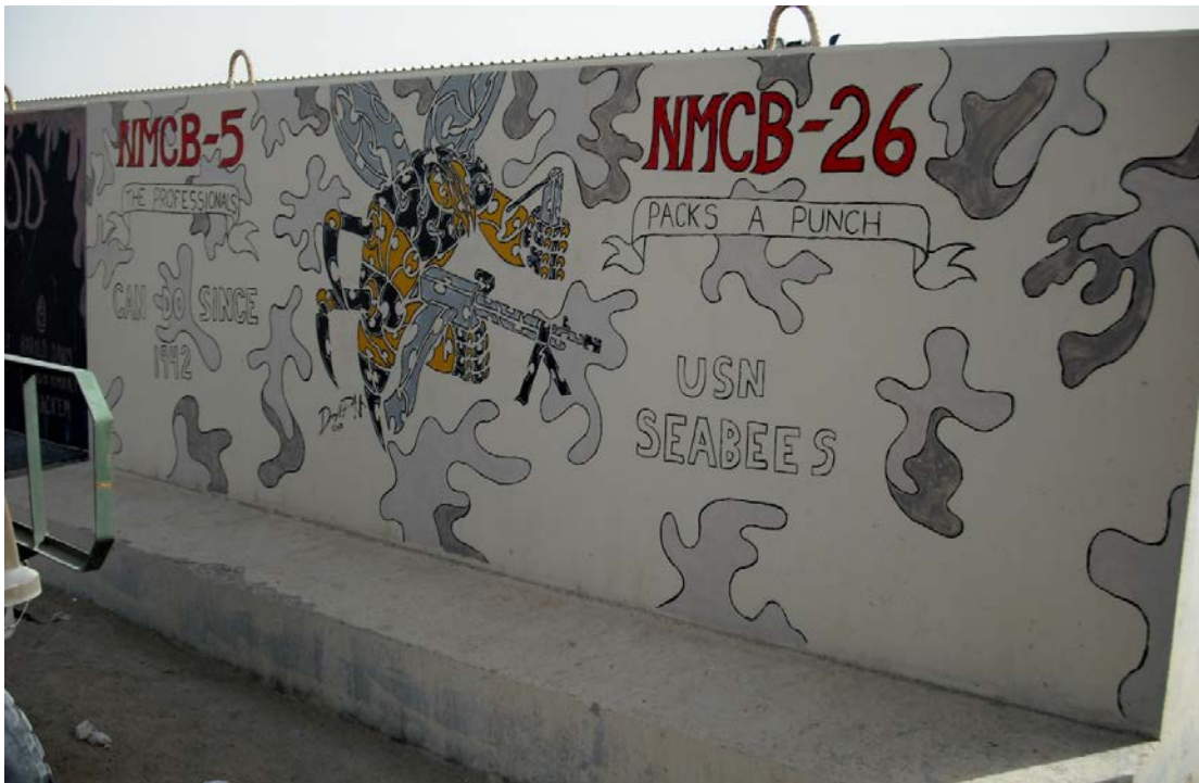
NMCB 5 and 26.