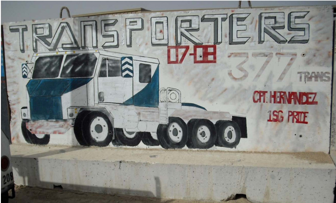
Figure 192. 377th Transportation Company, 142nd Combat Sustainment Support Battalion

R4. Unit: 377th Transportation Company, 142nd Combat Sustainment Support Battalion. Service: Army Active, Fort Bliss, Texas. Date of Deployment: 2007-2008.