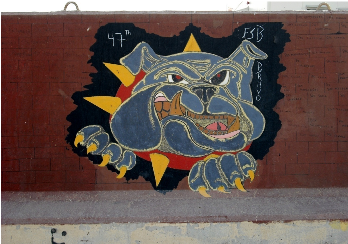
Support / Sustainment: Company B, 47th Forward Support Battalion