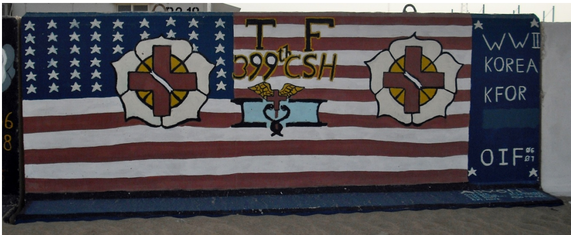
Figure 132. 399th Combat Support Hospital

encompassing American flag. The medical symbol incorporating a knight signifies honor in profession and military might. The motto, “So Others May Live,” points to the nobility of a life lived in service to others. Unity is recognized by the mention of forty- four represented states. Finally, battalion and company leadership is heralded as well. The values and principles put forward on this barrier provide inspiration for America’s fighting force and make this barrier a patriotic standout.