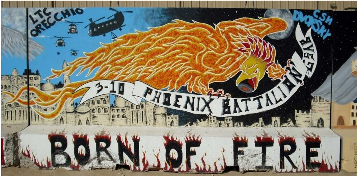
Figure 55. 3rd Battalion (General Support), 10th Aviation Regiment

E5. Unit: 3rd Battalion (General Support), 10th Aviation Regiment. Service: Army Active, Fort Drum, New York. Date of Deployment: 2008-2009.