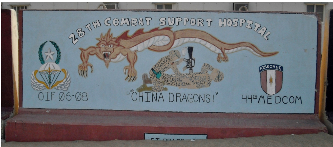
Figure 123. 28th Combat Support Hospital

Islands, coconut bearing palm trees, and a sand colored background. Additionally, the positioning of the Hawaiian Islands map gives the appearance of a hammock strung between the trees. Breaking from the common central mascot or moniker image, this unit features its identification and higher organization insignia (25th Infantry Division). The motto, “Always Ready,” is darkened for effect to indicate mission focus. While showing military readiness, this barrier simultaneously brings a message of peace and rest which is fitting for a medical mission.