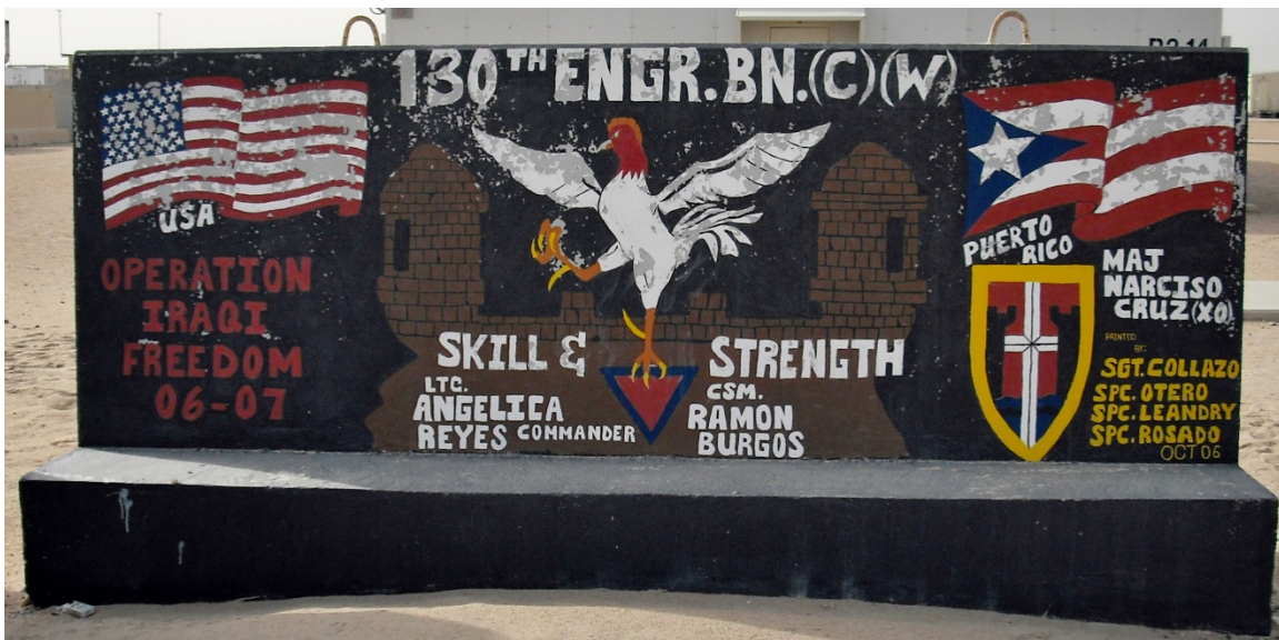
Figure 80. 130th Engineer Battalion (C) (W)

teeth, an enormous spiked collar, and a chain leash with attached skull at the handle end. Having chewed off portions of the Bravo sign, this bulldog is depicted as bursting with energy and ready to fight. Of additional note, the “Bulldogs” moniker has been adapted to “Bull Doggs,” giving it street gangster credibility. To further enhance the aggressive theme, the Soldier’s firearm is shown burning through lead as shell casings are ejected in mass. All in all, the barrier implies a unit with attack readiness and street experience.