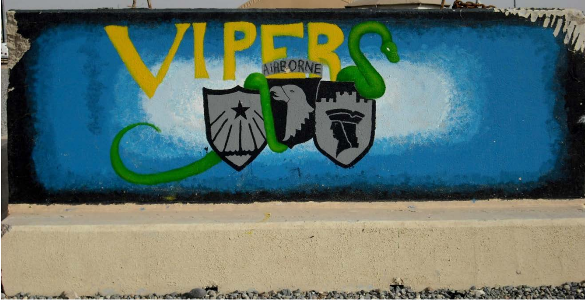
Insufficient data, unit unknown