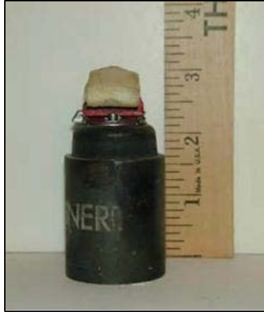
Figure 1. M77 Submunition