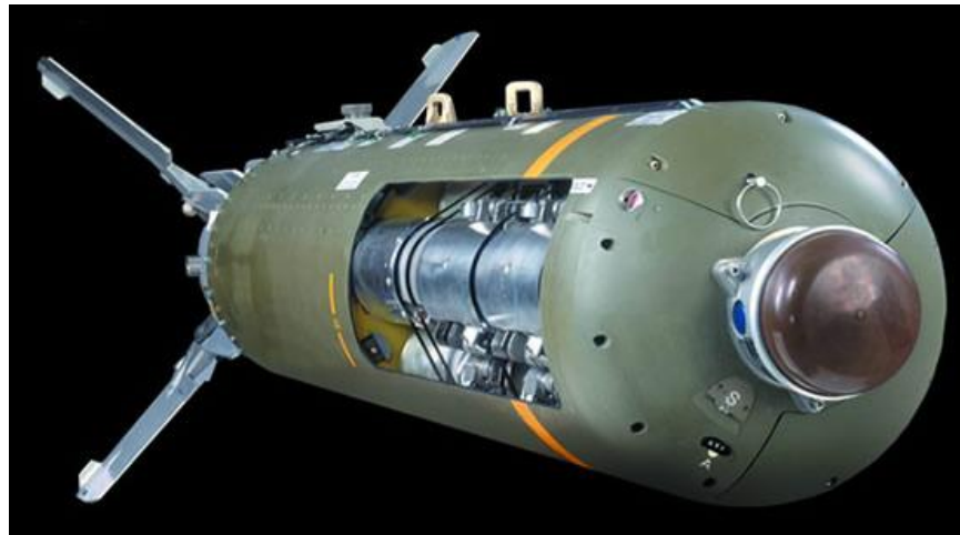
Figure 2. CBU-105 SFW

The CBU-105 Sensor Fuzed Weapon (SFW) has been in development since the early 1990s, with several upgrades. The SFW dispenses 10 submunitions, each with 4 skeet warheads. See Figure 2. Over that time, the tested UXO rate on these warheads has dropped by an order of magnitude of around 5% to around 0.5%. The latest variant underwent 17 separate tests—primarily production verification tests—from 2002 until 2008. These tests yielded 3 duds classified as UXO out of 625 armed warheads. This testing, in conjunction with engineering analyses, was viewed as sufficient to determine compliance with the 1% UXO requirement. Retrospectively, we analyzed the combined data from these tests and found that a UXO rate of less than 1% was demonstrated with 87% confidence.