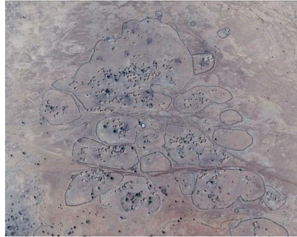
Village of Som – aerial view