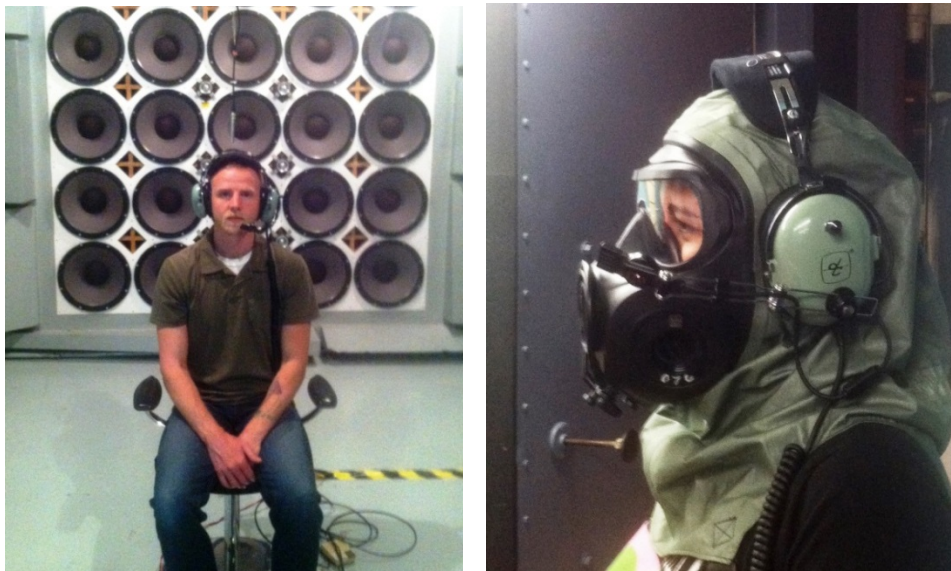
Figure 3. Subject wearing David Clark H10-76 headset (left) and subject wearing David Clark H10-76 headset with the M53 hood (right) for MIRE measurement

Ten paid volunteer subjects (6 male, 4 female) participated in the attenuation measurements on the David Clark H10-76 headset worn with and without the M53 hood (Figure 3). The ten subjects ranged in age from 18 to 34 with a mean age of 21 years. All subjects were expertly fitted by a trained program representative. The hood size distribution was as follows: two subjects were fitted with size large, five subjects were fitted with size medium, and three subjects were fitted with size small.