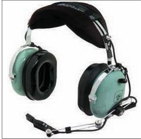
Figure 2. David Clark H10-76 Headset