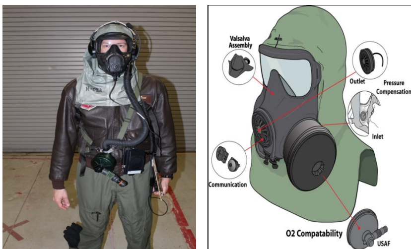
Figure 1. Person wearing M53 (left) and schematic drawing of M53 (right)

The M53 hood, shown in Figure 1 below, provides “above-the-shoulder” chemical/biological (CB) protection for the respiratory system in an actual or perceived CB warfare environment. The M53 is programmed for utilization in United States Air Force, United States Navy, United States Marine Corp, and United States Coast Guard strategic aircraft. The system was designed to be worn with all the current below-the-neck ensembles. Air and ground crewmembers don the M53 hood based on current threat and operational requirements. Personnel also perform extended ground duties such as pre-flight, post-flight, rearming, refueling and cargo loading of aircraft while wearing the M53 hood and emergency actions such as ground escape and evasion. This system was developed to replace the currently used protective mask. The David Clark H10-76 headset (Figure 2), a typical headset worn by aircraft maintainers and flight crews, was tested with the M53. The headset has active noise reduction (ANR) capabilities. However, ANR was not assessed during these measurements; the measurements were passive performance only.