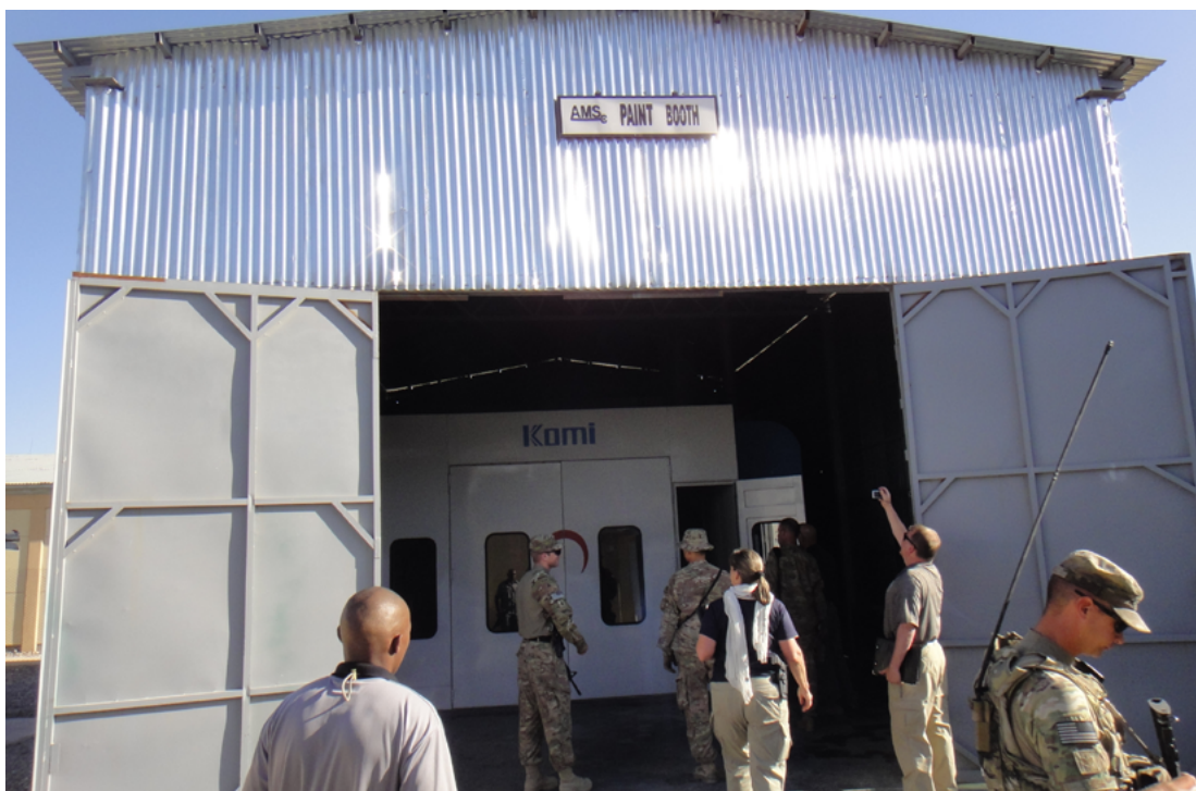
Figure 15: Advisors Accompany IG Team on Tour of ANP Contracted Maintenance Facility

The length of advisor tours varied from 4 months to several years, hindering advisor unity of effort. A senior Coalition officer in a Regional Command noted that some advisors were addressing short-term issues instead of systemic issues as required by the mission. He also stated that some advisor efforts were fragmented. For example, a senior ministry advisor related that budget advising was not synchronized because advisors at the MoI lacked visibility of the budget training conducted by Coalition Contract Advise and Assist Team advisors in the provinces. CSTC-A planned to add 60 budget and procurement advisors and 20 sustainment and logistics advisors by December 2014 in response to MoI and ANP advisor fragmentation and shortages.