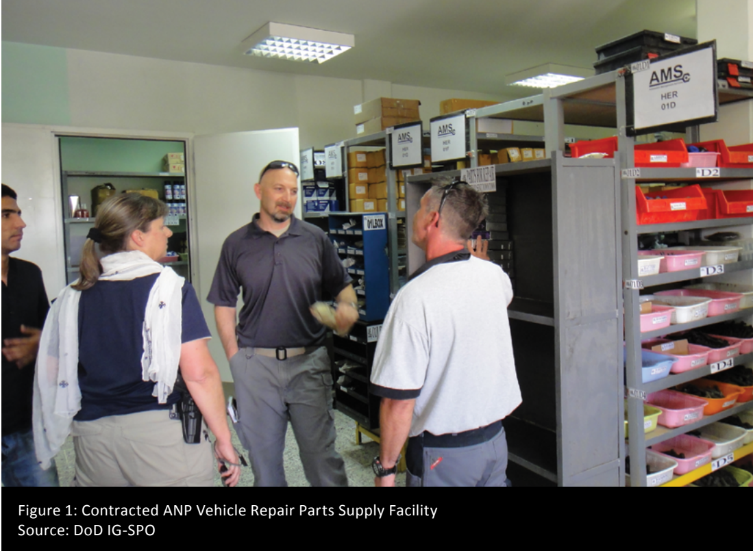
Figure 1: Contracted ANP Vehicle Repair Parts Supply Facility