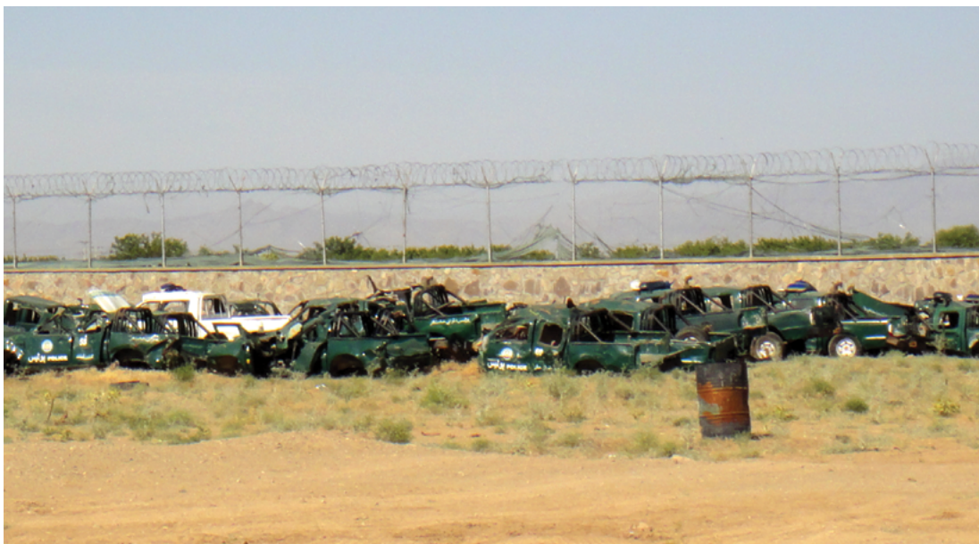
Figure 6: Scrap ANP Vehicles in Regional ANP Vehicle Yard

ANP logistics advisor reported that the organization he advised had three times its authorized quantity of small arms. Fifty percent of these were non-mission capable, but due to excess inventory, the unit readiness rate for weapons was still 100 percent. Coalition advisors cited similar examples related to excess vehicles in ANP unit inventories.