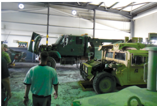
Figure 13: ANP Contracted Maintenance Facility-Tactical Vehicles

To expedite the anticipated transition from contracted maintenance, Coalition and MoI planners focused on strengthening organizational maintenance capability across the ANP. With Coalition assistance, MoI leadership would ensure a small number of district and provincial ANP maintenance facilities had a sufficient number of trained mechanics and adequate tools on site. The MoI would then issue a small quantity of repair parts to units to facilitate unit responsibility, and would urge them to exercise the ANP parts request process to request additional repair parts. In addition to supporting the Afghan-led pilot project, Coalition advisors planned a phased reduction of contractor support, expecting the ANP to exercise increased levels of responsibility for its own maintenance over time.