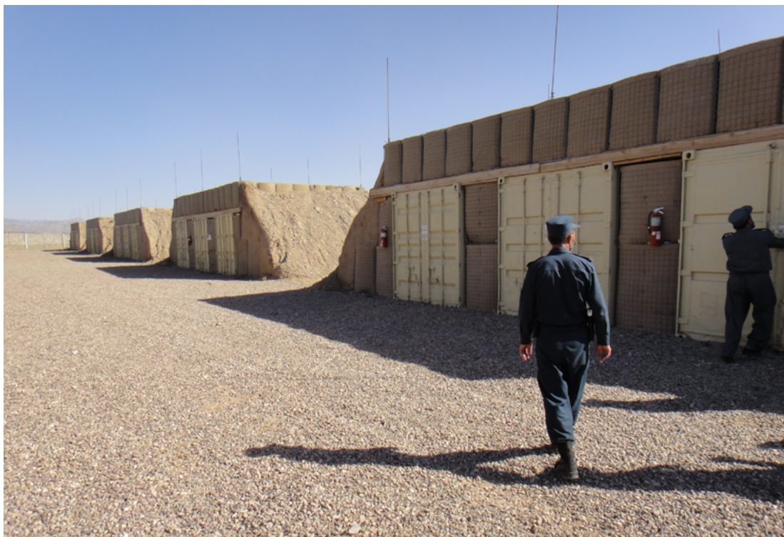
Figure 16: ANP Ammunition Storage Facility