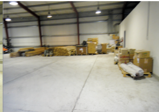
Figure 10: Regional ANP Supply Warehouse with Construction and Barrier Materials