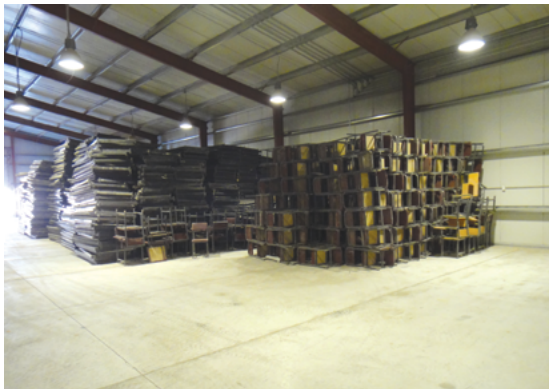
Figure 9: Regional ANP Supply Warehouse with Stacks of Classroom Desks

The RLCs had a history of not having the supplies their supported units required. Advisors in Kabul told the IG team that the RLC in Kabul was supposed to support nine provinces, but three of them ordered and received supplies directly from the NLC. An ANP logistics officer in Kandahar verified he ordered supplies directly from the NLC if the RLC did not have them on-hand. Advisors to the Kandahar provincial police headquarters said their advised unit bypassed the RLC because the Center “didn’t have the right supplies for units to order and build their confidence in the pull system.” Coalition force advisors throughout the country echoed this concern. The Deputy Commanding General for Force Development in Regional Command – South acknowledged his advised RLC had some supplies, but questioned whether the right supplies were regularly in its inventory to instill confidence in the ordering process. 7 An advisor in Kabul said that the RLC must have readily available supplies and commodities, along with NLC enforcement of MoI policy, to cause police units to use it. In Herat, the RLC advisors said that the provincial headquarters and ABP units regularly used the RLC, but would circumvent it when the RLC did not have what they needed.