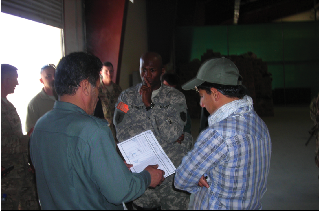
Figure 2: ANP Supply Manager Explains the MoI Supply Request Process Request Process