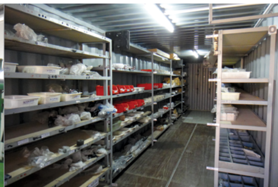
Figure 14: ANP Contracted Maintenance Facility-Vehicle Repair Parts Stockage