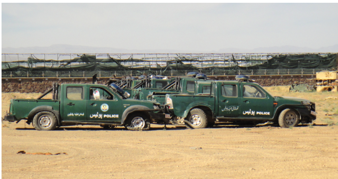
Figure 3: Potentially Repairable ANP Vehicles in Regional ANP Vehicle Yard

Coalition force unit advisors reported that ANP supply personnel often misunderstood or ignored inventory and consumption documentation. At the National and Regional Logistic Centers, for example, supply personnel routinely failed to reconcile supply shipments with supplies still due to the customer. They shipped what was available and cancelled the remainder of the order. In many instances, ANP supply managers only had visibility of available supplies at their own organization. Coalition and MoI leaders discussed options for automating the ANP inventory management system to improve efficiency, accountability, and oversight. However, Coalition force advisors believed that the existing manual inventory management system would be sufficient for most supply chain processes, if ANP leadership would enforce its use.