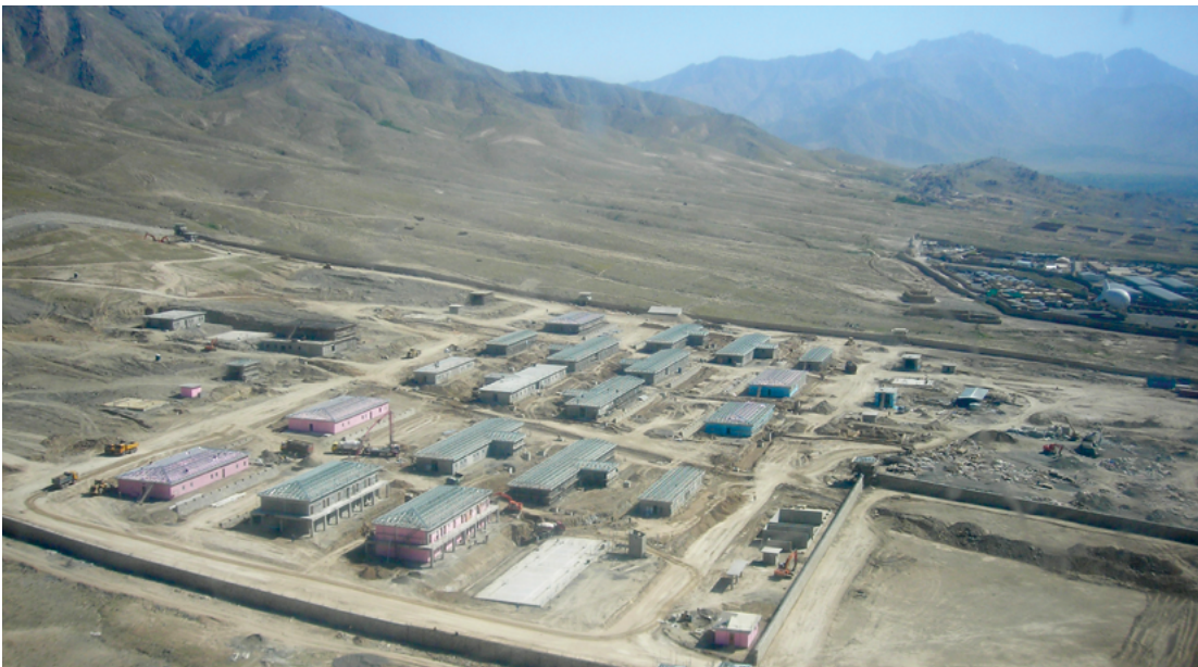
Figure 5: Facilities Construction at the National Logistics Center

ANP officials reported facility budget shortfalls across the organization. One RLC commander stated that the funding received by his Facilities Manager did not satisfy RLC maintenance requirements and allowed only for limited repairs of the highest-priority projects. The Commander of the Afghan National Civil Order Police (ANCOP) observed that two ANCOP battalions did not yet have permanent facilities. Finally, an Afghan Border Police (ABP) facilities officer reported he had not received the budget allocation he required to maintain over 135 buildings and checkpoints in his zone of operations.