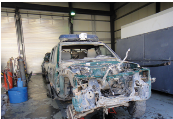
Figure 7: ANP Light Tactical Vehicle (LTV) Awaiting Repair by ANP and Afghan Civilian Personnel

The Coalition required an MoI fleet management plan prior to transition of responsibility for vehicles and other end-item equipment to the MoI. Key considerations included timing, availability of MoI resources, and competing priorities. Acknowledging the long-term importance of a viable fleet management plan for both the ANA and ANP, the CSTC-A Commander requested a team from the U.S. Army Tank Automotive and Armaments Command Life Cycle Management Command to assess ANA and ANP fleet management needs and capabilities. This team arrived in August 2014 to conduct its initial planning assessment.