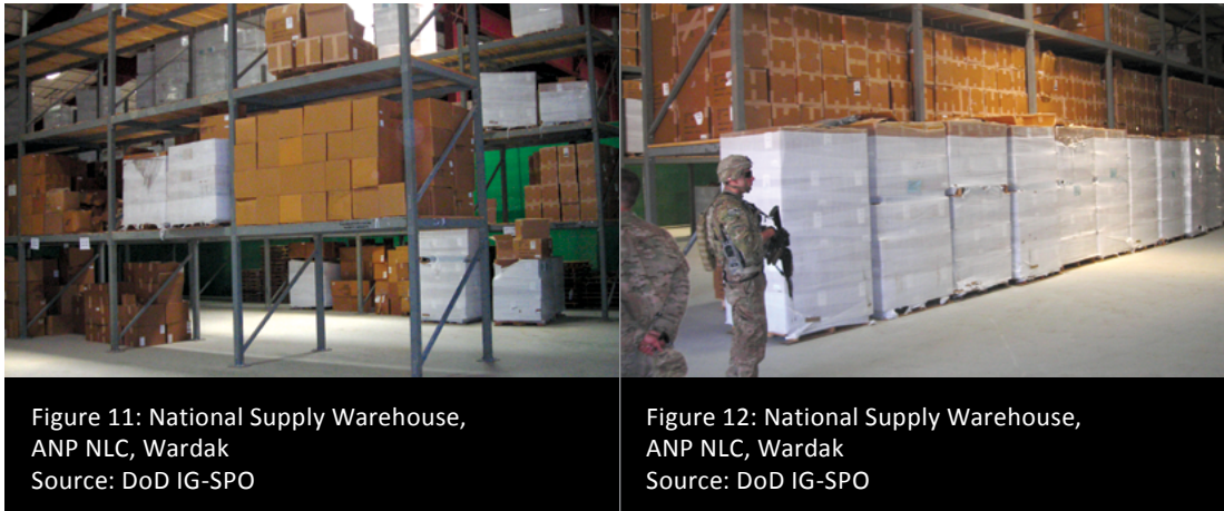
Figure 11: National Supply Warehouse, ANP NLC, Wardak

There were obvious advantages for units in geographic proximity to Kabul to obtain supplies directly from the NLC. However, in order to effectively develop RLCs as conceived in MoI logistics policy, MoI and ANP leadership needed to implement and enforce logistics policy throughout the entire chain of command, or change policy to reflect actual supply procedures that might be more practical and effective.