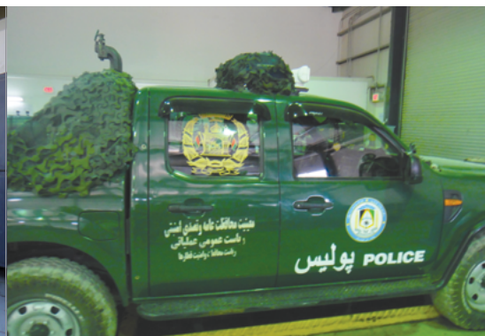
Figure 8: ANP LTV