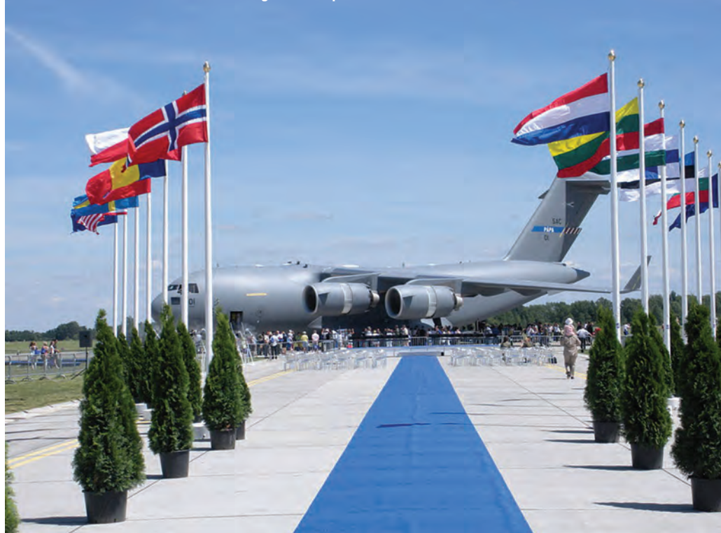
Twelve nations contribute to NATO strategic airlift capabilities

specifics in these historical statements, the real work of fleshing out the idea and putting it into practice will be confirmed as the Allies collectively announce and execute collaborative Smart Defence projects. Key to successful implementation will be whether the heads of state and government will be willing to make the bold political decisions that keep the organization funded to its level of ambition in the face of declining resources. They may have to demonstrate this resolve in a deepening economic crisis. Expect Smart Defence