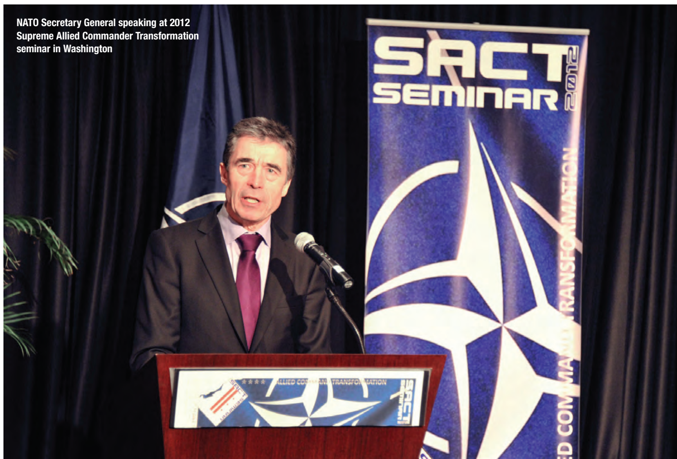
NATO Secretary General speaking at 2012 Supreme Allied Commander Transformation seminar in Washington

This strategic statement offered a new concept for a new century, and was immediately put to the test with the NATO operation in Libya, Active Endeavor. NATO