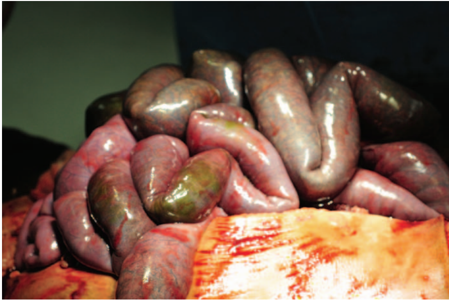
Figure 3. Findings at laparotomy; small bowel ischemia with full-thickness necrosis.

functions, and endocrine/peptide kinetics. Citrulline remains a promising marker for assisting with a unified definition in critical illness and in our patient showed a marked decline before the diagnosis of the most severe form of intestinal failure: acute necrotizing enterocolitis. Realizing that no single patient's condition can be used to define the utility of citrulline as a marker of intestinal dysfunction, our group is currently examining ways to determine the correlation between plasma citrulline levels in patients sustaining thermal and traumatic injuries and their clinical outcomes.