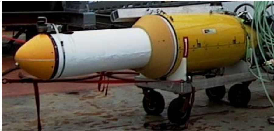
Figure 3. 12.75" Laser Line Scanner payload installed on ROVEX during July operations