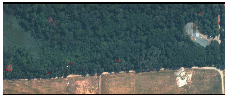
Figure 3 - Application of Target Detection Algorithms Searching for Green Panels [Image on left demonstrates multiple false alarms using direct spectral matching technique. Image on right demonstrates accurate detection of concealed panels using Invariant Algorithm]