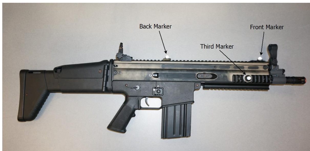
Figure 1. A simulated weapon with front and back pointing markers. The back marker is also used to determine the subject's fore-aft position on the treadmill for purposes of pointing corrections. The optional third marker is used to identify the front and back pointing markers in the motion capture system.