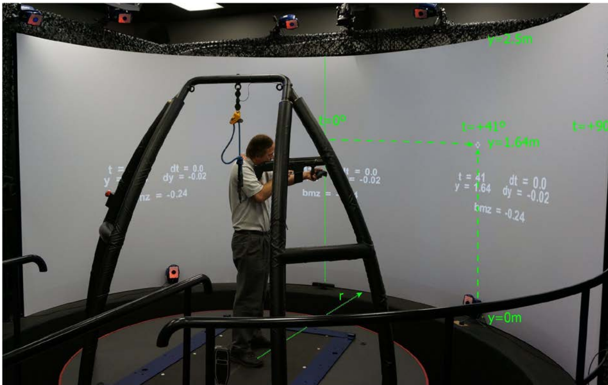
Figure 3. Measuring the CAREN targeting error in the D-Flow pointing correction application. The real-time data from the CAREN targeting error measurement application is displayed in white.

A D-Flow software application was written for the purpose of measuring and correcting targeting errors. The user typically positions a mock weapon to achieve the desired nominal screen intercept position and back marker z value (i.e., subject's fore-aft position), and then adjusts the displayed target with a game controller joystick until the displayed target aligns with the weapon sights. Another button press on the game controller is used to write the pointing correction data to a file. The user should strive to maintain a normal shooting position with the weapon stock located near the centerline of the treadmill ( x \approx 0 ). The D-Flow targeting application displays the nominal t and y screen position, the dt and dy values required to correct the target, and also the z value of the back marker (denoted as bmz in the D-Flow application and Lua script) as shown in white print in Figure 3. For example, the screen intercept position in Figure 3 is t = 41^\circ to the right of center and y = 1.64 m above the base, and the back marker on the weapon is located at bmz or z = -0.24 m (forward from the origin). A pointing correction of dt = 0.0^\circ and dy = -0.02 m has been applied to match the mechanical aiming sights of the weapon to the projected crosshairs on the screen for this particular area of the screen shown in Figure 3.