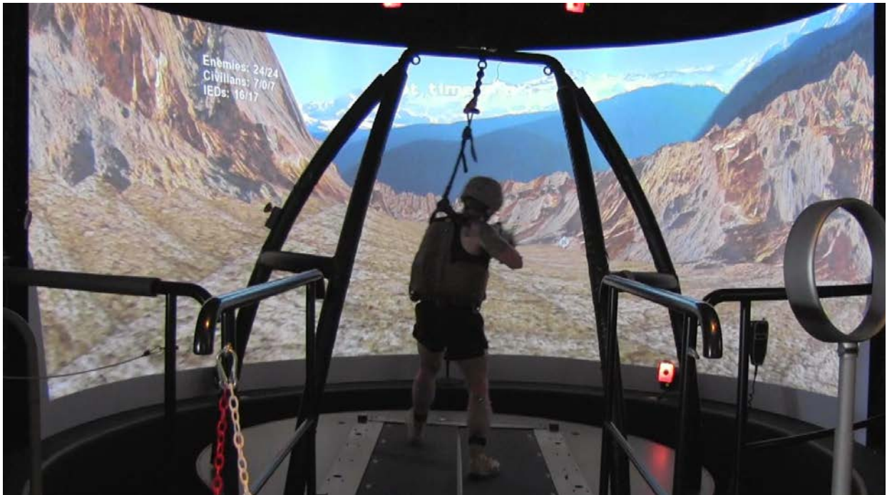
Figure 5. An application where the D-Flow pointing module is used to aim the weapon at targets. The projected target is indicated with a white circular symbol on the screen to the right of the subject.

B5 of Appendix B. Error values listed in Table B4 indicate that the horizontal residual targeting errors on the left side of the screen were very small. However, there were some concerns on the right side of the screen. This result is consistent with known projector blending issues with the CAREN at NHRC. The vertical targeting error residuals listed in Table B5 were consistently small across the entire screen. The initial implementation of pointing corrections as described in this document produced favorable results overall for the CAREN at NHRC and offers credence that the CAREN could be used as an effective shooting simulator so that realistic targeting can be incorporated within CAREN software applications (Figure 5).