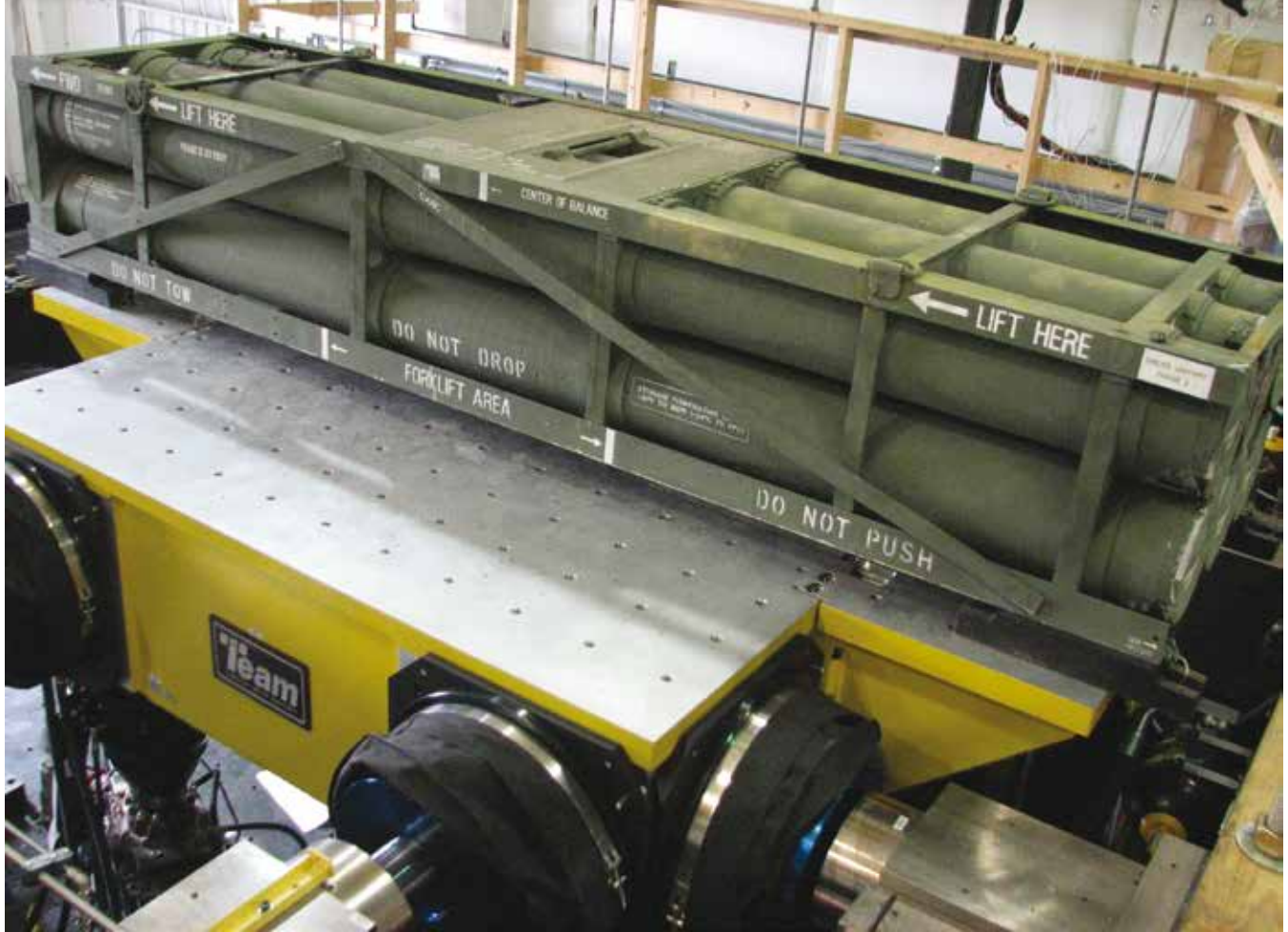
A Multiple Launch Rocket System pod mock-up illustrates a top-table mount with table extensions.