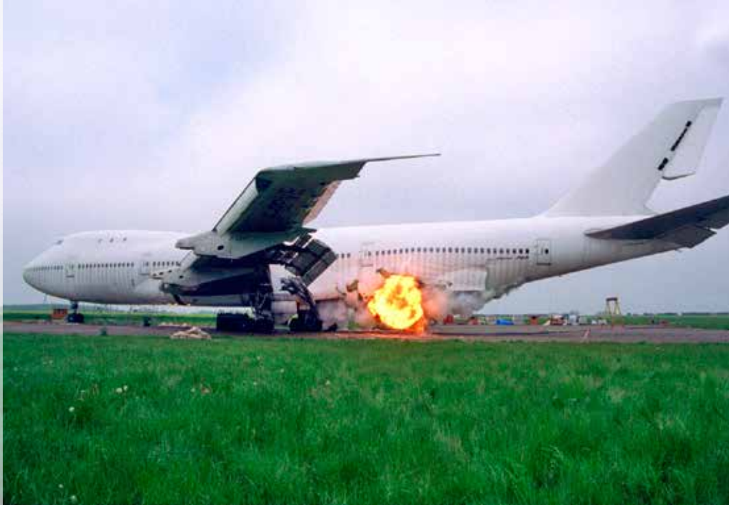
Boeing 747 undergoing cargo hold vulnerability testing at Aberdeen Proving Ground's Philips Army Airfield in Maryland.

Every blast survivability test on a vehicle at ATC is instrumented with ADMAS so data from in theater can be compared to controlled test data.