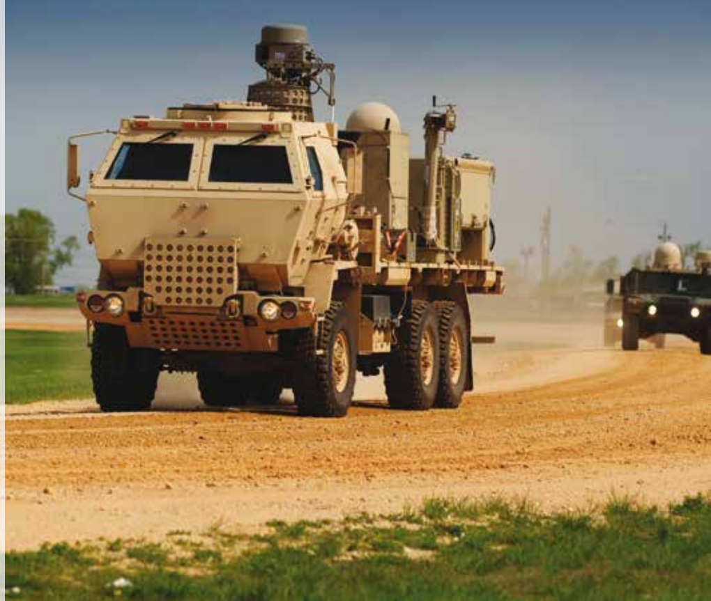
Family of Medium Tactical Vehicles (FMTV) and High Mobility Multipurpose Wheeled Vehicle (HMMWV) on test course at Aberdeen Proving Ground, Maryland.

The key benefit of ADMAS: It is designed to collect data that can provide valuable, additional insight into the performance of a system undergoing test.