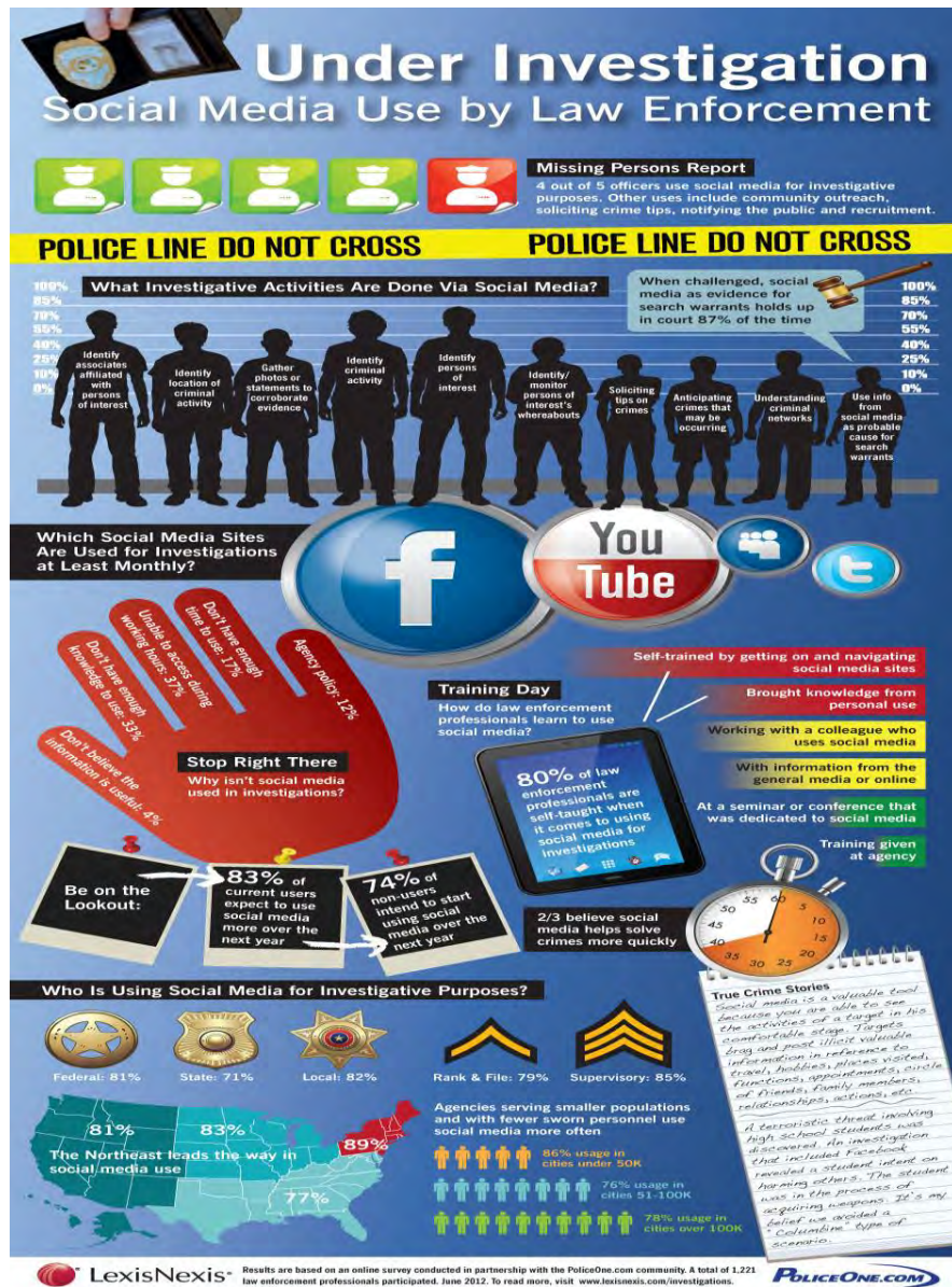
Figure 2. Social Media Use In Law Enforcement Investigations (LexisNexis Risk Solutions 2012)

Local agencies rank the highest amongst use of social media for investigative purposes at 81%. Federal and state agencies followed with 81% and 71% use respectively. The study also revealed that agencies with smaller populations and fewer personnel utilize social media more often. An overview of law enforcement's use of social media is depicted in Figure 2.