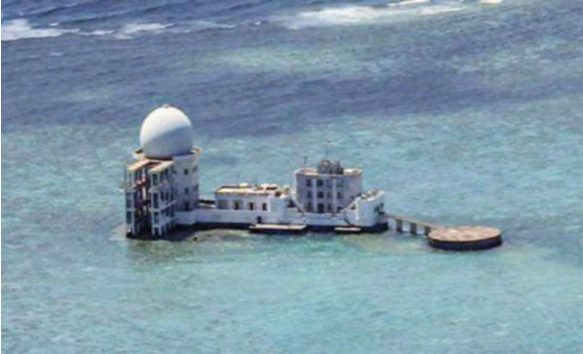
Figure 2. PRC Structures on Subi Reef in the Spratlys 41

The most violent clash between the PRC and the Philippines came in January 1996, when a 90-minute gun battle occurred between three Chinese naval vessels and Philippine naval vessels near Campones Island. 42 Then, in April 1997, eight Chinese vessels were seen operating in the area around Mischief Reef, and along with the vessels, a new structure had been discovered six miles from the Philippine island of Kota. Also in April 1997, the Philippine Navy confronted two Chinese State Oceanic Administration vessels operating near the Scarborough Shoal. In response to the Philippine confrontation, the Chinese vessels, which were carrying amateur radio enthusiasts planning on making a broadcast from the reef, informed the Philippine Navy that the PRC claimed the Scarborough Shoal as its territory. 43