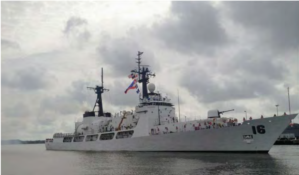
Figure 3. BRP Ramon Alcazar 86

One of the ways in which the Aquino administration has been more aggressive in regards to its relationship with the United States is that senior Philippine officials have begun to publicly emphasize why the Philippines needs the U.S. partnership. One example can be seen from the remarks by Philippine Defense Minister Voltaire Gazmin, who stated, “at this point, we cannot stand alone. We need to form alliances. If we don’t, bigger forces will bully us, and that is happening now.” 85 This mentality can be seen in the other ways that Manila has attempted to grow its relationship with the United States.