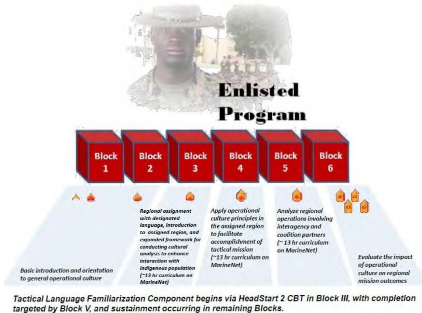
Figure 2. Enlisted Program (from MROC, 2012, p. 37)