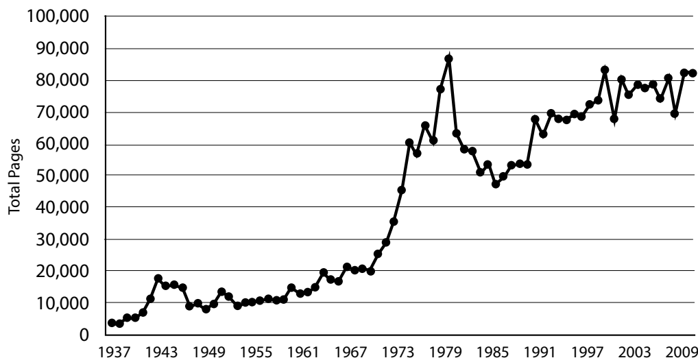
Figure 1. Number of Pages Published Annually in the Federal Register, 1937–2011

Source: Office of the Federal Register, National Archives and Records Administration, and United States Government Printing Office. Data are not yet available (as of April 10, 2013) for 2012. Chart from a May 2013 Congressional Research Service (Library of Congress) report, "Counting Regulations," by analyst Maeve P. Carey.