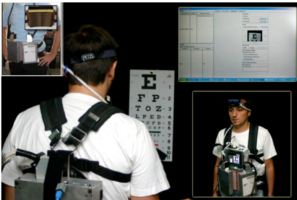
Figure 5: Initial mock up of ACMI-VAS for foveal and paracentral vision substitution. Image (upper right inset) presented on the VideoTact (upper left inset) is zoomed in less than the BrainPort ® image zoom level (center display of lower right inset) to provide a slightly wider field of view. The physical size of the components has been reduced significantly and control of the combined technologies has also been simplified using IHMC's AMI architecture.

These issues warranted the integration of additional displays and sensors to provide paracentral and peripheral visual information and a sense of gaze location within the broader visual context. Following the initial technology demonstrations, IHMC aggregated these prototypes in order to improve a user's tactile visual sensory substitution perception. Using the BP-WAVE-II prototype and the previous generation VideoTact, we determined that tasks that required serial visual scan, such as reading, visual acuity testing, identifying shapes arrange in rows and columns, etc., could be performed more easily when using the two tactile interfaces simultaneously (Figure 5).