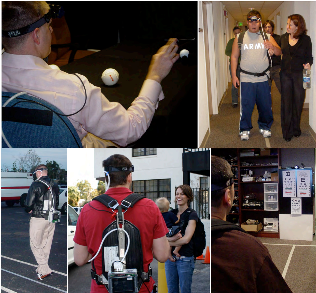
Figure 3: Initial BP-WAVE II activities performed during technology demonstrations with recently blinded servicemembers. left to right, top to bottom , Catching balls, navigating office spaces, locating open parking stalls, noticing infant's hair, and reading eye charts to 20/80 ( images used with permission ).

standard visual acuity tests to 20/40 equivalent using standard eye charts and recognizing family members (Figure 3). Each individual trained to perform these tasks in less than 4-6 hours.