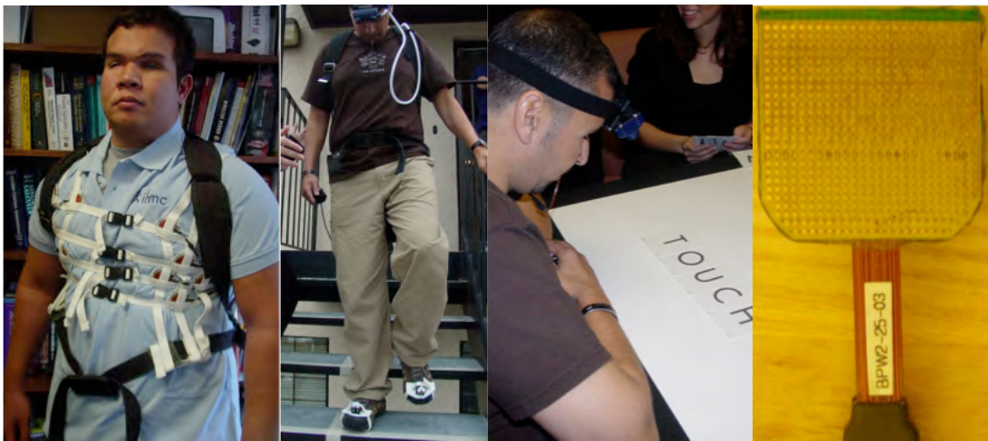
Figure 2: Blind servicemembers using prototype sensory substitution interfaces. ( left ) Using the TTI to receive peripheral attention directing tactile cues. ( center left ) Using the BP-WAVE II to negotiate stairs without assistance and ( center right ) to read text. ( right ) BrainPort ® Intraoral Device (IOD) electrotactile tongue array (~600 active tactile pixels).

With these systems we have demonstrated awareness of nearby objects on the torso and, through the BrainPort ® tongue array, identification of shapes, shape orientations, reading (up to 4-5 word sentences), catching balls rolled across a table, navigating unfamiliar office spaces, negotiating stairs, identifying open parking stalls from ones with vehicles, performing