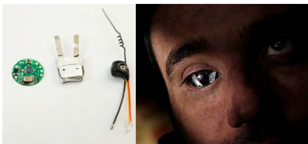
Figure 5: Electronics (left) embedded in the camera-enabled prosthetic eye (right) developed by the Eyeborg Project (Toronto, Canada).

These issues warranted the integration of additional displays and sensors to provide paracentral and peripheral visual information and a sense of gaze location within the broader visual context. Following the initial technology demonstrations, IHMC aggregated these prototypes in order to improve a user's tactile visual sensory substitution perception. Using the BP-WAVE-II prototype and the previous generation VideoTact, we determined that tasks that required serial visual scan, such as reading, visual acuity testing, identifying shapes arrange in rows and columns, etc., could be performed more easily when using the two tactile interfaces simultaneously (Figure 5).