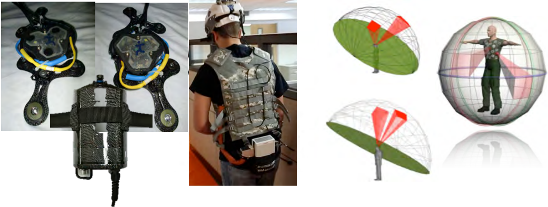
Figure 8: (left) IHMC's distributed microprocessor controlled TTI tactor driver system that reduces overall system weight. (center) Researcher staff member navigating walking course while blindfolded. (right) Schematic of tactile representation of objects detected in the environment.

Lastly, we have developed a reflected infrared sensor range and direction detection system that can detect objects in the environment and represent their locations and motion using the TTI (Figure 8), which can use the much smaller, lighter weight C-3 tactors versus the larger, older C-2 tactors (Engineering Acoustics, Inc., Casselberry, FL).