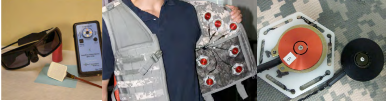
Figure 7: (left) Current BrainPort® V100 system showing sunglasses mounted camera, handheld embedded processor/user input device and 400 tactor IOD. (center) TTI with ACU mounted C-2 tactors and (right) comparison of C-2 (red) and C-3 (black) tactor sizes.

Lastly, we have developed a reflected infrared sensor range and direction detection system that can detect objects in the environment and represent their locations and motion using the TTI (Figure 8), which can use the much smaller, lighter weight C-3 tactors versus the larger, older C-2 tactors (Engineering Acoustics, Inc., Casselberry, FL).