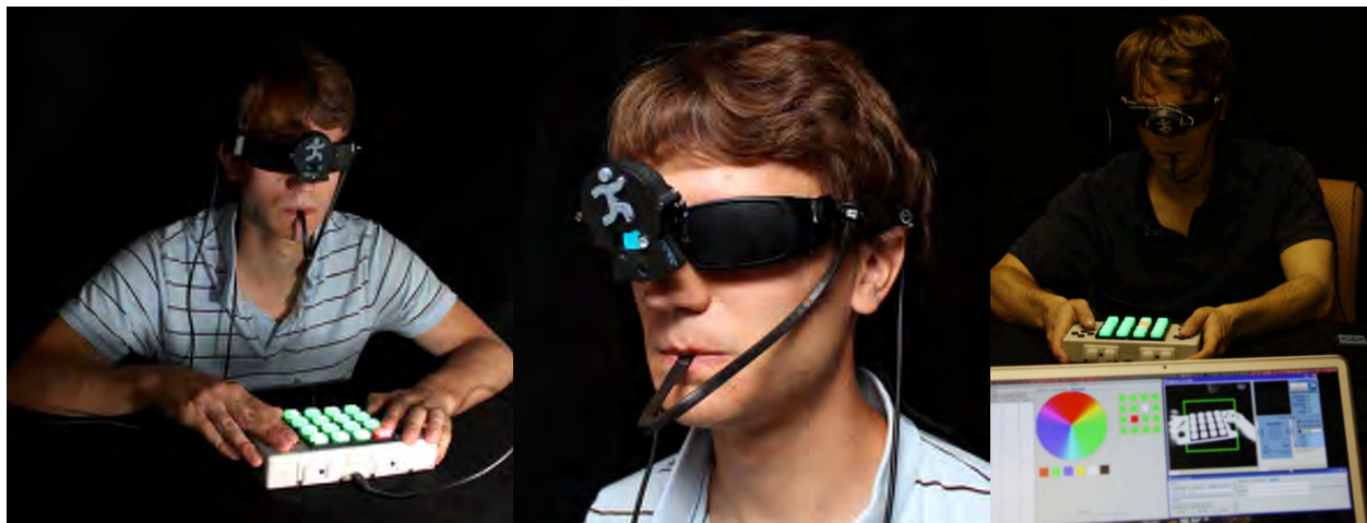
Figure 6: Research staff (using BrainPort®) changing filter (black disk mounted to glasses) with Playstation3 game controller buttons to identify color of illuminated button pad.

Earlier in this project we developed a color filter assembly that mounts to an unmodified BrainPort® V-100 vision device that has a 400 pixel intraoral device (IOD) or to an earlier BrainPort® BP-WAVE-II with a 600 pixel IOD. We integrated a Playstation3 controller into a button pad interface box to reduce the number of items the user will have to manipulate. Three blind individuals evaluated this system and could identify primary, secondary and tertiary colors within 15-20 minutes (Figure 6).