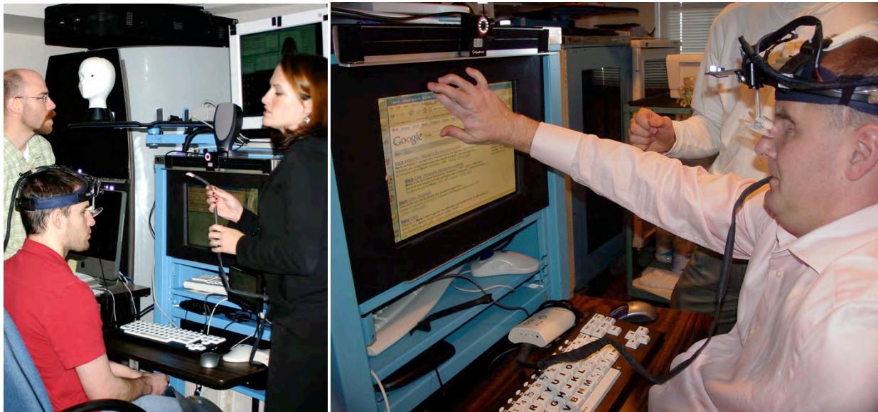
Figure 4: Direct computer tactile (BrainPort ® ) interface demonstrations. left , participant prepares to use eye/head tracking apparatus to determine point of gaze despite the users' prosthetic eyes. The software determines if the participant is looking at the screen and returns a 100-200 pixel sample of the screen image. The user intuitively controls zoom level by leaning either toward or away from the screen. Looking down automatically selects a gaze directed subsample of the video image from the head mounted camera (allowing the user to find keys on the keyboard). right , When the user touches the screen, the subsection of the screen image underneath the fingertip is presented to the tongue instead.

lean toward or away from an object of interest to zoom in or out. In the current implementation, looking away from the computer screen automatically switches to direct camera feed, which allows the user to look down at the keyboard when typing or observe other items in the environment. Alternatively, we have also implemented a touch screen mechanism that allows the user to feel the pixels under his or her fingertip via the tongue while dragging across the screen (Figure 4). Both mechanisms have been mastered by participants in less than 30 minutes, indicating that the method does not significantly task cognitive resources.