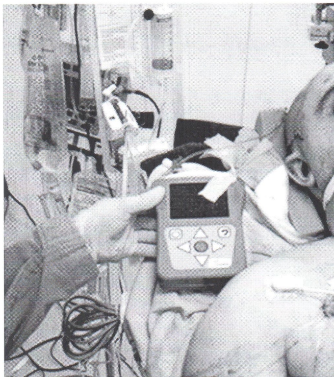
FIGURE 1. Data recorder.

the duration of these events. We evaluated changes in ICP with times for takeoff and landing for the specific aircraft used on that day for transport. The effects of takeoff and landing were distinguished by aligning data from the data logger accelerometer against the simultaneous data streams of ICP, mean arterial pressure, and cerebral perfusion pressure. In addition, the CCATT members were asked to note takeoff time, altitude on reaching cruising altitude, and any significant changes in altitude and time of descent. Individual files were reviewed to verify quality of the data.