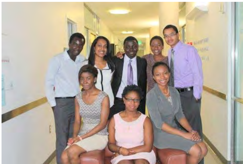
Students in the 2013 Program

A Collaboration Between the University of Iowa and The Lincoln University