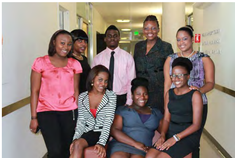
Students in the 2012 Program

A Collaboration Between the University of Iowa and Lincoln University of Pennsylvania