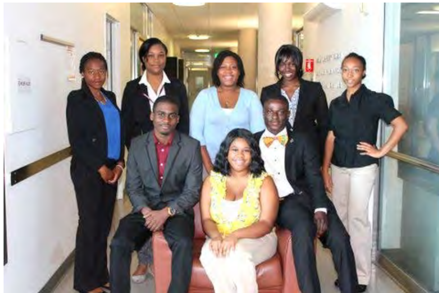
Students in the 2014 Program

A Collaboration Between the University of Iowa and The Lincoln University