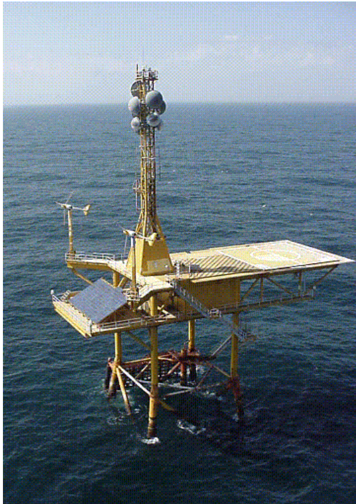
Figure 1. The M2R6 platform. This “master” platform is located in 33 m water depth about 60 km offshore. Power on the master platform is generated on site by photovoltaic panels, wind generators and a diesel backup generator. A high-bandwidth microwave network is used for communications between master platforms and shore. Helicopter transportation of personnel is used for most servicing operations.

emphasize real-time data acquisition, flexibility for future additions or modifications of instrument packages, and, where possible, to make instrument packages serviceable from the platform (minimizing the need for weather-dependent ship and diving operations).