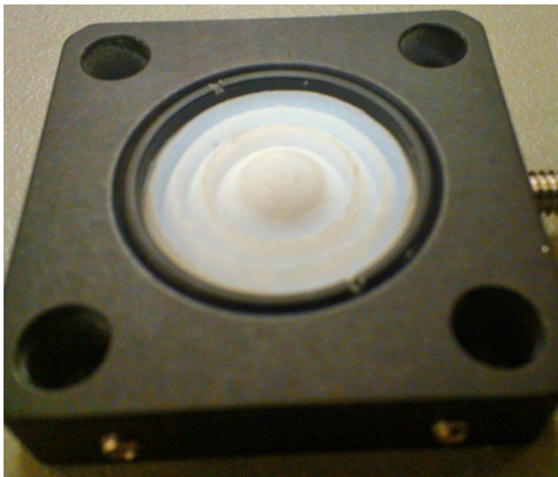
Figure 3. A fabricated MOD THz lens, focusing 200, 400, 600, and 800 GHz.

The lens was fabricated in Teflon with a small CNC lathe and can be seen in Fig. 3. With only 4 zones present the smallest Fresnel feature was approximately 2 mm wide and 3 mm tall. We decided to fabricate the lens in Teflon because it exhibits excellent THz transparency and is readily available. Once the CNC turning was complete, the lens was separated from its substrate with a band-saw and polished.