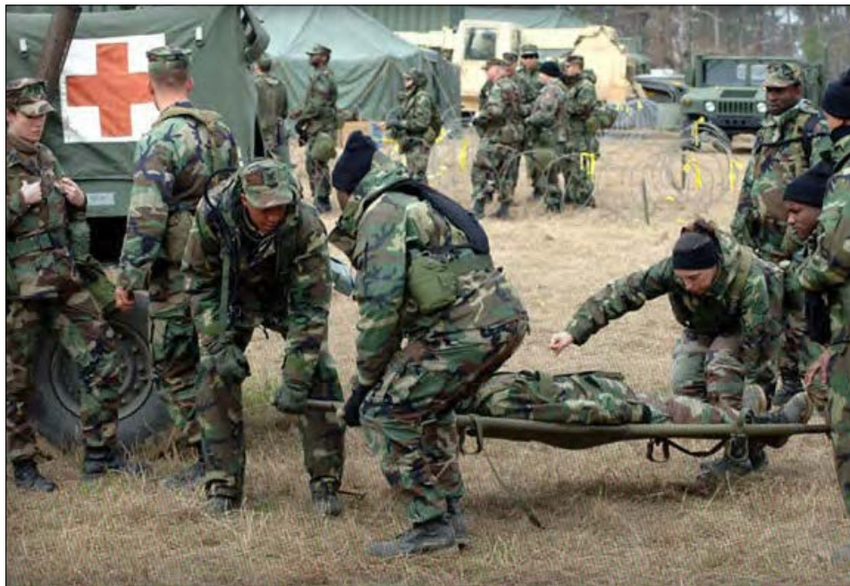
The WWRP will follow participants for 15 years, with surveys administered every six months to track physical and mental health, as well as their quality of life.

By conducting research that specifically targets long-term quality of life issues and outcomes, NHRC is collecting and analyzing information that health care providers can use to assess and develop new treatments. The program