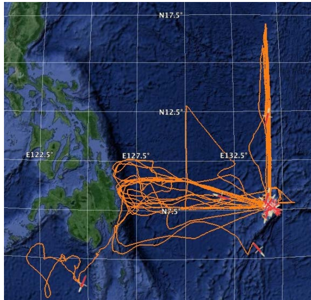
Figure 1. Spray glider trajectories for all missions since June 2009.