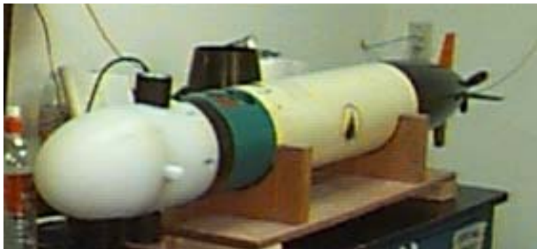
REMUS AUV with Optical Sensor Package

The optical sensor package was designed, fabricated, and integrated into a REMUS vehicle. Software was added to log data from the new sensors and initiate data analysis after completion of each mission.