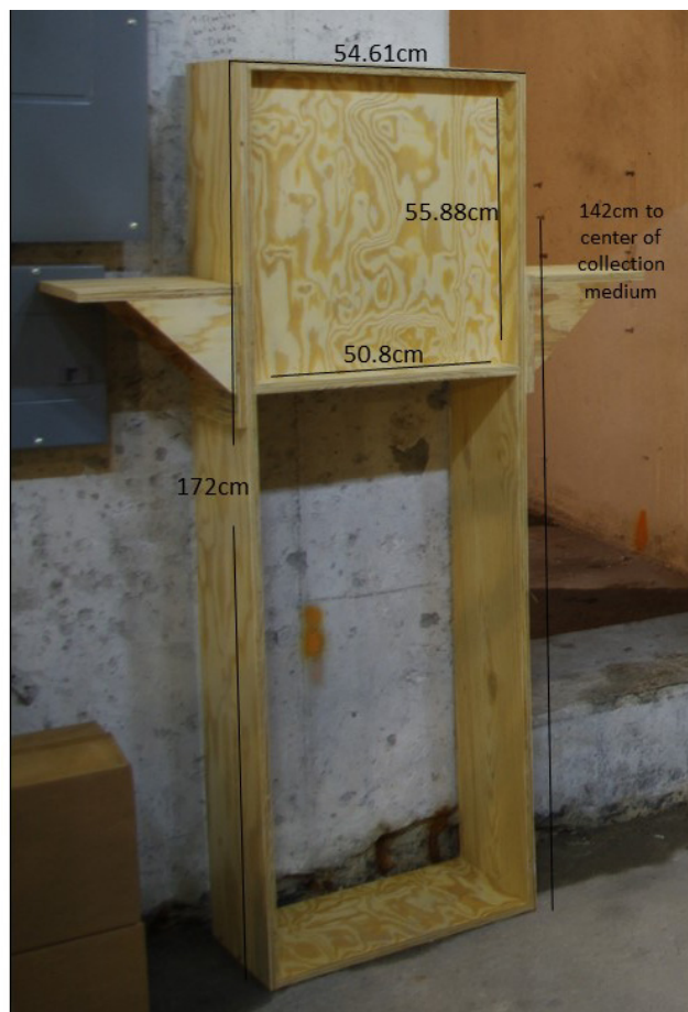
Fig. 2 Collection stand

A wooden collection stand (Fig. 2) was designed to hold each collection medium that the US provided for testing. Each stand was precut out of 1.90-cm-thick plywood and assembled on-site. The overall measurements were 172 cm high \times 54.61 cm wide. The front window frame was 59.69 cm high \times 54.61 cm wide with an opening 50 cm high \times 45 cm wide. The stand was configured to be generally representative of a Warfighter that is 187.96 cm tall (95th percentile Anthropometric Survey [ANSUR] II study) with a presented chest area of 50.8 cm high \times 45.72 cm wide. When placed in the stand, the center of the collection pack was 142 cm high (Fig. 2). The stand was fabricated to contain a collection pack consisting of neoprene foam and plastic (50.8 cm wide \times 55.88 cm high \times 5.75 cm deep). Each collection pack was 5 layers of neoprene foam (11.43 mm) with 0.002 inches (0.05 mm) of plastic interweaved between each layer (Fig. 3). The front of the pack utilized 2 layers of plastic.