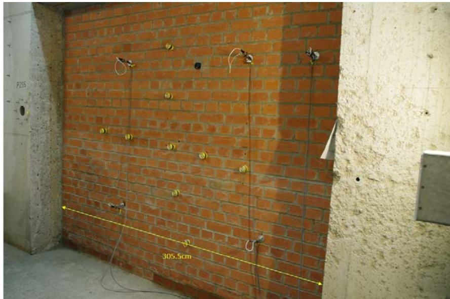
Fig. 7 Double thick brick wall

A double thick brick wall was constructed to separate the blast room from the target room (Fig. 7).