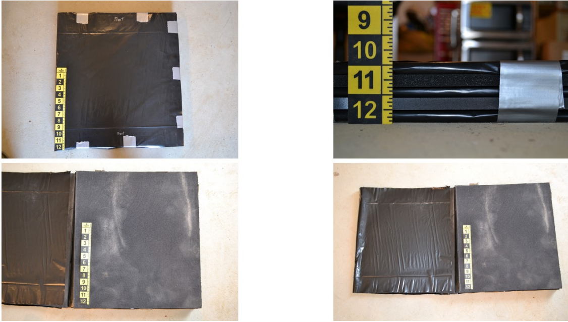
Fig. 3 Foam packs

In addition to the foam collection pack, the wooden stand was designed to hold 2 synthetic gelatin blocks or a combination of gelatin soap and synthetic gelatin for use as the collection medium (Fig. 4). Shelves were constructed to support the synthetic gelatin and gelatin soap with dimensions of 25.4 cm wide \times 25.4 cm deep. Each shelf was attached to the side of the stand so that the distance from the ground to the center of the collection medium was 142 cm. The synthetic gelatin is designed to have the penetration resistance of 20% that of ballistic gelatin. The benefit of using the synthetic gelatin is that it is not temperature sensitive in contrast to the 20% ballistic gel. Due to its temperature insensitivity and results of comparative studies, the synthetic gelatin was chosen for shipment from the United States to GEU. The presented area of the gelatin blocks was 20.32 \times 20.32 cm. The gelatin soap blocks were provided by the German participants in the experiments and a representative sample is shown in Fig. 5.