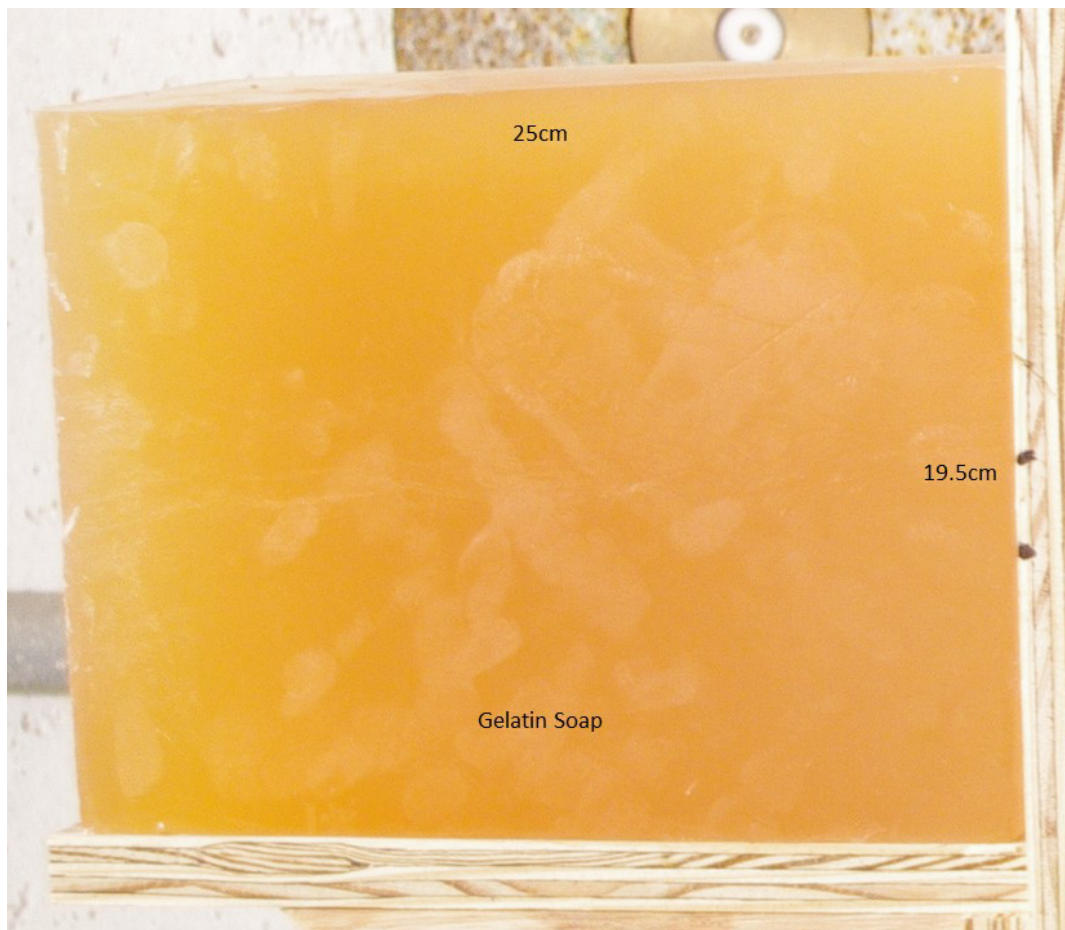
Fig. 5 Gelatin soap