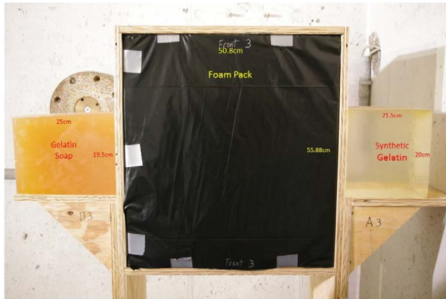
Fig. 4 Collection pack with gelatin soap and synthetic gelatin