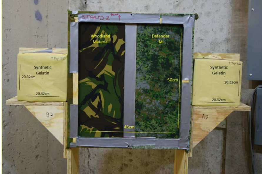
Fig. 6 Collection medium

Each foam pack was covered with different types of clothing material provided by the participating countries (Fig. 6). Figure 6 shows 2 types of NLD fabric covering the foam pack. The synthetic gelatin was covered with 2 types of US Kevlar weave cloth.