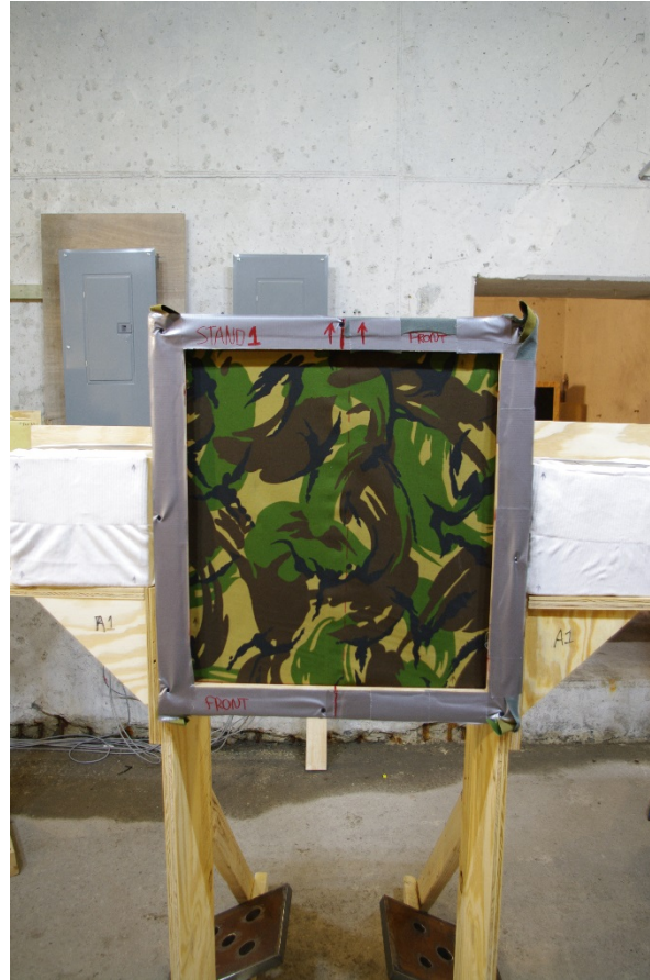
Fig. 9 Collection stand

The first stand was located 175 cm from the brick wall in room 2. The foam pack was covered with an NLD fabric. Half of the pack was also covered with NLD undergarment material under the first layer of fabric (Fig. 9). The soap block and gelatin block of the first stand were covered with a DEU pug material.