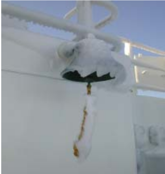
Figure 1. Ice buildup on the Revelle ship's bell after the January 24–26, 2000 cold-air outbreak.

across the sea is large, from 0°C next to the Russian coast to 12°C at the Japanese coast. Air parcels taking one-half day to cross the sea during a cold-air outbreak warm at a rate that matches that at which it is advected over the SST gradient. Thus, the air–sea temperature difference experienced by an air parcel traversing the sea is uniform, which is an important condition for the cloud sheet formation.