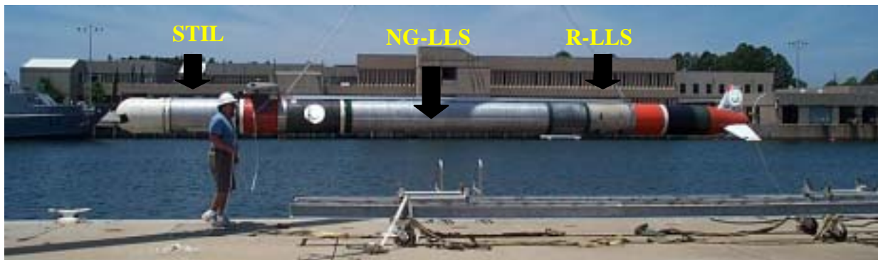
Figure 1 Towed Body at the Dock

To collect the data required for this program, an existing towed body was modified to house the three laser identification systems in one unit to allow simultaneous operations under identical environmental conditions. The three laser identification systems included the Areté Associates Streak Tube Imaging LIDAR (STIL) system, the Northrop Grumman Laser Line Scan (NG-LLS) system, and the Raytheon LLS (R-LLS) system as shown in Figure 1.