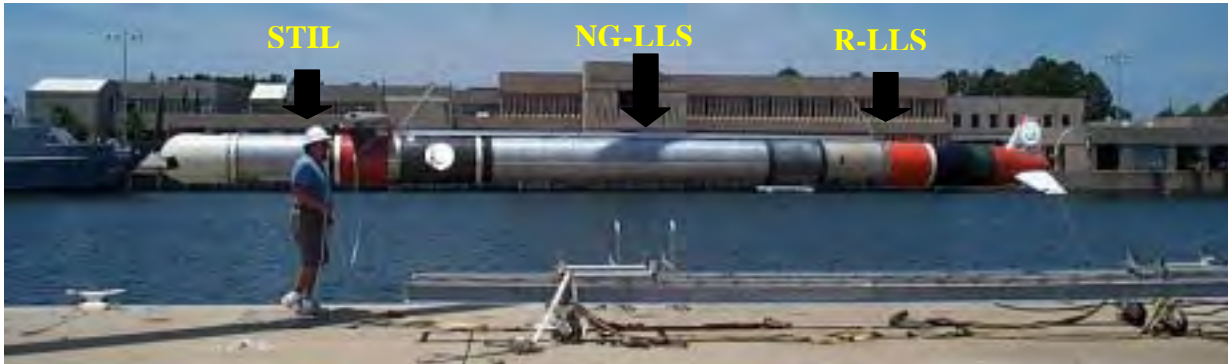
Figure 1 Towed Body at the Dock

To collect the data required for this program, an existing towed body was modified to house the three laser identification systems in one unit to allow simultaneous operations under identical environmental conditions. The three laser identification systems included the Areté Associates Streak Tube Imaging LIDAR (STIL) system, the Northrop Grumman Laser Line Scan (NG-LLS) system, and the Raytheon LLS (R-LLS) system as shown in Figure 1.