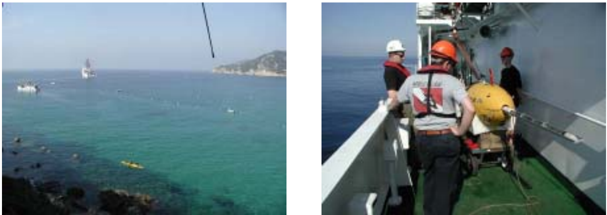
Fig. 1. (a)GOATS'2000 range in Biodola Bay, Elba, with TOPAS parametric projector and bottom mounted targets and natural seabed ripple fields. (b) Deployment of Oddyse bistatic receiver AUV from RV Alliance, Sep. 25, 2000.

The most significant component of the FY01 has been associated with the execution of the GOATS'2000 experiment in Golfo di Procchio, Elba Island, carried out as a Joint Research Project (JRP) with SACLANT Undersea Research Centre in the period Sep. 18 – Oc. 14, 2000. The experiment collected a variety of oceanographic and navy resources for performing rapid environmental assessment (REA) and mine countermeasures (MCM) in shallow (SW) and very shallow water (VSW). A fleet of 4 AUV's were operated from R/V Alliance. One MIT Odyssey II was equipped with an 8-element acoustic array in a 'swordfish' configuration serving as bistatic receiver for measuring the 3-D scattering from natural ripple fields and aspect dependent targets deployed on and within the seabed. The seabed was insonified by a TOPAS parametric source on a stationary tower. In addition, a second Odyssey II AUV was equipped with an Edgetech subbottom profiler which to be used as a moving bistatic source and for REA missions. This AUV was successfully configured and prepared for these missions, but the dual vehicle missions were not successfully completed due to mechanical and electrical failures in this vehicle.