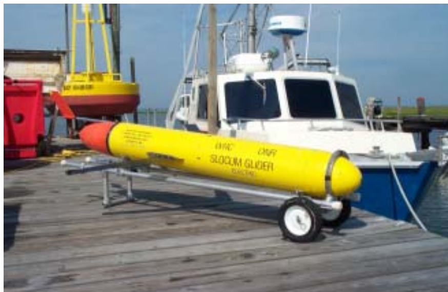
Fig. 1. SLOCUM Electric AUVG Post-deployment, LEO-15, NJ

Webb Research Corporation (WRC) and Rutgers University (RU) plan to provide an important advance in regional-scale coastal ocean observation programs by operating a coordinated fleet of glider AUVs in an intelligent adaptive network. Slocum autonomous underwater vehicle Gliders (AUVGs) are uniquely mobile network components capable of moving to specific locations and depths, occupying controlled spatial and temporal grids, and will conduct their third annual test this July during the final ONR-sponsored Coastal Predictive Skill Experiment (CPSE) at Rutgers' local-scale (30 km x 30 km) Long-term Ecosystem Observatory (LEO). Over the following year, a fleet of second-generation Slocum Gliders will be constructed by WRC and utilized at RU for operation within the developing regional-scale (300 km x 300 km) New Jersey Shelf Observing System (NJSOS). The challenge ahead is to determine how best to operate a coordinated fleet of Gliders beneath the spatially-extensive regional remote sensing systems given cues from multiple real-time datasets and model forecasts. This requires the development and testing of (a) new compact and low-power physical, chemical, and bio-optical sensors for the Gliders, (b) ocean feature detection software to provide the cues and response on an individual and fleet scale, (c) new bi-directional robust communications systems, and (d) a networked autonomous Glider command/control center.