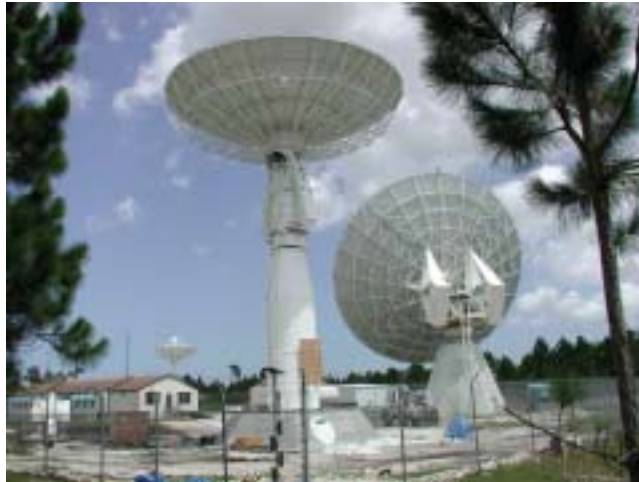
Figure 1: The CSTARS facility in Richmond Heights, Florida with the new two 11.28m X-band antennas (foreground and background).

The CSTARS facility consisting of the following components: two VIASAT 11.28m antennas, Ingest Archive System (IAS), Product Generation System (PGS), and Data Exploitation System (DES) that have been installed and tested. Figure 1 shows the CSTARS location with the two new antennas and the existing 20-m antenna and Figure 2 shows the hardware for the antenna controllers and data capturing and processing system.