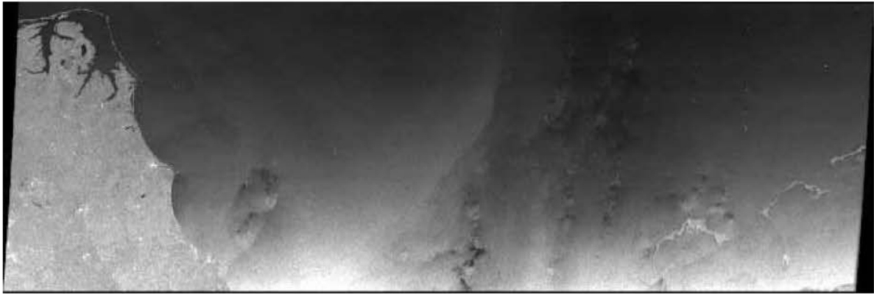
Figure 3: The first SAR image received at the CSTARS facility on September 18, 2002. The upper left hand corner shows Cape Hatteras and the lower right hand corner shows the Bahamas.

Figure 4 shows a graph of the bit error versus elevation angle. The data show that CSTARS could operate at an elevation angle as low as 2 degrees off the horizon before noise would significantly contaminate the radar signal. This remarkable performance is due to the high G/T characteristics of the antennas.