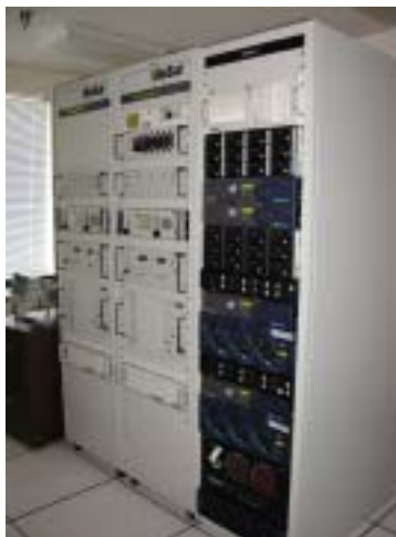
Figure 2: The computer hardware for the antenna controllers, data reception and processing system.

We have collected our first RADARSAT ScanSAR pass on September 18, 2002 (Figure 3). Currently the station is being certified by RadarSat International as a groundstation. Negotiations for a license agreement are also ongoing.