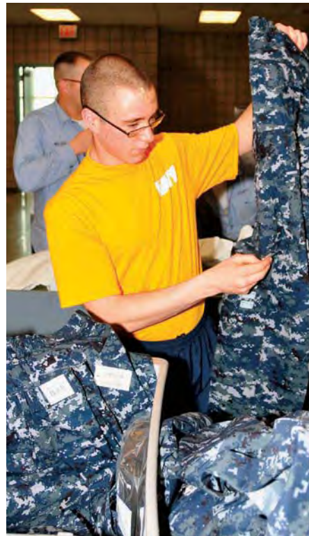
A recruit examines his newly issued Navy working uniform at Recruit Training Command. The uniform will replace the current working uniform. The Defense Logistics Agency is working with the Navy to provide these new uniforms to Sailors worldwide.

"The program will ensure that contracting officers are implementing negotiation policy and regulation consistently, improve the quality and effectiveness of the contract process, and facilitate sharing of lessons learned," he said.