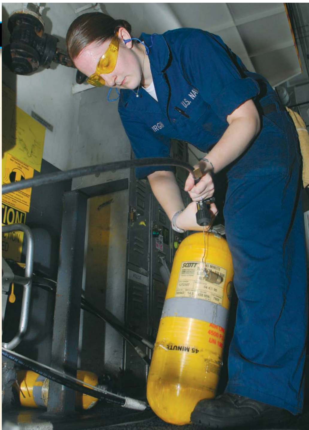
A Sailor recharges oxygen bottles for a self-contained firefighting breathing apparatus aboard the aircraft carrier USS John C. Stennis. Under the 2005 Base Realignment and Closure legislation, the Defense Logistics Agency has privatized management of several major commodity lines, including gases and cylinders.

She explained that creating the privatization contracts for tires was simpler than for the other commodities because procurement of any gases must include their containers or cylinders, and packaged petroleum, oils and lubricants included other chemicals, as well.