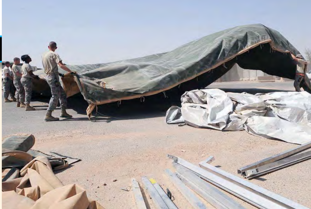
Air Force members of 407th Expeditionary Civil Engineer Squadron take down a tent structure. The squadron has been downsizing, which calls for consolidating material and equipment to send to U.S. warfighters in Afghanistan. A big piece of the Defense Logistics Agency’s mission involves the drawdown in Iraq and the reset of forces and supplies in Afghanistan.

be shipped from Iraq to DDKS, while some of it will come back to DLA’s depots near military units’ home stations.