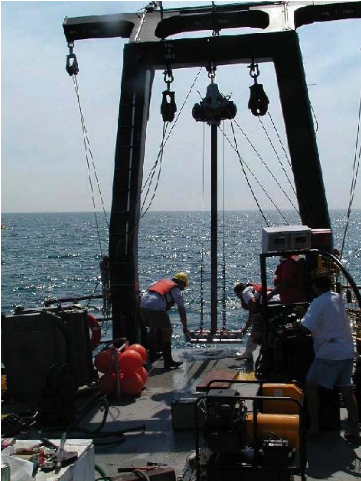
Figure 1. Vibracoring operations off Martha's Vineyard. Photograph illustrates a vibracoring system being deployed off the stern of R/V CAPE HENLOPEN.