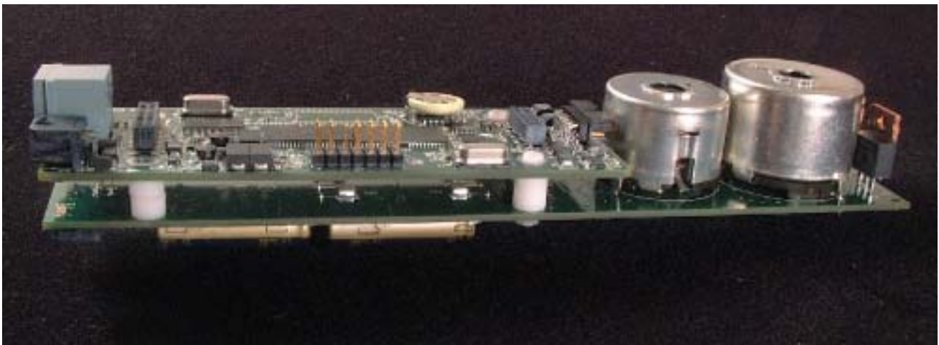
Figure 1. Micro-Modem board set.

The Micro-Modem electronics consists of two boards. The main board includes digital signal processor, serial ports, analog conversion and signal conditioning. The second board contains the power amplifier, T/R network and pre-amplifier. The two boards are connected via headers on each board. The board set is designed to fit into a two inch diameter pressure case. The board set is shown in Figure 1.