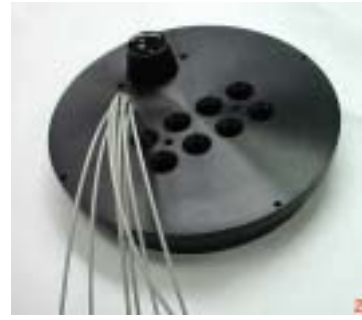
Figure 9: End cap

Fiber optics: All fiber optic cable ends have been terminated and are ready for connection from the PMT pressure housing to the detection chamber.