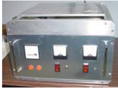
Figure 2: Power Console

Software: The HIDEX II topside software package has been written in LabVIEW, and is bundled into a stand-alone executable with a self-extracting installer. This installer and user manual will be provided on a CD-ROM as well as the topside computer. The end-user does not need a copy of LabVIEW to use HIDEX II, and it may be installed onto other computers with permission from HBOI.