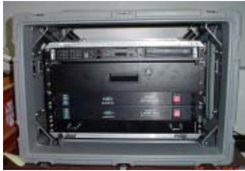
Figure 1: Computer Console