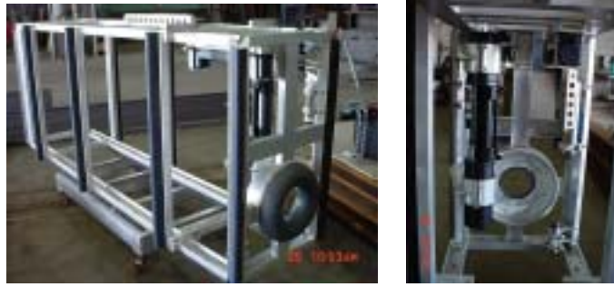
Figure 5 Two views of aluminum frame designed to support HIDEX-BP detection chamber.

All sensors have been mounted on the frame. The pressure housing brackets have been made. Only the detection chamber and pressure housings remain to be mounted to the frame.