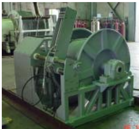
Figure 4: HIDEX-BP winch

Winch: The topside winch is 99% complete. The main umbilical has been spooled onto the drum and terminated. Load tests have been performed at our facility. The winch user controls have been fitted with a protective bolt on shipping cover. The last step is to wire the slip ring, which will be done at the same time the topside racks are wired. This should take no more than a week. The Sheave is on order and is due to be delivered in 3 weeks.