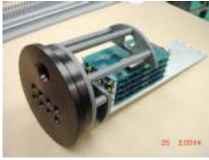
Figure 8: Circuit boards and end cap