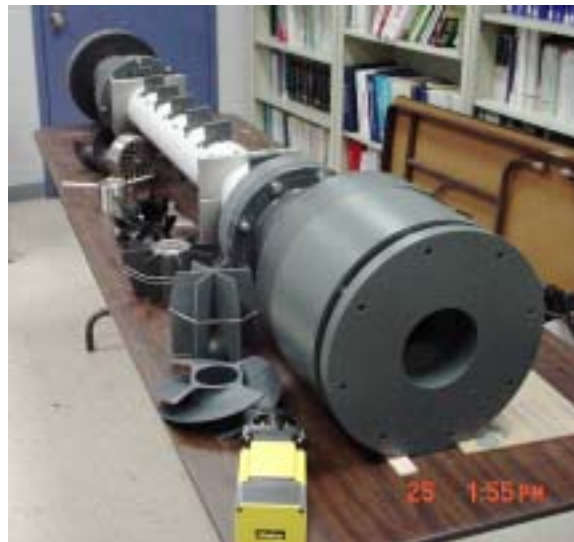
Figure 6: HIDEX-BP flow tube detection chamber [with additional components including excitation grid and light baffle, pump rotor and flow meter].

The flow tube detection chamber is nearly complete with only the motor housing left to be fabricated. All other components have been fabricated including the stainless excitation screen, light baffle, flow meter, pump rotor and all light gathering wedges. The motor housing is currently in production and will be complete in one week. Final assembly of the chamber should take less than 3 days, where it will then be mounted in the frame.