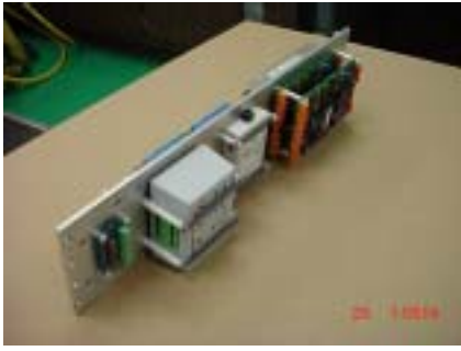
Figure 7: Power board