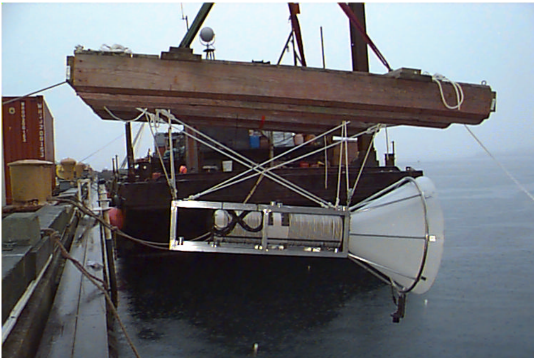
Figure 1: Launch of the docking system for testing

To develop and demonstrate a reliable and economically practical means of autonomously docking an AUV to an underwater platform in littoral waters for the purpose of data up/download, mission planning, battery recharging, and network status reporting.