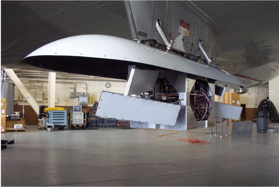
Figure 1: DBI instrument frame and pod top mounted on the NOAA WP-3D wing (pod shell not shown).