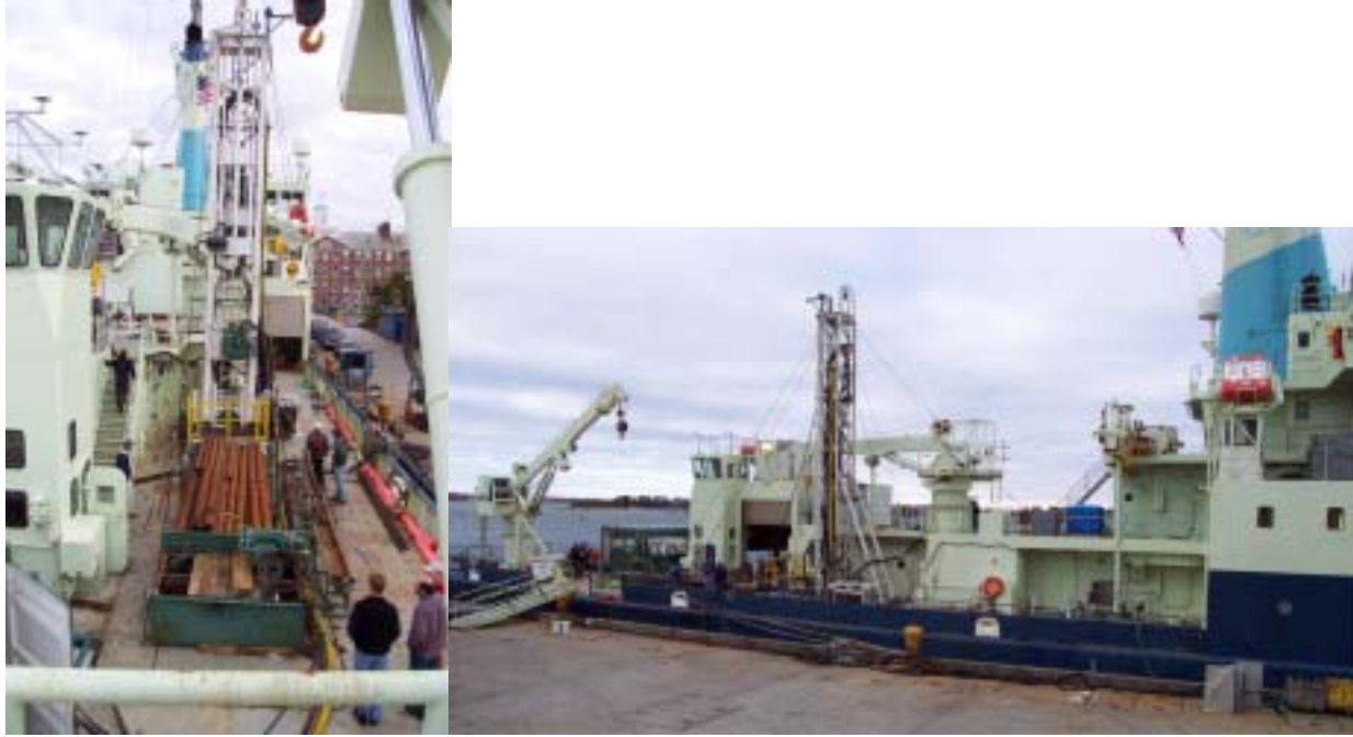
Figure 1. The AHC800 derrick positioned over the moonpool of the Knorr and the rod rack in position for the drilling operation.

Sea trials were conducted from November 5-9, 2001 aboard the R/V Knorr.