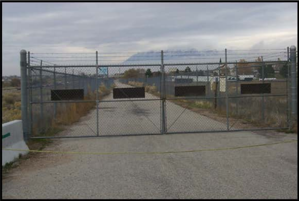
Photograph 3 showing Magazine Road and the current Incoming Munitions Inspection Station.