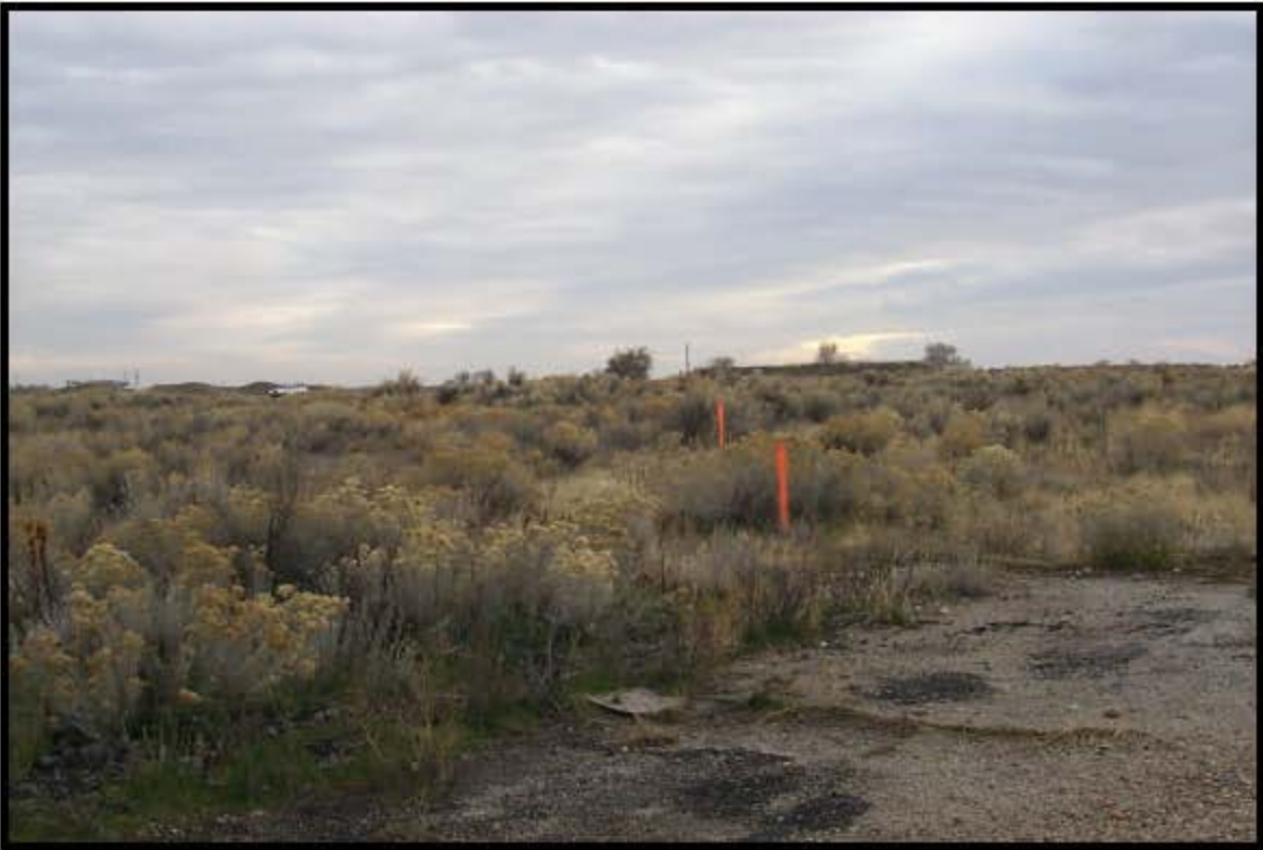
Photograph 2 showing undeveloped land of the southern portion of the Proposed Action. The tall orange stakes indicate the centerline of the proposed roadway.