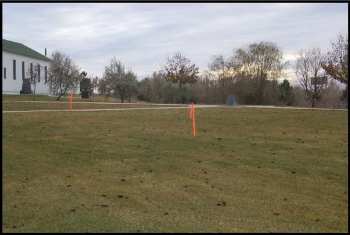
Photograph 1 showing mowed/developed land of the northern portion of the Proposed Action. The tall orange stakes indicate the centerline of the proposed roadway.