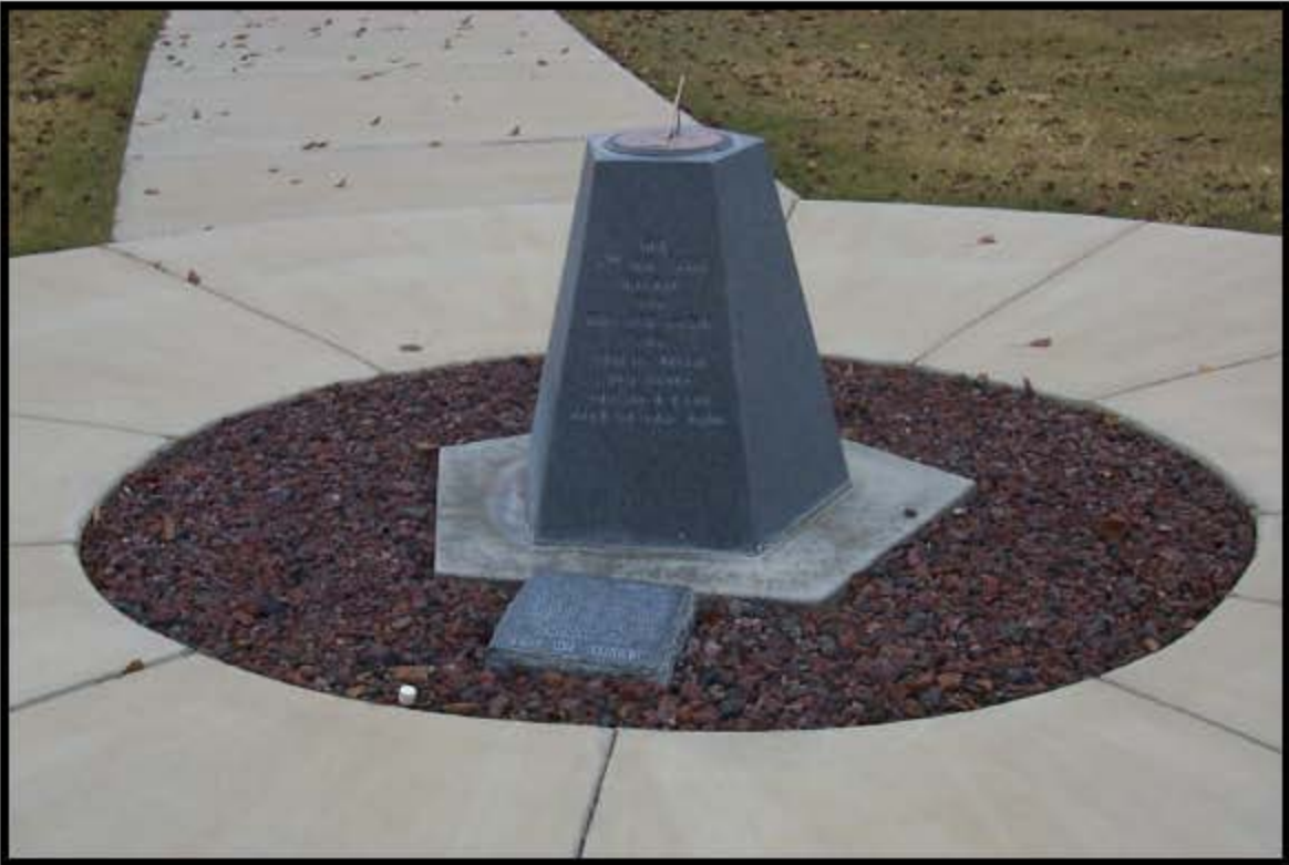
Photograph 4 showing the monument that will have to be relocated in order to accommodate the proposed roadway.