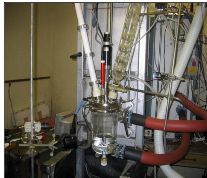
Mettler RC1 reactor used for bench-scale evaluations