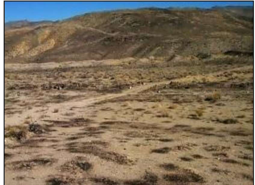
Open Burning/Open Detonation Site at Hawthorne Army Depot

( http://ndep.nv.gov/hwad/hwadg01c.htm )