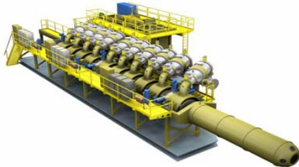
Figure 1. Proposed AWE Hydrus IVA machine

approximately 30 years at AWE on the Mevex and Mini-B drivers. Initial work in the program was based around demonstrating the diode operation at higher voltages. This began on the Single Pulse Forming Line (SPFL) machine Mogul D at AWE [2]. The envisaged pulsed power driver for use in the Hydrus facility is an Inductive Voltage Adder (IVA) (Figure 1).