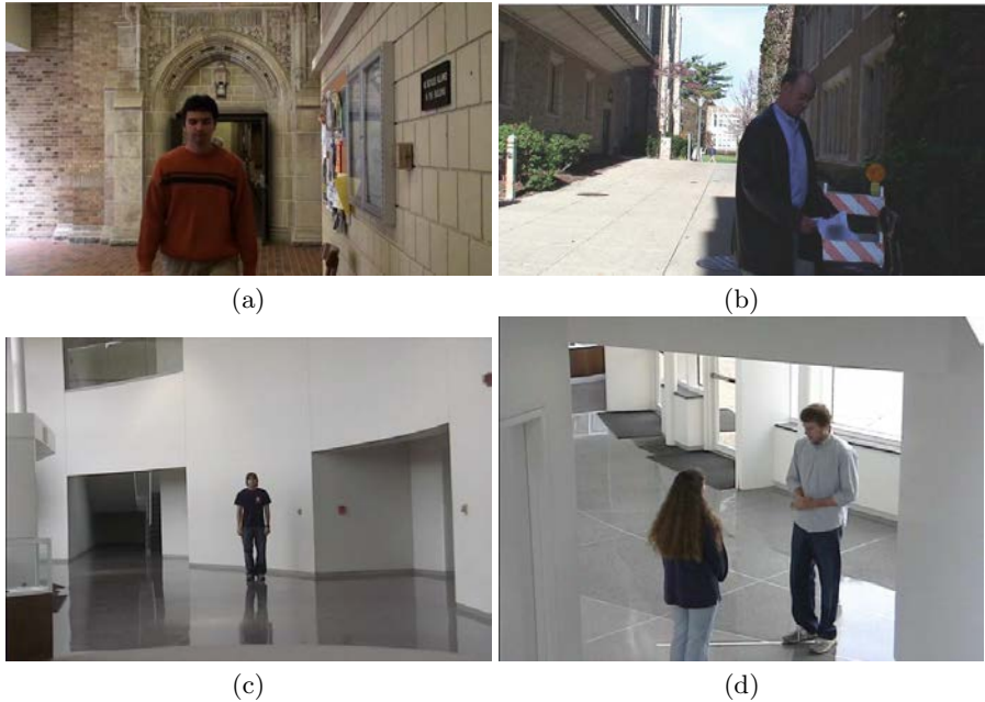
Fig. 2. Example frames from video sequences in the Video Challenge Problem. The images in (a) and (b) are from the U. of Notre Dame collection. The image in (a) is from a video sequence of a subject walking towards the cameras in an atrium and (b) is a subject performing a non-frontal activity outdoors. The images in (c) and (d) are from the U. of Texas at Dallas collection. The image in (c) is from a video sequence of a subject walking towards the cameras in an atrium. The image in (d) is acquired from a video camera looking down on a conversation. In (d), the subject whose face can be seen is the subject to be recognized.

first is an HD video sequences, and the second is a NIR video sequence. This experiment tests recognition from face and iris imagery.