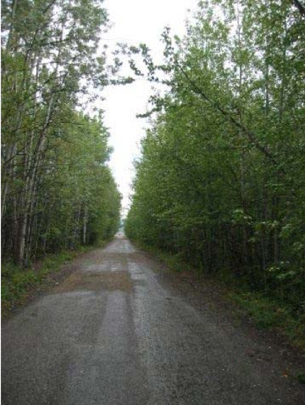
Figure 4. Photo showing decreased access and line of site as well as the connecting canopy on Lake Road.