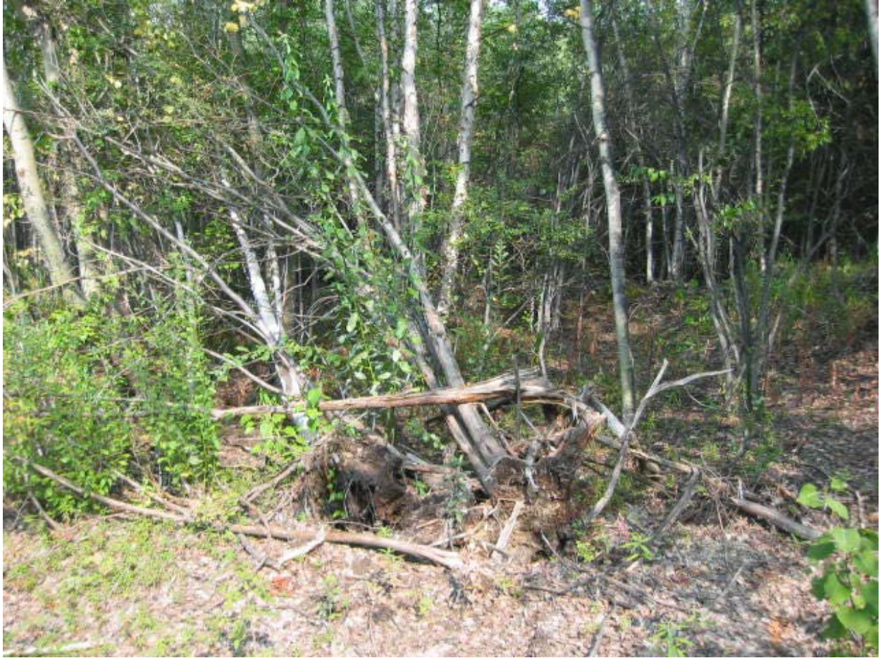
Figure 2. Photo showing uprooted trees, an example of damage caused from snow removal operations.