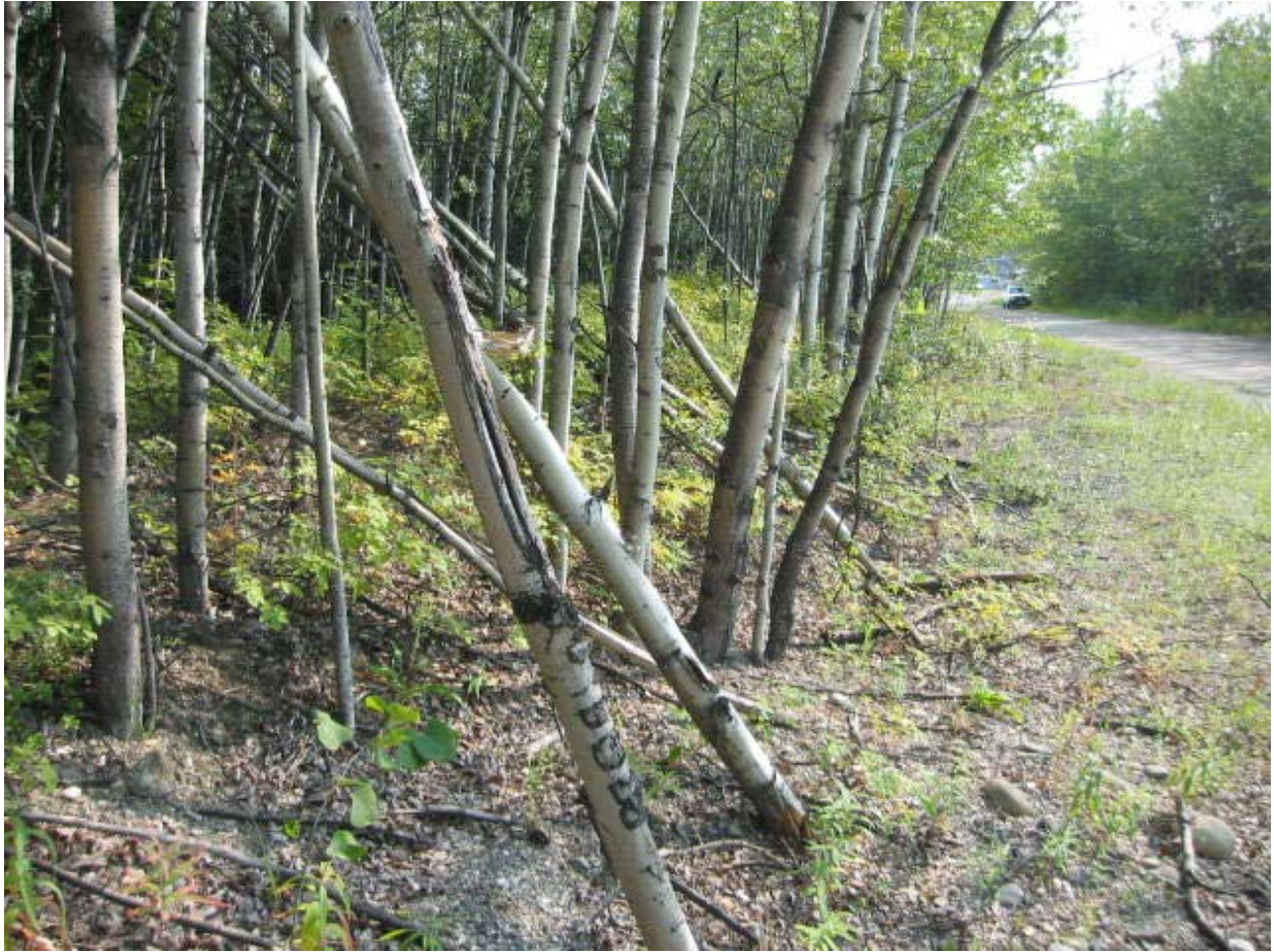
Figure 3. Photo showing trees that have been pushed by equipment during snow removal operations. With the stems severed at the base, the tree dies.