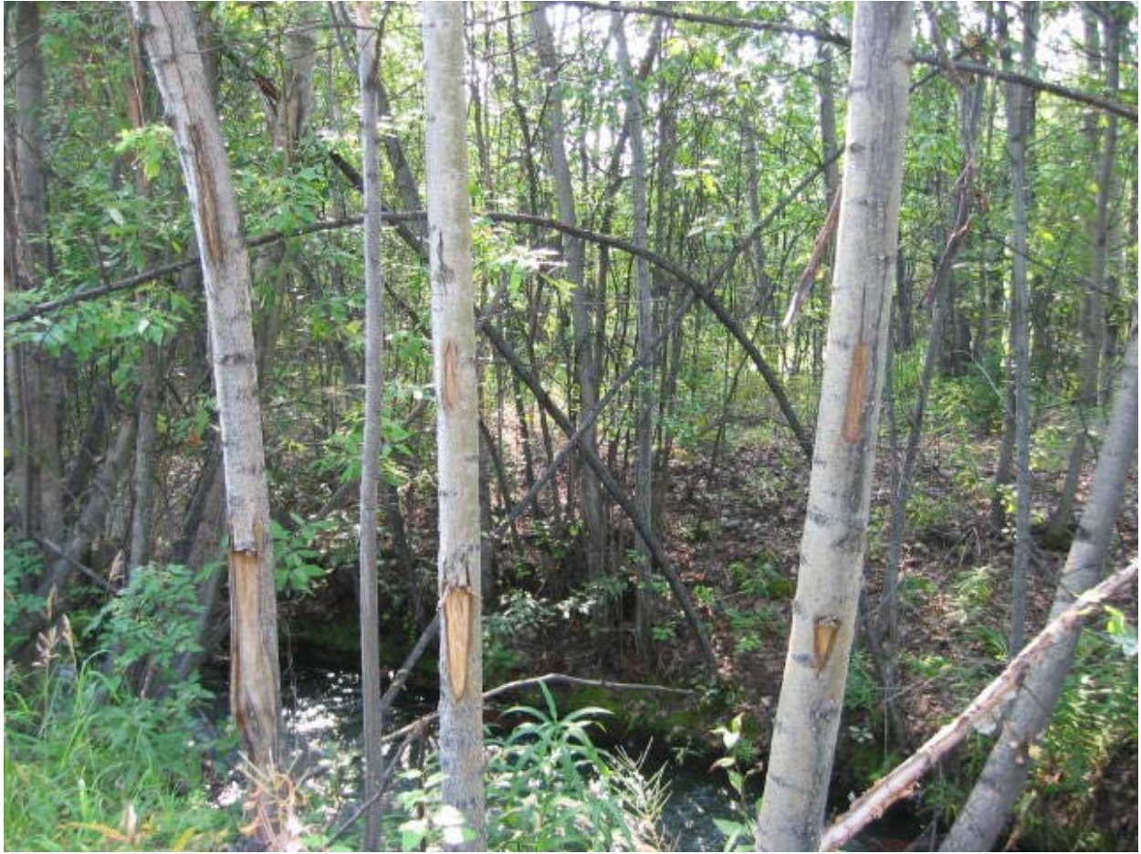
Figure 1. Photo showing a row of scarred trees, damaged during snow removal operations.