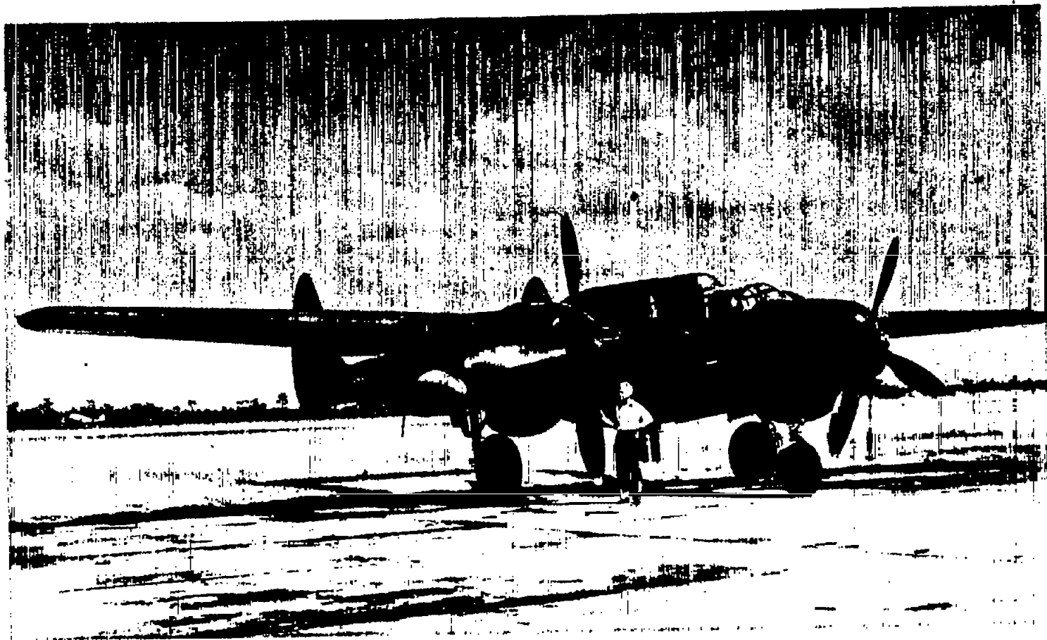
Figure 1.- Airplane used in thunderstorm project.

NATIONAL ADVISORY COMMITTEE FOR AERONAUTICS LANGLEY MEMORIAL AERONAUTICAL LABORATORY - LANGLEY FIELD, VA.