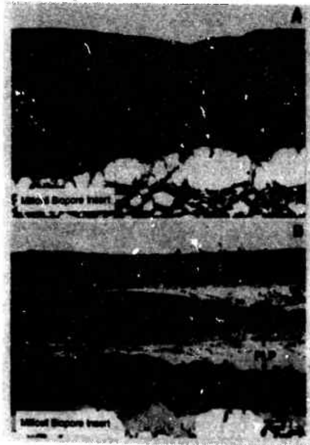
Fig. 2 Ultrastructure of control (A) and phosgene exposed (B) PAECs. The plasmalemma of control cells were held together by a thin scaffolding of compressed basal lamina (BL). BL were typically 0.1 to 0.35 \mu\text{m} wide along their entire length and were filled with a ground substance of extracellular matrix materials. When exposed to phosgene (137 ppm x 20 min), the basal lamina were rended apart and paracellular leakage paths (PLP) developed between the apposing faces of plasma membranes and cells that overlapped. Membranes joined by tight junctions (M) were not disrupted by phosgene.

Ultrastructural details show the major difference between sham-treated controls and phosgene-exposed populations was in tissue continuity. Untreated controls (Fig. 2A) had no obvious gaps between plasma membranes or apposing faces of adjacent cells. These populations were closely knit and cells that overlapped were held together by a thin scaffolding of compressed basal lamina. The basal lamina were uniform in dimension and defined an intercellular space of 0.1 to 0.35 \mu\text{m} along their entire length. That space was filled with a ground substance of extracellular