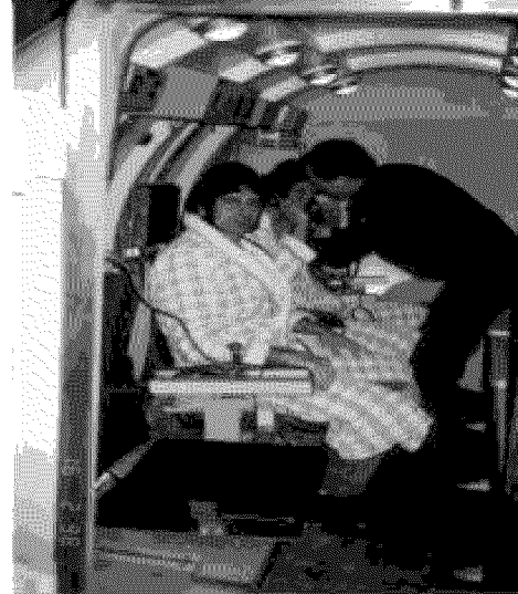
Fig. 3 Hypobaric chamber exposure